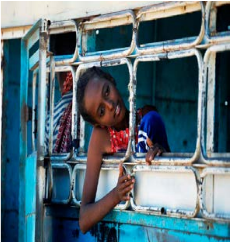
An Ethiopian refugee looks out of a bus window which transports her from the Hamdeyat refugee transit camp, which houses refugees fleeing the fighting in the Tigray region to the Um Rakuba refugees camp, in Sudan.