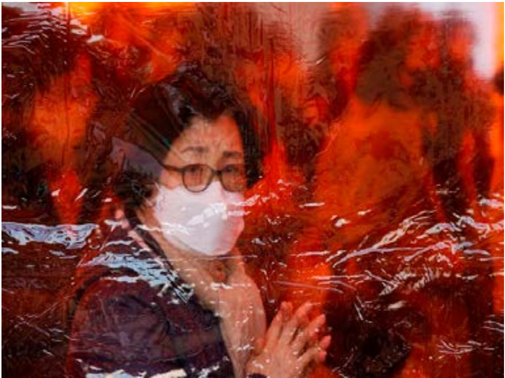
A mother prays for children's success in the college entrance examinations at a Buddhist temple in Seoul, South Korea.