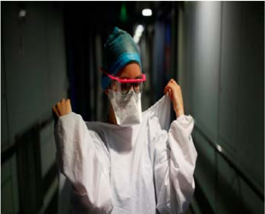
A doctor at Strasbourg's university hospital is seen putting protective clothes on while attending training for new staff to reinforce ICU regular crews who face a second wave of patients suffering from the coronavirus in Strasbourg, France,