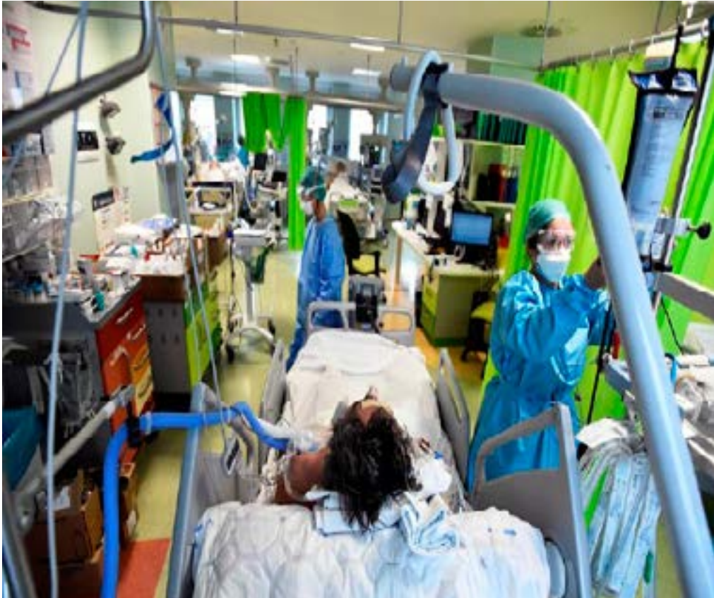
A patient suffering from the coronavirus is treated in the intensive care unit of the Maggiore di Lodi hospital, in Lodi, Italy, 2020.