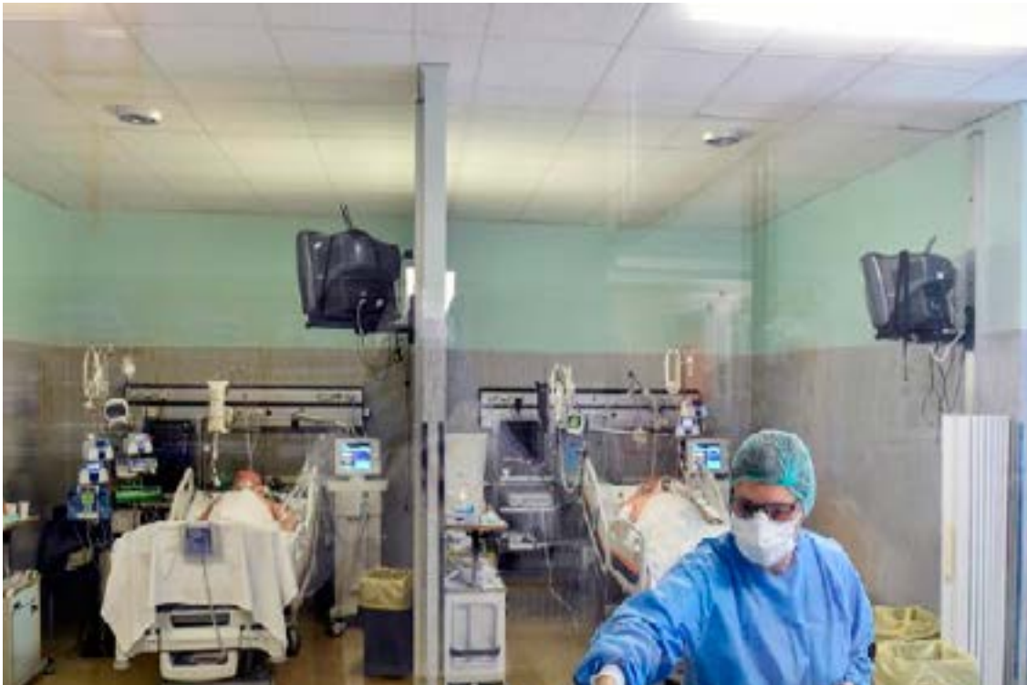
Medical personnel prepare in the emergency room of the Maggiore di Lodi hospital as a second wave of the coronavirus hits the country, in Lodi, Italy, 2020.