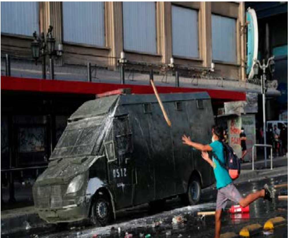
A demonstrator throws a wood stick toward a riot police vehicle during a protest against Chile's President Sebastian Pinera and his government, during Pinera's birthday, in Santiago, Chile.