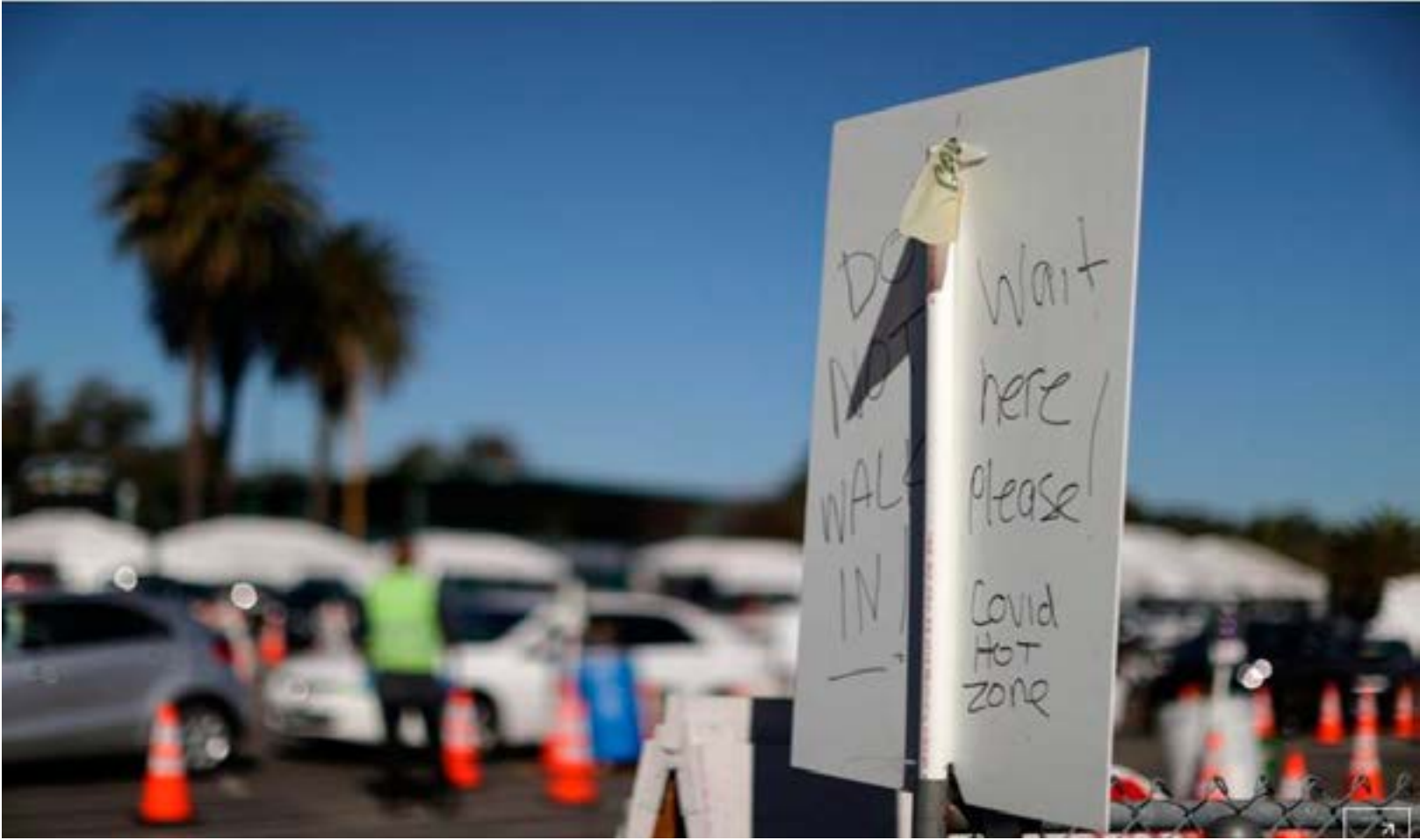
FILE PHOTO: People line up for novel coronavirus tests in Los Angeles, California, U.S., December 1, 2020. REUTERS/Lucy Nicholson

NEW YORK (Reuters) - U.S. health experts on Wednesday welcomed British emergency approval of Pfizer Inc’s COVID-19 vaccine, a sign that U.S. regulators may soon follow suit in a bid to bring the surging pandemic under control. As U.S. coronavirus hospitalizations jumped to their highest since the onset of the global pandemic, Britain gave emergency use approval to the vaccine developed by Pfizer and German partner BioNTech SE, the first country to do so.