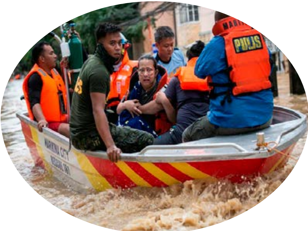
Woman receiving supplemental oxygen reacts as rescuers evacuate her from a submerged village, as her supply was running low, following Typhoon Vamco, in Marikina, Metro Manila, Philippines.