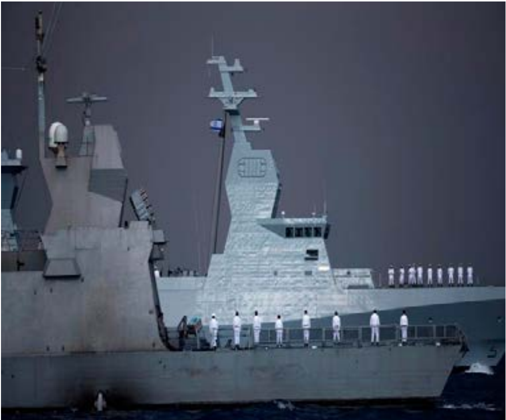
Israeli sailors, including some standing on the Saar-6 corvette, a warship dubbed “Shield” (seen in background), take part in a welcoming ceremony by the Israeli navy to mark the arrival of the warship, in the Mediterranean Sea off the coast of Haifa, northern Israel.