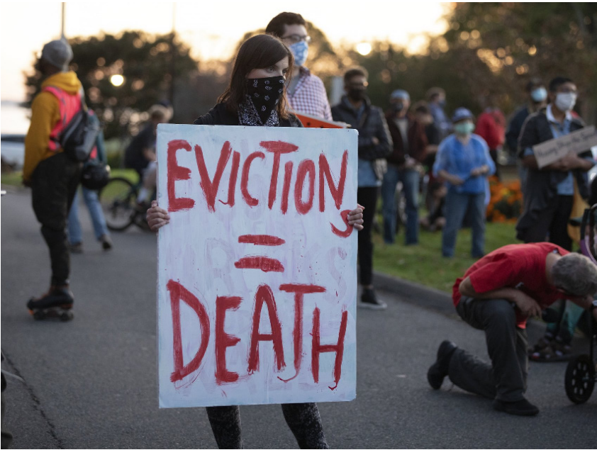
Housing activists gather in Swampscott, Mass., in October to call on the state’s governor to support more robust protections against evictions and foreclosures during the pandemic.