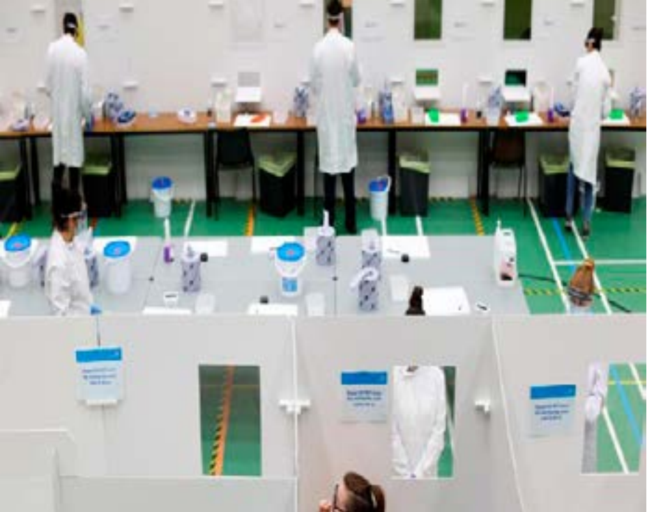
A person gives a swab sample during a mass coronavirus testing to allow students home for Christmas, at the Sports Hall of Keele University, in Keele, Staffordshire, Britain.