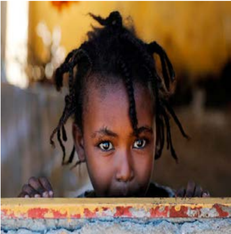
An Ethiopian girl stands at the window of a temporary shelter, at the Village 8 refugees transit camp, which houses Ethiopian refugees fleeing the fighting in the Tigray region, near the Sudan-Ethiopia border, Sudan.