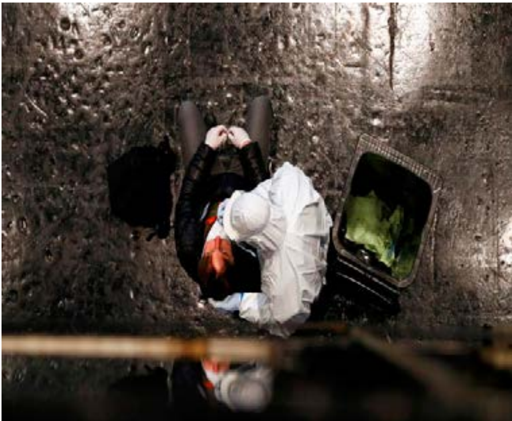
A health care worker collects a swab sample from a man during a rapid antigen test for army members and volunteers before the start of a mass test of Vienna’s population in Austria.