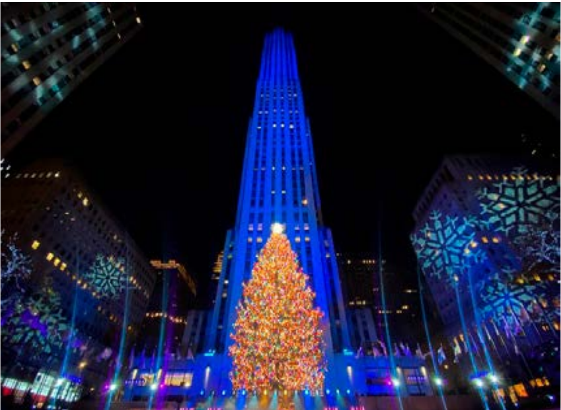
The Christmas tree is lit at Rockefeller Center in Manhattan, New York City.