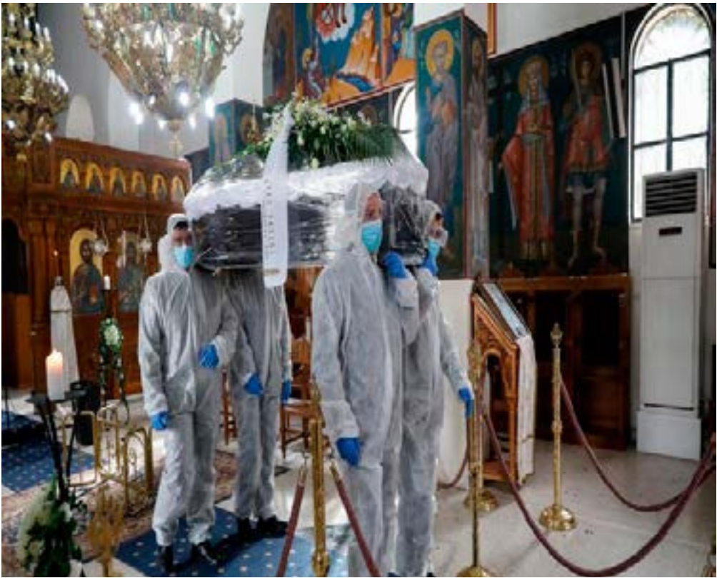
Pallbearers, wearing personal protective equipment, carry the coffin of a patient who died from the coronavirus inside a church in Athens, Greece.