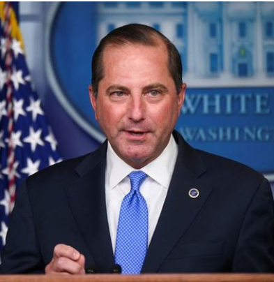
Health and Human Services Secretary Alex Azar.