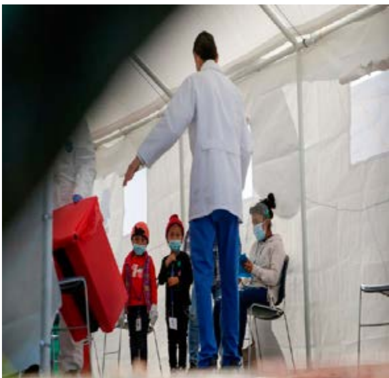
Migrants wait at a tent where they are being tested for the coronavirus at the Leona Vicario temporary migrant shelter, before being transferred to continue their asylum request in the United States, in Ciudad Juarez, Mexico March 1, 2021.