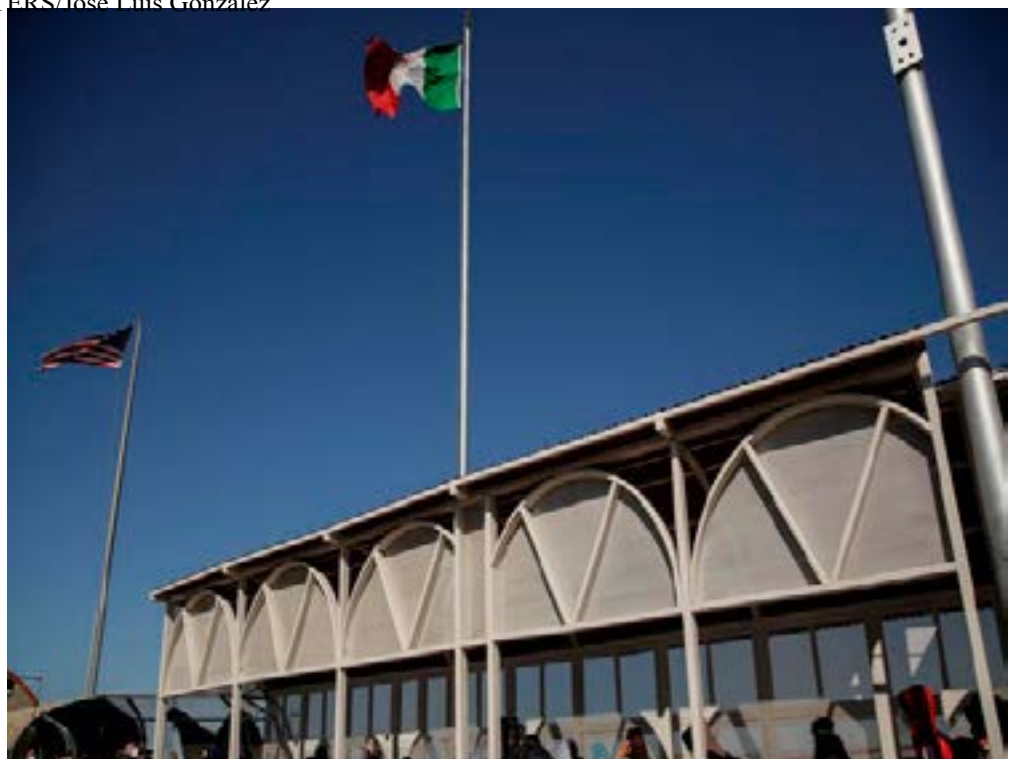
Migrants walk across the Paso del Norte international border bridge from the Mexican side to continue their asylum request in the United States, in Ciudad Juarez, Mexico March 1, 2021.