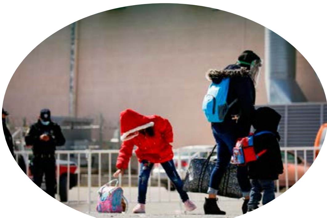
Migrants wait to take a test for the coronavirus at the Leona Vicario temporary migrant shelter, before being transferred to continue their asylum request in the United States, in Ciudad Juarez, Mexico March 1, 2021.