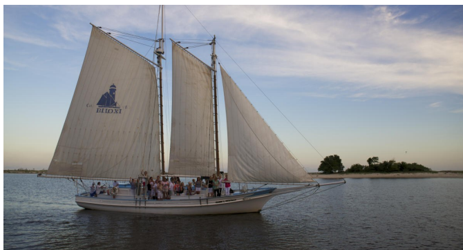
復刻版比拉錫號牡蠣船(Biloxi oyster schooner)是複製19世紀至20世紀始於密西西比州沿岸的白羽皇后號(white-winged queen)