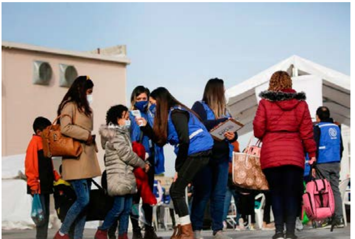
A woman checks the temperature of a child as migrants from Central America, under the Migrant Protection Protocols (MPP) program, wait to take a test for the coronavirus at the Leona Vicario temporary migrant shelter before being transferred to continue their asylum request in the United States, in Ciudad Juarez, Mexico February 26, 2021.