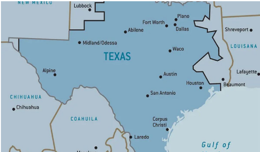
A map of the electrical grids in Texas.