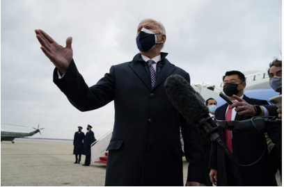
Biden declares a major disaster in Texas.

60,000 people in Texas still didn’t have power as of 4:00 p.m. ET Saturday, according to data from PowerOutage.us. The cold conditions caused energy usage and power prices to soar, which caused some Texas households to face electricity bills as high as $10,000. Michael McCaul, R-Texas., said during an interview on CNN on Sunday that officials will use the disaster relief funding from the administration to help people hit with high bills.