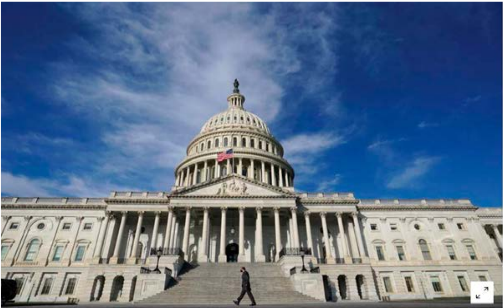
FILE PHOTO: A man makes his way past the U.S. Capitol on the day the House of Representatives is expected to vote on legislation to provide $1.9 trillion in new coronavirus relief in Washington, U.S., February 26, 2021. REUTERS/Kevin Lamarque

WASHINGTON (Reuters) - The Senate on Saturday passed President Joe Biden’s $1.9 trillion COVID-19 relief plan in a party-line vote after an all-night session that saw Democrats battling among themselves over jobless aid and the Republican minority failing to push through some three dozen amendments.