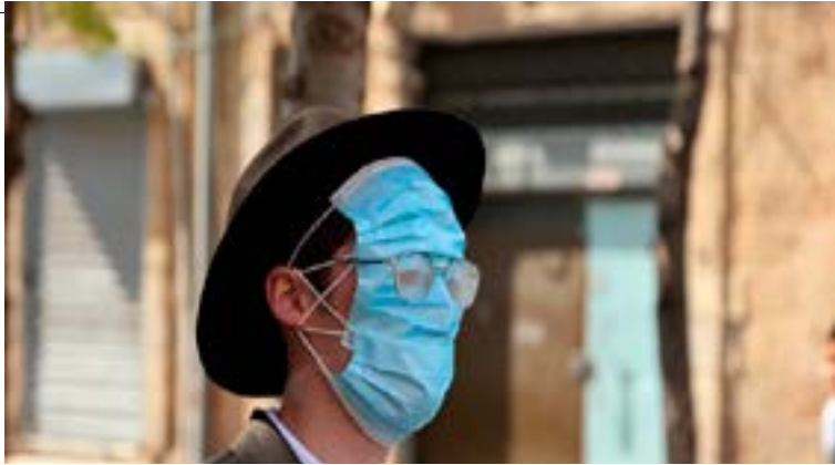
An ultra-Orthodox man wears three masks over his face while celebrating Purim amid coronavirus restrictions in Jerusalem February 28, 2021