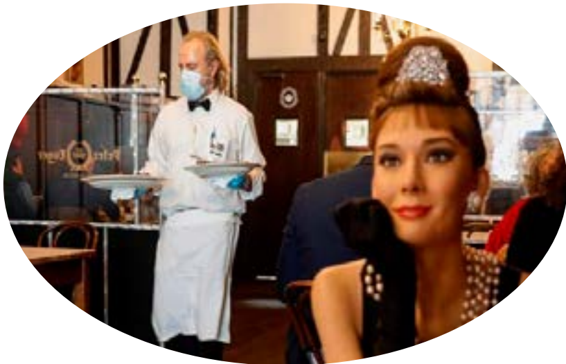
A Madame Tussauds wax figure of Audrey Hepburn sits at an empty table at Peter Luger Steak House in Brooklyn, New York, February 26, 2021. As New York City restaurants reopened indoor dining rooms at 35% capacity, the steakhouse and wax museum joined forces to welcome diners back in a fun way and to enforce social distancing guidelines.