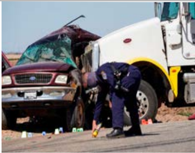
The scene of a collision between a sport utility vehicle and a tractor-trailer truck is seen near Holtville, California, March 2, 2021. Thirteen people killed in the highway crash were part of a group of nearly four dozen migrants suspected of slipping through a hole cut by human smugglers through a steel fence along the U.S.-Mexico border, federal officials said. Besides the dead and injured among 25 people crammed into the SUV that collided with the truck, 19 others were found huddled near a second SUV that caught fire in the same area just north of the border, the officials said.