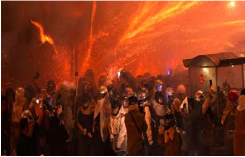
Participants wearing motorcycle helmets are sprayed with firecrackers during the 'Beehive Firecrackers' festival at the Yanshui district in Tainan, Taiwan February 26, 2021.