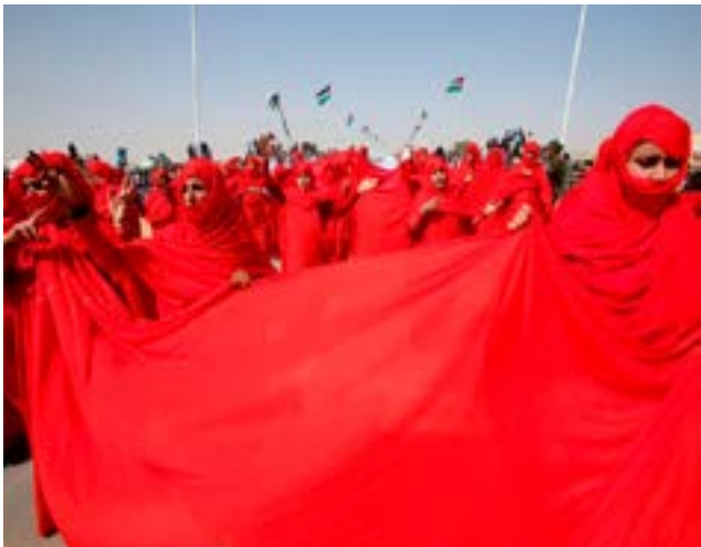
Sahrawi women take part in a parade organized by the Polisario Front independence movement at the Awserd refugee camp in Tindouf, Algeria February 27, 2021. Generations of young Sahrawis have grown up in Algeria's remote desert refugee camps largely forgotten by the outside world and now see no prospect of an independent homeland in Western Sahara except through a new war their leaders say has already begun.