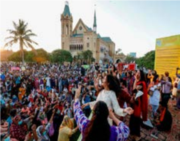
People participate in Aurat March or Women's March, to mark International Women's Day in Karachi, Pakistan March 8, 2021.