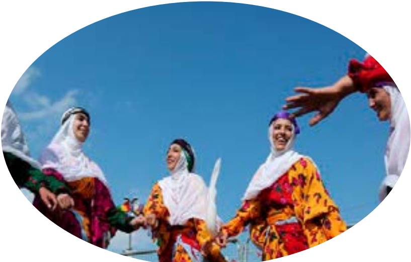
Women wearing traditional dresses dance during a rally to mark International Women's Day in Diyarbakir, Turkey March 8, 2021.