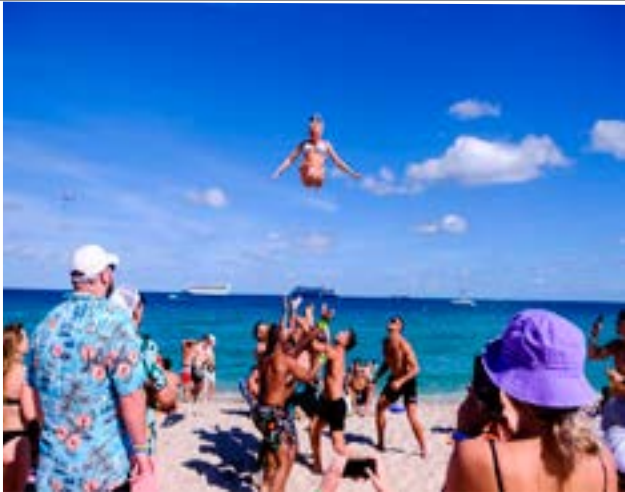
A college athlete is thrown in the air by a group of men on the beach to celebrate spring break in Fort Lauderdale, Florida, March 5, 2021.