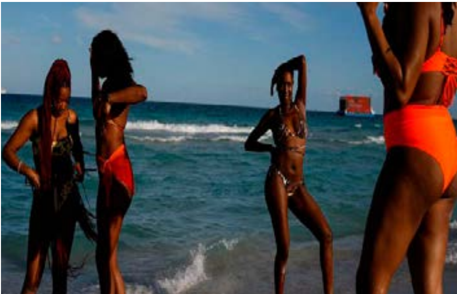
Revelers flock to the beach to celebrate spring break in Miami Beach, Florida, March 5, 2021.