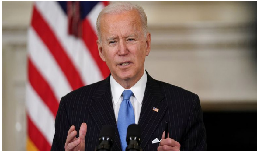
President Joe Biden