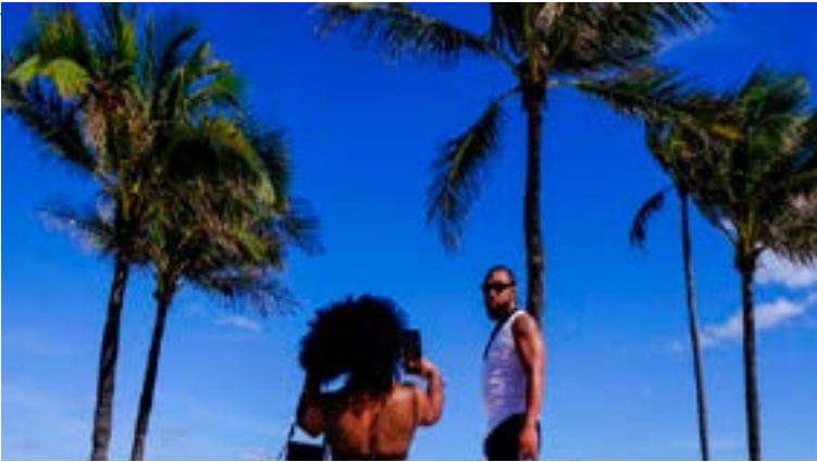
A woman takes a photo in front of the beach as spring break begins in Fort Lauderdale, Florida, March 5, 2021.