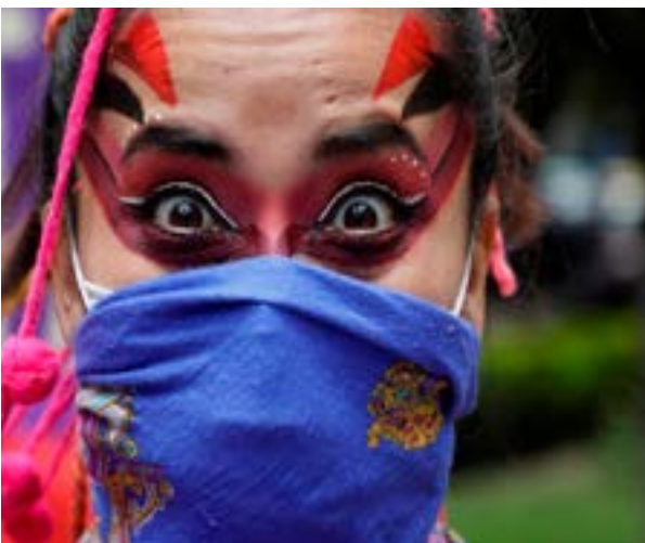
A woman with a painted face takes part in a protest to mark International Women's Day in La Paz, Bolivia, March 8, 2021.