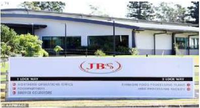
The entrance to the JBS Australia’s

JBS said in a statement that the ‘organized cybersecurity attack’ was detected on Sunday, ‘affecting some of the servers supporting its North American and Australian IT systems.’