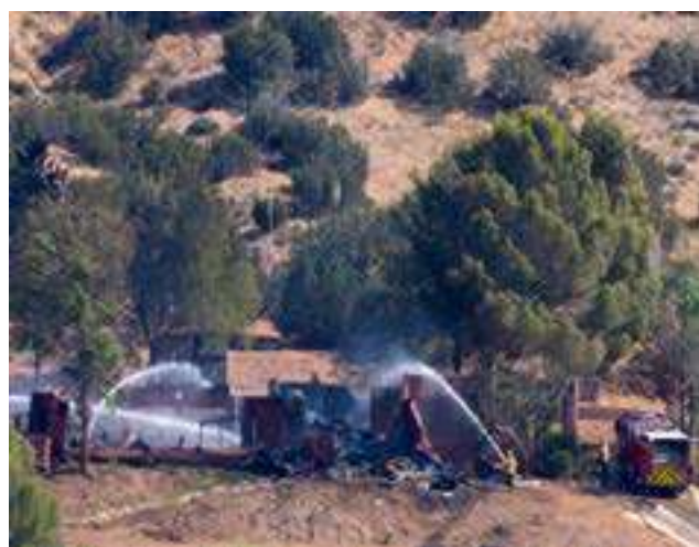
Firefighters douse water on a home after a firefighter shot one colleague to death and severely wounded another at their Los Angeles County firehouse before the suspect apparently took his own life outside his nearby home as his dwelling went up in flames, officials said, in Acton, California.