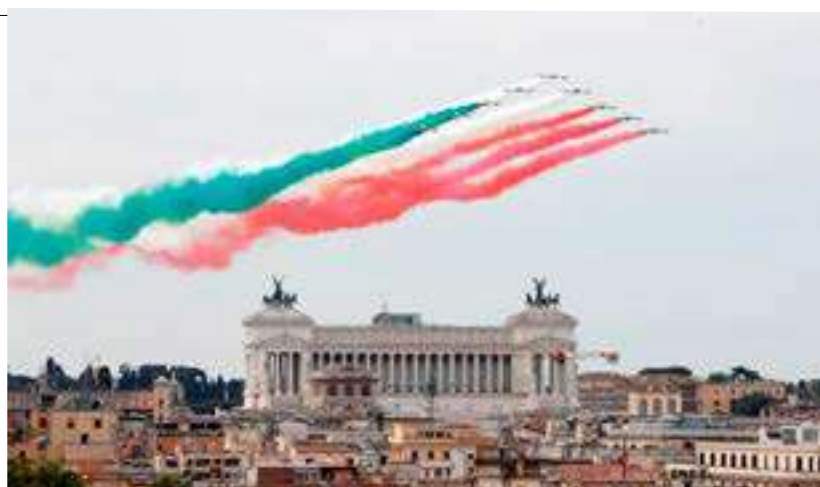
The aerobatic demonstration team of the Italian Air Force, the Freccie Tricolori (Tricolor Arrows), perform over the city on Republic Day, in Rome, Italy.