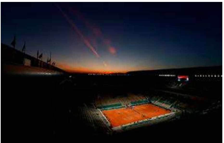
A view of the court during the first round match between Serbia's Novak Djokovic and Tennys Sandgren of the U.S. at the French Open in Paris.