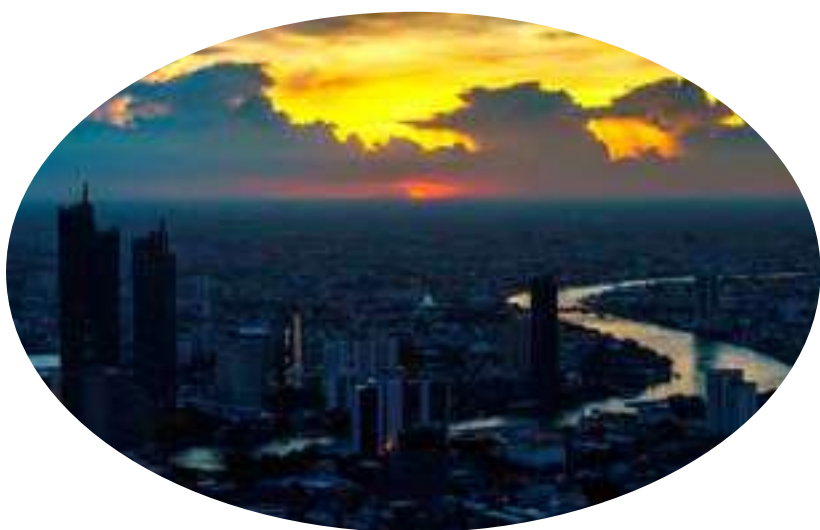
The skyline with Chao Phraya River is photographed during sunset in Bangkok, Thailand.