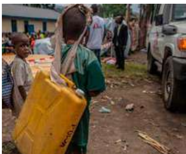
A displaced Congolese child who evacuated from recurrent earth tremors as aftershocks after homes were covered with lava deposited by the eruption of Mount Nyiragongo, waits to receive water at a distribution point by Doctors Without Borders (MSF) team members near their temporary camp in Sake, Democratic Republic of Congo.