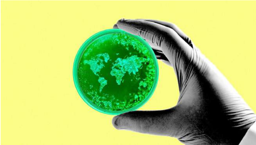
Illustration above depicts the world in a Petri dish.