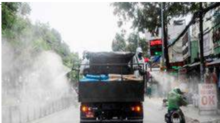
A truck sprays disinfectant amid the coronavirus outbreak in Ho Chi Minh city, Vietnam.