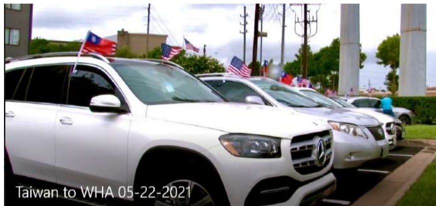
Taiwan to WHA 05-22-2021