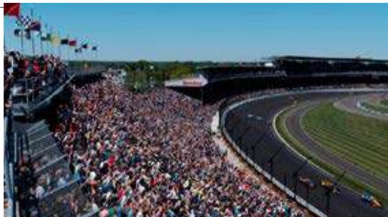
Spectators react as drivers take their first lap at the Indy 500, the largest attended sporting event in the world since the start of the coronavirus pandemic, in Indianapolis, Indiana, May 30, 2021.