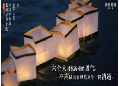
shows a scene from The Six.