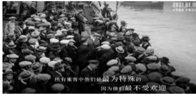
A still from “The Six,” an upcoming documentary about the little-known Chinese survivors of the Titanic.