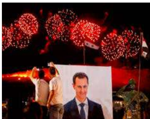
A poster depicting Syrian President Bashar al-Assad is seen as his supporters celebrate after the results of the presidential election announced that he won a fourth term in office, in Damascus, Syria, May 27, 2021. The win, dismissed by the opposition and the West as a farce, delivers Assad seven more years in power and lengthens his family's rule to nearly six decades.