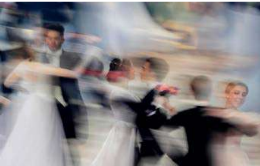
Participants dance during the 18th annual Viennese Ball charity event at Gostiny Dvor in Moscow, Russia, May 29, 2021.