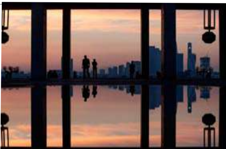
People are reflected in a puddle as they watch the sunset in Moscow, Russia May 27, 2021.