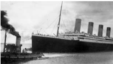
The Titanic leaves Southampton on her ill-fated maiden voyage on April 10, 1912.

About 1,500 people were killed when the RMS Titanic - nicknamed ‘The Unsinkable Ship’ - struck an iceberg in the Atlantic Ocean on April 14, 1912. Only around 700 people survived, most in lifeboats while a rare few managed to cling to the wreckage and wait for help to arrive in freezing waters But almost nothing is known about the eight Chinese men who boarded the Titanic, and the six of them who survived. Their names can still be found on a single ticket for third-class passengers: Ah Lam, Fang Lang, Len Lam, Cheong Foo, Chang Chip, Ling Hee, Lee Bing and Lee Ling.