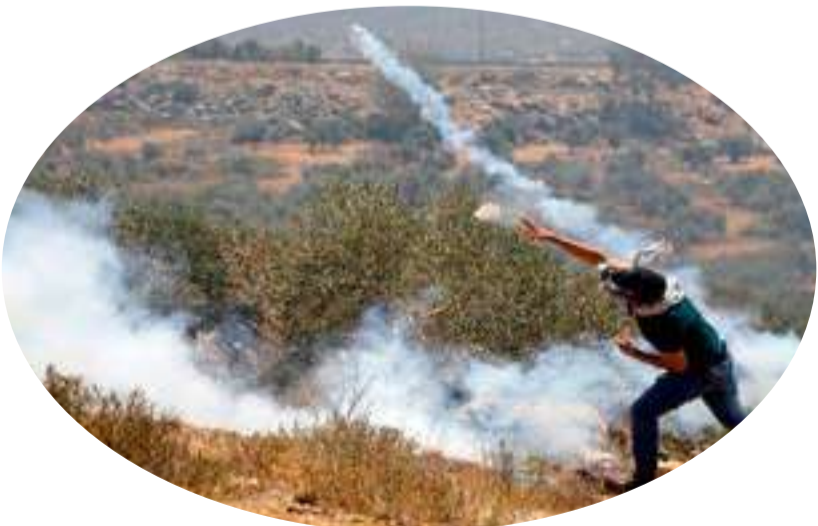
A Palestinian demonstrator hurls back a tear gas canister fired by Israeli forces during a protest against Israeli settlements in Beita, in the Israeli-occupied West Bank.