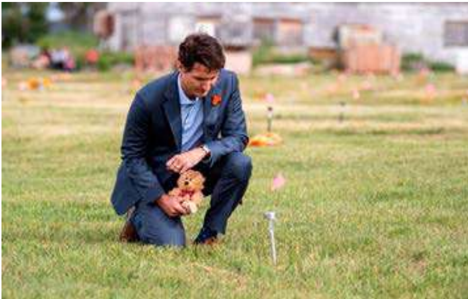
Prime Minister Justin Trudeau lays a teddy bear at a small flag marking one of 751 unmarked graves.