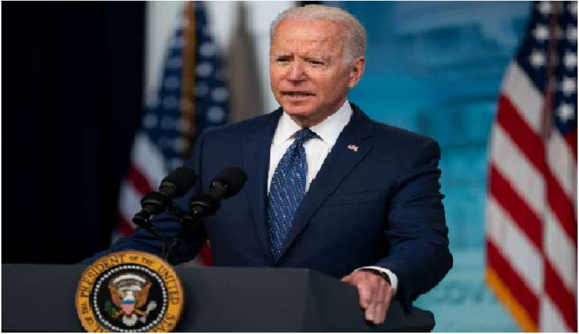
President Joe Biden