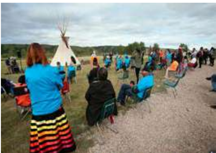
Canada's Prime Minister Justin Trudeau visits the Cowessess First Nation.