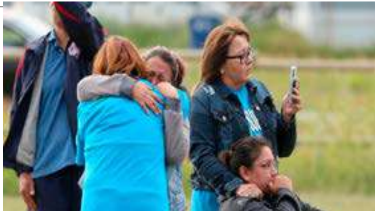
Residential school survivors embrace during a visit by Canada's Prime Minister Justin Trudeau to Cowessess First Nation.