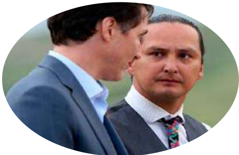
Canada's Prime Minister Justin Trudeau speaks to Chief Cadmus Delorme during a visit to Cowessess First Nation.