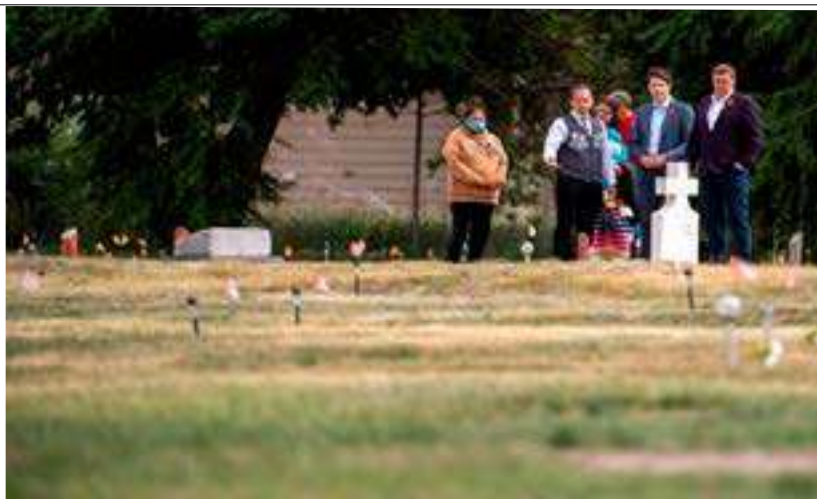
Chief Cadmus Delorme, left to right, Prime Minister Justin Trudeau, and Saskatchewan Premier Scott Moe walk through a field with small flags indicating 751 unmarked graves, prior to a ceremony at the site of former Marieval Indian Residential School in Cowessess First Nation, Saskatchewan, Canada July 6, 2021. Ground-penetrating radar detected the 751 unmarked