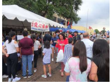
愛心組織在 plaz Americans east parking lot 上與市府合辦園遊會盛況。