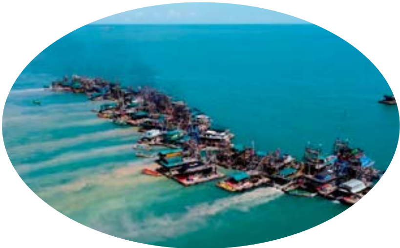
An aerial view shows wooden pontoons equipped to dredge the seabed for deposits of tin ore off the coast of Toboali, on the southern shores of the island of Bangka, Indonesia, May 1, 2021.