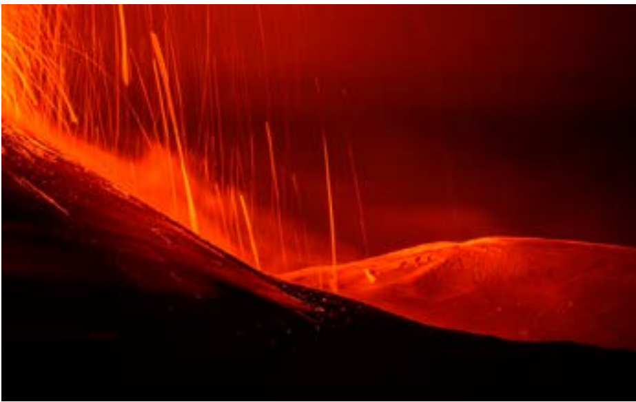
Streams of red hot lava flow as Mount Etna, Europe's most active volcano, erupts, as seen from Sant' Alfio, Italy.