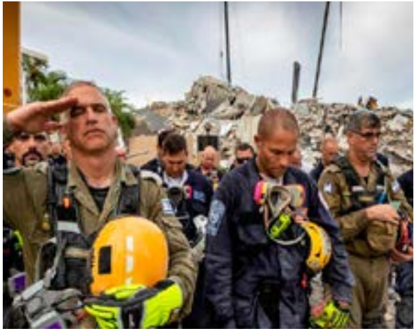
A member of the Israeli search and rescue team (left) salutes in front of the rubble that once was Champlain Towers South during a prayer ceremony and a moment of silence in Surfside, Florida.