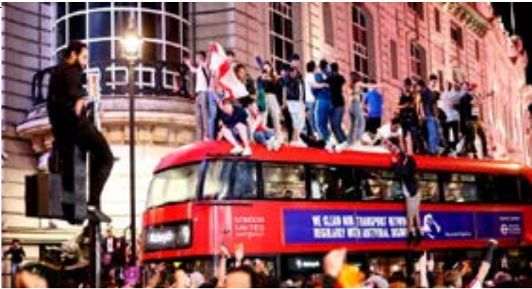
England fans celebrate after their semi-final Euro match against Denmark, in Piccadilly Circus, London.