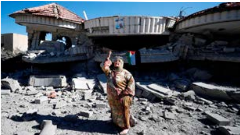
A woman gestures next to the house of jailed Palestinian assailant Muntasir Al-Shalabi, after it was blown up by Israeli forces, in Turmus Aya, near Ramallah in the Israeli-occupied West Bank.