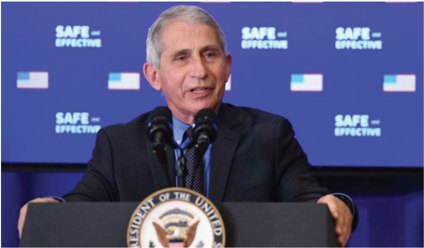
Dr. Anthony Fauci, the leading U.S. infectious disease specialist.