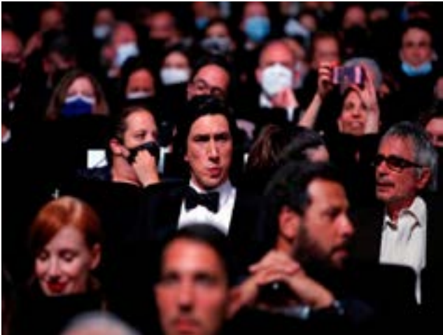
Actor Adam Driver attends the screening of "Annette" in Cannes.