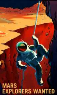
MARS EXPLORERS WANTED

past or current life. In fact, multiplanet settlements maybe crucial for the long-term survival of humans. Amazon’s founder and CEO Jeff Bezos believes that expanding our living options in our solar system “is not something that we may choose to do; this is something we must do.” Environmental destruction, natural resource constraints, rapid population growth and potentially deadly asteroids or other natural disasters could leave Mother Earth with a limited capacity to sustain our continued growth. Colonizing another planet could lift the barriers Earth may present to the continued expansion of humanity.