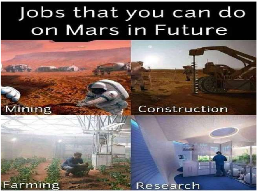
By Louis Efron

47%. That’s how much of the U.S. population has been fully vaccinated against Covid-19, according to the CDC. Given the diminished protection of just one dose against Delta, getting this figure up is a priority for public health officials. (Courtesy https://www.forbes.com/)