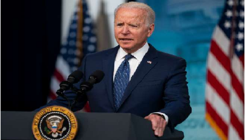
President Joe Biden