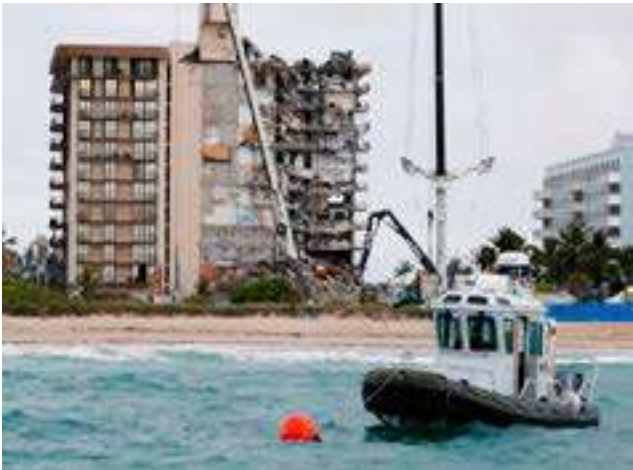
A Miami-Dade County police boat sits at anchor as emergency workers conduct search and rescue efforts at the site of a partially collapsed residential building in Surfside, near Miami Beach, Florida, June 30.