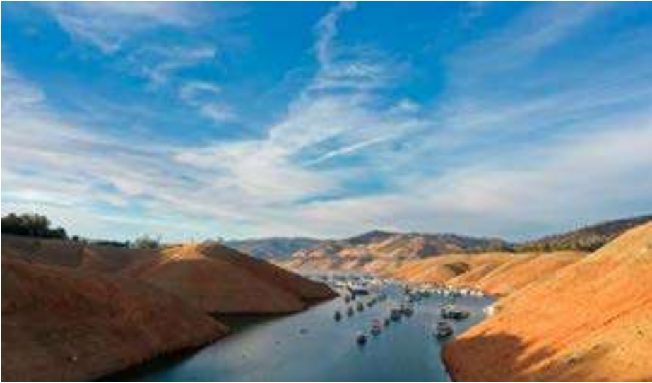
An aerial view shows houseboats anchored in low water levels at Lake Oroville, which is the second-largest reservoir in California and according to daily reports of the state's Department of Water Resources is near 35% capacity, near Oroville, California, June 16, 2021.