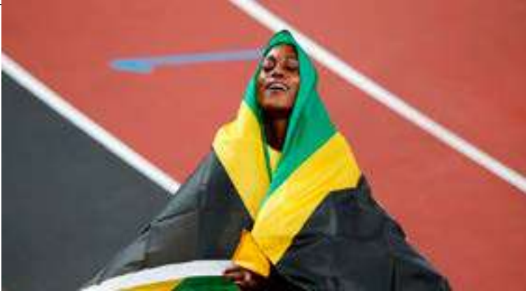
Gold medallist Elaine Thompson-Herah of Jamaica celebrates after winning the women's 100m final.

Cuba's Minister of Foreign Trade and Foreign Investment Rodrigo Malmierca delivers a speech next to Mexico's Navy multipurpose ship Arm Libertador Bal-02, that just arrived with humanitarian aid at the port of Havana, Cuba, July 30, 2021.