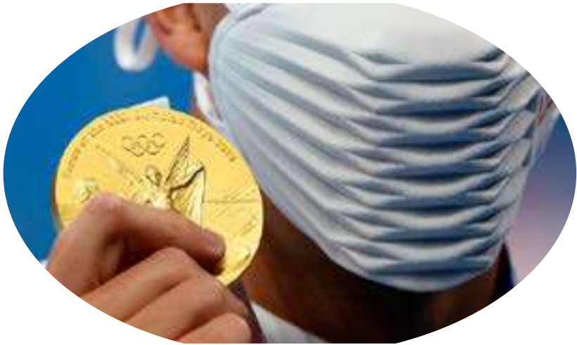
Gold medallist Caeleb Dressel of the United States poses with his medal during the men's 100m butterfly medal ceremony.