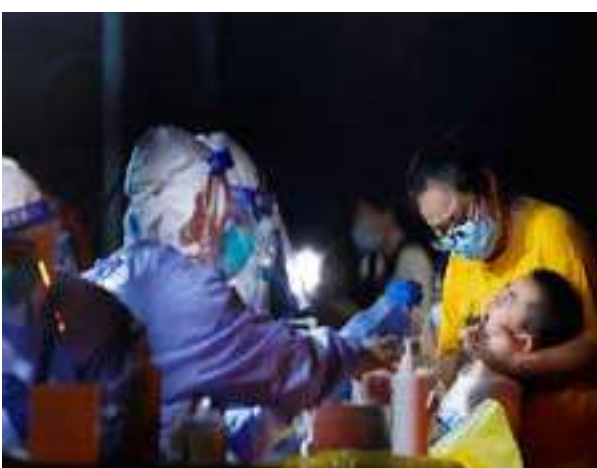
A medical worker in protective suit collects a swab from a child for nucleic acid testing following a new case of the coronavirus in Shanghai, China.