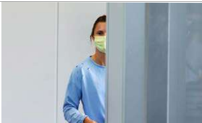
Belarusian Sprinter Krystina Tsimanouskaya who took refuge in the Polish embassy in Tokyo, looks on as she boards a flight to Vienna at Narita International Airport in Narita, east of Tokyo, Japan.