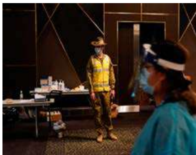
An Australian Defence Force member watches over a coronavirus vaccination clinic at the Bankstown Sports Club as the city experiences an extended lockdown, in Sydney, Australia.