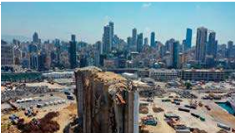
A picture taken with a drone shows a general view of the site of the Aug. 4, 2020 explosion in Beirut's port, after almost a year since the blast, Lebanon.