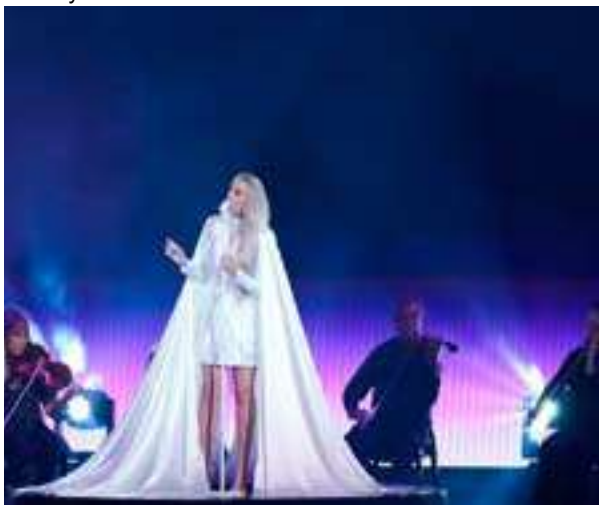
Gabby Barrett performs on stage.