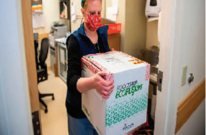
A health worker carries a special refrigerated box of Moderna's COVID-19 vaccines for use at the East Boston Neighborhood Health Center in Boston on December 24, 2020.

The enormous loss of life this winter has happened paradoxically at a time that many hope marks the start of the final chapter of the pandemic. A quarter of all COVID-19 deaths have happened during the five-week period since the Food and Drug Administration authorized the first vaccine on Dec. 14.