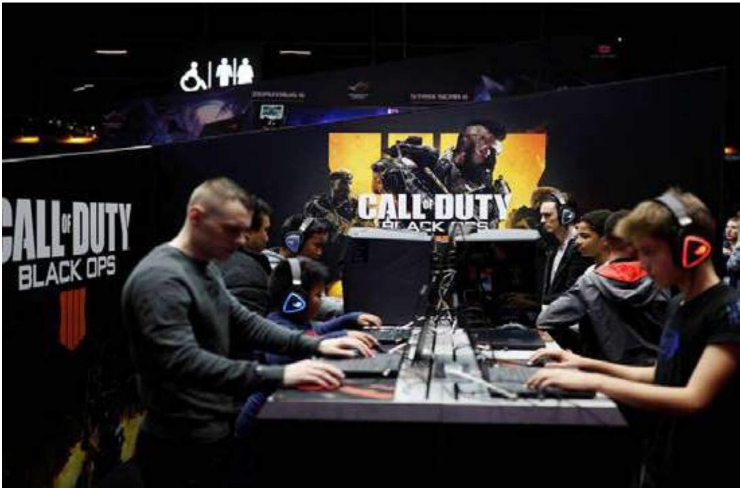
Gamers play Call of Duty: Black Ops 4 at the Paris Games Week (PGW), a trade fair for video games in Paris, France, October 25, 2018.

Jan 18 (Reuters) - Microsoft Corp (MSFT.O) is buying "Call of Duty" maker Activision Blizzard (ATVI.O) for $68.7 billion in the biggest gaming industry deal in history as global technology giants stake their claims to a virtual future.