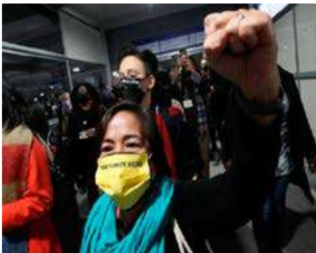
People attend a protest at the UN Climate Change Conference (COP26), in Glasgow, November 12. REUTERS/Yves Herman