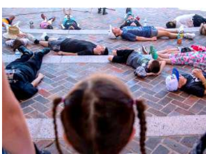
In Civic Center Park’s Greek amphitheater, 21 children lie on the ground to represent 21 people killed in Uvalde, Texas, during the March For Our Lives rally.