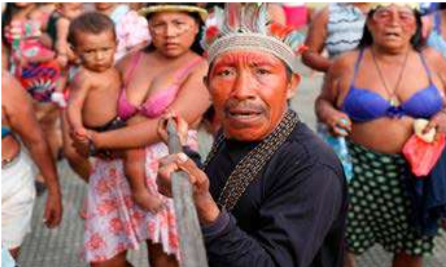
Indigenous people protest demanding for security in the region, following the disappearance of British journalist Dom Phillips and indigenous expert Bruno Araujo Pereira, who went missing while reporting in a remote and lawless part of the Amazon rainforest, near the border with Peru, in Atalaia do Norte, Amazonas state, Brazil.