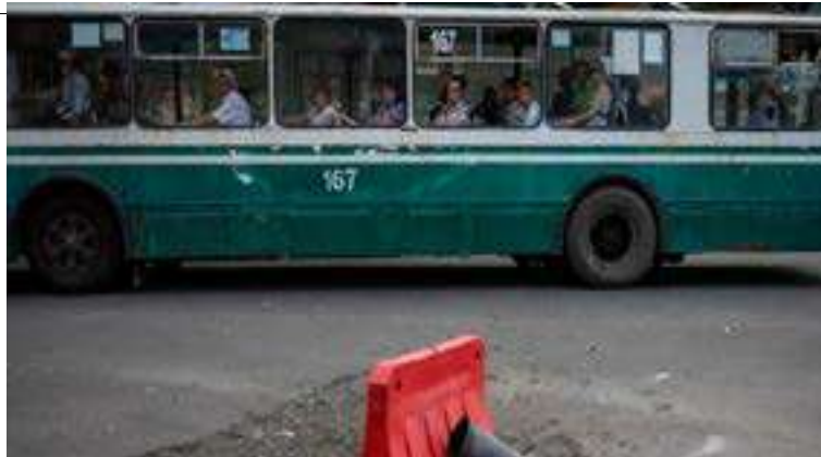
People ride in a trolleybus near a shell from a multiple rocket launch system in Bakhmut, Ukraine.