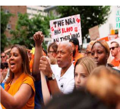
New York City: New York Mayor Eric Adams and Attorney General Letitia James join people as they march across the Brooklyn Bridge to protest against gun violence in the March for Our Lives rally.

Seventeen people were killed in the Parkland school shooting in 2018. This weekend’s marches come alongside a renewed push in Congress for gun control. Lawmakers have been facing intense pressure to act in the wake of the recent mass shootings, and