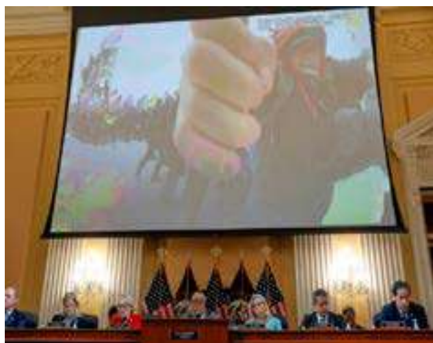
Police body camera footage from January 6, 2021 shows the attack on the U.S. Capitol in video displayed above U.S. Representative Zoe Lofgren (D-CA), Chairperson Bennie Thompson (D-MS), Vice Chair U.S. Representative Liz Cheney (R-WY) and U.S. Representative Adam Kinzinger (R-IL) holding the second public hearing of the U.S. House Select Committee to Investigate the January 6