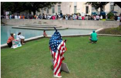
Houston: Demonstrators join the “March for Our Lives” rally at City Hall.