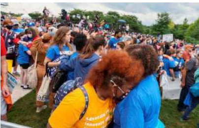
Demonstrators console each other after a counter-protester jumped a barricade in an attempt to disrupt a March for Our Lives rally against gun violence.

The “March For Our Lives” protest was a student-led movement focused on gun violence prevention and drew mass demonstration in the wake of recent shootings in Uvalde, Texas, and Buffalo, New York. The DC march on Saturday afternoon at the Washington Monument featured a slate of speakers pushing for gun control – and calling on lawmakers and federal leaders to take action.