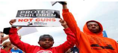
Demonstrators attend a March for Our Lives rally against gun violence on the National Mall in Washington, D.C.

The rallies were organized by March for Our Lives, a youth-driven organization first created by students who survived the mass shooting at Marjory Stoneman Douglas High School in Parkland, Florida, in 2018.