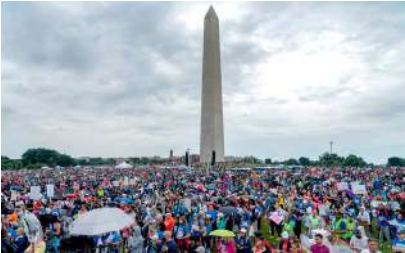
People participate in the second March for Our Lives rally in support of gun control in front of the Washington Monument in Washington, D.C.