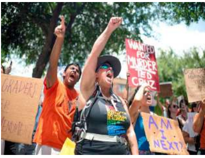
Houston: Demonstrators shout during the March for Our Lives rally. Buffalo