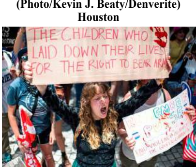
Houston: Demonstrators shout during