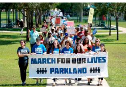
Parkland, Fla.: Community members from Parkland and all of South Florida joined together for the March For Our Lives Parkland rally near Marjory Stoneman Douglas High School, where 17 people were killed by a gunman on February 14, 2018.