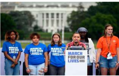
Washington, D.C.: Parkland, Florida, school shooting survivor and activist X Gonzalez speaks to gun control advocates during the March for Our Lives rally.

On Wednesday, the House also passed a series of new gun measures, which include raising the minimum age to buy semi-automatic rifles from 18 to 21. That legislative package is all but guaranteed to fail in the upper chamber because of Republican opposition.