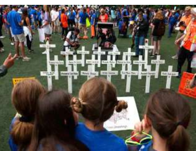
New York City: Demonstrators join the

Additional ‘March For Our Lives’ Event Photos