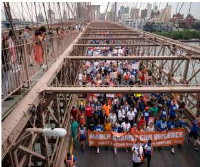
Brooklyn, N.Y.: Demonstrators march across the Brooklyn Bridge during the “March for Our Lives” rally.