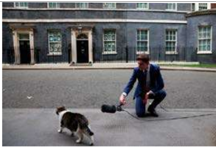
Prince Charles and Camilla, Duchess of Cornwall are seen during the Royal procession at the Royal Ascot in Britain.