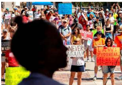
Denver: Many people participated in the March For Our Lives rally at Civic Center Park.