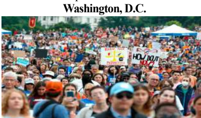
Washington, D.C.: People march at the March for Our Lives 2022 rally.

“We don’t have to live like this,” she said, adding that people in other countries “don’t live like this.” Rep. Cori Bush, D-Mo., shared a story of having been in an abusive relationship when she was younger in which her partner shot at her multiple times. “That moment when gun violence strikes is so dramatic and so preventable,” she said. “I didn’t know when he would stop.”