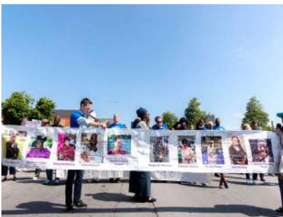
Buffalo: People participating in a March For Our Lives event pause at a memorial to the dead in the Tops grocery store mass shooting.