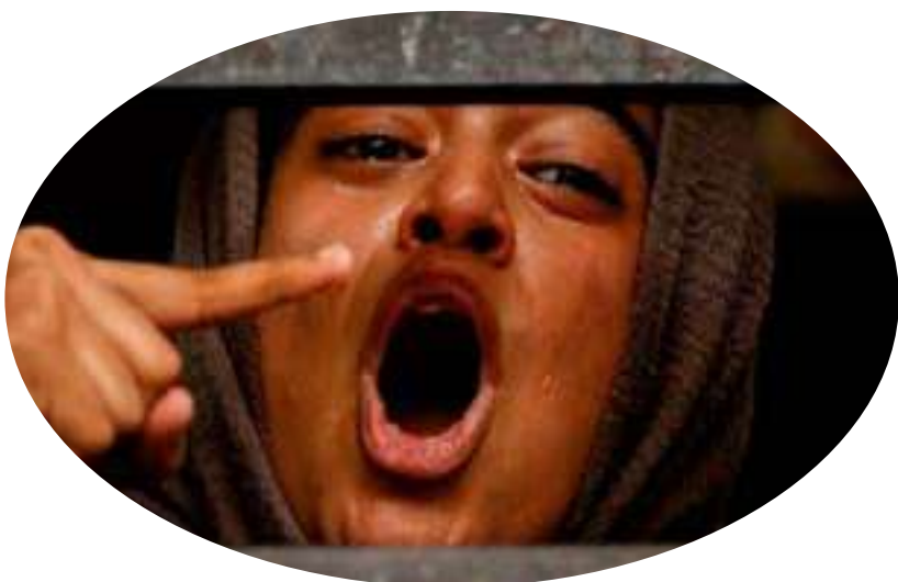
A protestor cries inside a police bus after being detained during a protest against what they say are attacks on Muslims following clashes last week triggered by remarks made by ruling Bharatiya Janata Party (BJP) members on Prophet Mohammad, outside UP Bhawan, in New