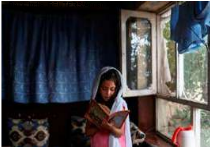
An Afghan girl reads a book inside her home in Kabul, Afghanistan.