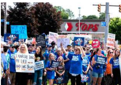
Buffalo: A group estimated in the hundreds takes part in a March For Our Lives event.