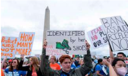
Hundreds of rallies were held on Saturday, June 11th across the country to push for gun safety laws.