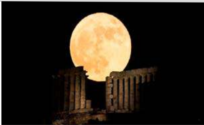
A full moon known as the “Strawberry Moon” rises behind the Temple of Poseidon, in Cape Sounion, near Athens, Greece.