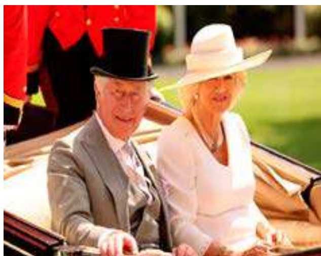
Britain's Prince Charles and Camilla, Duchess of Cornwall are seen during the Royal procession at the Royal Ascot.