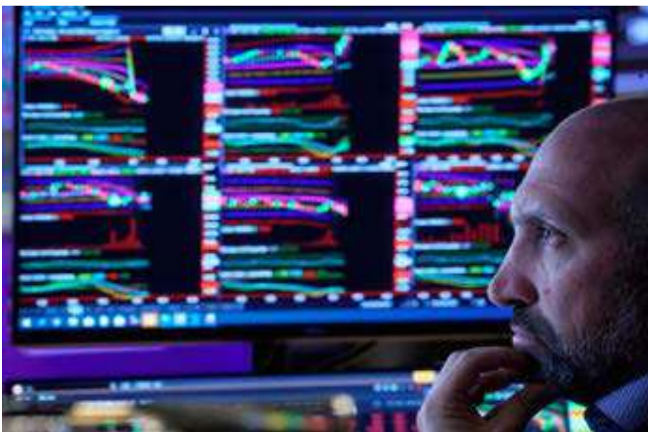
A trader works on the floor of the New York Stock Exchange (NYSE) in New York City.