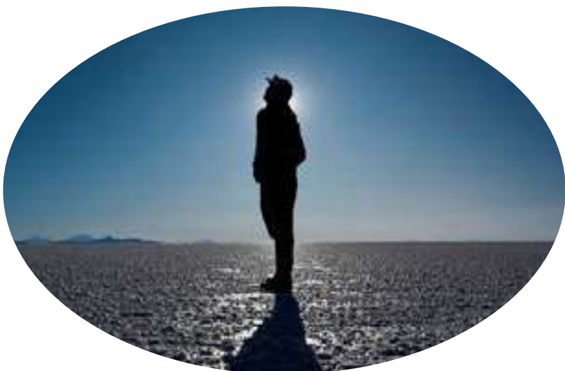
A man stands on salt at the Uyuni Salt Flat in Bolivia.