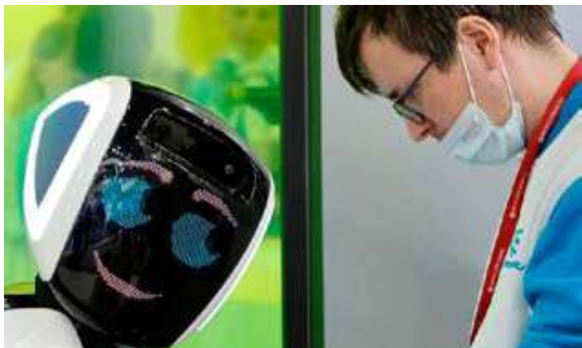
A participant stands next to a robot during the St. Petersburg International Economic Forum (SPIEF) in Saint Petersburg, Russia.