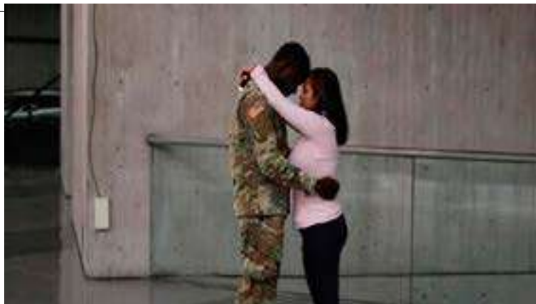
A couple embraces after a farewell ceremony for soldiers from the U.S. Army 69th New York Infantry Regiment deploying to the Horn of Africa for a one year long security mission, at the Javits Center in New York City.