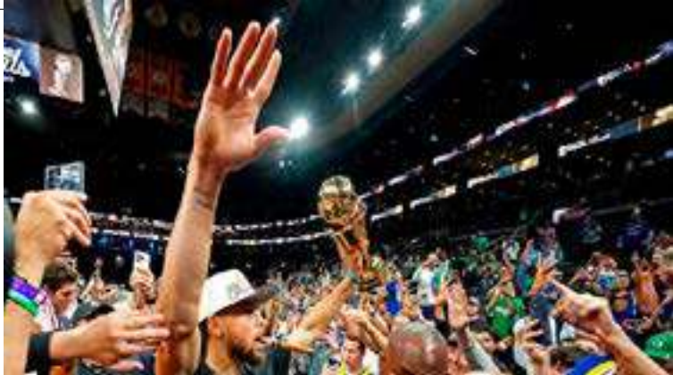
Golden State Warriors guard Stephen Curry celebrates after the Warriors beat the Boston Celtics in game six.