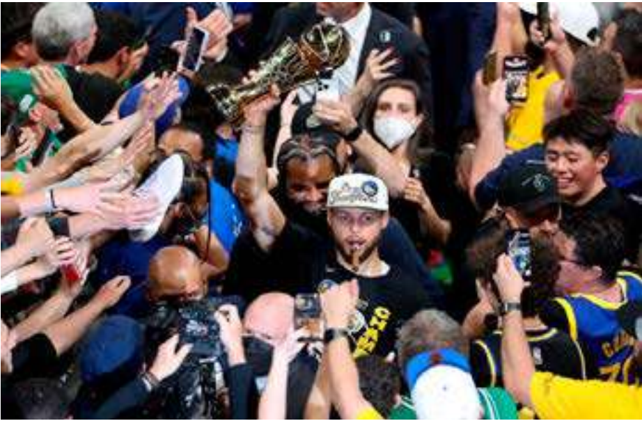
Golden State Warriors guard Stephen Curry holds up the Most Valuable Player Trophy after defeating the Boston Celtics in game six.