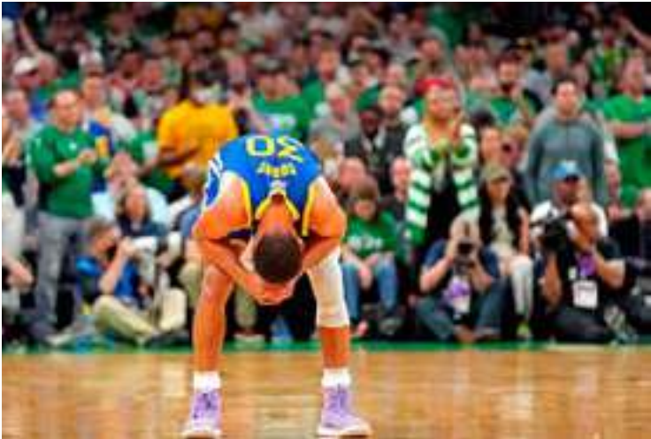
Golden State Warriors guard Stephen Curry reacts during the fourth quarter.