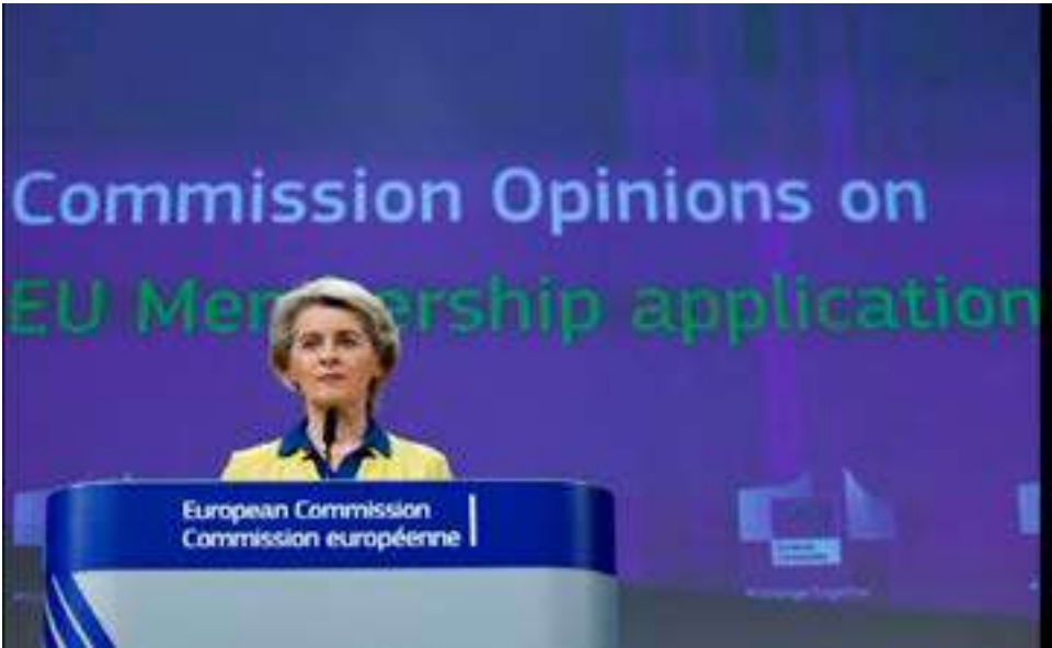
European Commission President Ursula von der Leyen attends a news conference, with European Commissioner for Neighbourhood and Enlargement Oliver Varhelyi, after a meeting of the College of European Commissioners addressing its opinion on Ukraine’s EU candidate status, in Brussels, Belgium June 17, 2022.

Moldovan President Maia Sandu hailed a “strong signal of support for Mol-