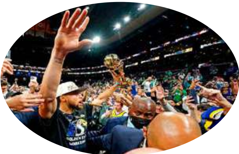
Golden State Warriors guard Stephen Curry celebrates after the Warriors beat the Boston Celtics in game six.