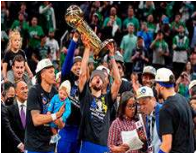
Stephen Curry celebrates with the the Larry O’Brien Championship Trophy.