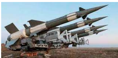
Kiev’s Missiles Are All That Stand Between The Russian Air Force And Control Of Ukraine’s Skies

Some of the most intense bombing came in 2016 during the battle for Aleppo, resulting in hundreds of civilian deaths. Russian President Vladimir Putin has termed the missile ‘an ideal weapon’ that flies at 10 times the speed of sound and can overcome air-defence systems. Hypersonic missiles can be used to deliver conventional warheads, more rapidly and precisely than other missiles. But their capacity to deliver nuclear weapons could add to a country’s threat, increasing the danger of a nuclear conflict. Russia’s announcement of the missile strike came as Kyiv’s army high command claimed to have killed a fifth Moscow general since the war in Ukraine began. Lieutenant General Andrey Mordvichev was one of Vladimir Putin’s most senior commanders, in charge of the 8th All-Military Army of the Kremlin’s vast Southern Military District. Moscow did not initially confirm his death in keeping with most previous claims of the ‘liquidation’ of Generals. Ukraine now claims to have killed five holding the rank of General. The Ukrainians also claimed that wounded Russian soldiers have filled all hospital facilities in Gomel city in Belarus.