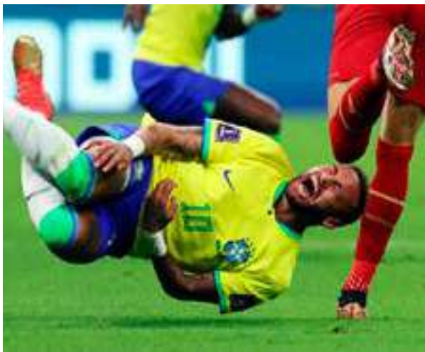
Brazil's Neymar reacts after a challenge from Serbia's Sasa Lukic during the FIFA World Cup.