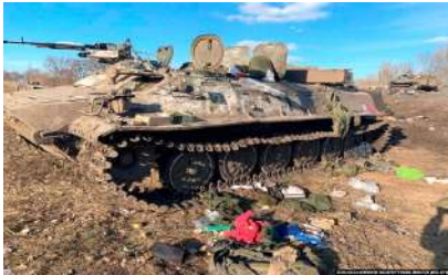
A Russian tank destroyed by Ukrainian forces. The lower orbit of Starlink also allows signals to trav-

Bloomberg Billionaire’s Index, responded just hours later: ‘Starlink service is now active in Ukraine. More terminals en route.’ Within days, trucks arrived at Ukraine hauling Starlink terminals, as well as adapters providing power via cigarette lighters in cars, or battery packs, and a roaming feature to ensure people are connected while they travel to safety. Starlink uses thousands of small satellites around 340 miles above the earth’s surface. Base stations on earth send radio waves up to the satellites, which beam those down to a satellite dish terminal back on the planet. The aim of the system is to bring internet access to rural and poorly connected parts of the world. It has allowed internet connections to travel quickly, with more speed provided due to travelling through space.