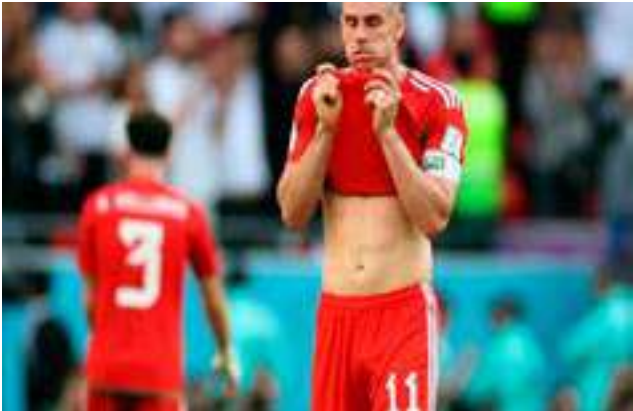
Wales' Gareth Bale looks dejected after Iran's second goal.