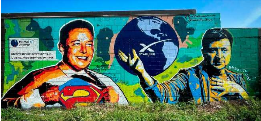
Artist Depiction Of Elon Musk (Left) And Ukraine President Zelinsky (Right) Showing Their Partnership With The Starlink Satellite System And Drone Initiative.