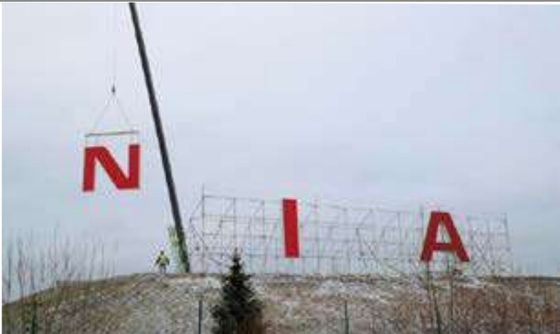
Workers dismantle the Nissan logo sign near the assembly plant, after the Japanese automaker completed the sale of its Russian legal entity to state-owned NAMI, in Saint Petersburg, Russia.