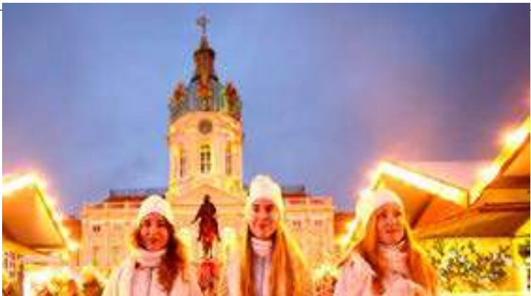
Women from Ukraine dressed up as angels pose as they collect donations for Ukrainian children at the Christmas market in front of Charlottenburg Palace in Berlin, Germany.