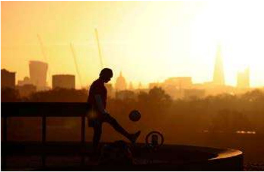
A person films himself doing kick-ups with a football during sunrise on Primrose Hill in London, Britain.