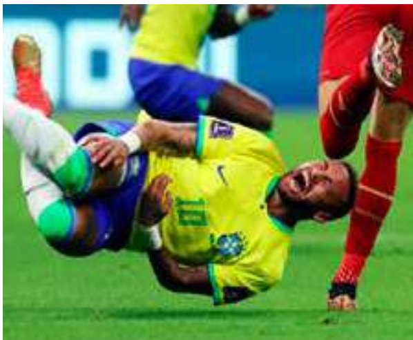
Brazil's Neymar reacts after a challenge from Serbia's Sasa Lukic during the FIFA World Cup.