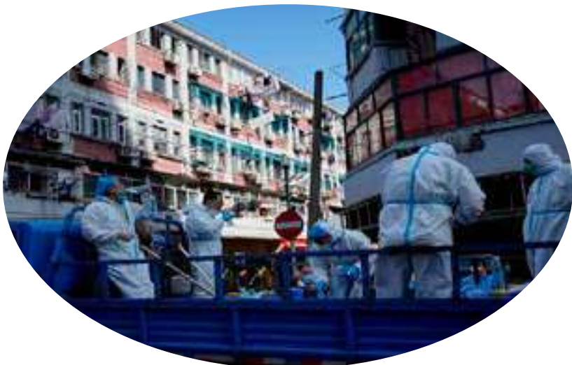
Workers in protective suits stand on a truck as the city prepares to end the lockdown placed to curb the coronavirus outbreak in Shanghai, China.