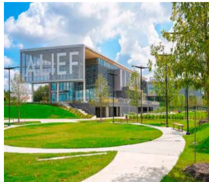
Alief Neighborhood Center