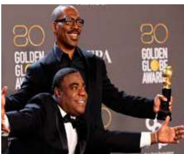
Eddie Murphy poses next to Tracy Morgan with the Cecil B. DeMille Award at the 80th Annual Golden Globe Awards in Beverly Hills, California.