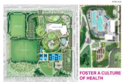
FOSTER A CULTURE OF HEALTH