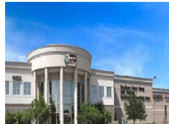
Southern News Group, Houston, Texas

Members of the community who have questions about any of the variety of issues the Center will address are encouraged to schedule interviews with the Center. The Center will link the person with a professional who can best address their needs.