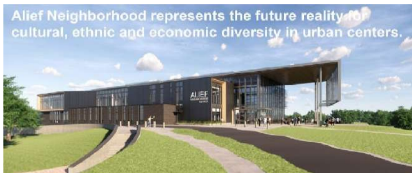
Alief Neighborhood represents the future reality for cultural, ethnic and economic diversity in urban centers.