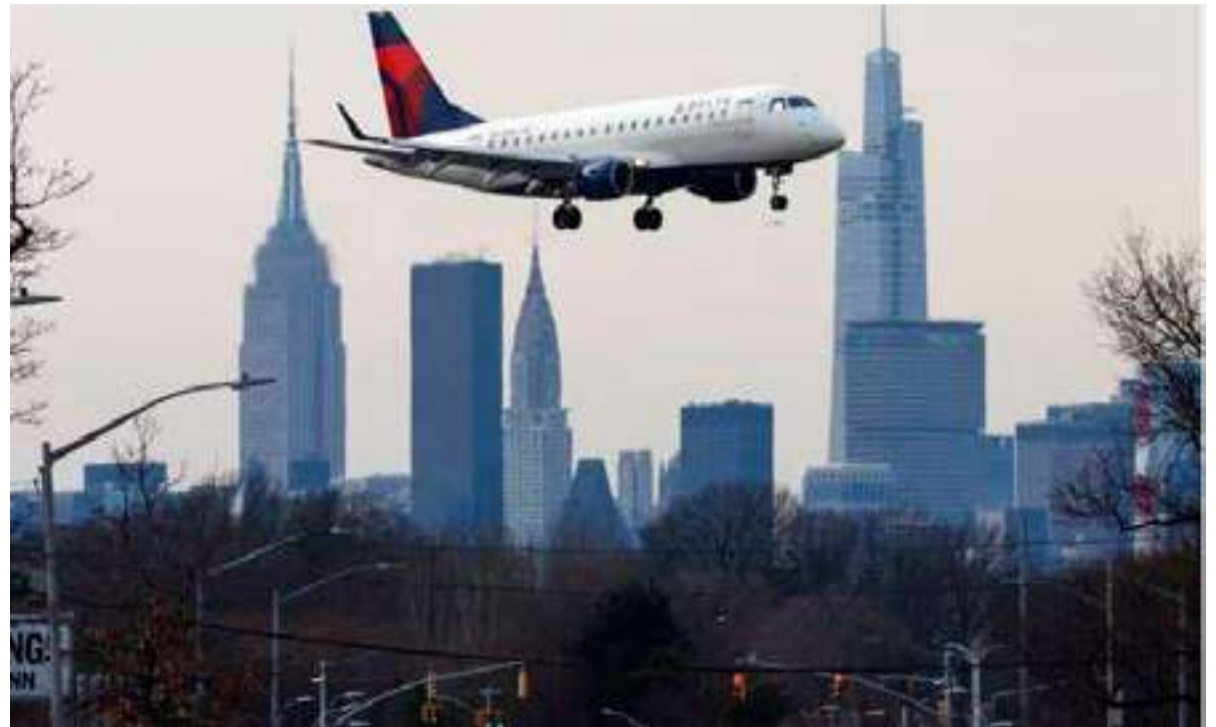
Laguardia Airport in New York

'CATASTROPHIC' FAILURE Planes resume flights following an FAA system outage at