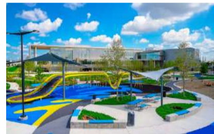
The exterior children's area at Alief Neighborhood Center.