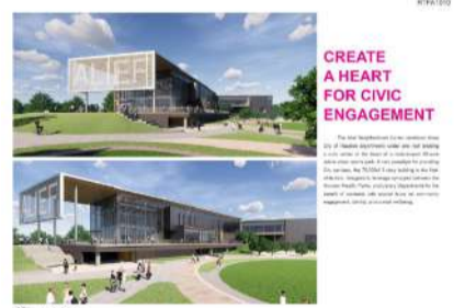
CREATE A HEART FOR CIVIC ENGAGEMENT