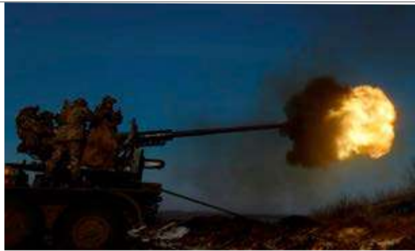
Ukrainian members of the military fire an anti-aircraft weapon, as Russia's attack on Ukraine continues, in the front-line city of Bakhmut, Ukraine.