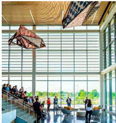
The main entry at Alief Neighborhood Center features bleacher seating, expansive views of the park, and artwork from the Red Thread Collective.