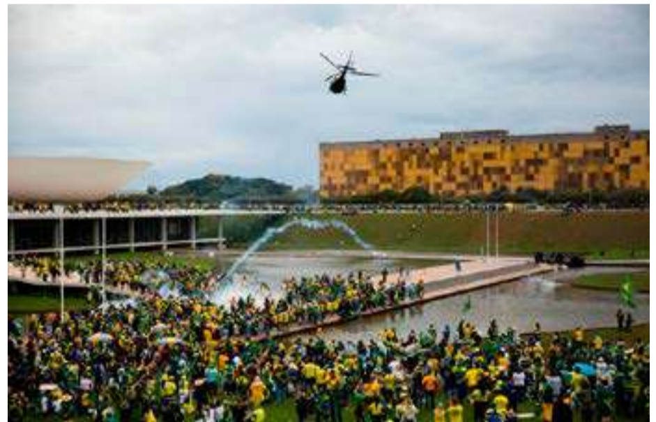
Supporters of Brazil's former President Jair Bolsonaro demonstrate against President Luiz Inacio Lula da Silva, in Brasilia, Brazil.