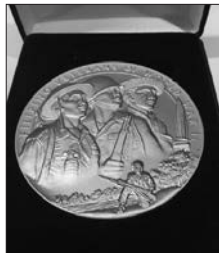
A day of vindication -- the U.S. correcting a wrong as Senator Paul Ryan said. The congressional gold medal is for ALL Filipino soldiers who fought with the US in WWII.

The program has been the subject of widespread complaints, though, since many of the former Filipino service members lack the paperwork to secure the one-time payments.