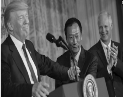
President Trump announced Foxconn is opening a new factory in Wisconsin, a $10 billion investment for the company. The Trump administration said the Apple supplier will create thousands of manufacturing jobs in the area. Foxconn Chairman Terry Gou (center) shakes hands with President Donald Trump during the White House event.

On Monday, Gov. Scott Walker approved $3 billion in incentives for the Taiwanese electronics manufacturer to build a new plant in the state. The hefty gift, which was first announced in July, was hotly debated by state legislators before they gave their approval last week. “We are honored Foxconn chose Wisconsin, and I’m grateful to [Foxconn CEO] Terry Gou and the members of both parties in the Legislature for all they have done to make this historic event a reality,” Walker, a Republican, said in a statement. Foxconn has pledged to invest $10 billion to build a factory that makes LCD screens. The facility is expected to create between 3,000 and 13,000 new jobs and should be up and running by 2020. The deal has been touted by President