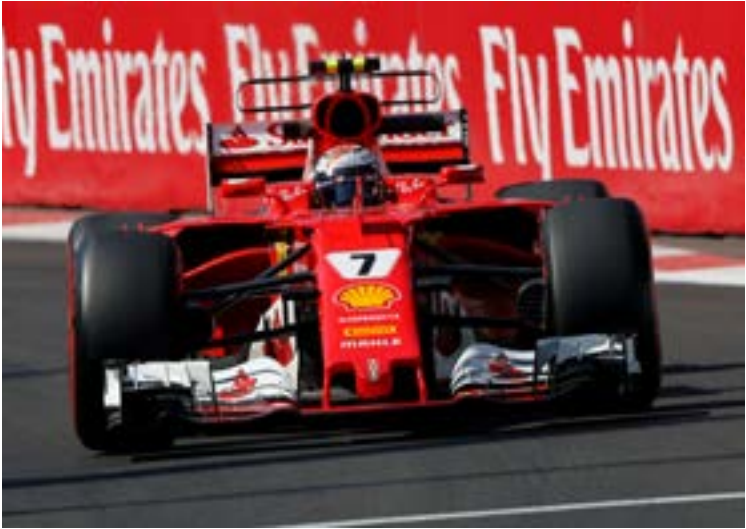
Formula One F1 - Mexican F1 Grand Prix 2017 - Mexico City, Mexico