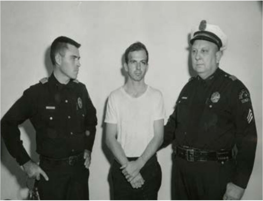
Dallas Police Department archive image shows accused Kennedy assassin Oswald standing with Dallas Police officers