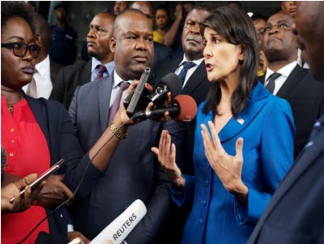
U.S. Ambassador to the United Nations Nikki Haley and President of Congo’s electoral commission Corneille Nangaa addresses the media at the CENI headquarters in Gombe, Kinshasa