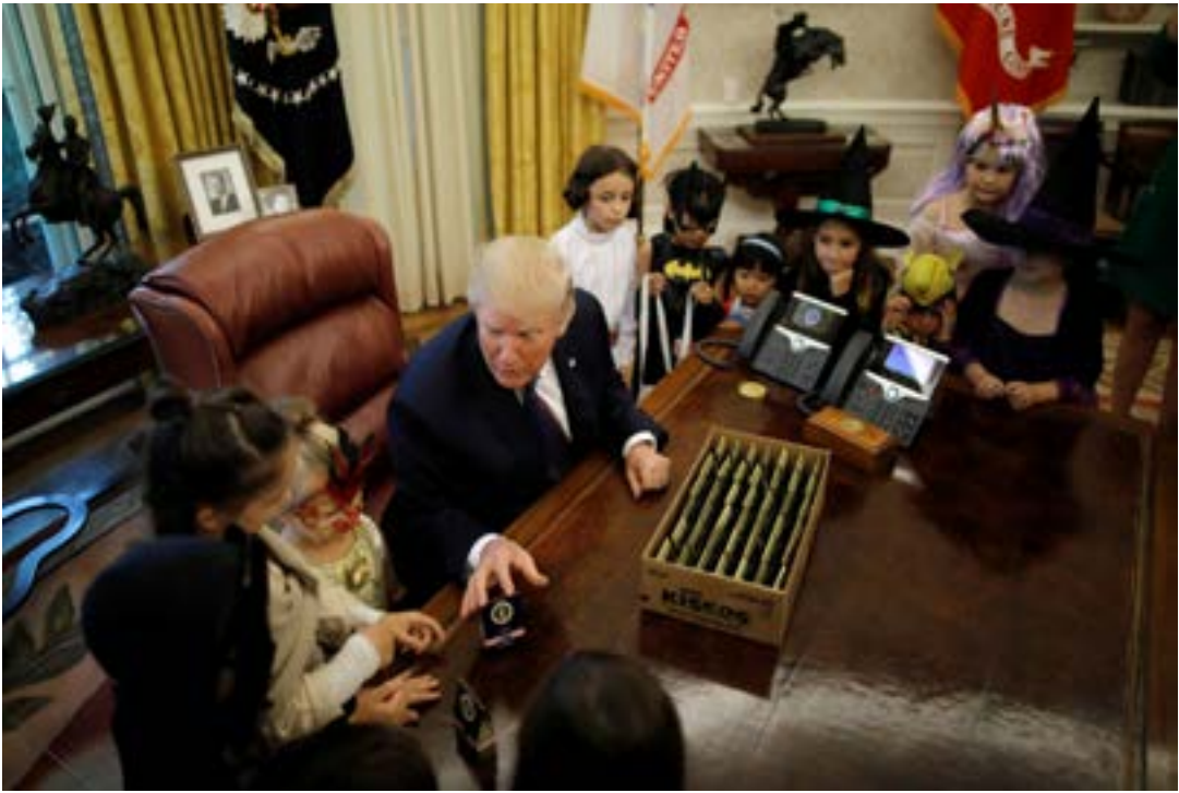
U.S. President Donald Trump gives out Halloween treats to children of members of press and White House staff at the Oval Office of the White House in Washington, U.S.