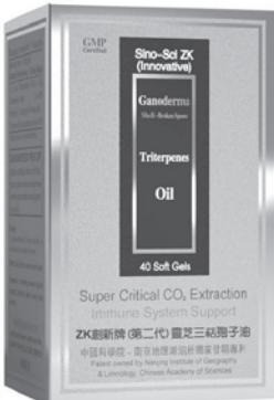
40粒軟膠囊 / 每瓶 $399 1粒 = 60粒靈芝膠囊精華