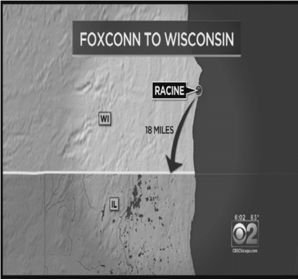
iPhone-maker Foxconn to open Wisconsin plant expected to create as many as 13,000 jobs - Chicago Tribune