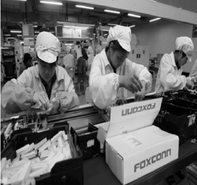
Workers at a Foxconn plant in China assemble orders.

Michigan Governor Snyder on Thursday: “You have to ask what price is Wisconsin paying to get them to come there?”, adding: “I don’t believe in buying companies into our states.”