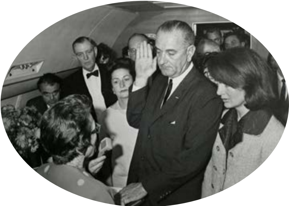
U.S. Vice President Lyndon Baines Johnson (C) takes the presidential oath of office from Judge Sarah T. Hughes (2nd from L) as President John F. Kennedy’s widow first lady Jacqueline Bouvier Kennedy (2nd from R) stands at his side aboard Air Force One at Love Field in Dallas, Texas just two hours after Kennedy was shot in this November 22, 1963 photo.