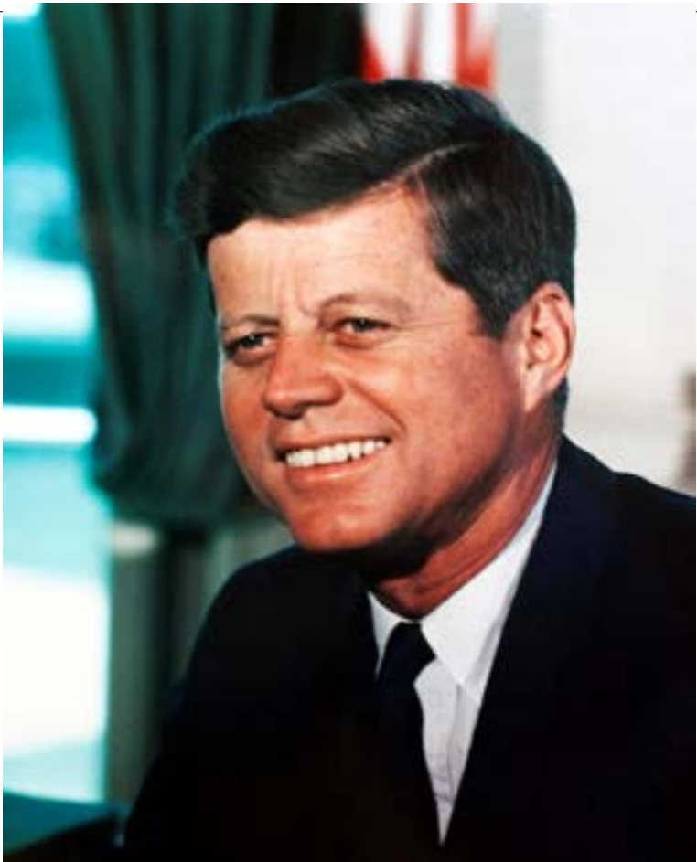
President John F. Kennedy working in the Oval Office in the White House