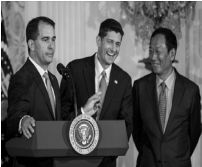
Wisconsin Gov. Scott Walker, left, speaks while at the podium with House Speaker Paul Ryan (center) and Terry Gou, chairman of Foxconn (right).

On Monday, Gov. Scott Walker approved $3 billion in incentives for the Taiwanese electronics manufacturer to build a new plant in the state. The hefty gift, which was first announced in July, was hotly debated by state legislators before they gave their approval last week. “We are honored Foxconn chose Wisconsin, and I’m grateful to [Foxconn CEO] Terry Gou and the members of both parties in the Legislature for all they have done to make this historic event a reality,” Walker, a Republican, said in a statement. Foxconn has pledged to invest $10 billion to build a factory that makes LCD screens. The facility is expected to create between 3,000 and 13,000 new jobs and should be up and running by 2020. The deal has been touted by President