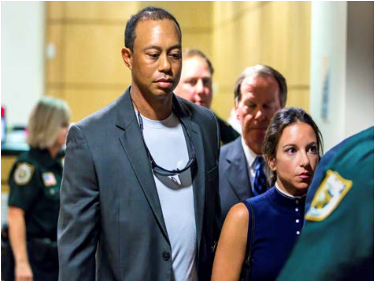
Golfer Tiger Woods leaves court after he pleaded guilty to a charge of reckless driving in connection with his May arrest for driving under the influence, in Palm Beach, Florida, U.S., Friday, October 27, 2017.