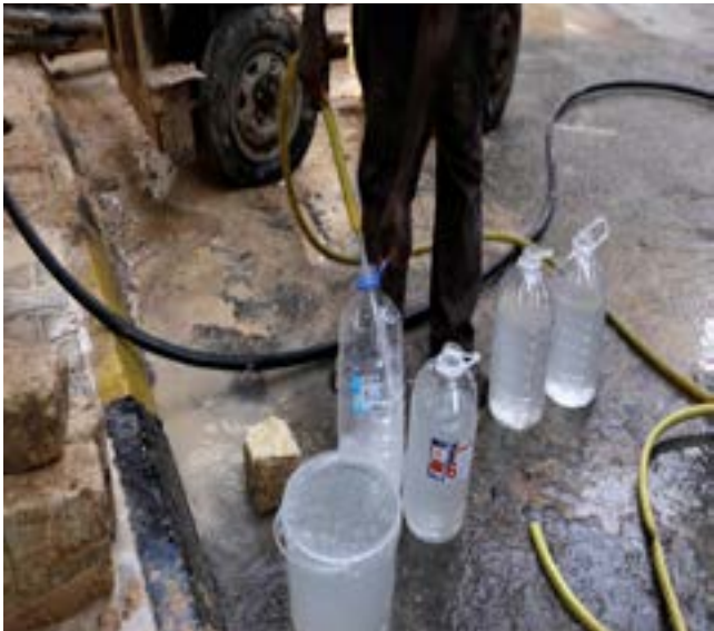
A man fills bottles and a bucket with water in Tripoli, Libya October 26, 2017. Picture taken October 26, 2017.