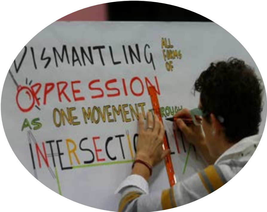
Graphic recorder Steinberg creates drawing during Women's Convention at Cobo Center in Detroit