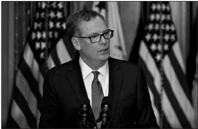
U.S. Trade Representative Robert Lighthizer

U.S. Trade Representative Robert Lighthizer said a month later that China posed an unprecedented threat to the world trading system. "The sheer scale of their coordinated effort to develop their economy, to subsidize, to create national champions, to force technology transfers and to distort markets in China and throughout the world is a threat to the world trading system that is unprecedented," Mr. Lighthizer said in a speech. The intelligence official also said Chinese President Xi Jinping is rapidly consolidating power and is focused on positioning key allies and avoiding any political disruptions before the Communist Party conference later this month. Mr. Xi will begin his second term as supreme leader after the party congress. "Beijing is increasing control of domestic dissent to project unity before the congress," the official said.