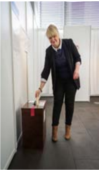
Aevarsdottir of Iceland's Pirate Party casts her vote during a snap parliamentary election in Reykjavik