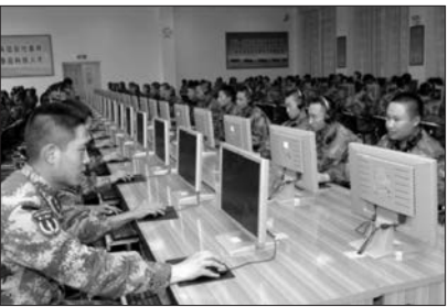
China can develop escalation options of its own, including [anti-satellite weapons] and offensive cyberwar capabilities.

systems, including commercial shipping and military logistics.