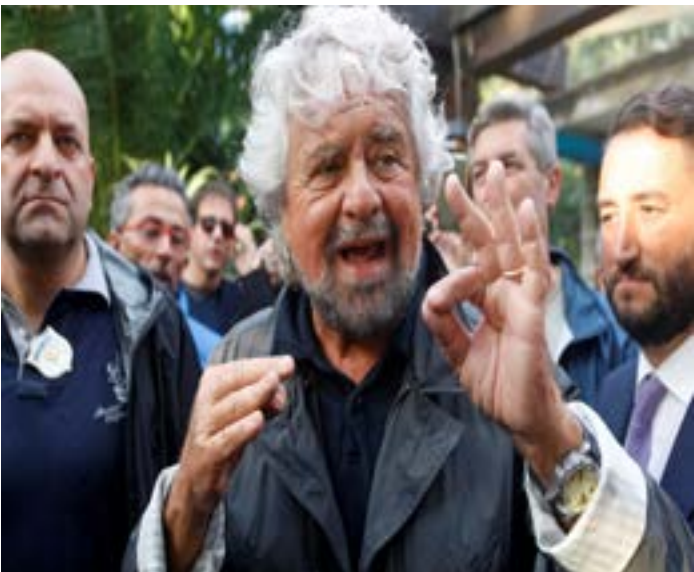
5-Star movement founder Beppe Grillo speaks during a rally for the regional election in the Sicilian village of Acitrezza near Catania