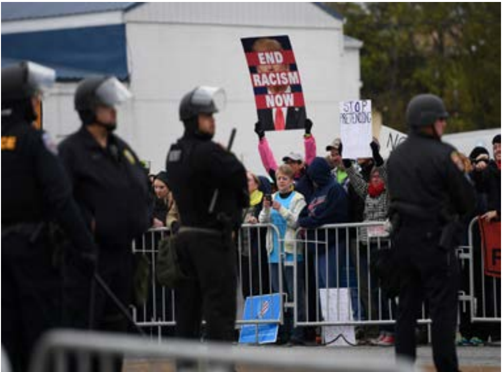
Counter protesters line the street across from a White Lives Matter rally in Shelbyville