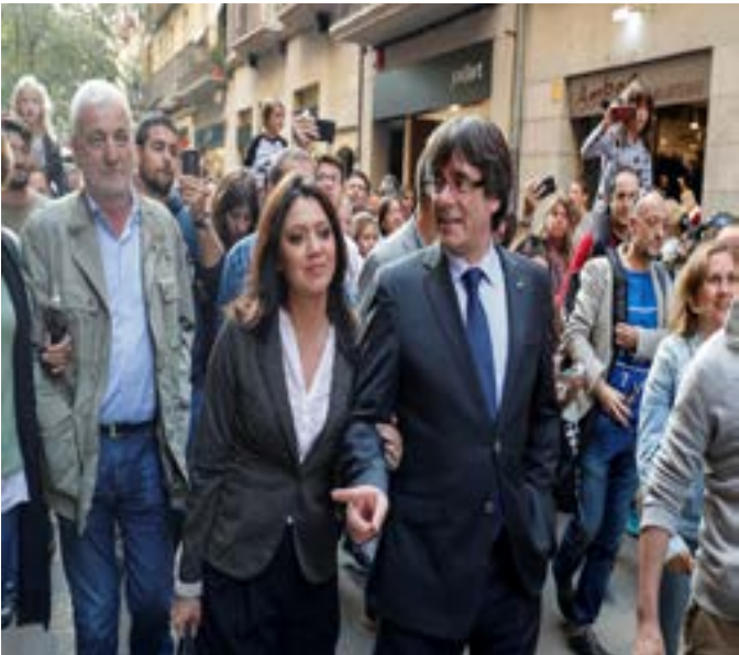
Sacked Catalan President Carles Puigdemont walks with his wife Marcela Topor after leaving a restaurant the day after the Catalan regional parliament declared independence from Spain in Girona