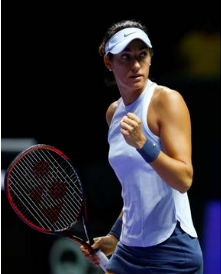
Tennis - WTA Tour Finals - Singapore Indoor Stadium, Singapore - October 28, 2017 France's Caroline Garcia celebrates during her semi final-match against USA's Venus Williams