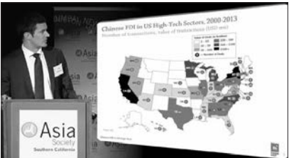
High-Tech Surge: Investing in America and Innovation - Report Findings - YouTube

The report identifies several flashpoints that could trigger a U.S.-Chinese conflict, including the Korean Peninsula, Taiwan, Japan and the South China Sea. The report also warns that a cyberwar between the two countries could erupt.