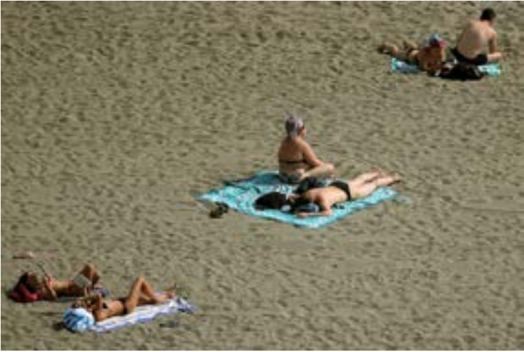
People enjoy the beach on a warm fall day during a long weekend at the Malagueta beach in Malaga