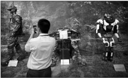
Robotic military technology was displayed at an exhibition highlighting China's achievements under five years of leadership by President Xi Jinping. The exhibition at the Beijing Exhibition Hall opened in September ahead of a Communist Party congress this month.

China has stepped up efforts to work with American businesses in a bid to acquire advanced technology, part of a drive to become a leading technology-innovation power. "China is pushing to further deepen technology collaboration with U.S. business and academic institutions as part of a national effort to transform its economy, including by putting China at the leading edge of global technological innovation," said a U.S. intelligence official who provided a recent assessment of China. "At the same time, Beijing is trying to downplay concerns that this state-led technology acquisition drive creates an unlevel playing field, forces technology transfers to China, limits foreign companies' access to the Chinese market and is a threat to U.S. and other companies economic strengths," the official added. The intelligence assessment of Chinese technology acquisition comes as the Trump administration is cracking down on Beijing's efforts to further steal U.S. technology. In August, President Trump ordered an investigation into Chinese theft of American intellectual property.