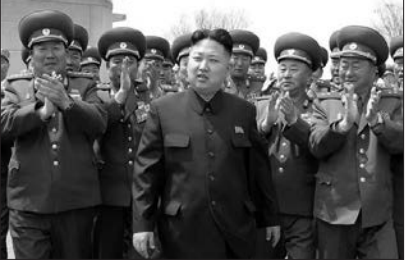
North Korean leader Kim Jung Un

yang regime. Under Kim Jong-un, North Korea has rapidly expanded its nuclear and missile programs. Its increasingly provocative tests "have increased the potential for a spiral of unintended escalation into conflict on the peninsula or even a pre-emptive American strike on North Korean nuclear assets," according to Rand. A new conflict on the peninsula would involve U.S. and South Korean efforts to push North Korea's military northward and out of artillery range of Seoul. "The further U.S. or South Korean forces advance beyond that point, the more likely a Chinese intervention," the report says. The report does not see the collapse of the North Korean regime as likely.