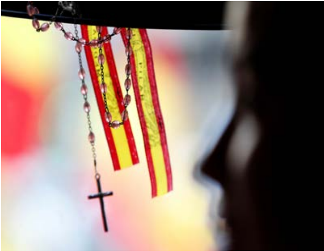
Ribbons in the colours of the Spanish and Catalanian flags and a rosary hang from a car's rear-view mirror in Barcelona