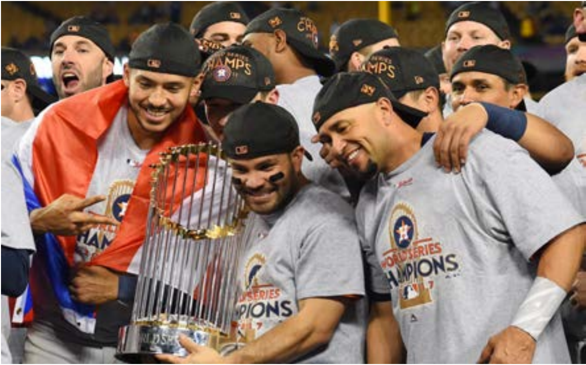
Houston Astros second baseman Jose Altuve (center) celebrates with teammates with the Commissioner's Trophy after defeating the Los Angeles Dodg- ers in game seven of the 2017 World Series at Dodger Stadium.