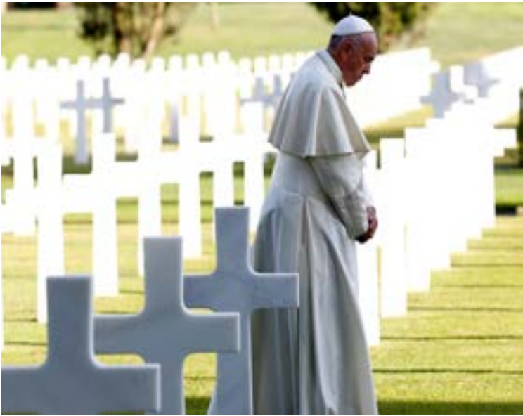
Pope Francis prays before a Mass at the U.S. World War II cemetery, in Nettuno