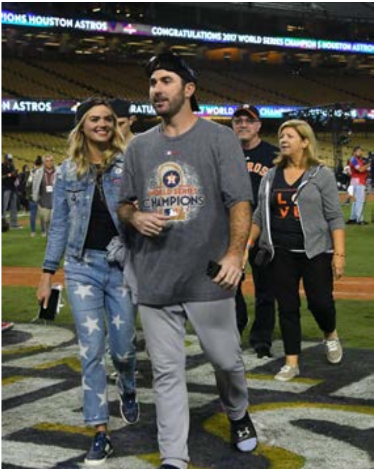
Nov 1, 2017; Los Angeles, CA, USA; Houston Astros pitcher Justin Verlander (right) walks off the field with Kate Upton after game seven of the 2017 World Series against the Los Angeles Dodgers at Dodger Stadium.