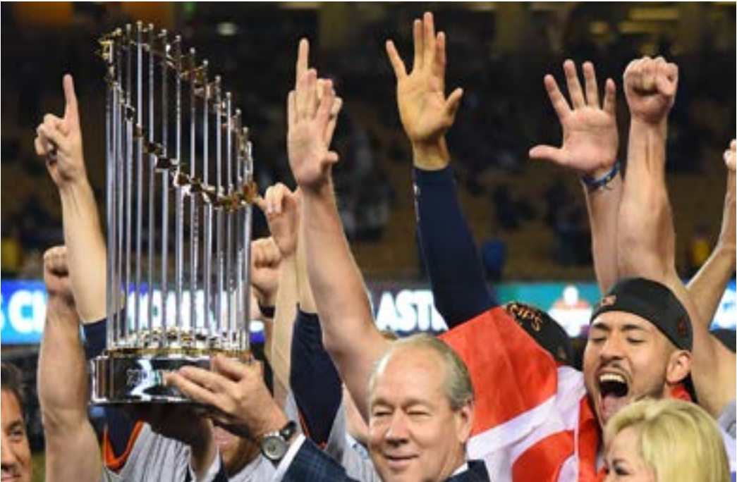
Nov 1, 2017; Los Angeles, CA, USA; Houston Astros owner Jim Crane hoists the Commissioner's Trophy after defeating the Los Angeles Dodgers in game seven of the 2017 World Series at Dodger Stadium.