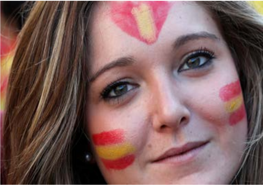
A pro-unity supporter takes part in a demonstration in central Barcelona, Spain, October 29, 2017.