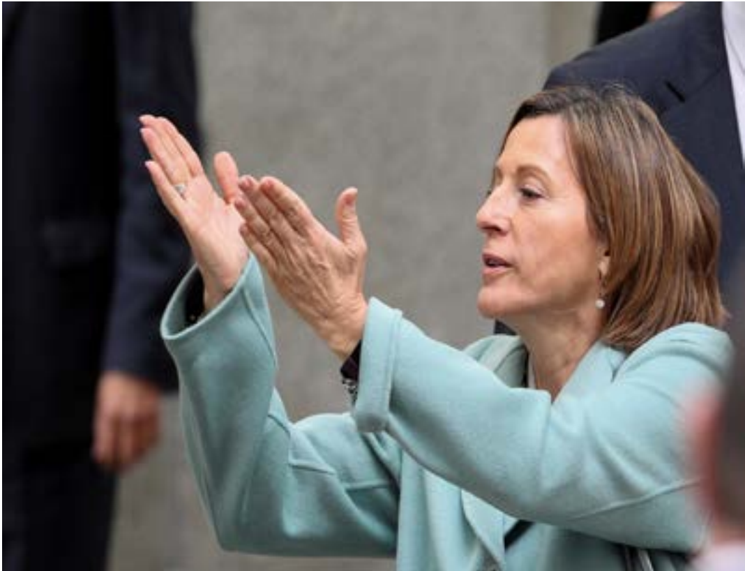
Speaker of Catalan parliament Carme Forcadell gestures as she leaves Spain's Supreme Court after being summoned to testify on charges of rebellion, sedition and misuse of public funds in Madrid