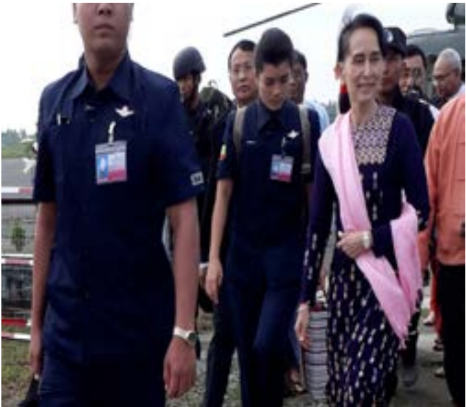
Myanmar's de facto leader Aung San Suu Kyi arrives at Sittwe airport in the state of RakhineKras-noyarsk