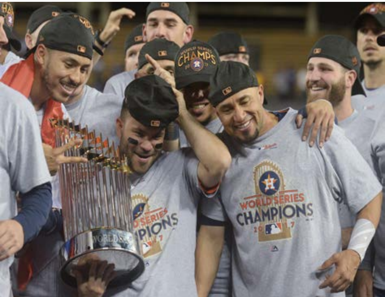
Nov 1, 2017; Los Angeles, CA, USA; Houston Astros second baseman Jose Altuve celebrates with teammates with the Commissioner's Trophy after defeating the Los Angeles Dodgers in game seven of the 2017 World Series at Dodger Stadium.