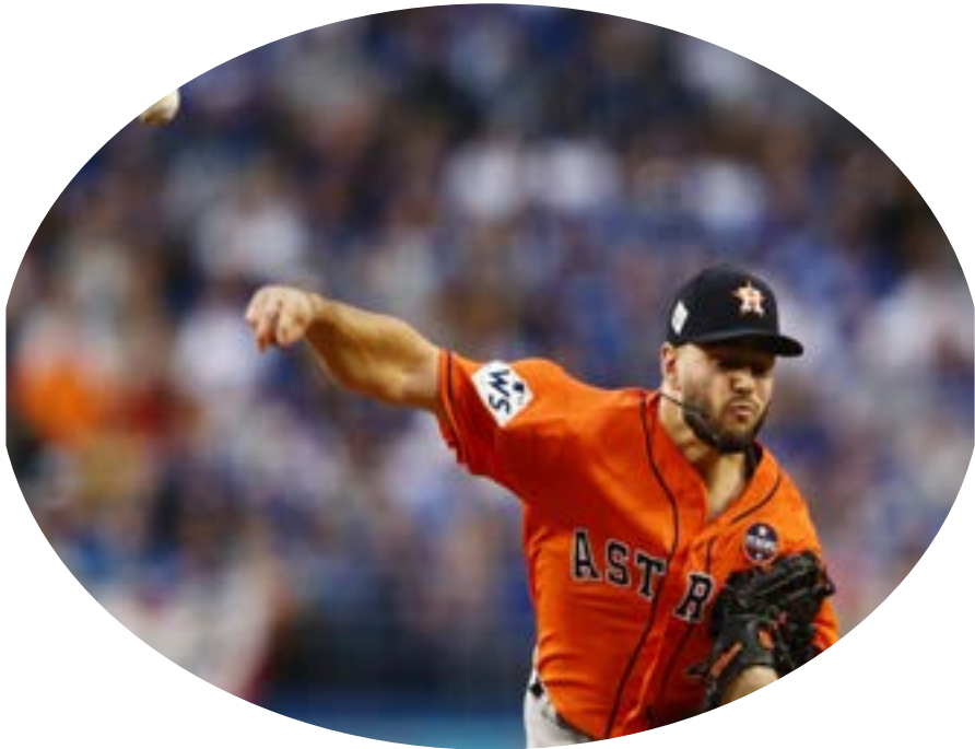
Nov 1, 2017; Los Angeles, CA, USA; Houston Astros starting pitcher Lance McCullers Jr. throws a pitch against the Los Angeles Dodgers in the first inning in game seven of the 2017 World Series at Dodger Stadium.