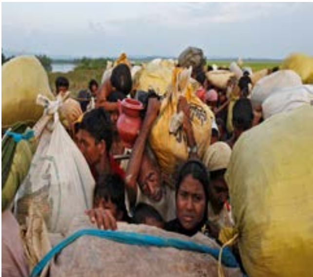
Rohingya refugees carry their belongings as they make their way to a refugee camp after crossing the Naf River at the Bangladesh-Myanmar border in Palang Khali, near Cox's Bazar