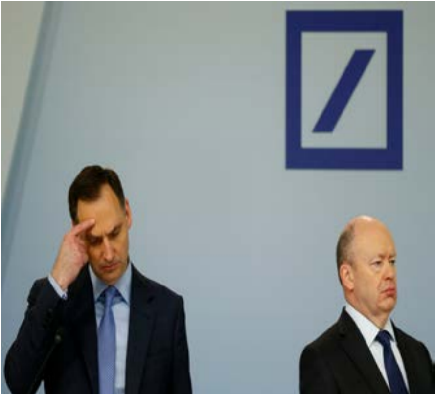
Deutsche Bank CEO John Cryan and James von Moltke during the bank’s annual news conference in Frankfurt, Germany, February 2, 2018.