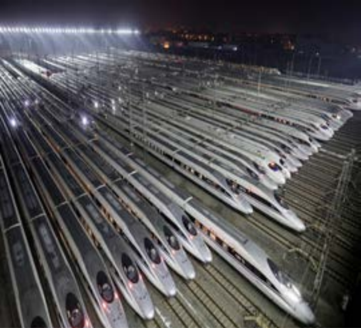
China Railway High-speed Harmony bullet trains are seen at a high-speed train maintenance base, as the Spring Festival travel rush begins, in Wuhan