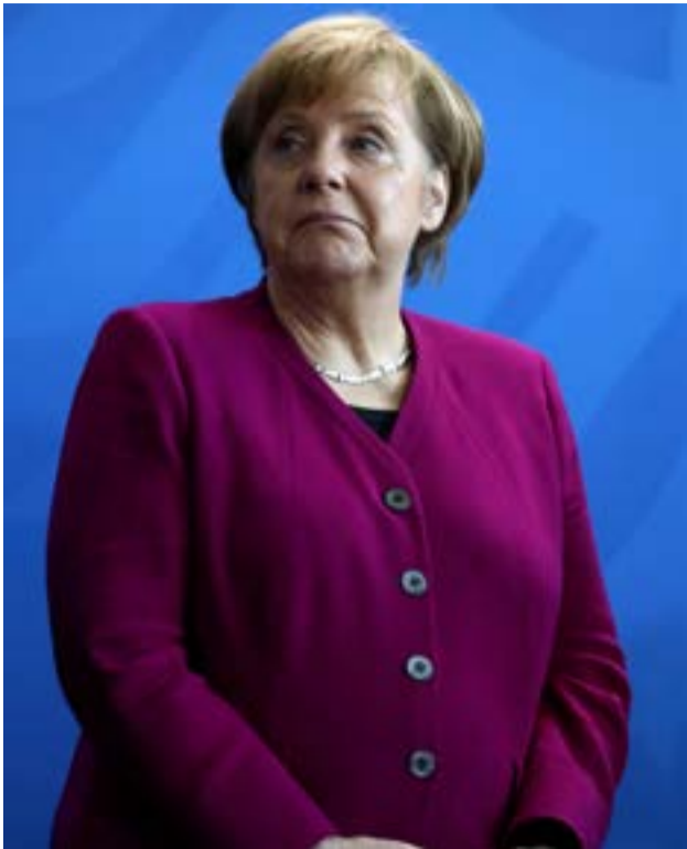
Presentation of a new 2 Euro commemorative coin which bears former German Chancellor Schmidt