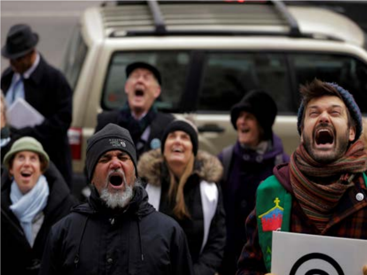
Immigration activist Ravi Ragbir leads a protest outside of a federal building in New York