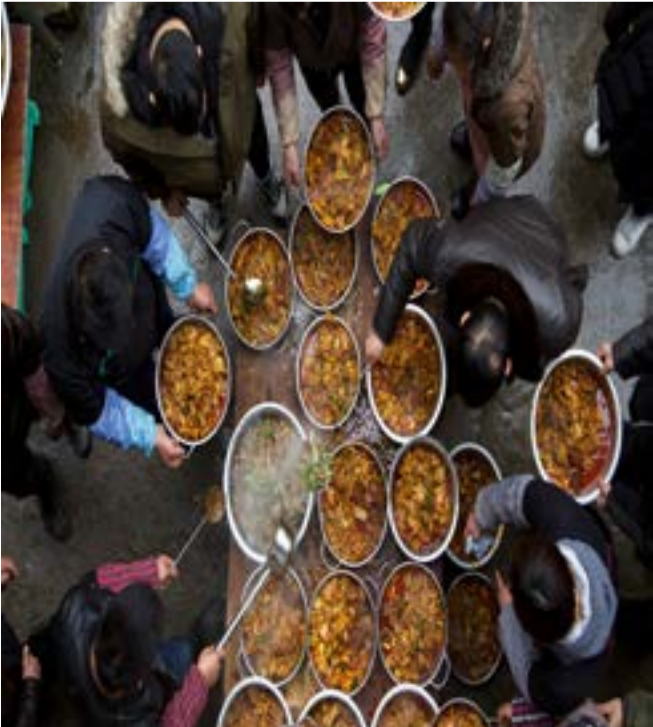
Villagers prepare a meal after slaughtering pigs, during a celebration ahead of the Lunar Chinese New Year, in Anshun