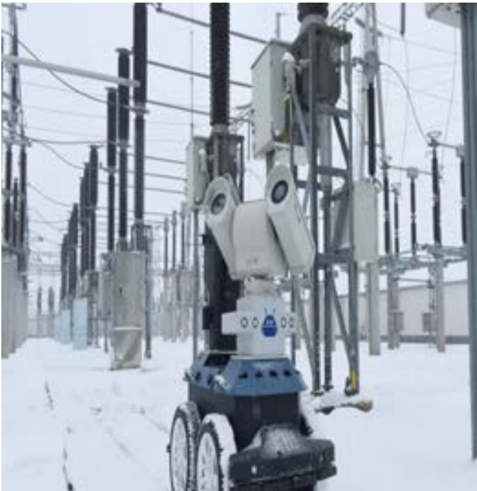
Robot inspects power equipment at an electrical substation in Chuzhou