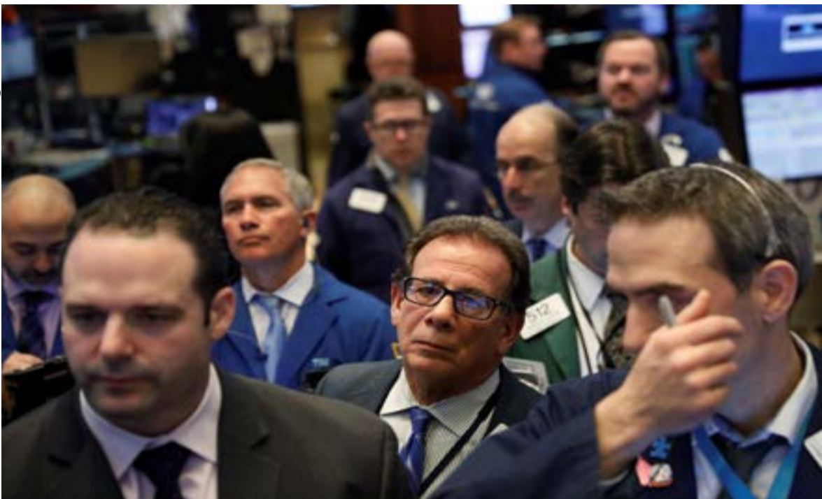
Traders work on the floor of the New York Stock Exchange shortly after the opening bell in New York

Declining issues outnumbered advancers on the NYSE by 2,504 to 432. On the Nasdaq, 2,237 issues fell and 672 advanced.