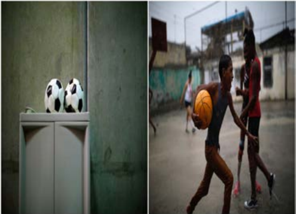
combination picture shows soccer balls inside a cellblock at the U.S. Naval Base in Guantanamo Bay, Cuba, June 3, 2017 (L) and a boy running with a ball during a soccer game in the city of Guantanamo, Cuba, December 6, 2017.