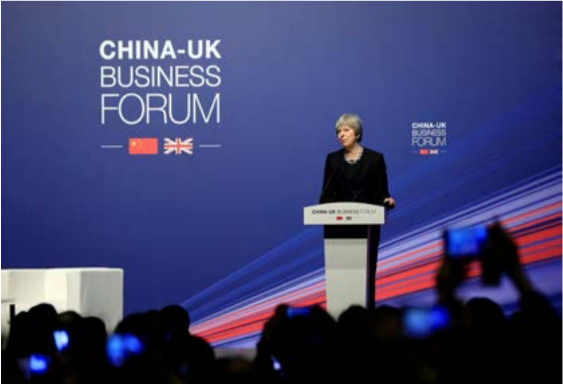
British Prime Minister Theresa May speaks at the China-UK business forum in ShanBritain’s Secretary of State for Exiting the European Union David Davis arrives in Downing Street, London