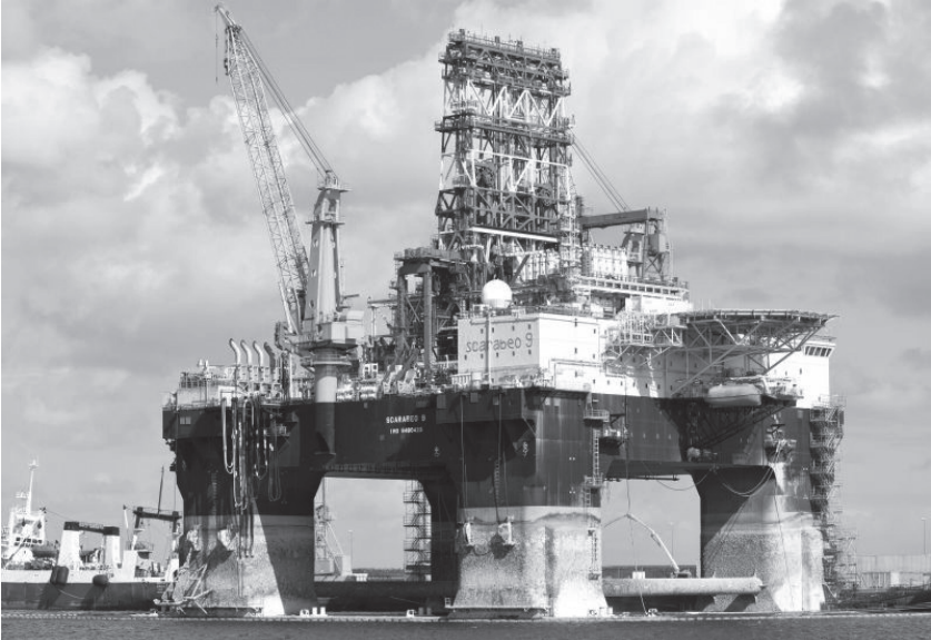
Drilling to Begin Soon in Deep Water Off Cuba. The Scarabeo-9, a big semisubmersible drill rig owned by Italian company ENI, built in China, and currently under contract to the Spanish oil company Repsol, arrived in the Florida Straits off the north coast of Cubato begin exploratory oil drilling in Jan. 25, 2012. It is not known if the drill rig will be used in the current drilling programs in Cuba. It is one of the largest semi-submersible, ultra-deepwater drill rigs ever constructed at a cost of $750 million.