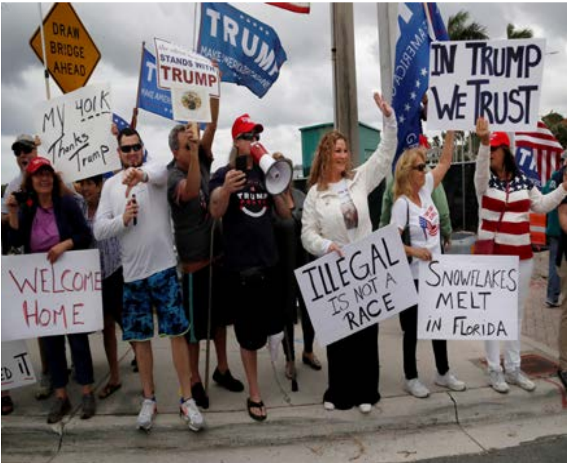
A crowd cheers as U.S. President Donald Trump passes by in his motorcade on his way to his Mar-A-Lago club in Palm Beach