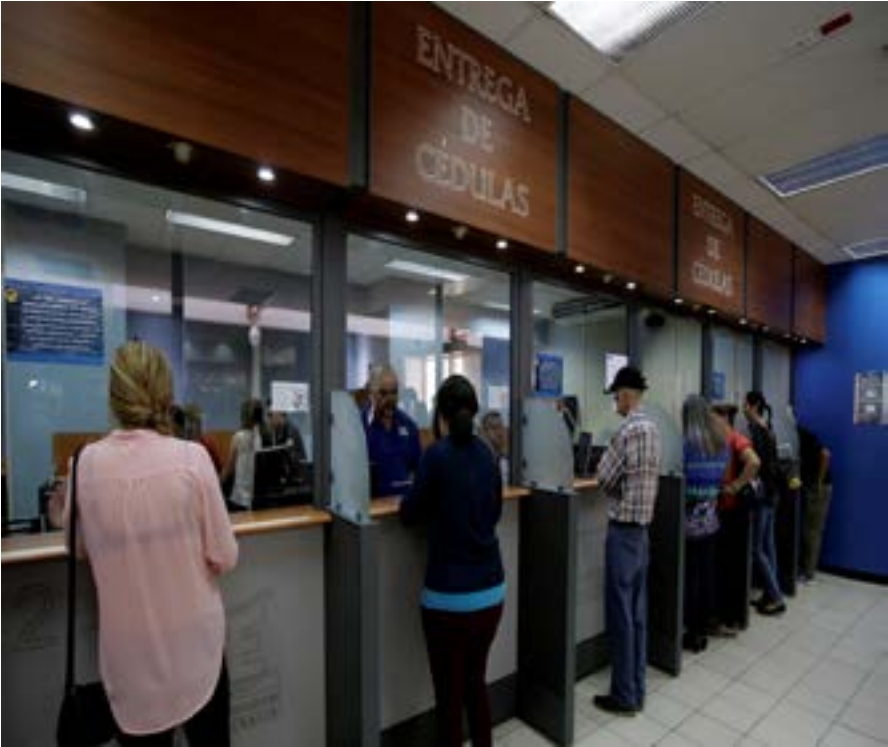
People receive a copy of their identification at the Supreme Electoral Tribunal in order to be able to vote in the presidential election on Sunday in San Jose