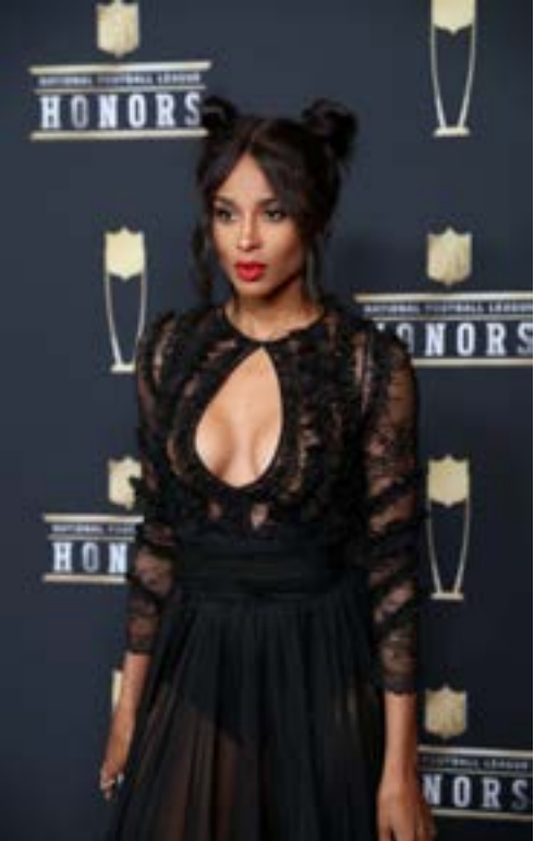
Feb 3, 2018; Minneapolis, MN, USA; Ciara during red carpet arrivals for the NFL Honors show at Cyrus Northrop Memorial Auditorium at the University of Minnesota.