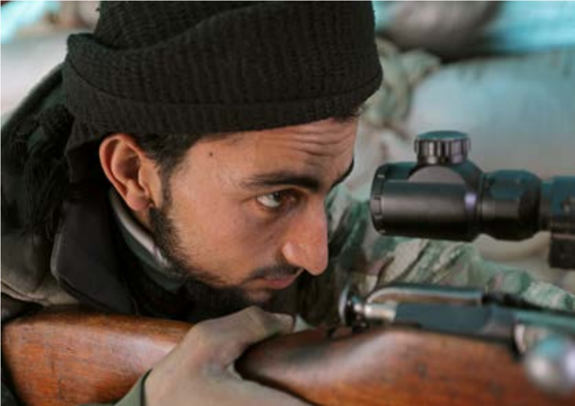
Turkey-backed Free Syrian Army fighter is seen at al Ajami village in east al Bab