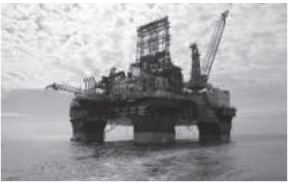
Cuban Oil Work Moves Toward Exploration Phase