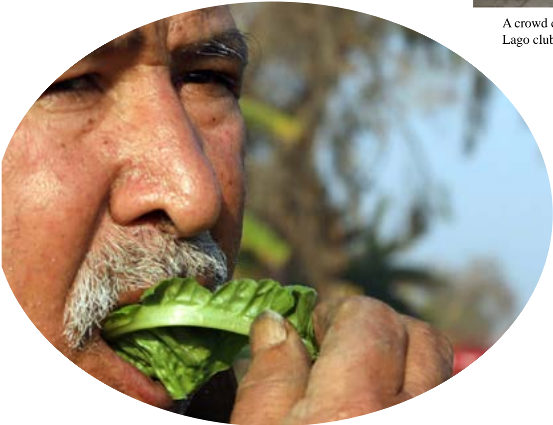
A farmer eats vegetables in a field in the town of El Mansoura in the delta north of Cairo, Egypt February 3, 2018.