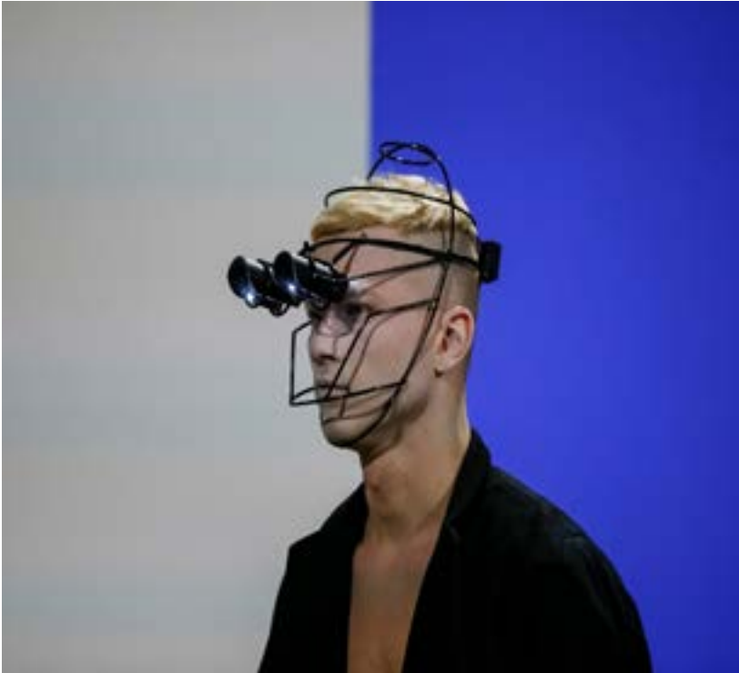
A model presents a creation by Ukrainian brand Dastish Fantastish during Ukrainian Fashion Week in Kiev