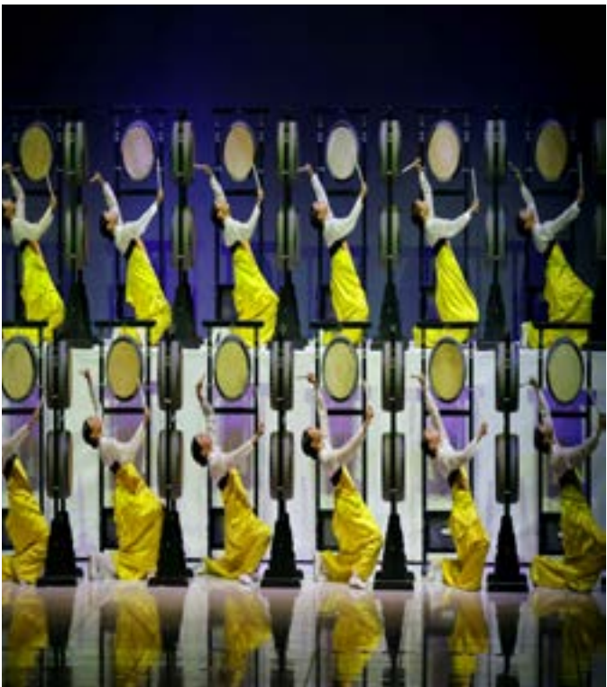
The 132nd IOC Session ahead of the 2018 Winter Olympic Games