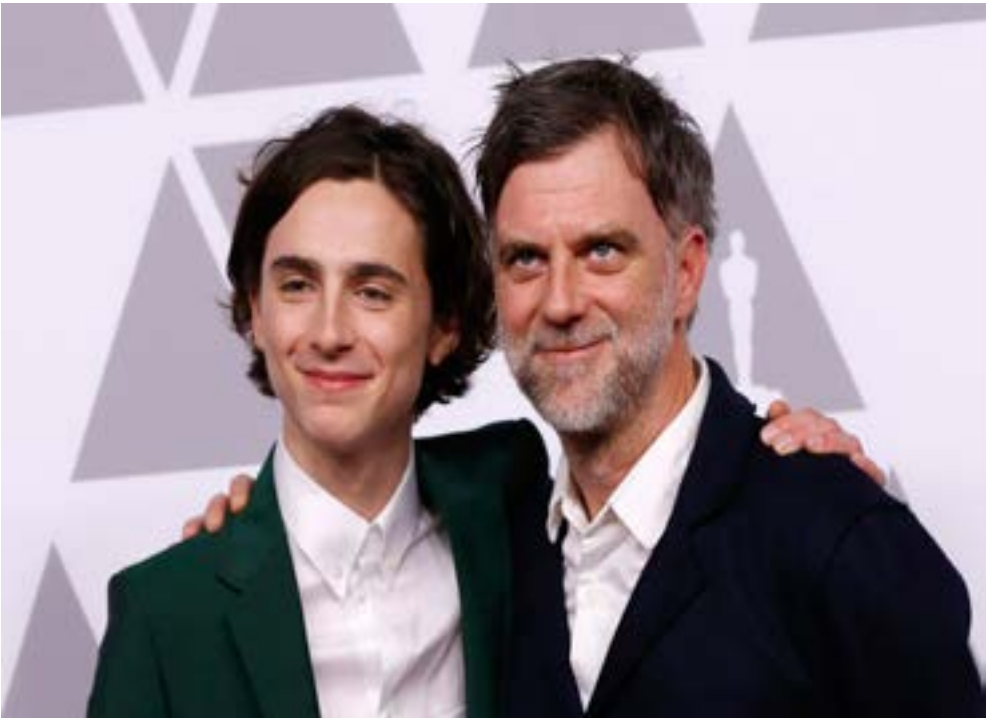
90th Oscars Nominees Luncheon– Arrivals – Los Angeles, California, U.S., 05/02/2018 – Actor Timothee Chalamet (L) and director Paul Thomas Anderson.