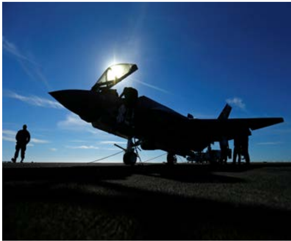
A Lockheed Martin Corp's F-35C Joint Strike Fighter is shown on the deck of the USS Nimitz aircraft carrier