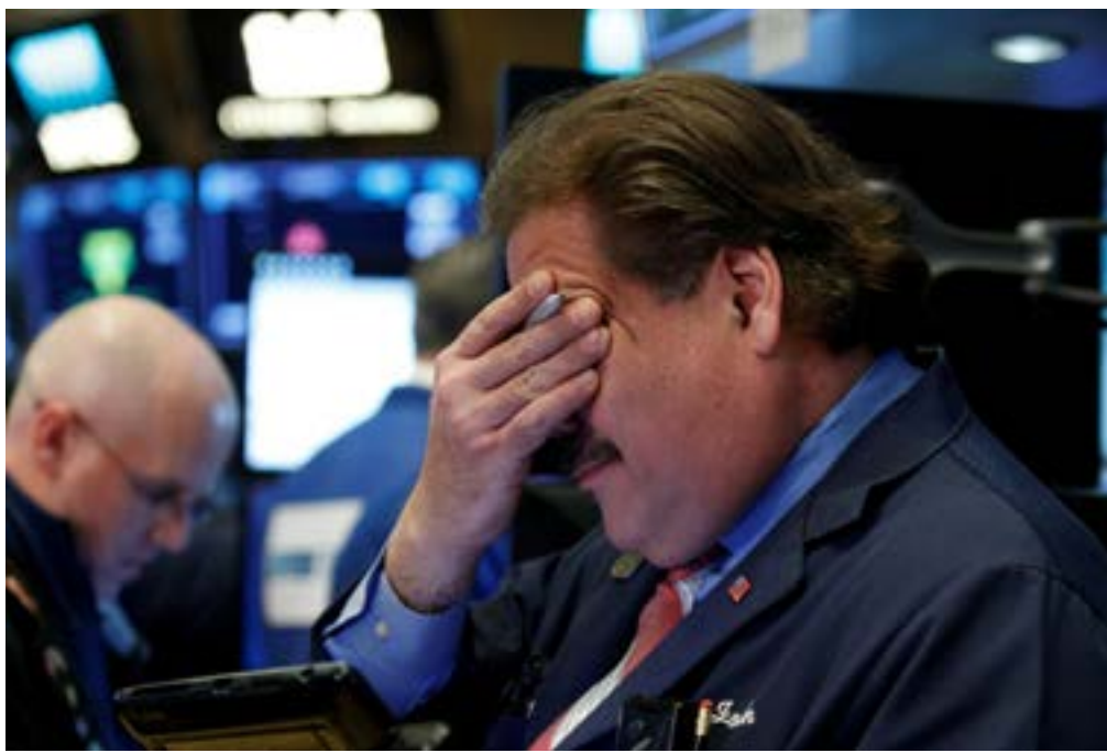
Traders work on the floor of the New York Stock Exchange

Wall Street has been under pressure from rising bond yields, which led to the S&P 500 and the Dow Jones Industrial Average .DJI last week posting their worst weeks since early January 2016 while the Nasdaq Composite .IXIC recorded its worst week since early February 2016. Options trading activity on Monday was strong with about 8.5 million contracts changing hands in the first hour of trade, roughly 1.6 times the usual pace, according to options analytics firm Trade Alert data. By 1 p.m. EST (1800 GMT), overall options trading volume hit 16.5 million, with contracts changing hands at 1.3 times the usual pace, according to Trade Alert. Options on popular hedging vehicles - VIX, SPDR S&P 500 ETF Trust (SPY.P) and S&P 500 Index .SPX - drew notable activity. VIX call options, which profit from a rise in stock market gyrations, were traded at about twice their usual pace. SPY put contracts, which protect against a drop in the S&P 500, changed hands at twice their usual pace. The robust activity was in line with a spike