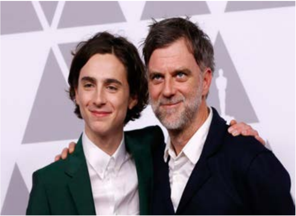
90th Oscars Nominees Luncheon– Arrivals – Los Angeles, California, U.S., 05/02/2018 – Actor Timothee Chalamet (L) and director Paul Thomas Anderson.