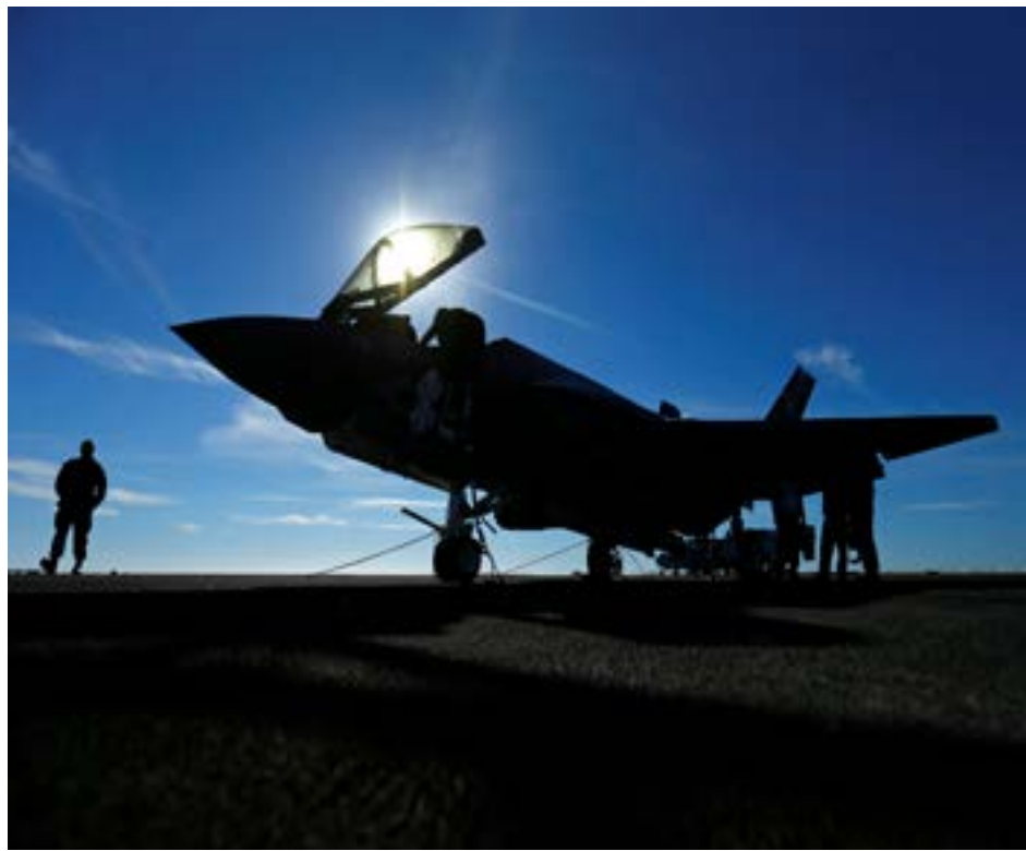
A Lockheed Martin Corp's F-35C Joint Strike Fighter is shown on the deck of the USS Nimitz aircraft carrier