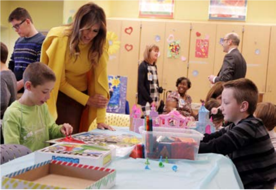
First Lady of the United States Melania Trump plays with a child from Cincinnati Children’s Hospital