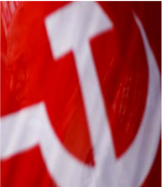
A supporter is seen through the flag of Communist Party of India (Marxist) CPI (M) during a protest against what they say is an anti-people budget, in New Delhi