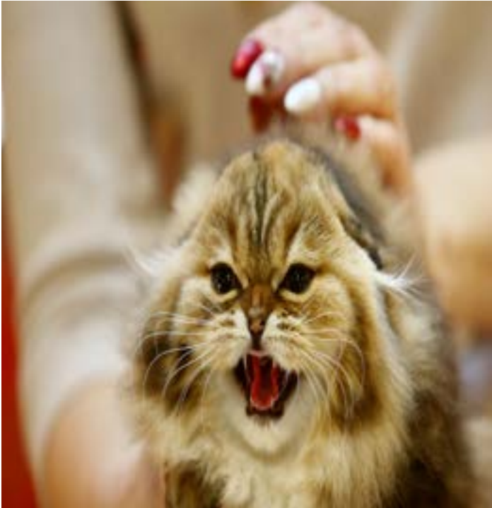
An expert holds a cat during the “World Golden Cat” international exhibition in Minsk, Belarus