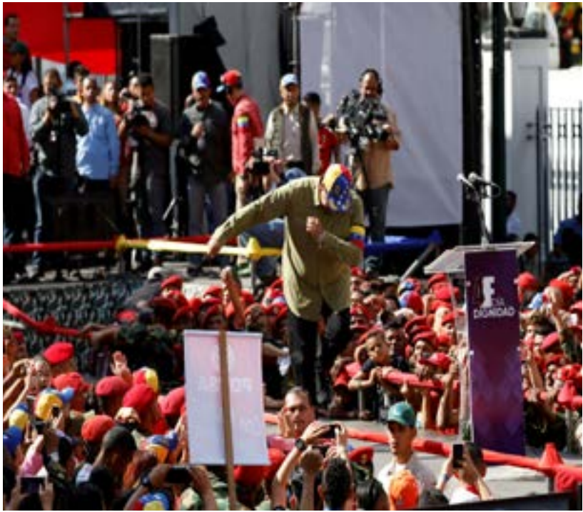
Venezuela’s President Nicolas Maduro dances during a rally to commemorate the 26th anniversary of late Venezuelan President Hugo Chavez failed coup attempt in Caracas