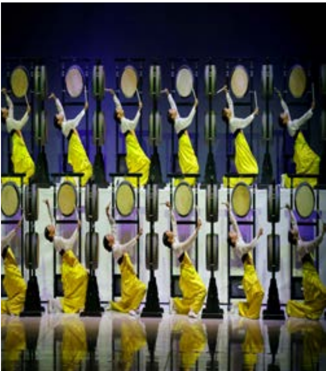
The 132nd IOC Session ahead of the 2018 Winter Olympic Games