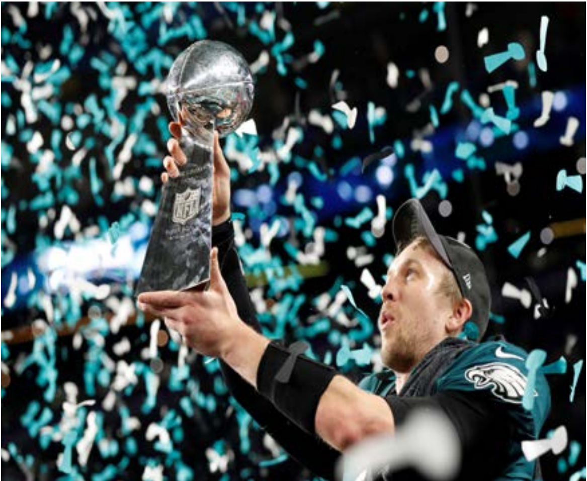
NFL Football - Philadelphia Eagles v New England Patriots - Super Bowl LII - U.S. Bank Stadium, Minneapolis, Minnesota, U.S. - February 4, 2018 Philadelphia Eagles’ Nick Foles celebrates with the Vince Lombardi Trophy after winning Super Bowl LII