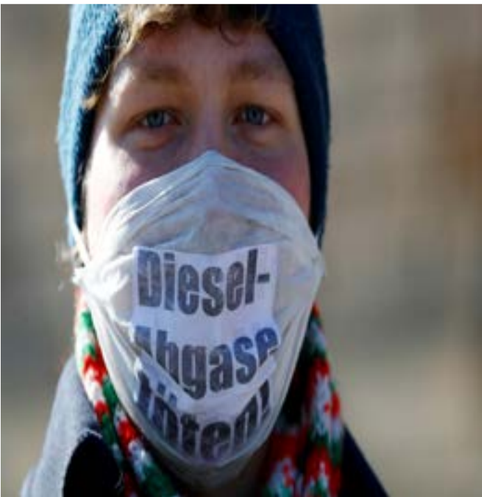
An environmental activist protests in front of Germany’s federal administrative court in Leipzig