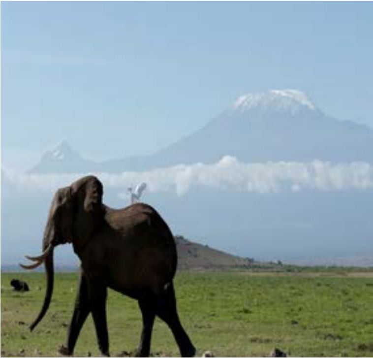
FILE PHOTO: An elephant walks in Amboseli National Park in front of Kilimanjaro Mountain