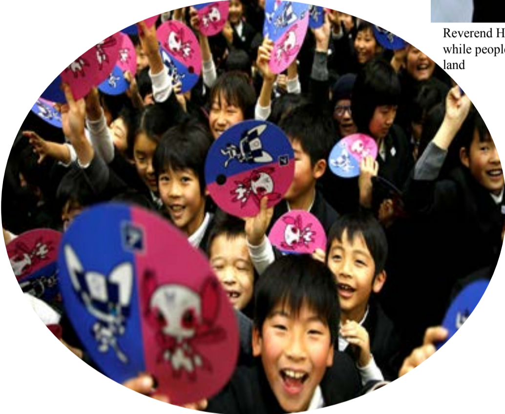
School students hold paper fans featuring the mascot for the Tokyo 2020 Olympics and Paralympics after Tokyo Olympics organizers unveiled the mascots in Tokyo