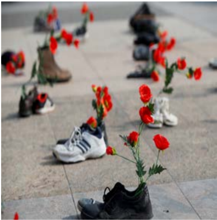
Shoes with flowers are pictured during a demonstration against the speech of Seyyed Ali Reza Avai, Minister of Justice of Iran, at the Human Rights Council, in front of the United Nations in Geneva