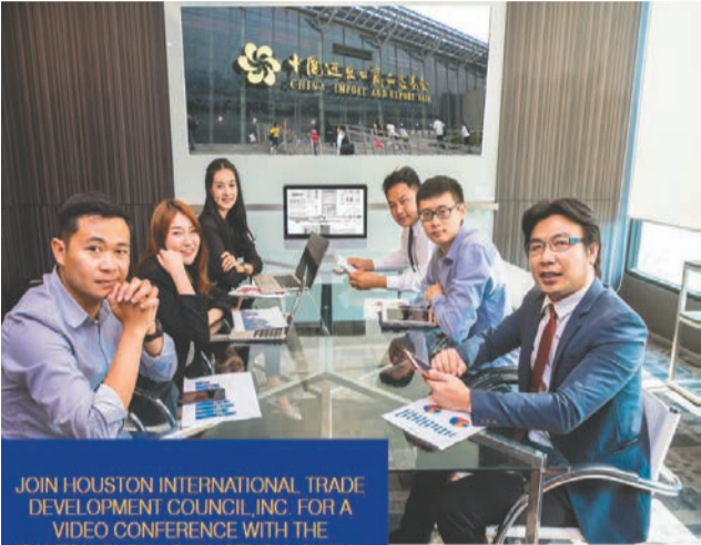
JOIN HOUSTON INTERNATIONAL TRADE DEVELOPMENT COUNCIL, INC. FOR A VIDEO CONFERENCE WITH THE CANTON FAIR IN GUANGZHOU, CHINA!

the 25 members of the Politburo on Saturday, Xi talked about the “important role” of the constitution, according to Xinhua. “No organisation or individual has the power to overstep the constitution or the law,” Xinhua quoted Xi as saying. (Courtesy http://www.scmp.com/news/china )