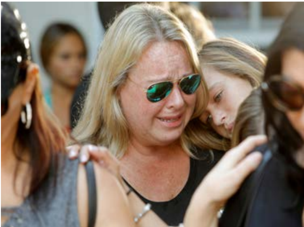
Mourners react during a community prayer vigil at Parkridge Church in Pompano Beach