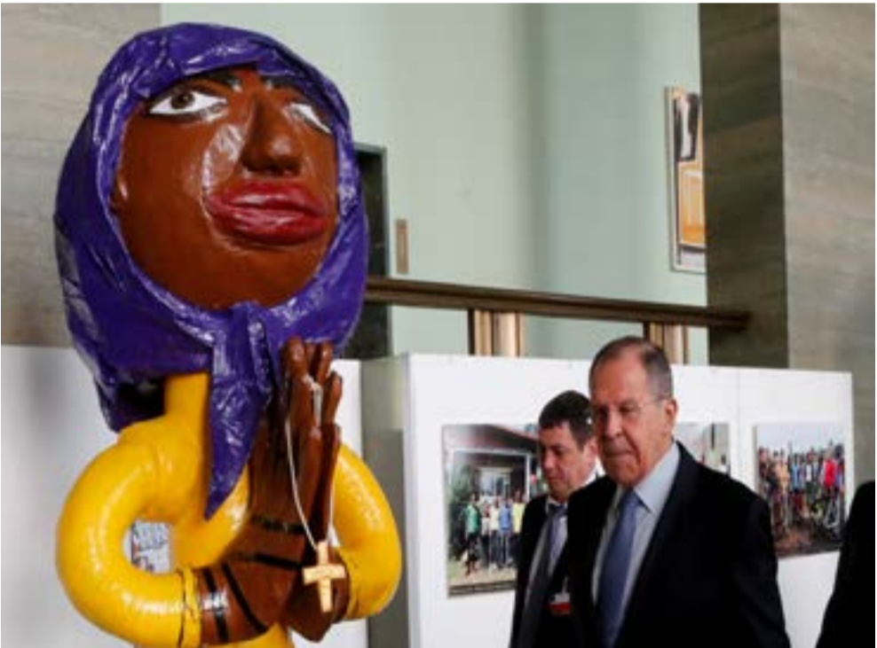
Sergey Lavrov, Minister for Foreign Affairs of Russia, walks past a statue in an exhibition hall outside the Human Rights Council conference hall, at the United Nations in Geneva