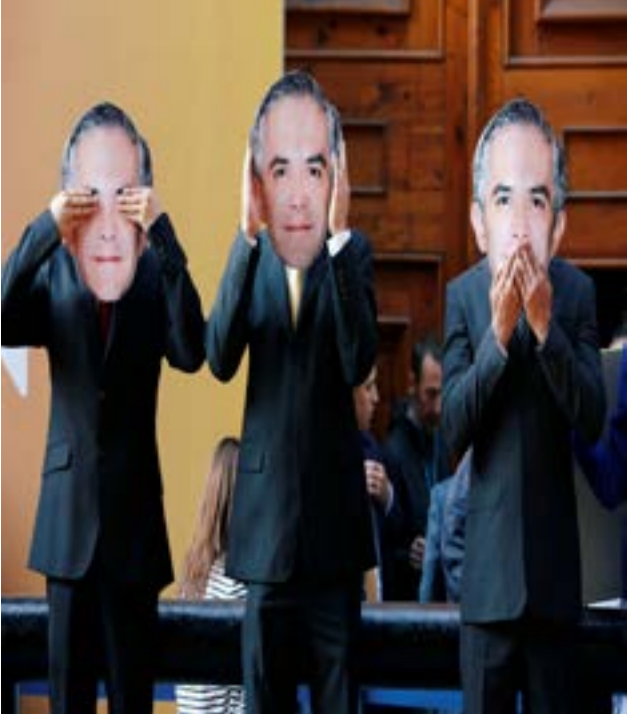
Greenpeace activists gesture while wearing masks of Mexico City’s mayor Mancera during a protest outside the museum holding the Women4Climate conference in Mexico City