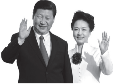
China's president Xi Jinping and his wife, Peng Liyuan

State-owned tabloid Global Times said in an editorial that removing the two-term limit could help maintain the system of the party boss, president and military chief roles being held by the same person. “Over the past two decades, a trinity of leadership consisting of the CPC Central Committee general secretary, president of the nation and chairman of the CPC Central Military Commission has taken shape and proven to be effective,” the editorial said.