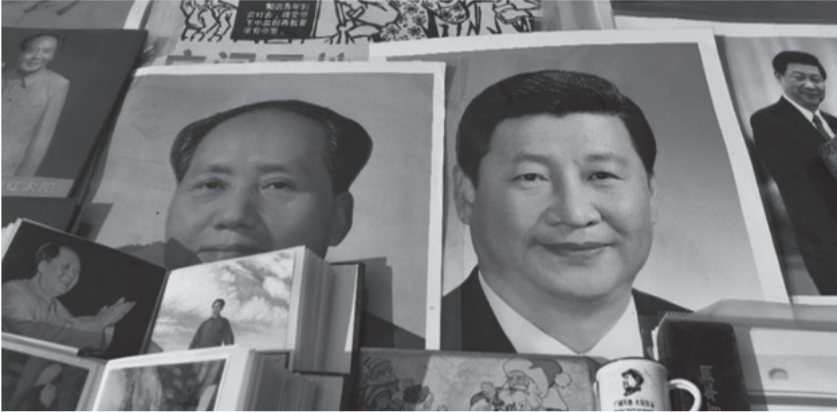
China's revised constitution will pave the way for Xi Jinping to stay on as Chinese president beyond 2023.