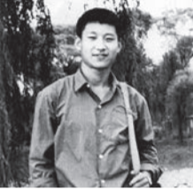
Xi Jinping in 1972