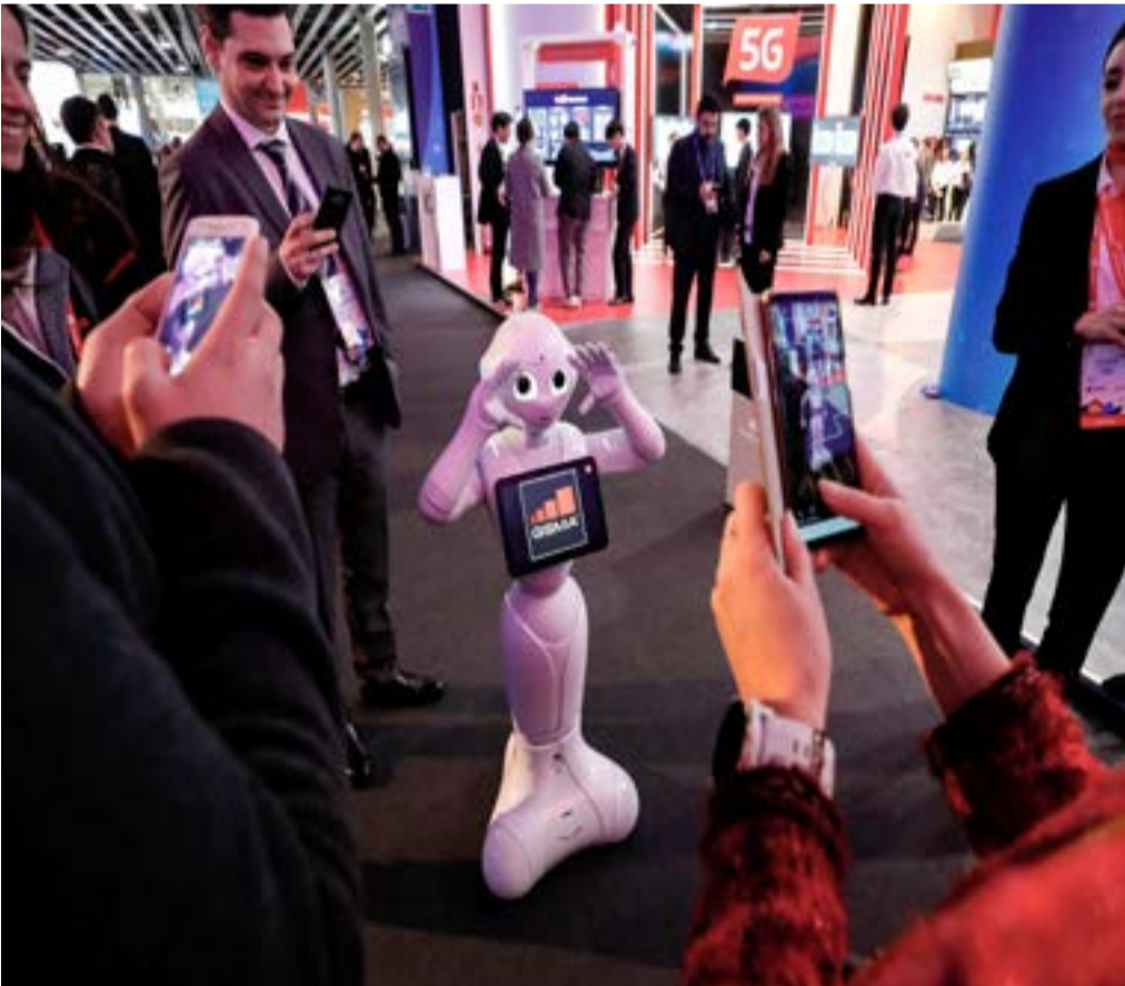
Visitors take photos of the Robot Assistant Pepper by SoftBank Robotics during the Mobile World Congress in Barcelona