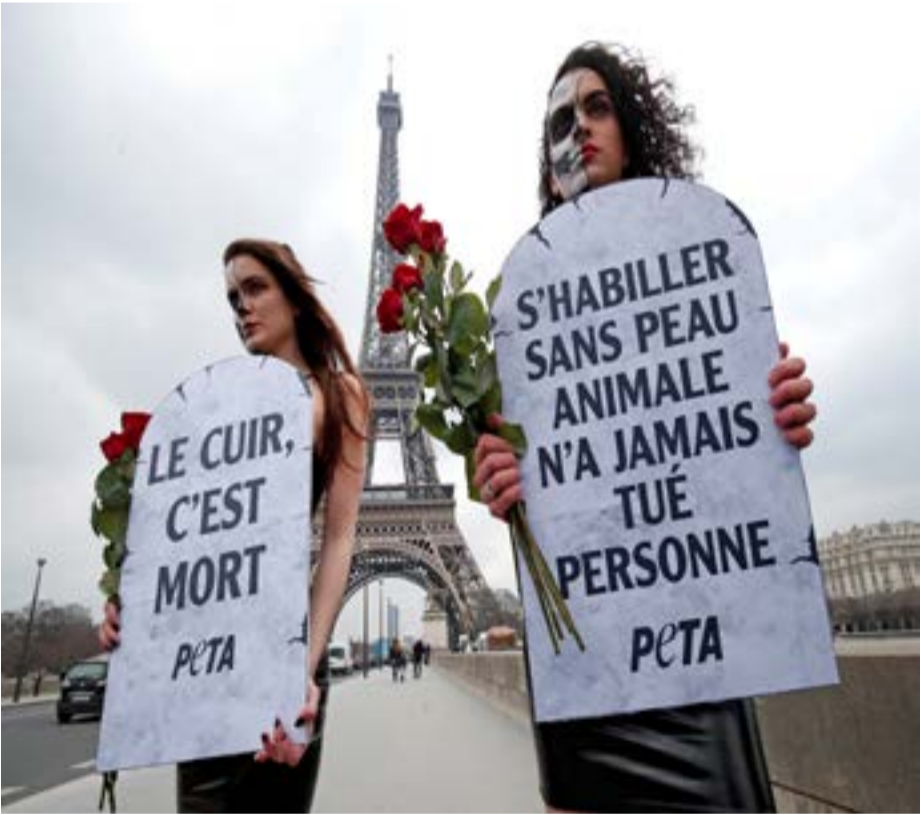
Activists from the People for the Ethical Treatment of Animals (PETA) demonstrate with slogans in protest of the designers continued use of leather in front of the Eiffel Tower during the Paris Fashion Week, in Paris