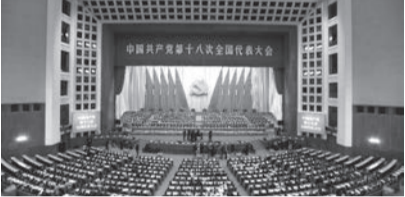
China's Constitution Will Be Revised At The Upcoming Parliamentary Session.

The official news agency said the ruling Communist Party had proposed removing the line that the president and vice-president “shall serve no more than two consecutive terms” from the constitution. Xinhua later released the full 4,480-word proposal in Chinese. The document, which will be considered by the legislature next month, was dated January 26 – a week after the party’s 200-strong Central Committee met to discuss revisions to the constitution. Xinhua did not say why it took a month to release the document to the public. Xi, 64, was re-elected as general secretary of the party in October and is expected to be handed a second term as president by the legislature during its annual full session starting on March 5.