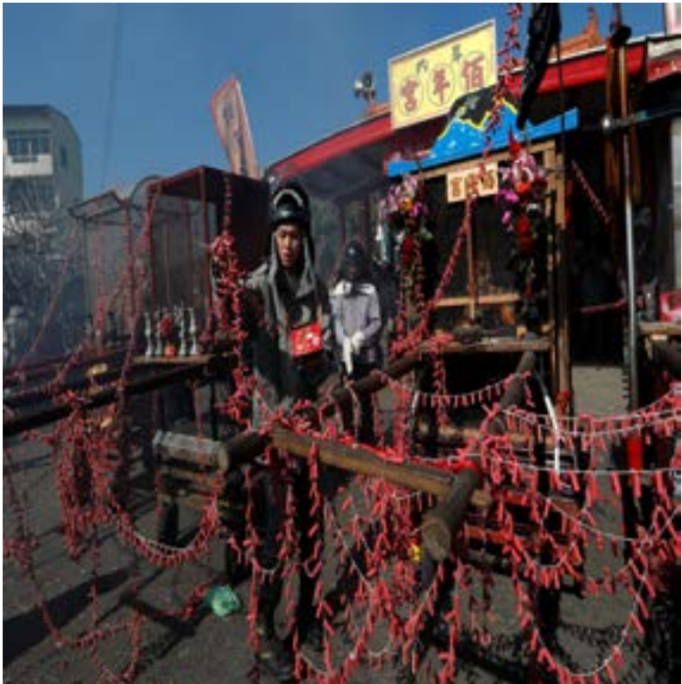
A worshipper put firecrackers on palanquin which would be carrying statues of Guan Gong during ‘Beehive Firecrackers’ festival at the Yanshui district, in Tainan