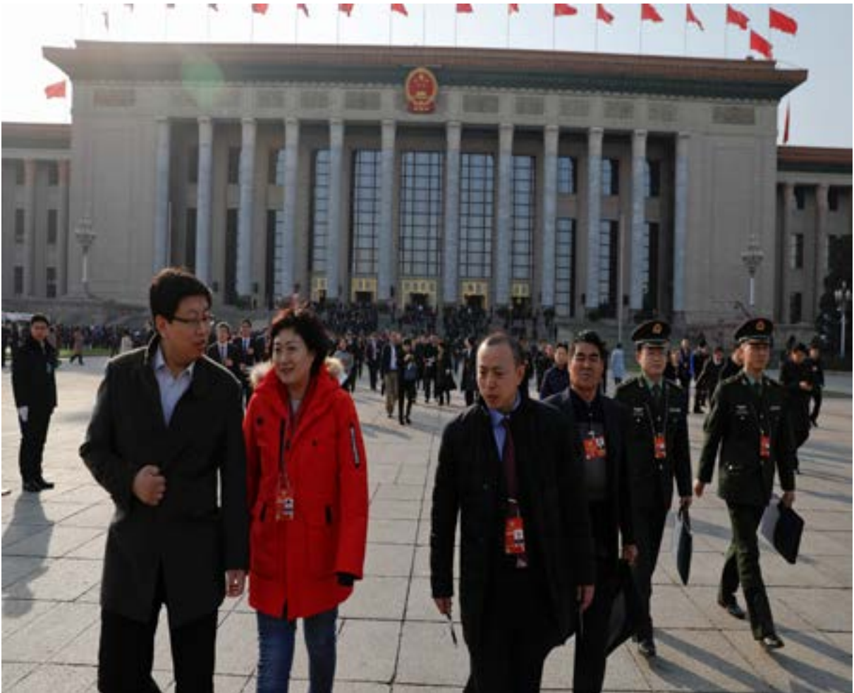
Officials leave the Great Hall of the People after a meeting ahead of the annual Chinese People’s Political Consultative Conference (CPPCC) and National People’s Congress (NPC) in Beijing