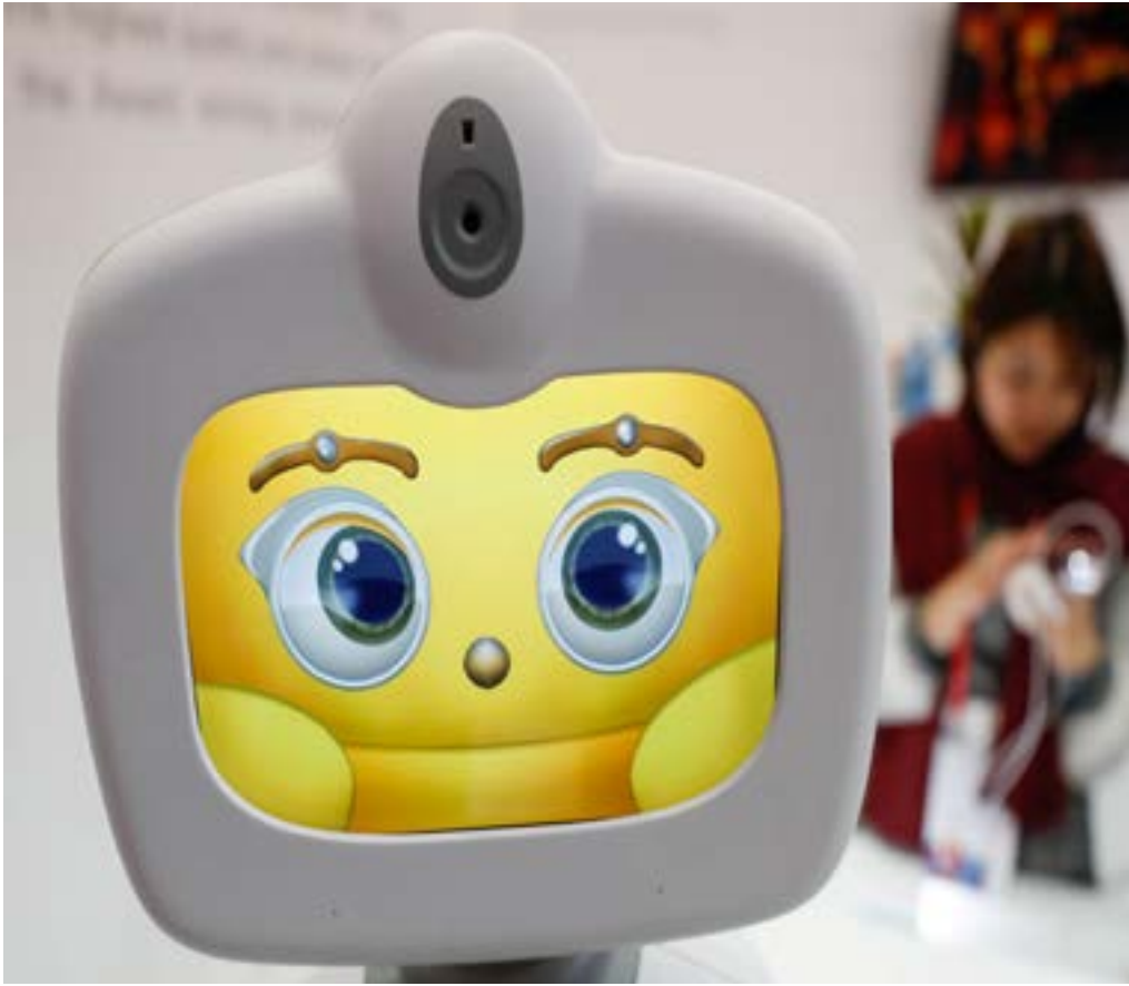
Robelf, a domestic robot with facial and voice recognition by Taiwan Excellence is shown during the Mobile World Congress in Barcelona