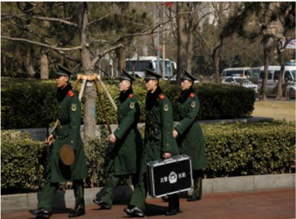
Paramilitary police officers patrol ahead of the plenary session of National People’s Congress in Beijing