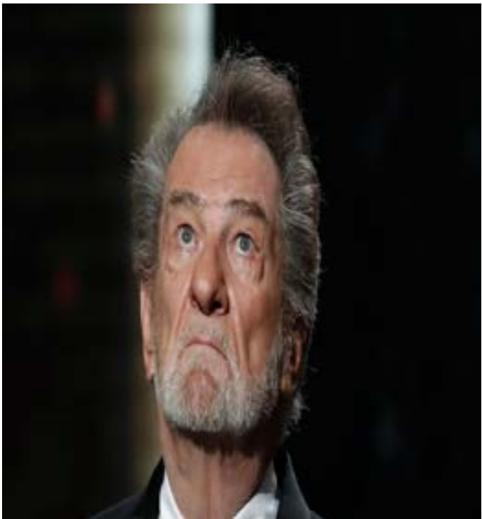
43rd Cesar Awards ceremony - Paris, France. 02/03/2018. French singer and actor Eddy Mitchell attends the Cesar awards ceremony.