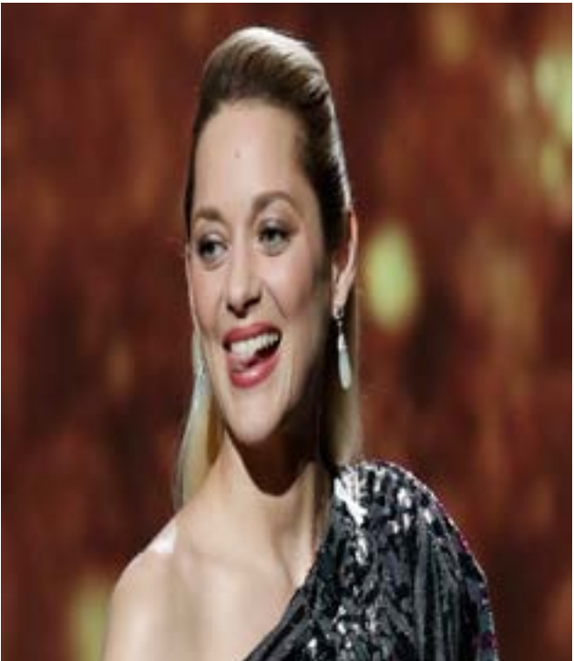
43rd Cesar Awards ceremony - Paris, France. 02/03/2018. French actress Marion Cotillard attends the Cesar awards ceremony.