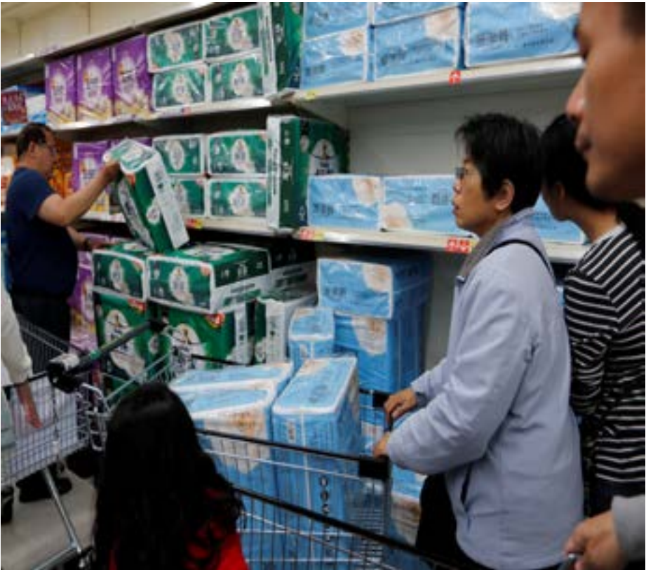
Customers pick bags of toilet paper after fears of sharp price increases, at a supermarket in Tainan