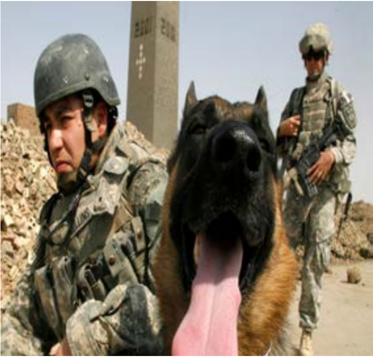
FILE PHOTO: U.S. soldiers take a break with sniffer dog during search operation in a brickyard near the city of Narhwan