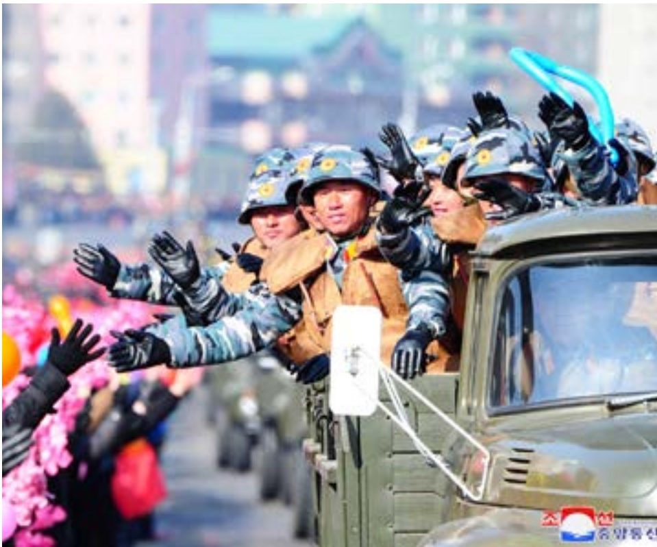
Soldiers march during a grand military parade celebrating the 70th founding anniversary of the Korean People's Army

programs. President Donald Trump warned of a “phase two” that could be “very, very unfortunate for the world” if the steps did not work. North Korea has slammed Trump’s unilateral sanctions against it, but it said it was open to talks with the United States during senior North Korean officials’ visit to South Korea for the Olympics last month. The White House said any talks with North Korea must lead to an end of its nuclear program. North Korea reiterated on Saturday that it was willing to talk to the United States but said it would never sit with any precondition. South Korean and U.S. Marines take part in a winter military drill in Pyeongchang, South Korea, December 19, 2017. A North Korean foreign ministry spokesman was quoted by state media KCNA news agency as saying “we will neither beg for dialogue nor evade the military option claimed by the U.S.” “Whether peace desired by our nation and the rest of the world settles on the Korean peninsula or a situa