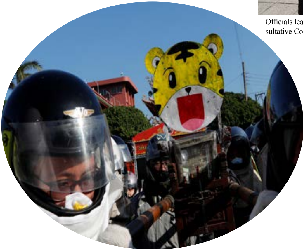
Worshippers carry statues of Guan Gong during ‘Beehive Firecrackers’ festival at the Yanshui district in Tainan