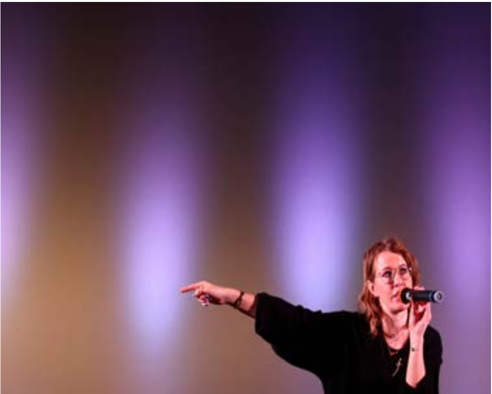
Presidential candidate Sobchak gestures during a meeting with voters in Irkutsk