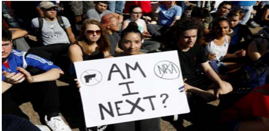
Montgomery County students demonstrate in front of the White House in Washington