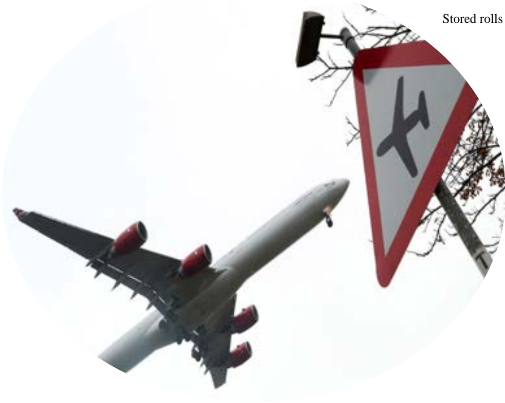
FILE PHOTO: An aircraft comes in to land at Heathrow airport in west London