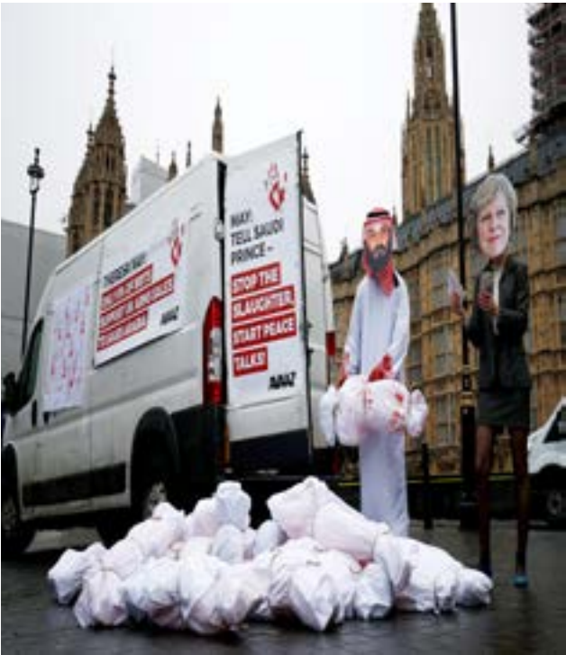
Activists from Avaaz stage a protest timed to coincide with the visit by Saudi Arabia’s Crown Prince Mohammad bin Salman outside the Houses of Parliament in London