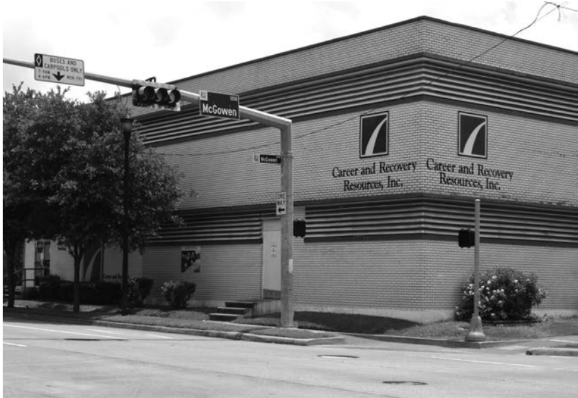
Career and Recovery Resources, Inc. (CRR) Main Campus, in Midtown Houston, 2525 San Jacinto St. @ McGowen Houston, Texas, 77002