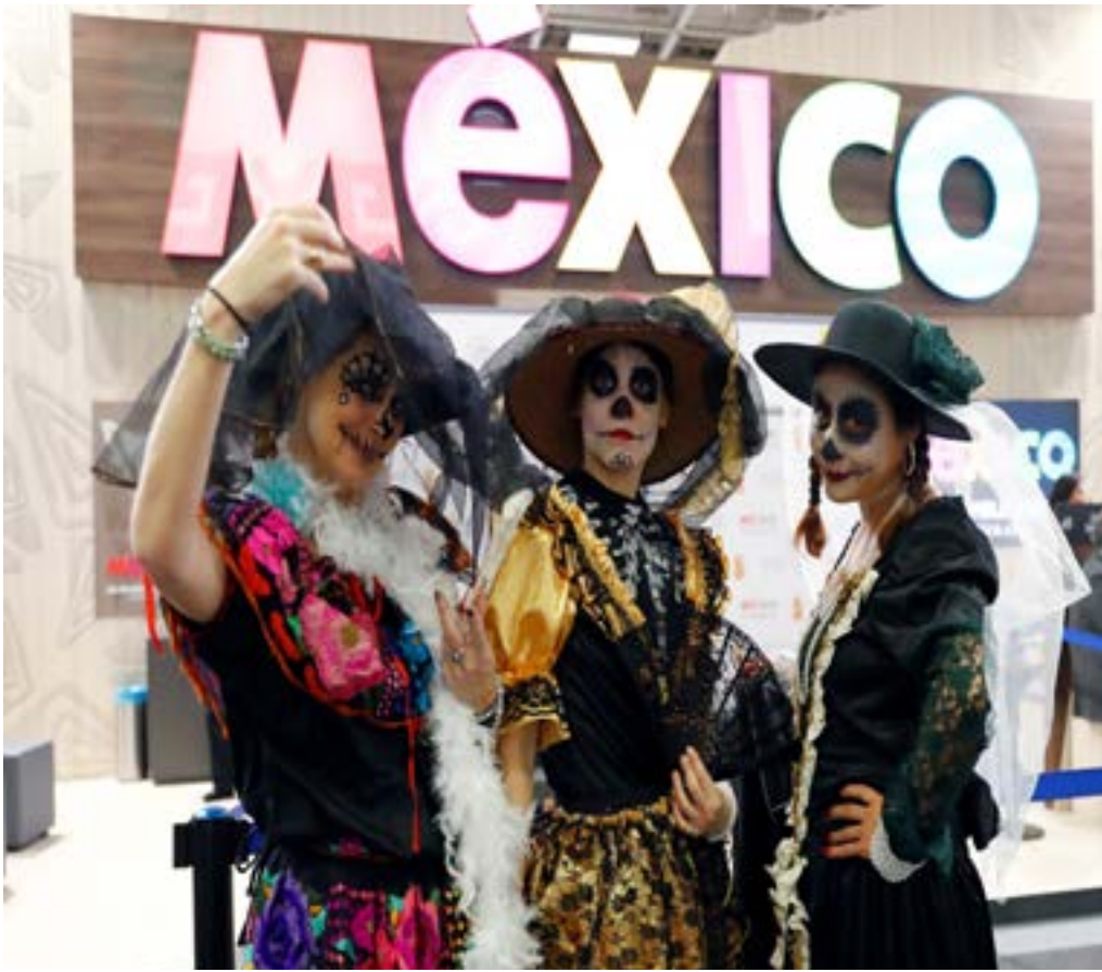
Exhibitors pose at the Mexico booth at the International Tourism Trade Fair ITB in Berlin, Germany