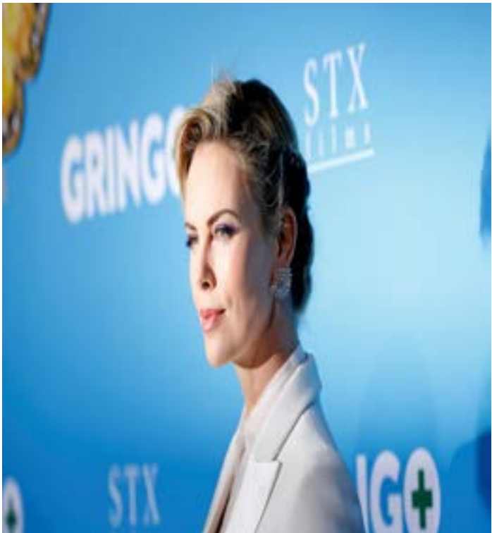
Cast member Theron poses at the premiere for the movie “Gringo” in Los Angeles