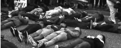
Student protesting has already begun nationwide.

There have been various groups — one was from South Broward High. Another group was outside American Heritage.