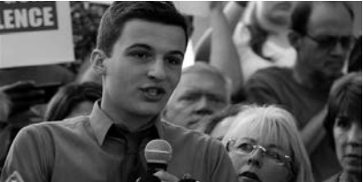
‘How many more students are going to have to die?’

The protest will “demand that a comprehensive and effective bill be immediately brought before Congress to address these gun issues,” according to its mission statement. “No special interest group, no political agenda is more critical than timely passage of legislation to effectively address the gun violence issues that are rampant in our country.”