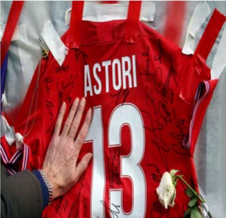
A woman touches the jersey of Fiorentina soccer player Davide Astori as she pays her respects outside the Artemio Franchi stadium in Florence