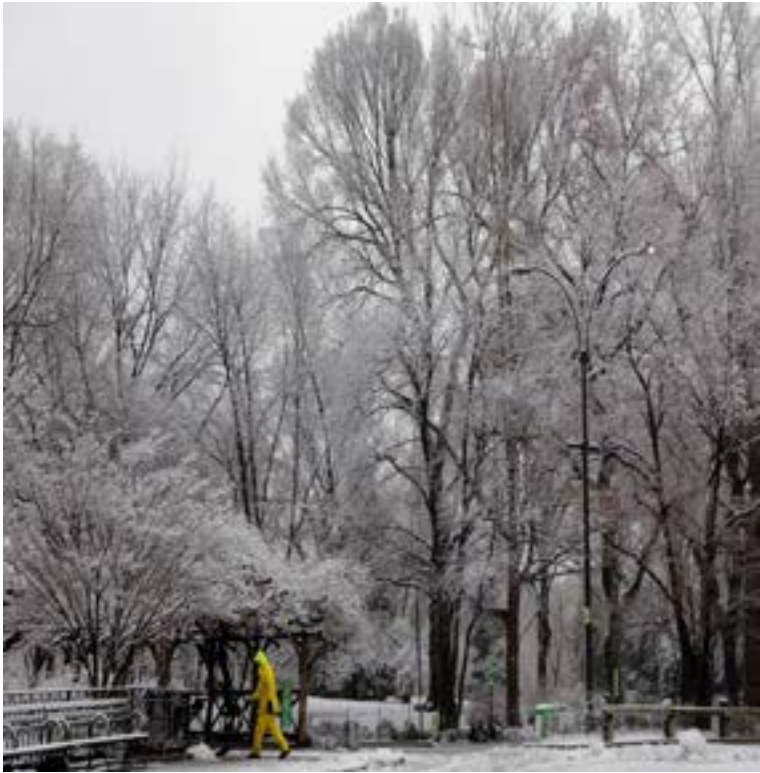
A worker clears snow from a walkway in Central Park during a snow storm in New York