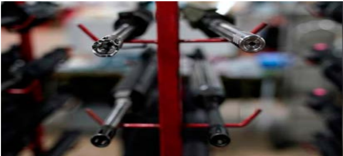
The barrels of AR-15 rifles are displayed for sale at the Guntoberfest gun show in Oaks, Pennsylvania, U.S., October 6, 2017.

PUBLIC PENSION FUNDS Soon after the Parkland bloodletting, activists and legislators pressed public employee funds to shed gun stocks.