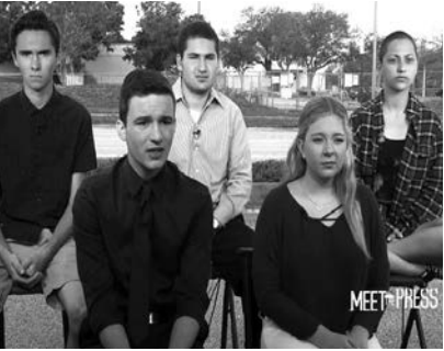
‘How many more students are going to have to die?’, students are asking.

It’s a chant being heard a lot since the deadly shooting that killed 17 at Marjory Stoneman Douglas High School.