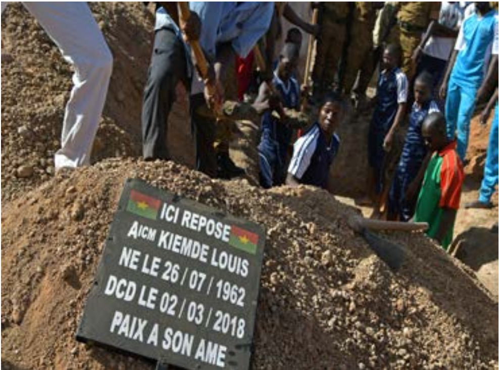
People take part in a burial ceremony of the armed forces members who were killed during Friday’s attack by Islamist militants in the capital Ouagadougou