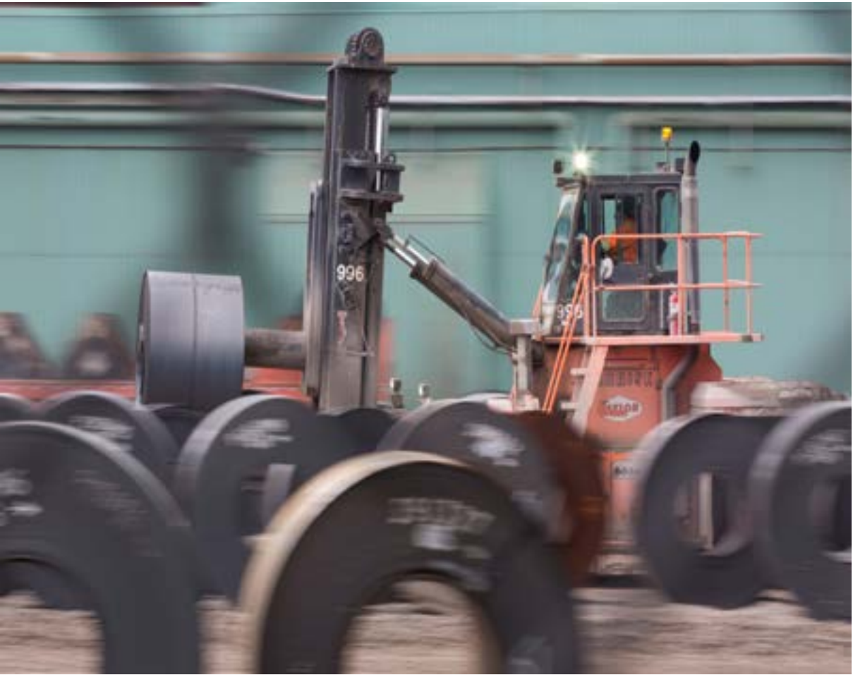
Stored rolls of steel are moved outside the ArcelorMittal Dofasco plant in Hamilton