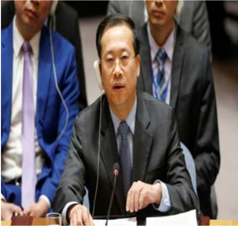
China's ambassador to the United Nations Zhaoxu speaks during the emergency United Nations Security Council meeting on Syria at the U.N. headquarters in New York