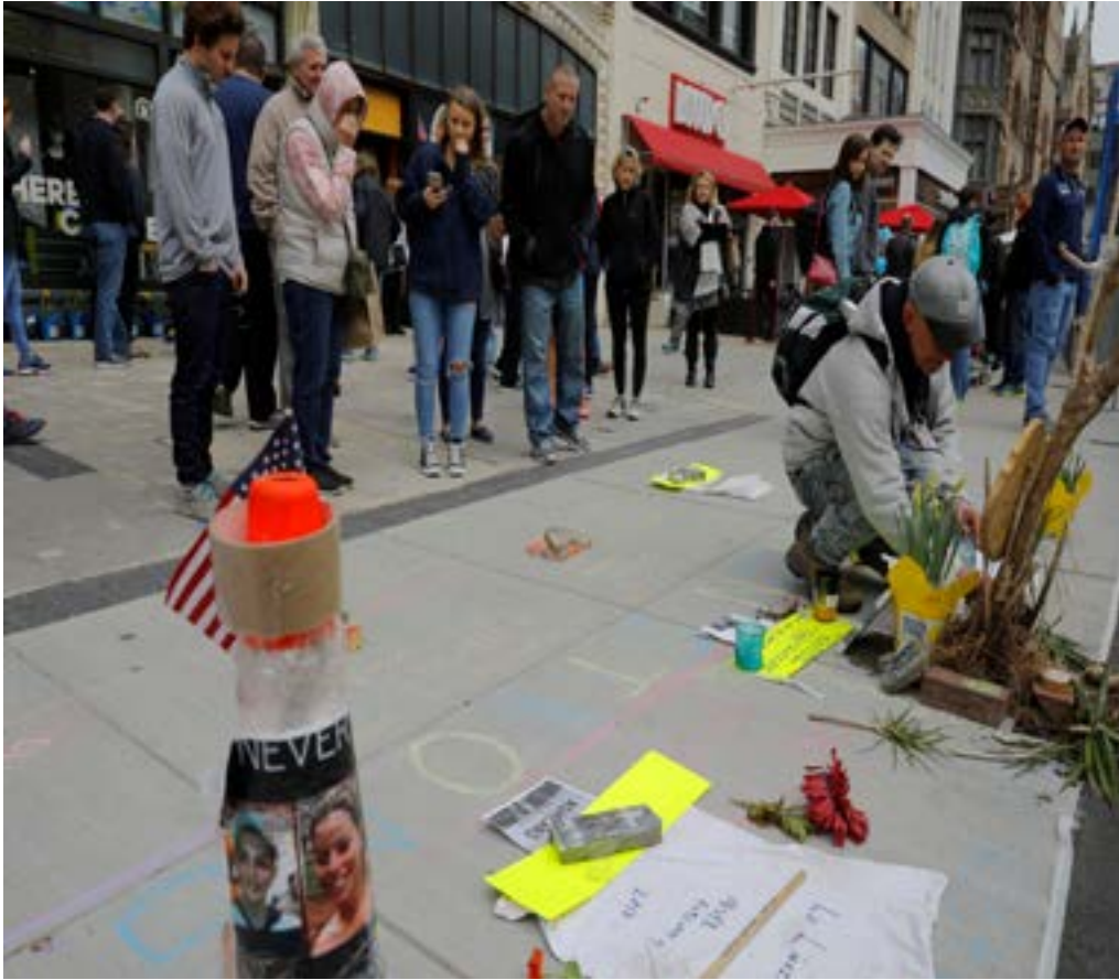
Passers-by pause at a memorial for victims of the Boston Marathon bombings in Boston