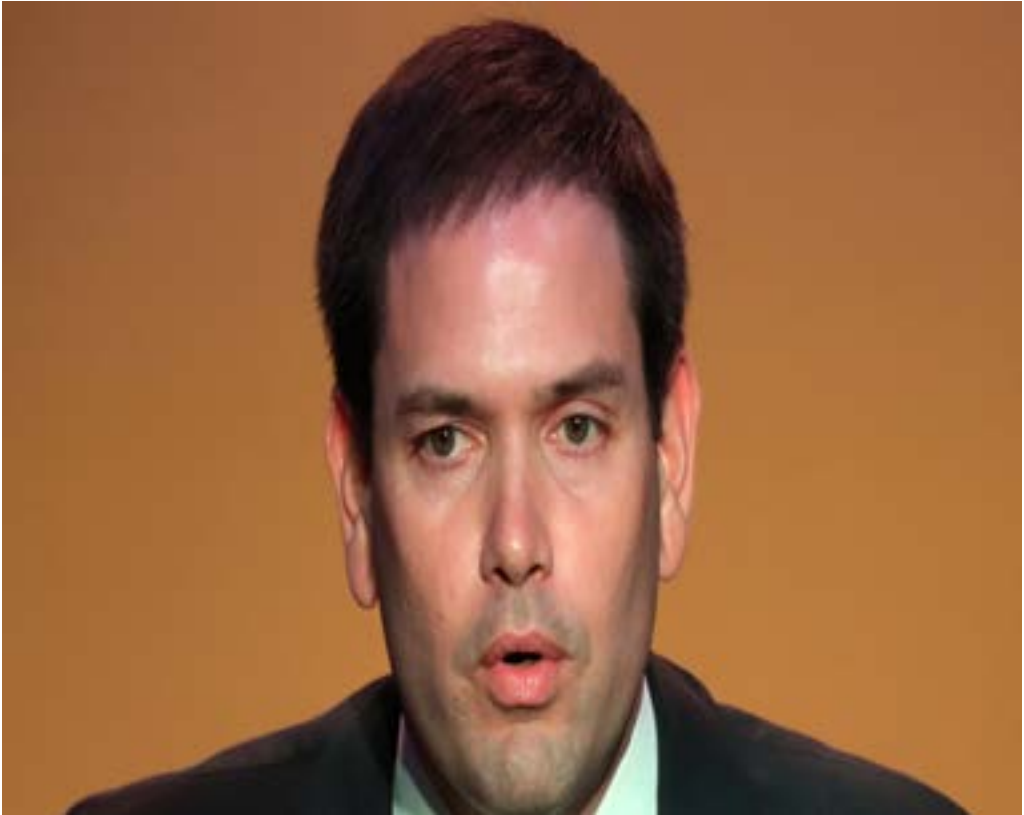
U.S. Sen. Rubio speaks during a news conference at the VIII Summit of the Americas in Lima