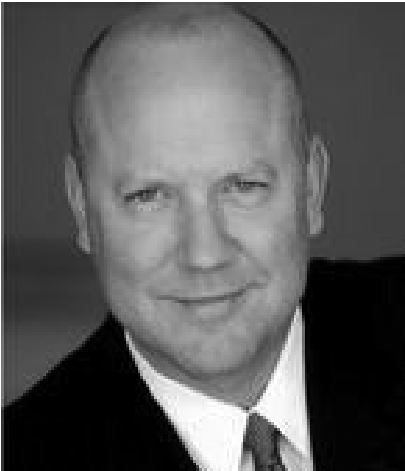
Master of Ceremonies