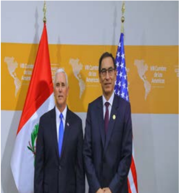
Peru's President Martin Vizcarra and U.S. Vice President Mike Pence attend a bilateral meeting during the VIII Summit of the Americas in Lima