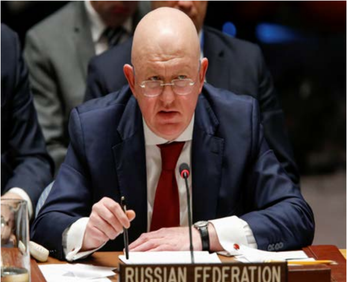
Russian Ambassador to the U.N. Nebenzya speaks after members of the U.N. Security Council voted against a Russian resolution condemning 'aggression' against Syria by the U.S. and its allies during an emergency meeting at the U.N. headquarters in New York