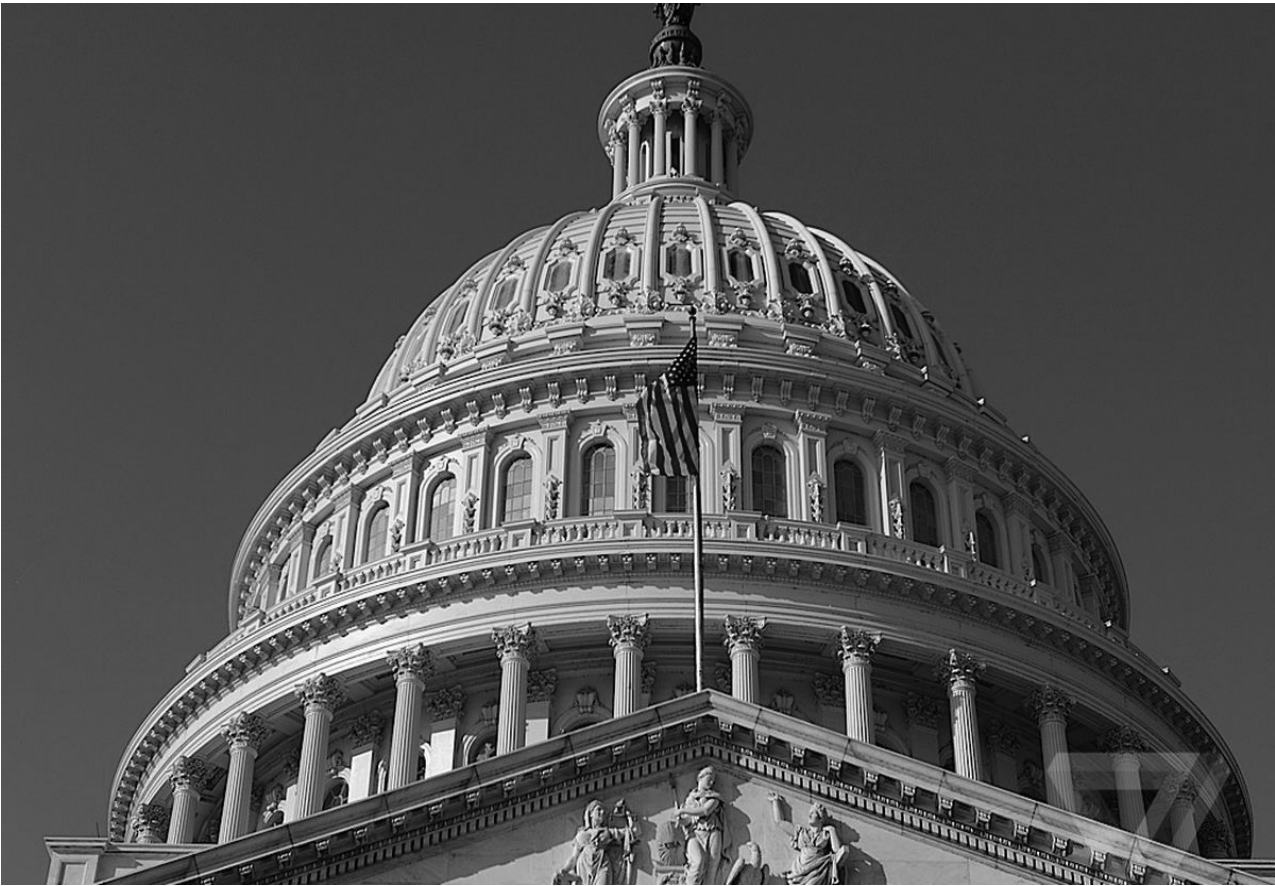
United States Senate Building in Washington DC