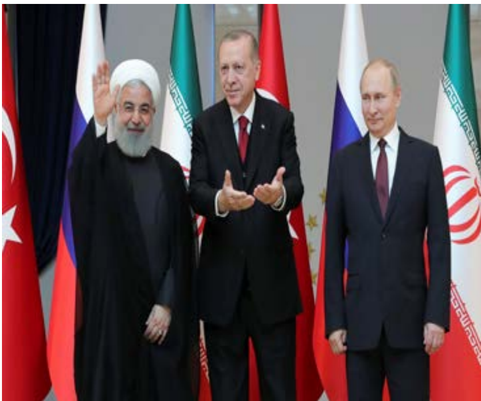
Presidents Hassan Rouhani of Iran, Tayyip Erdogan of Turkey and Vladimir Putin of Russia pose before their meeting in Ankara

"Iran is opposed to the use of chemical weapons on the basis of religious, legal and ethical standards, while at the same time it ... strongly condemns (using this) as an excuse to commit aggression