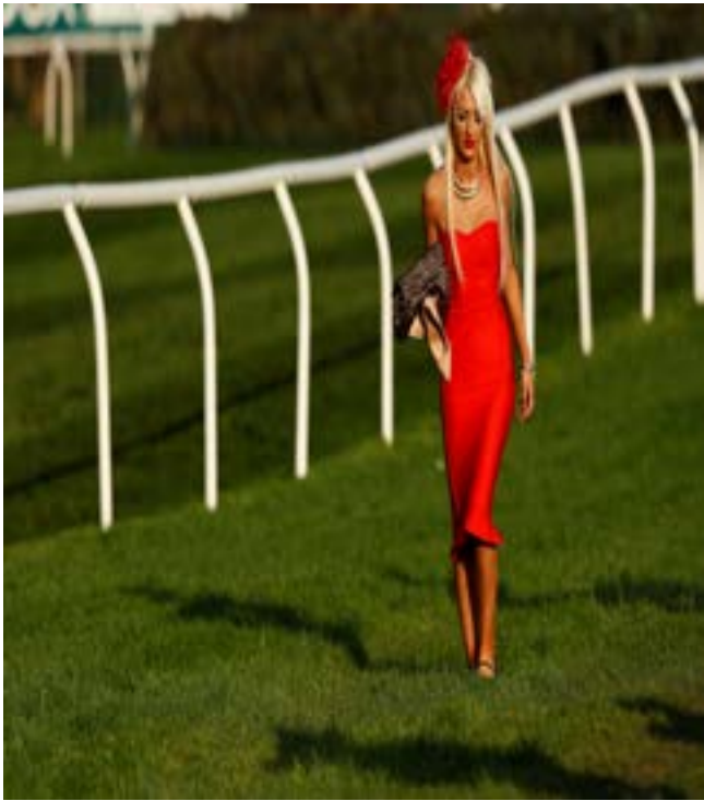
Horse Racing - Grand National Festival - Aintree Racecourse, Liverpool, Britain - April 14, 2018 A racegoer walks by the course