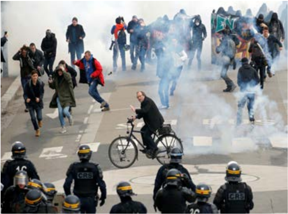
Tear gas floats in the air as protesters clash with French CRS riot police during a demonstration in Nantes