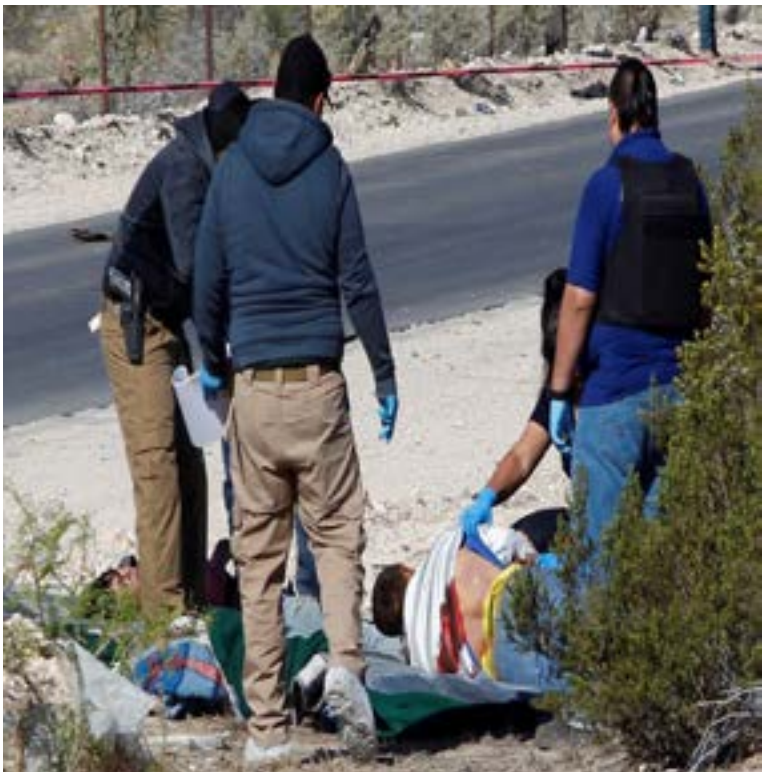
Forensic officers work on a crime scene, where two dead bodies were found, on the outskirts of Ciudad Juarez