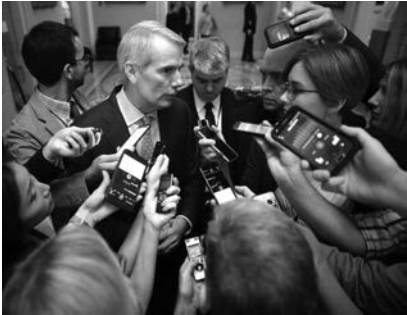
Senator Rob Portman, Republican of Ohio, is sponsoring the bill. He led a two-year investigation into Backpage.com, a website known for prostitution and trafficking ads.

The U.S. Senate has voted 97–2 to advance the Stop Enabling Sex Traffickers Act, a controversial initiative meant to crack down on sex trafficking on the internet. The bill will now go President Trump’s desk for his signature. Passage of the bill addressed concerns from the tech industry and capped off a months-long legislative fight. The legislation, called the Allow States and Victims to Fight Online Sex Trafficking Act (FOSTA), but also referred to as SESTA after the original Senate bill, would cut into the broad protections websites have from legal liability for content posted by their users. The bill would hold websites liable for hosting sex trafficking content by making a change to a key part of the Communications Decency Act. Some free-internet activists — as well as some tech company representatives — have argued that the bill places an unrealistic burden on small website operators, and will ultimately chill online speech. Sex workers have also opposed the legislation. Sen. Ron Wyden (D-OR), a critic of the bill, offered an amendment that might have clarified the bill’s purposes, but it was voted down.