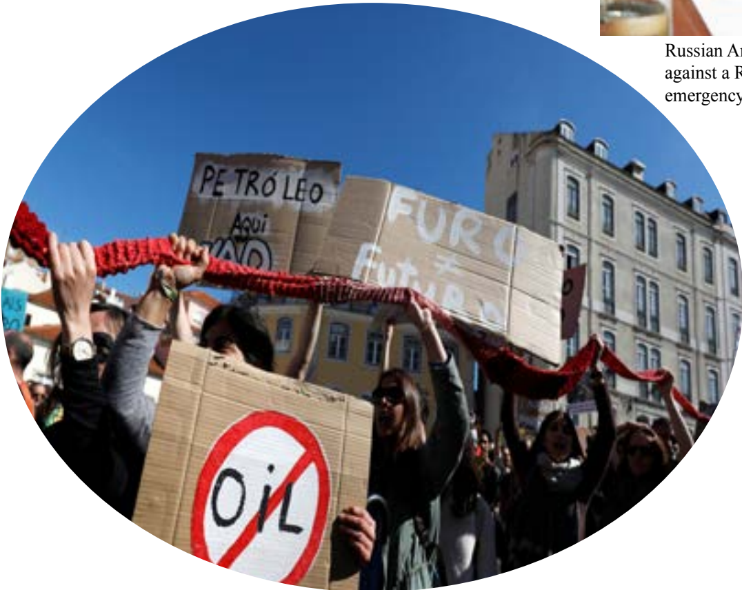
Demonstrators arrive at the Portuguese parliament during a protest against the drilling for oil and gas in the Algarve region, in Lisbon