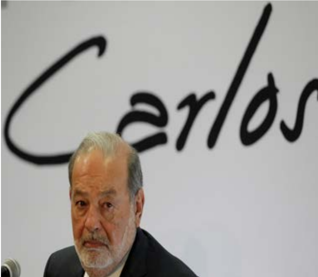
Mexican billionaire Carlos Slim looks on during a news conference in Mexico City