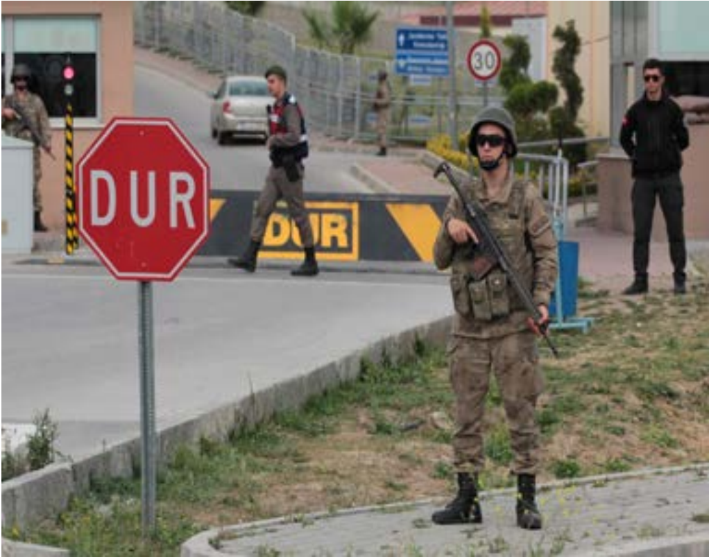
Turkish gendarmes stand guard at the entrance of Aliaga Prison and Courthouse complex in Izmir