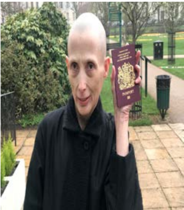
INTERVIEW-UK campaigner eyes final push with 'genderless' passports hearing