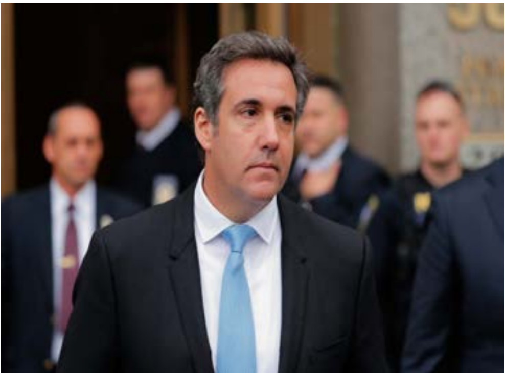
U.S. President Donald Trump's personal lawyer Michael Cohen leaves federal court in Manhattan