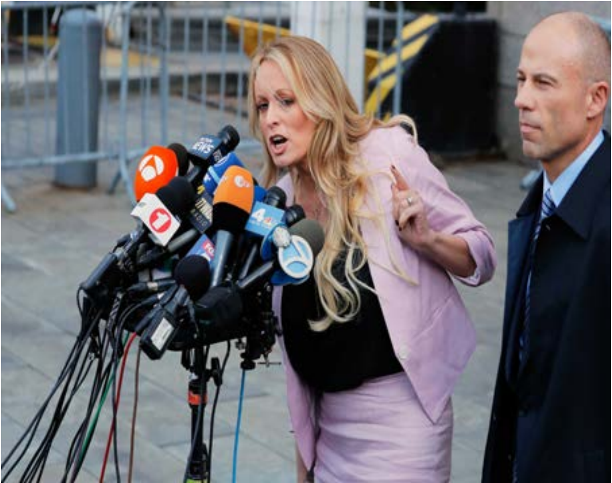
Adult film actress Stephanie Clifford, also known as Stormy Daniels, speaks to media along with lawyer Michael Avenatti outside federal court in Manhattan