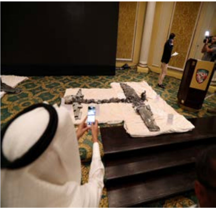
Saudi man takes photos of Iran-aligned Houthi drones in Khobar