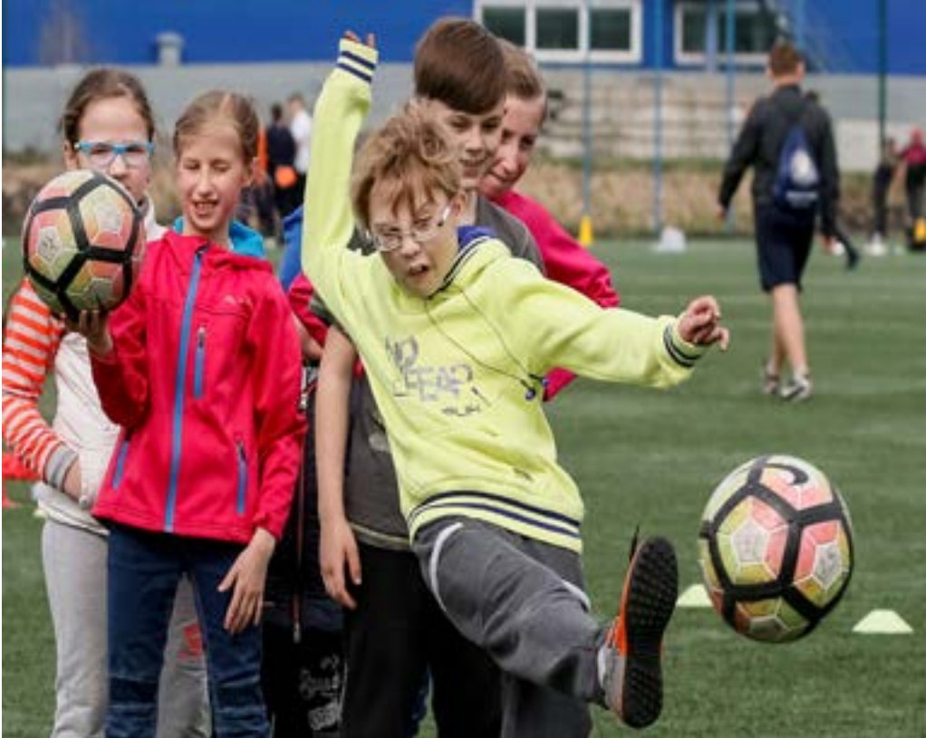
A boy kicks a ball during a practise session of a seminar organised by the FC Shakhtar Donetsk, for soccer training for children with disabilities, near Kiev