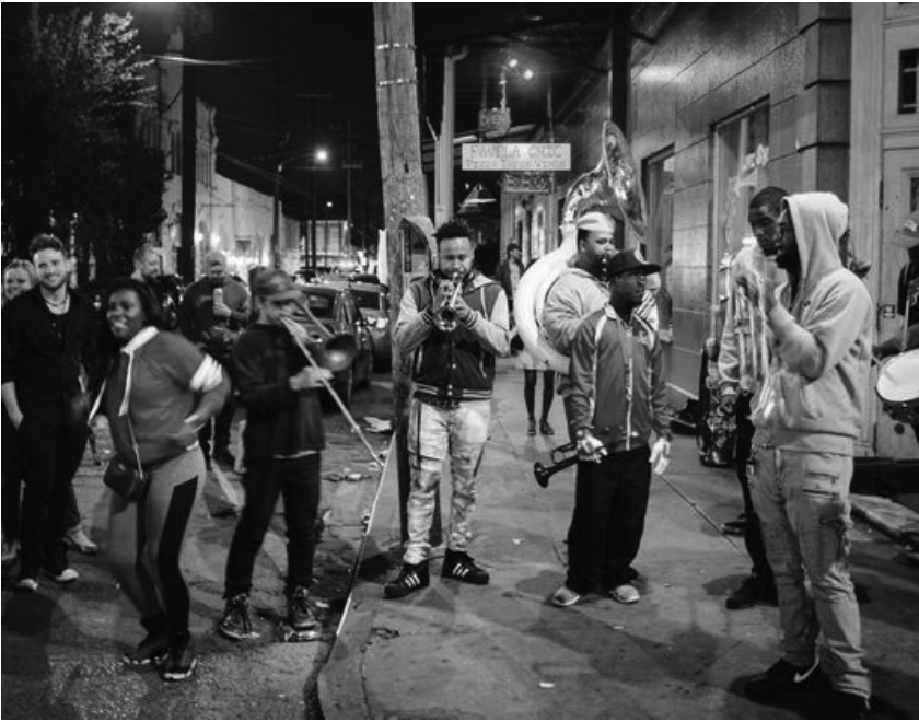
Founded in 1718, New Orleans will turn 300 years old this year. The city plans to celebrate with a series of talks, concerts and street parades.