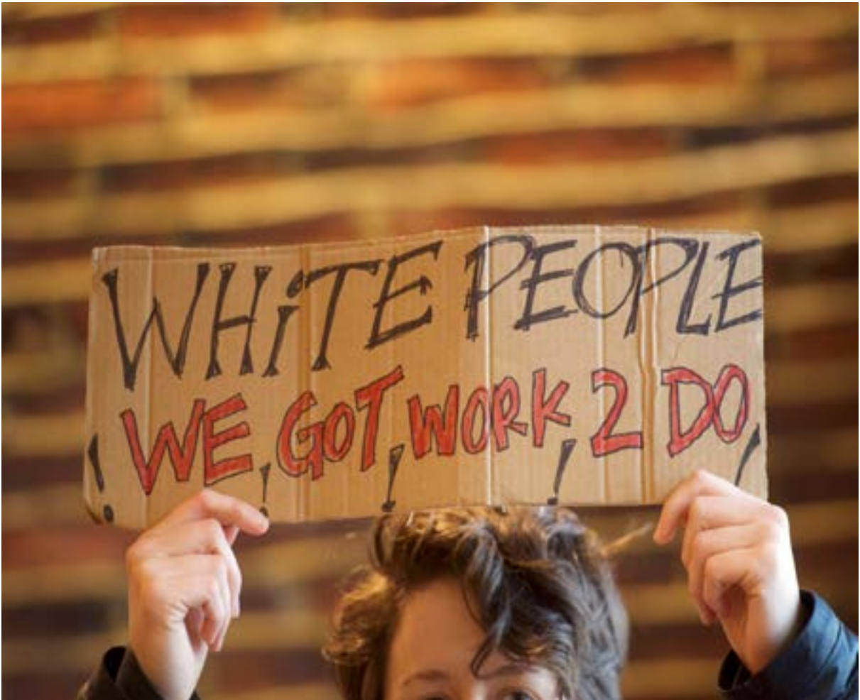
Interfaith clergy leaders stage a sit-in at the Center City Starbucks, where two black men were arrested, in Philadelphia, Pennsylvania