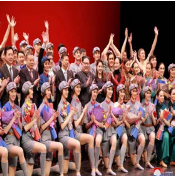
North Korean leader Kim Jong Un, his wife and head of the China’s Communist Party’s International Department Song Tao applauds with ballet dancers