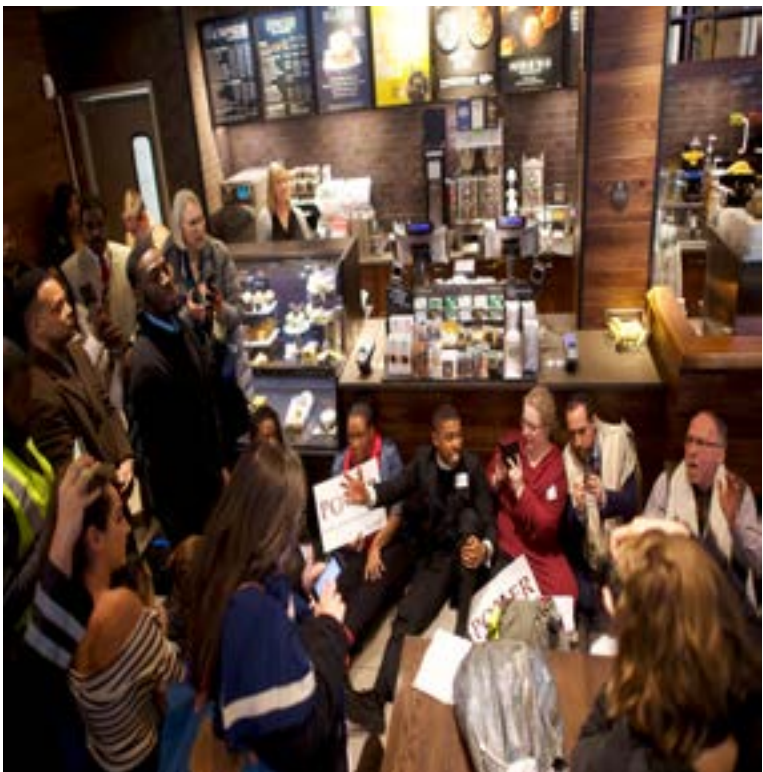
Interfaith clergy leaders stage a sit-in at the Center City Starbucks, where two black men were arrested, in Philadelphia PHILADELPHIA-STARBUCKS/