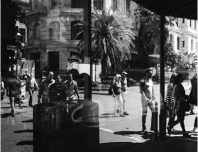
Pedestrians on Chartres Street in the French Quarter of New Orleans. The city that today is New Orleans almost wasn’t. British explorers nearly claimed the area for themselves and even the 18th-century aristocrats in Paris originally wanted their French outpost in Biloxi or farther upriver near modern-day Baton Rouge.

ans architect and urban planner. Each new wave of immigrants to the city — from Spanish settlers to Sicilians to Senegalese — brought with them their particular style of food, music and architecture. Spanish settlers in the late 18th and early 19th centuries used local ingredients to morph their beloved paella dish into jambalaya. They also filled the French Quarter, the city’s oldest neighborhood, with homes decorated with ornate wrought-iron balconies and center courtyards, more akin to homes in Havana and Sevilla than anything found in the U.S., Binger said.