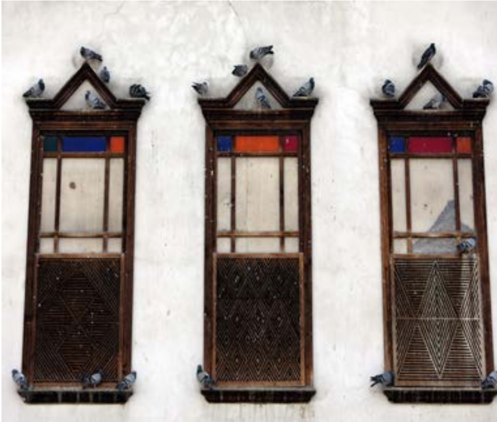
Pegeons are seen perched on windows in the old city of Damascus