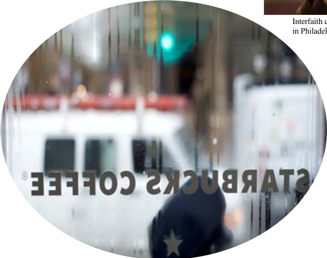
Police officers monitor activity outside as protestors demonstrate inside a Center City Starbucks, where two black men were arrested, in Philadelphia