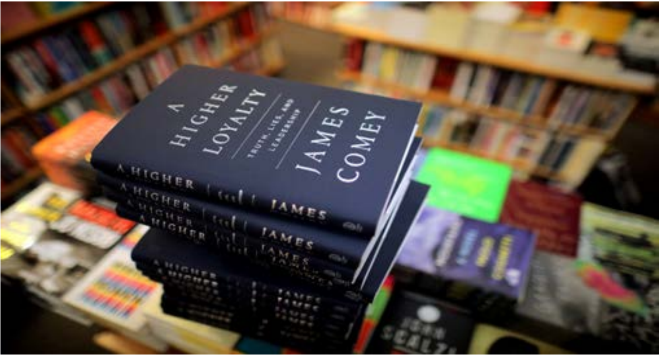
Copies of former FBI director James Comey’s book “A Higher Loyalty” are seen at Kramerbooks book store in Washington D.C.