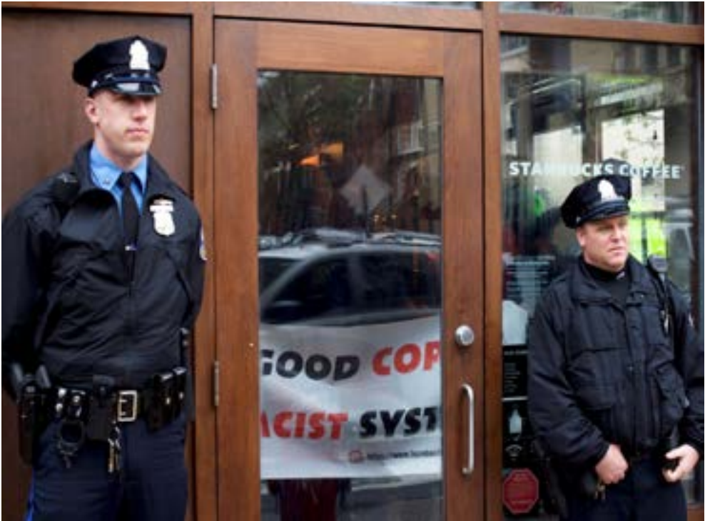
Police officers monitor activity outside as protestors demonstrate inside holding a “Good Cops in a Racist System” sign at a Center City Starbucks, where two black men were arrested, in Philadelphia