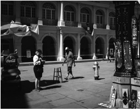
Street scene in today’s New Orleans.

NEW ORLEANS — Ever since Canadian-born French explorer Jean-Baptiste Le Moyne de Bienville chose the swampy, flood-prone bend in the lower Mississippi River in 1718 as the spot for a new French colony, New Orleans has been a non-stop roller coaster of historical events. Nouvelle-Orléans, as it was originally known, was ruled by three countries in less than a century — France, Spain and America — and swelled with Caribbean, European and African immigrants. It endured outbreaks of yellow fever, slave uprisings, river floods and one debilitating hurricane after another. The most recent big one, Hurricane Katrina in 2005, submerged 80% of the city, led to about 1,400 deaths and threatened the city’s very existence. This year, New Orleans, birthplace of jazz and jambalaya, celebrates its survival from three centuries of tumult with a 300th birthday party filled with exhibitions, panel discussions, street parades and parties. Throughout the city, large “300” signs have been set up in plazas and parks, each big enough for visitors to snap pictures beside. Sean Cummings, a New Orleans hotelier and entrepreneur, said the tricentennial is as much a tribute to the city’s resilience as it is its existence. “For me, it’s a (sign) that something here works,” he said. “It’s lasted for 300 years, and New Orleans has managed to be not only part of the physical landscape as an American city but in many ways part of the poetic landscape.”