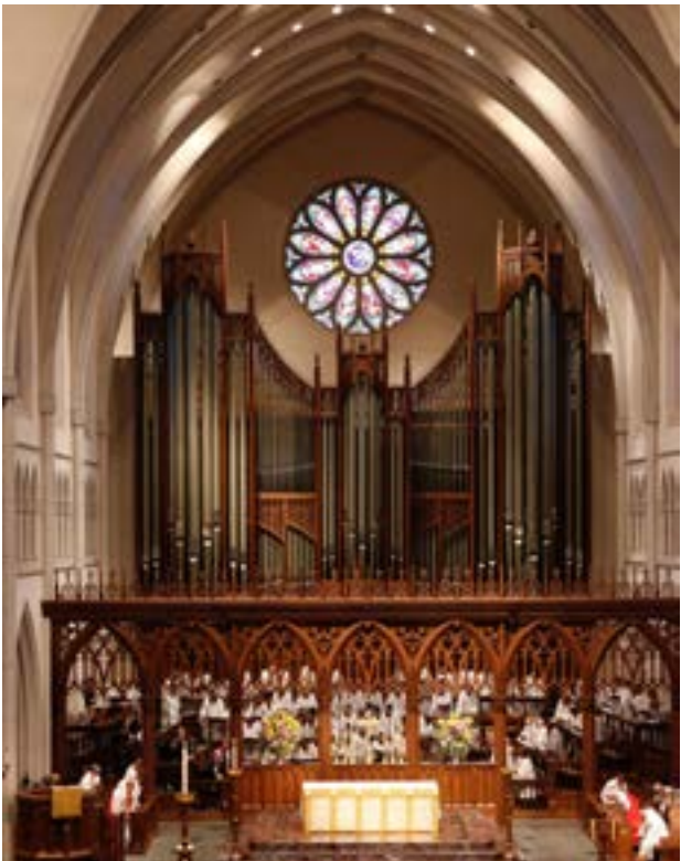
Attendees stand during during funeral services for former first lady Barbara Bush at St. Martin’s Episcopal Church in Houston