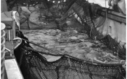
Japanese fishermen draw up a fishing net full of Echizen kurage, or Nomura’s jellyfish, off the shores of Awashimaura, northern Japan. Japan is still struggling to convince consumers that fish from contaminated areas is safe.

of the Fukushima reactors for decades and did nothing. This led 1,400 Japanese citizens to sue GE for their role in the Fukushima nuclear disaster. Even if we can’t see the radiation itself, some parts of North America’s western coast have been feeling the effects for years. Not long after Fukushima, fish in Canada began bleeding from their gills, mouths, and eyeballs. This “disease” has been