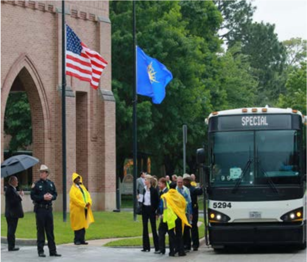
Actor Norris arrives for Barbara Bush funeral, at St. Martin’s Episcopal Church in Houston