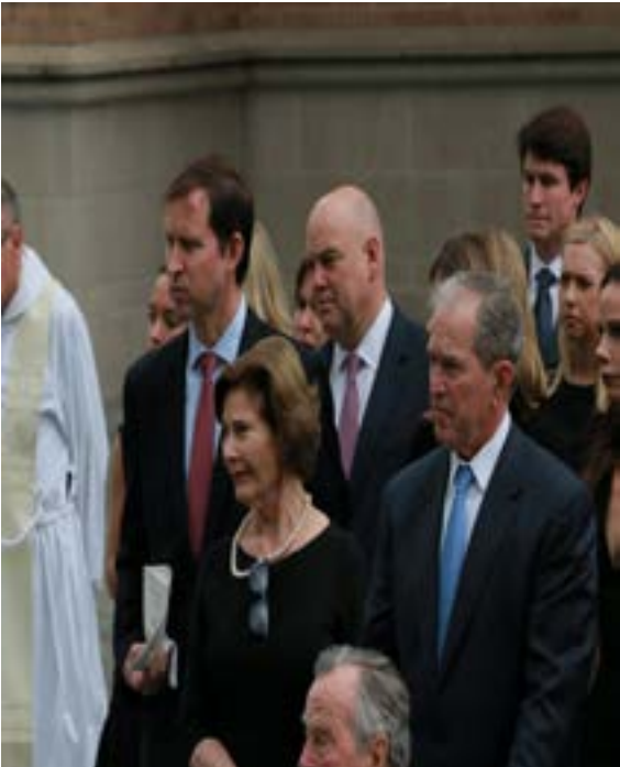
Former U.S. President George H.W. Bush attends the funeral service for his wife former first lady Barbara Bush in Houston