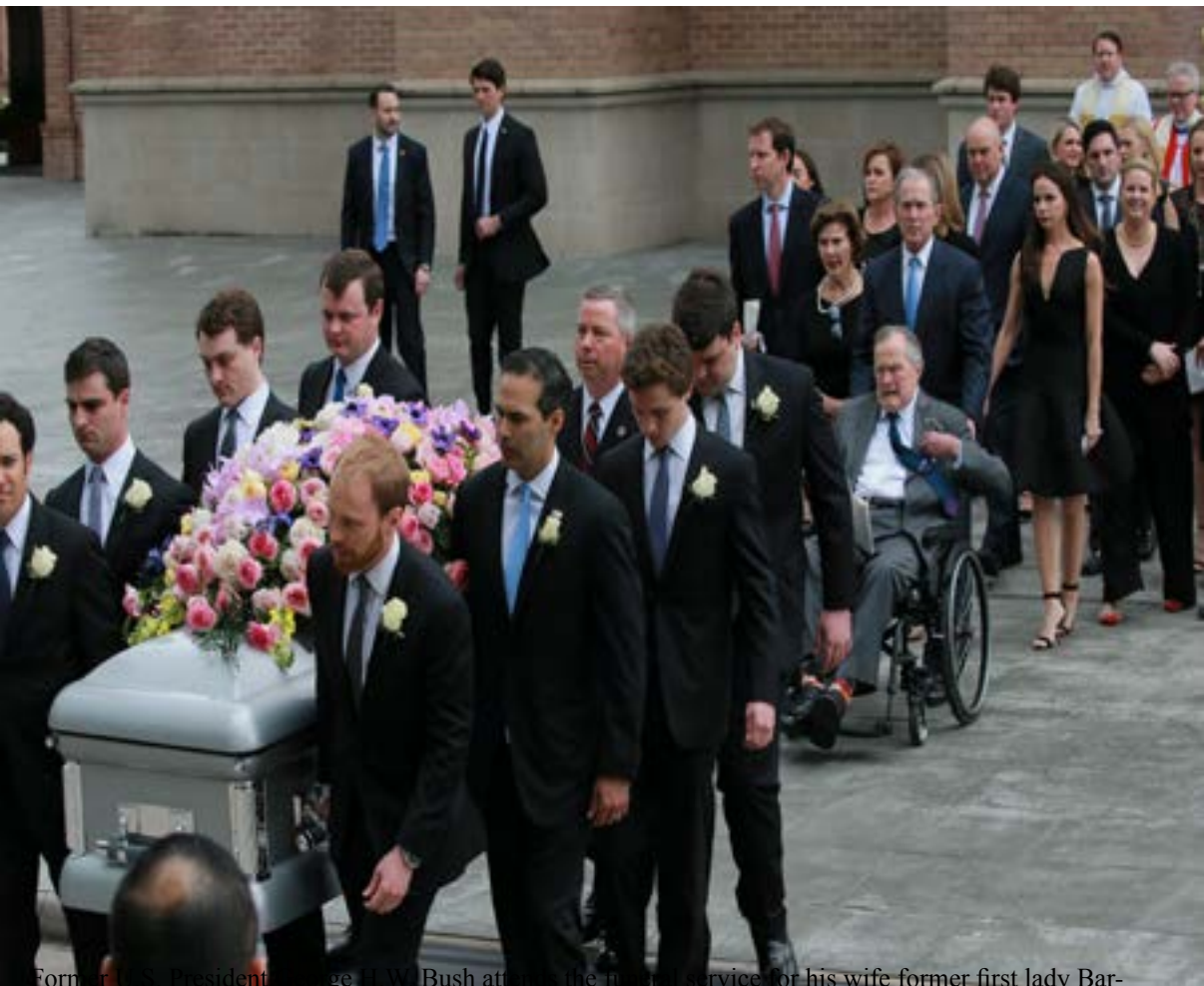
Former U.S. President George H.W. Bush attends the funeral service for his wife former first lady Barbara Bush in Houston