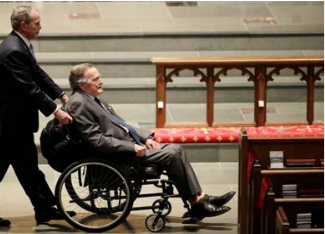
Former Presidents George W. Bush, and George H.W. Bush arrive at St. Martin’s Episcopal Church for funeral services for former first lady Barbara Bush in Houston