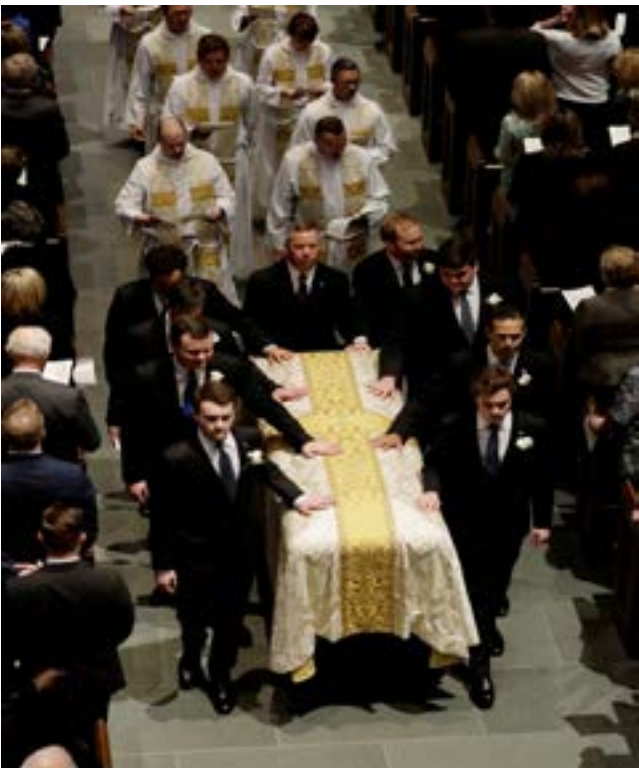
Pallbearers escort the casket of former first lady Barbara Bush after funeral services at St. Martin’s Episcopal Church in Houston