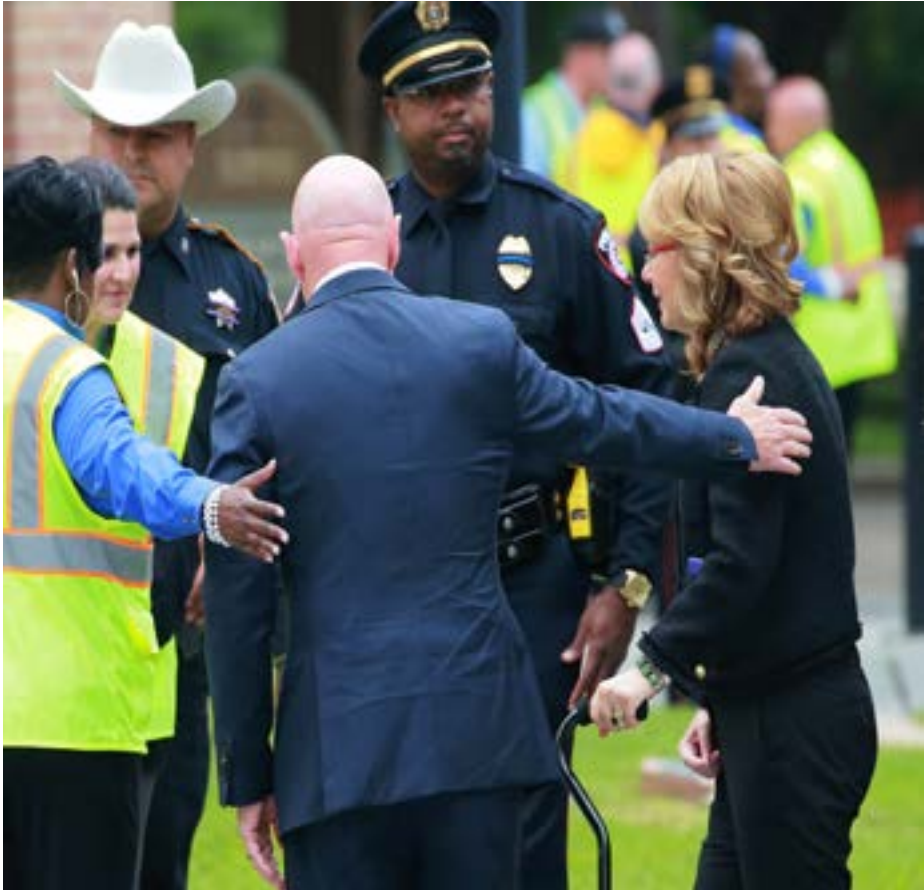
Former U.S. Congresswoman Giffords and husband Astronaut Kelly arrive at Barbara Bush funeral in Houston