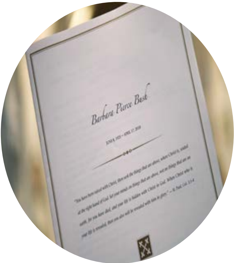
Detailed view of a program during the funeral for former First Lady Barbara Bush at St. Martin’s Episcopal Church in Houston