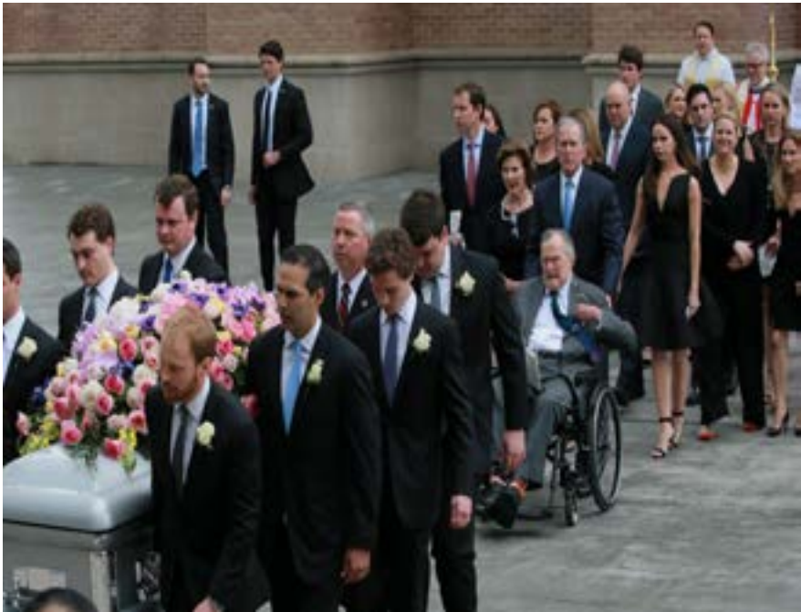
Former U.S. President George H.W. Bush attends the funeral service for his wife former first lady Barbara Bush in Houston