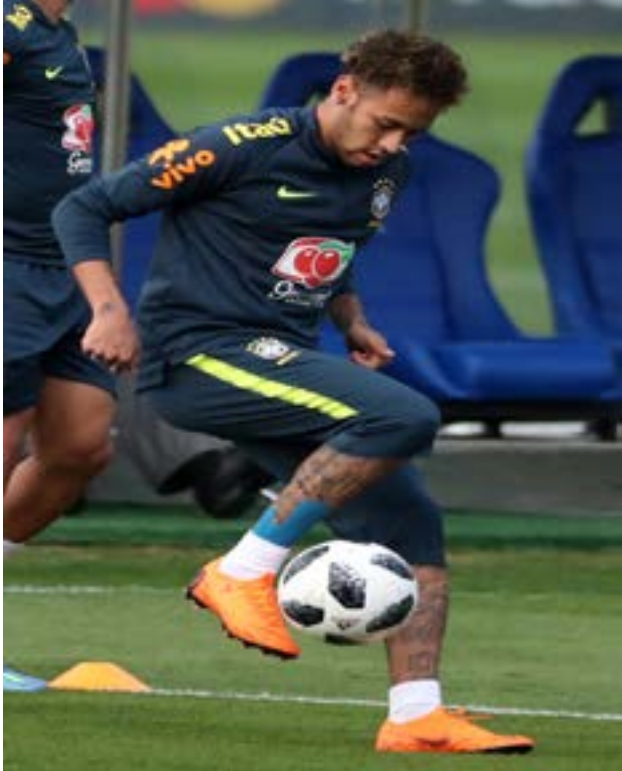
World Cup 2018 - Brazil national soccer team training