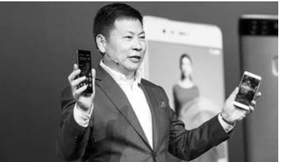
Huawei’s US distribution plans are thwarted again as AT&T reportedly backs out of a deal.

heightened worries in the United States about Chinese investment. “Investment cooperation between China