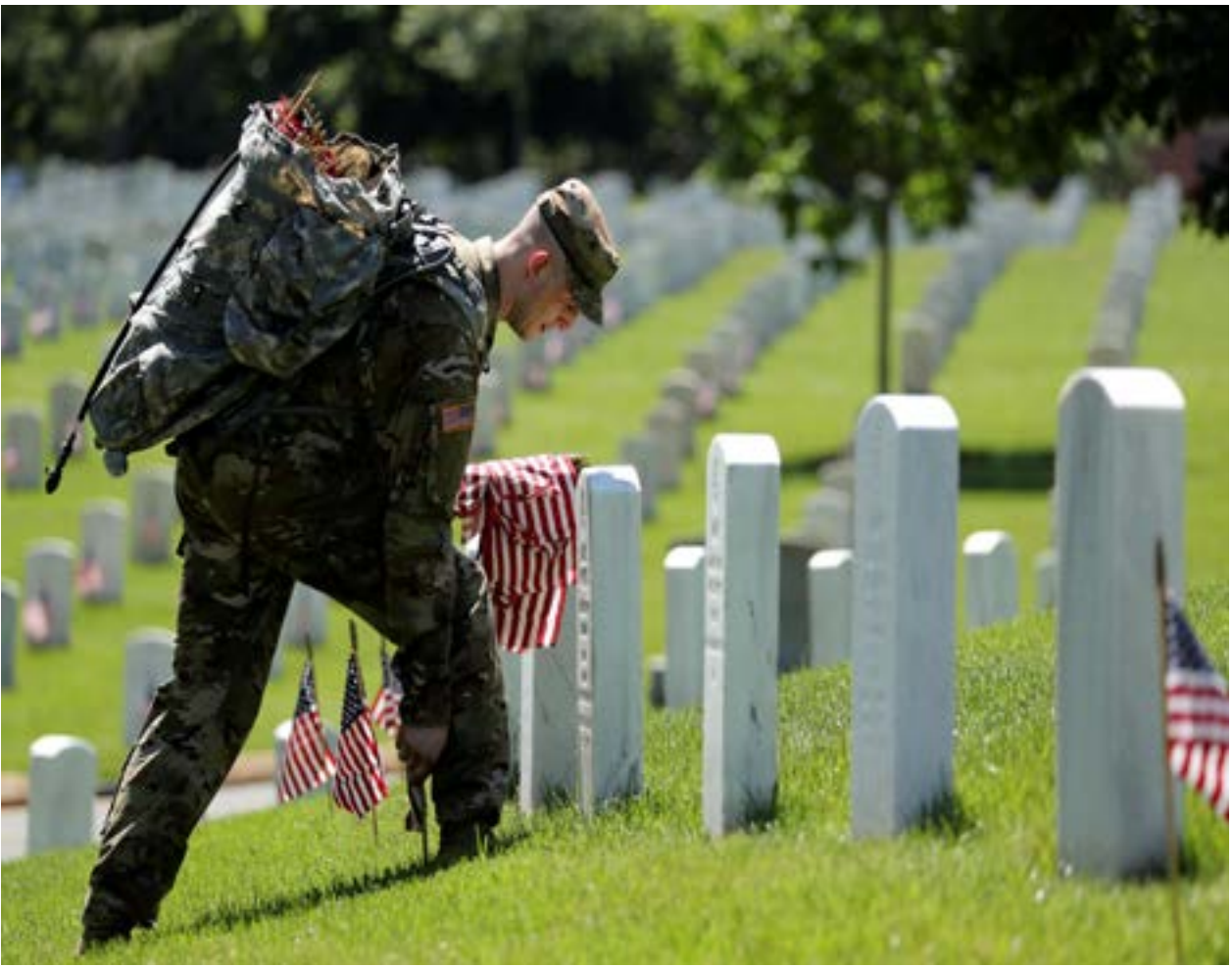
U.S. Army soldiers of the 3rd United States Infantry Regiment arrive to place U.S. flags on graves at Arlington National Cemetery