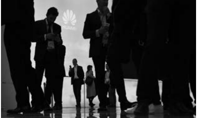
Visitors use their mobile phone at a Huawei stand.

on Foreign Investment rejected Chinese firm Ant Financial’s takeover bid for US-based money transfer firm MoneyGram, citing national security concerns. Ant Financial is an affiliate of Alibaba, which