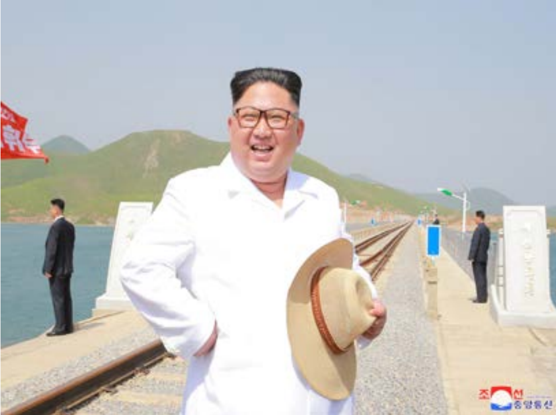
North Korean leader Kim Jong Un inspects the completed railway that connects Koam and Dapchon