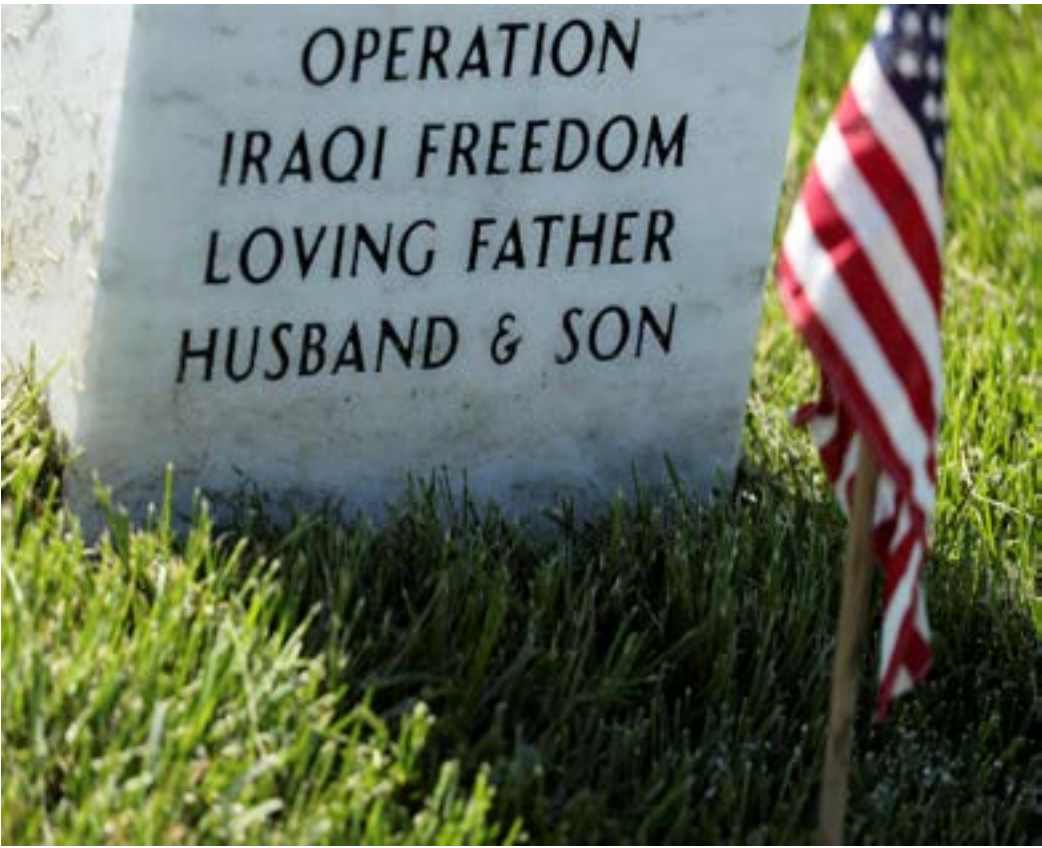
U.S. Army soldiers of the 3rd United States Infantry Regiment arrive to place U.S. flags on graves at Arlington National Cemetery