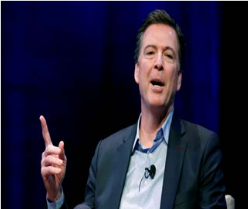
FILE PHOTO: Comey speaks about his book during an onstage interview at George Washington University in Washington