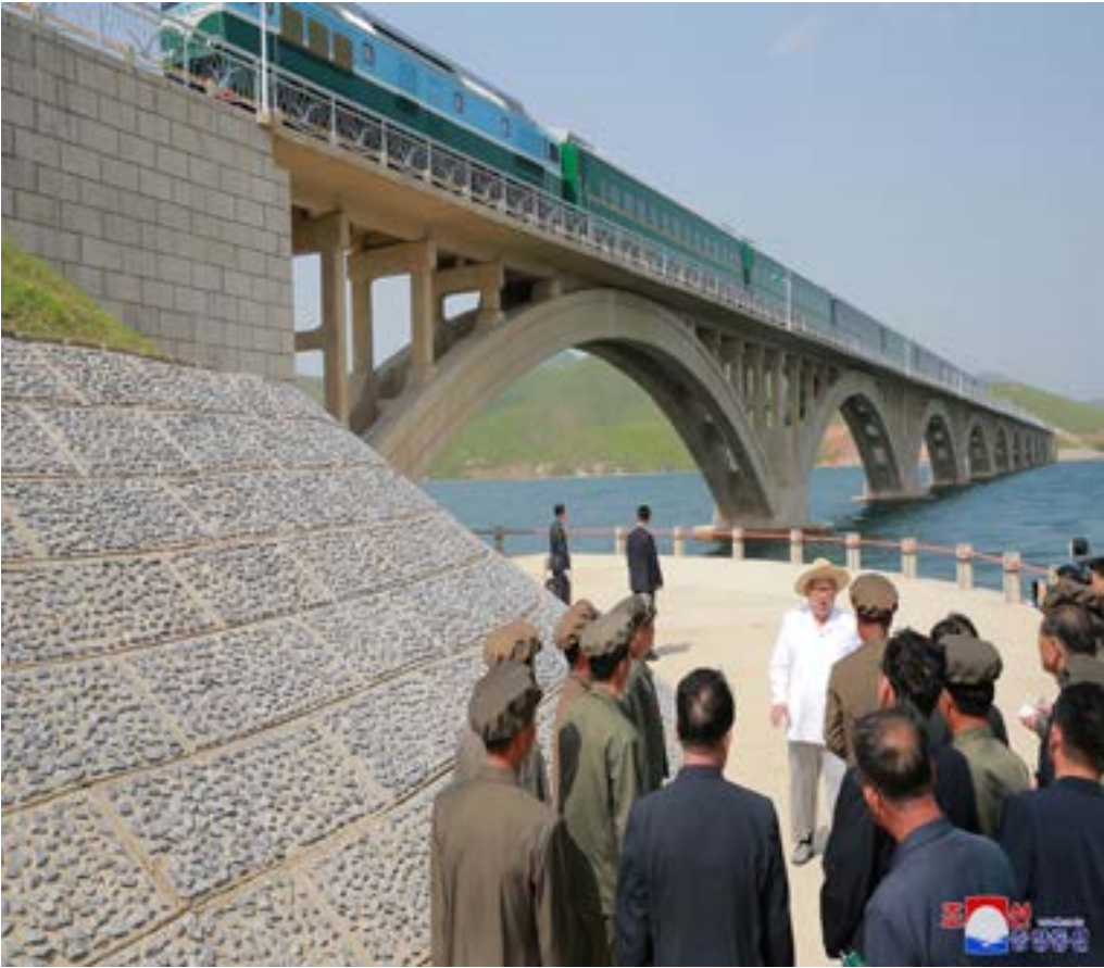
North Korean leader Kim Jong Un inspects the completed railway that connects Koam and Dapchon