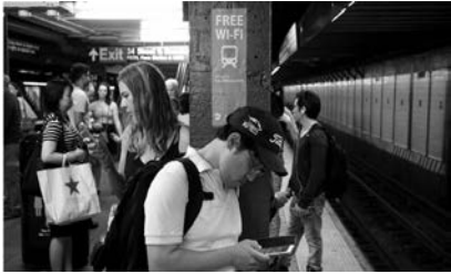
Telecom carriers dominate distribution of mobile phones in the United States and Huawei is struggling to make inroads into the market.

The collapse of a deal in which Huawei Technologies was to distribute its smart-phones through US carrier AT&T will threaten Sino-US trade ties – and Beijing should consider “countermeasures” if the situation escalates, experts and a former Chinese commerce official said. Shenzhen-based Huawei was due to announce its partnership with AT&T in Las Vegas on Tuesday, but the deal was cancelled at the last minute – a major setback for the Chinese company’s global expansion.