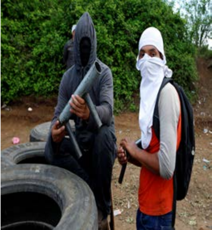
Demonstrators block the Pan-American highway during a protest against President Daniel Ortega's government in Nagarote