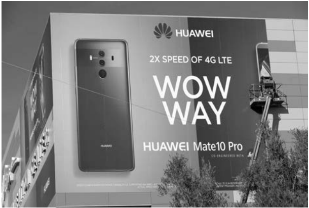
A crew hangs a Huawei advertising banner on the side of the Las Vegas Convention Center as workers prepare for the 2018 CES in Las Vegas.