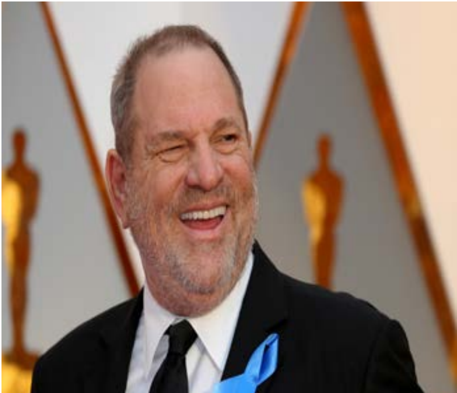
they were reviewing three accusations of sexual assault against him. International Film Festival in Abu Dhabi, October 15, 2007.