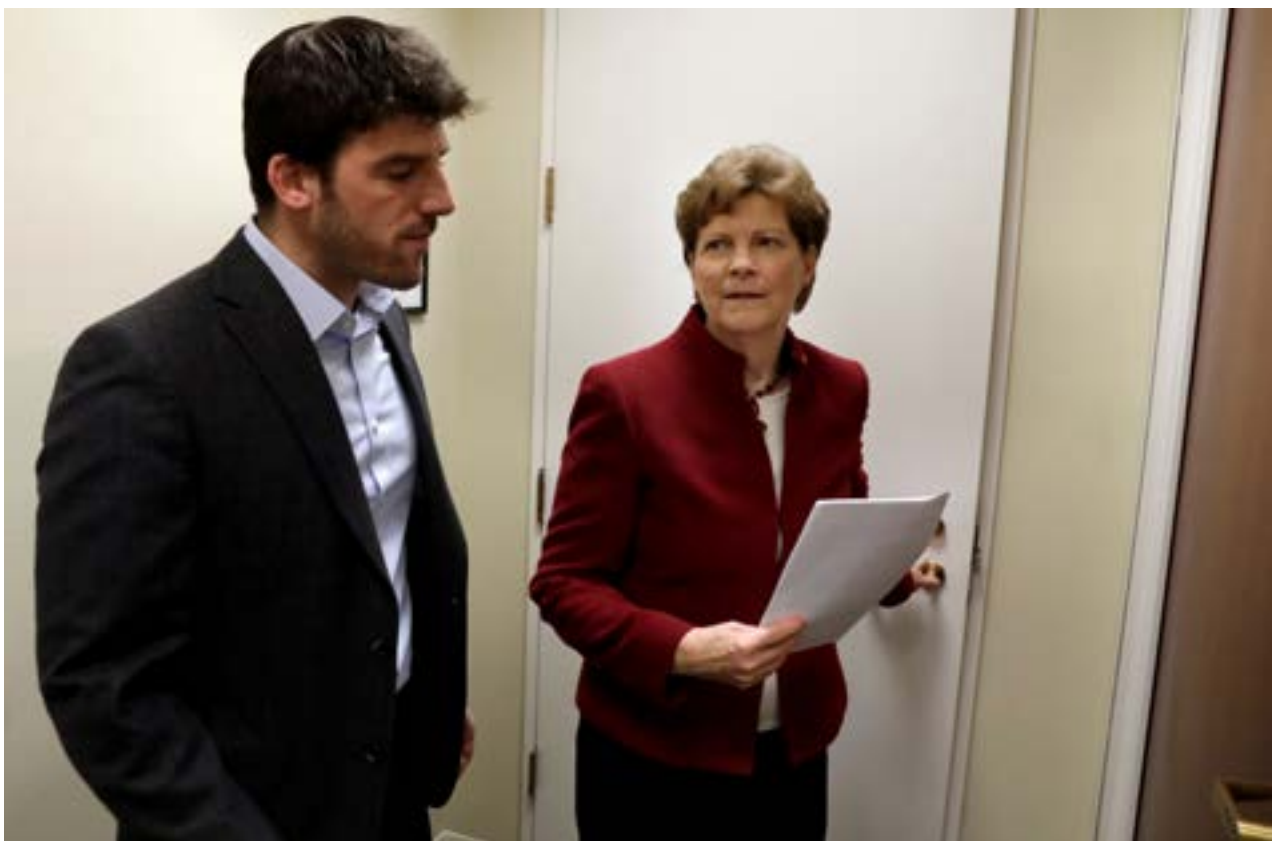
FILE PHOTO: US Senator Shaheen (D-NH) walks with her aid on Capitol Hill in Washington

WASHINGTON (Reuters) - U.S. tech companies would be forced to disclose if they allowed American adversaries, like Russia and China, to examine the inner workings of software sold to the U.S. military under proposed legislation, Senate staff told Reuters on Thursday. The bill, approved by the Senate Armed Services Committee on Thursday, comes after a year-long Reuters investigation found software makers allowed a Russian defense agency to hunt for vulnerabilities in software that was already deeply embedded in some of the most sensitive parts of the U.S. government, including the Pentagon, the Federal Bureau of Investigation and intelligence agencies. Security experts say allowing Russian authorities to conduct the reviews of internal software instructions — known as source code — could help Russia find vulnerabilities and more easily attack key systems that protect the United States. The new source code disclosure rules were included in Senate version of the National Defense Authorization Act, the Pentagon's spending bill, according to staffers of Democratic Senator Jeanne Shaheen. Details of bill, which passed the committee 25-2, are not yet public. And the legislation still needs to be voted on by the full Senate and reconciled with a House version of the legislation before it can be signed into law by President Donald Trump.