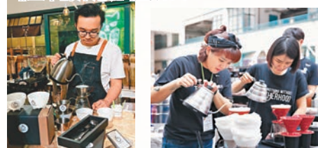
■來自韓國的時尚精品咖啡品牌Bean Brothers 赴港交流

■不少咖啡師愛用手沖咖啡方式，即將熱水注入經烘焙以及研磨的咖啡豆中的沖泡咖啡的方式。