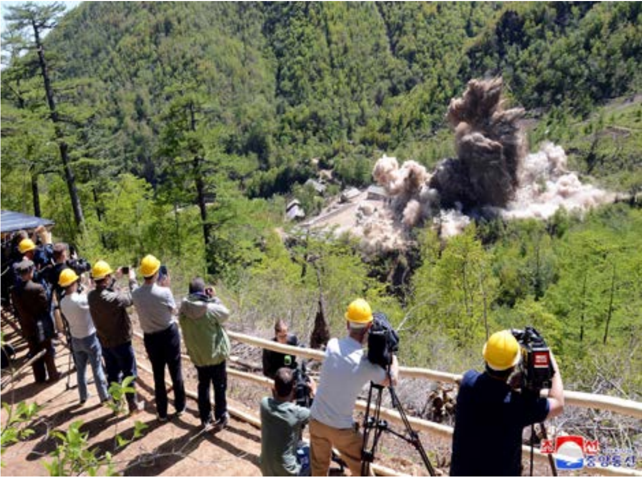
North Korea's nuclear test center was completely dismantled in accordance with the decision of the 3rd Plenary Meeting of the 7th General Conference of the Workers' Party of Korea in this undated photo