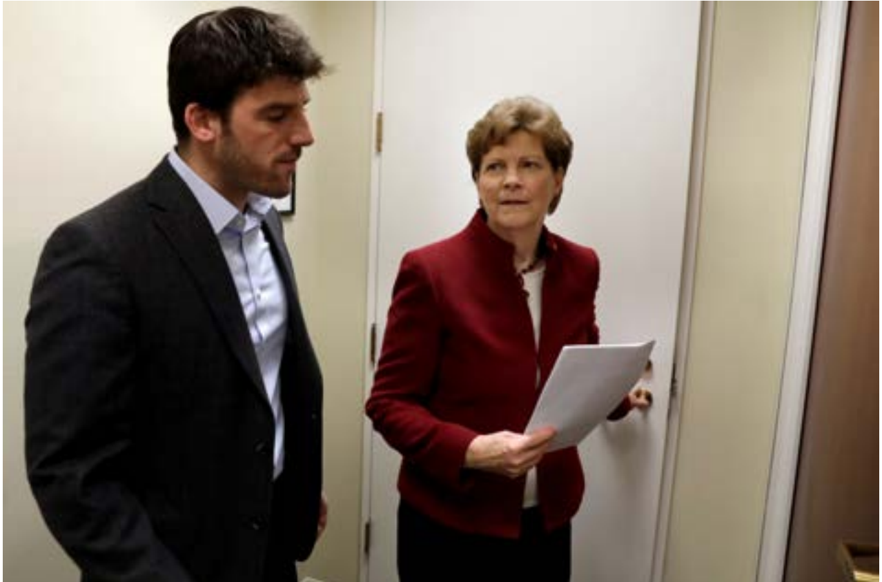
U.S. congressional leaders enter the U.S. Justice Department for classified briefings on an FBI probe into Russian election meddling in Washington

Schiff said he was speaking for all the Democrats who attended including top Senate Democrat Chuck Schumer, top House Democrat Nancy Pelosi, and top Senate Intelligence Committee Democrat Mark Warner.