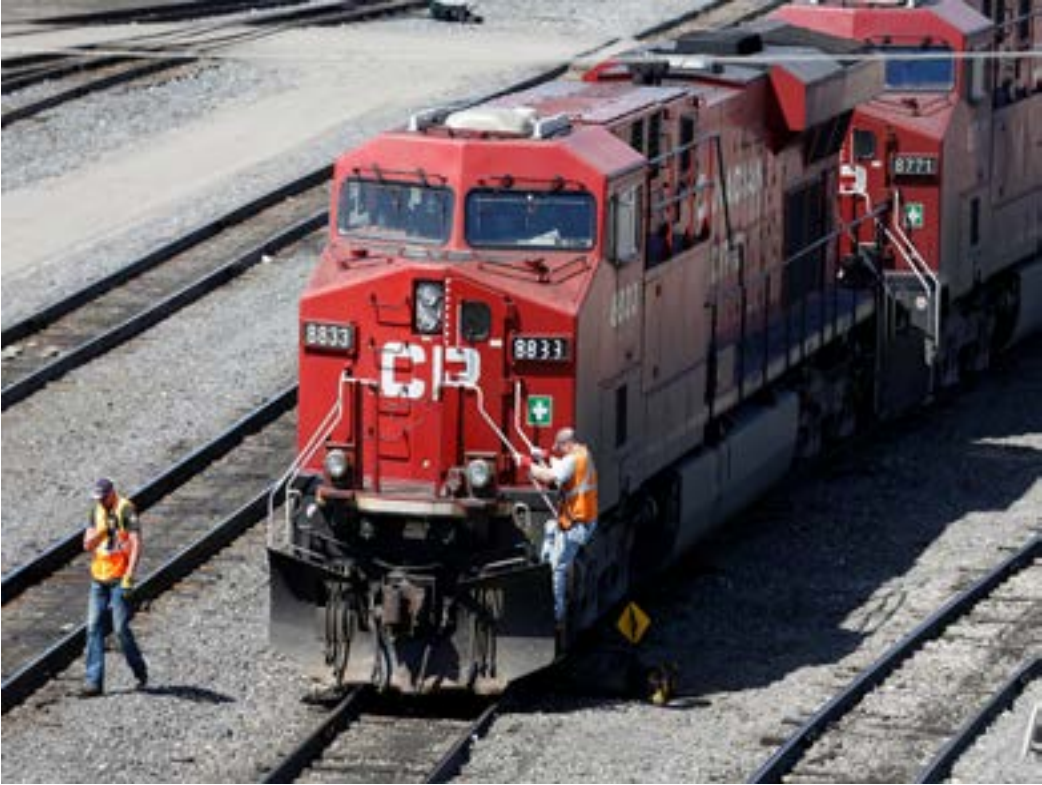
FILE PHOTO: A Canadian Pacific Railway crew works on their train at the CP Rail yards in Calgary