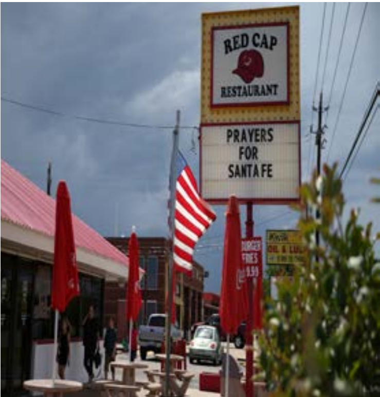
A sign at a local restaurant pays tribute to the victims killed in a shooting at Santa Fe High School in Santa Fe