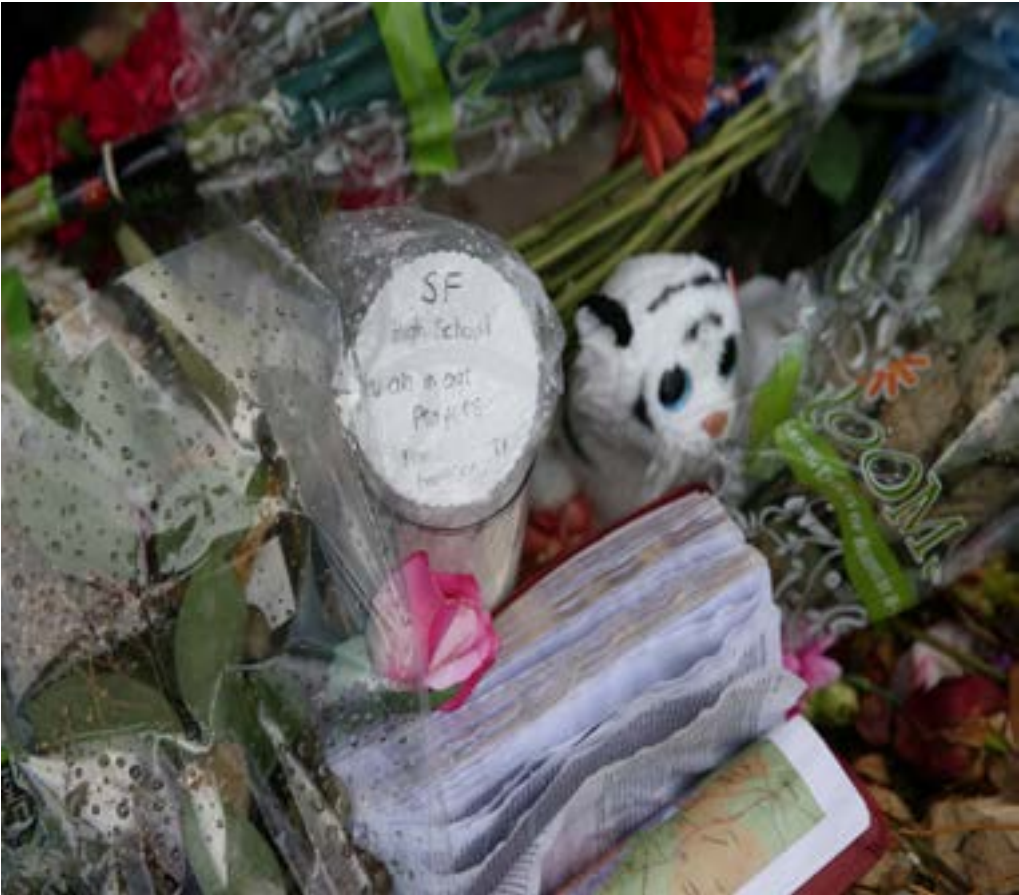
A makeshift memorial left in memory of the victims killed in a shooting at Santa Fe High School, is pictured in Santa Fe