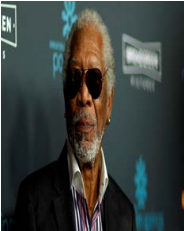
FILE PHOTO: Cast member Freeman poses at the premiere for "Just Getting Started" in Los Angeles