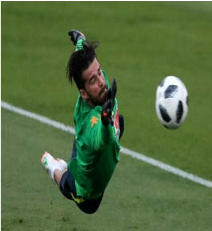
World Cup 2018 - Brazil national soccer team training