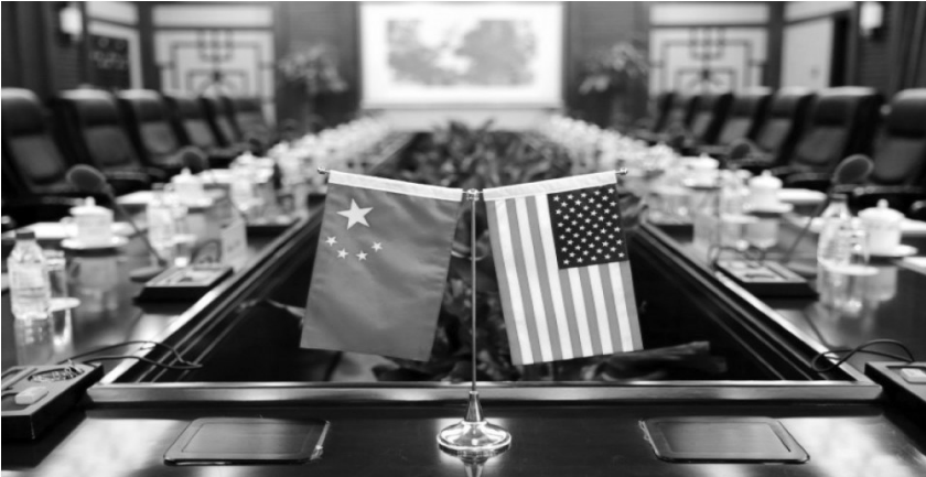
Flags are placed for a meeting of US and Chinese industry representatives, in Beijing, on July 20, 2017.