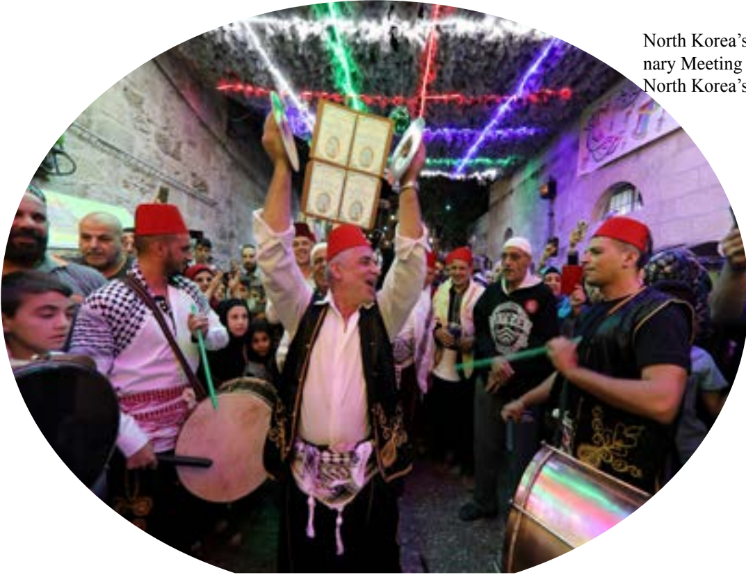
Palestinian musicians perform in Jerusalem's Old City during celebrations to mark the breaking of fast during the holy month of Ramadan