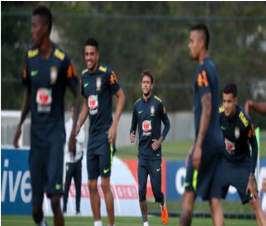
World Cup 2018 - Brazil national soccer team training