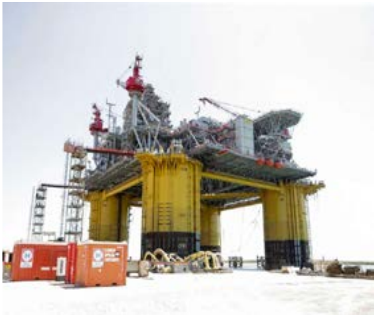
A Kiewit employee checks out the corner of the helipad on Shell's new Gulf deepwater platform, Appomattox, before it's set out to sea on Monday, April 23, 2018, in Ingleside, Texas. The helicopter is the most common way to switch crews once the platform is in place in the Gulf of Mexico.

That means the new discovery can be further drilled and developed through connections, called tiebacks, to the Appomattox to save costs, rather than build a new platform. The Appomattox is expected to start producing oil by the end of 2019 once it's fully set up. The Dover discovery is Shell's sixth in the Norphlet region of the Gulf where the Appomattox is centered. The Dover well is about 170 miles offshore and is located southeast of New Orleans.