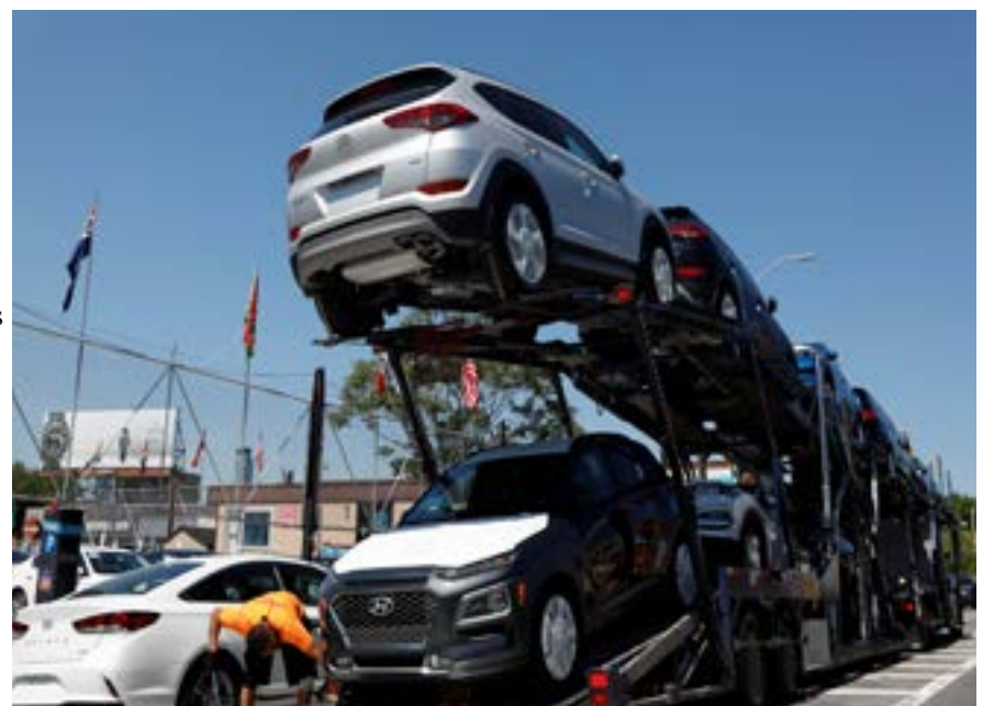
Automobiles are on a truck for delivery to a car lot in Queens

At the same time, the United States exported nearly 2 million vehi-