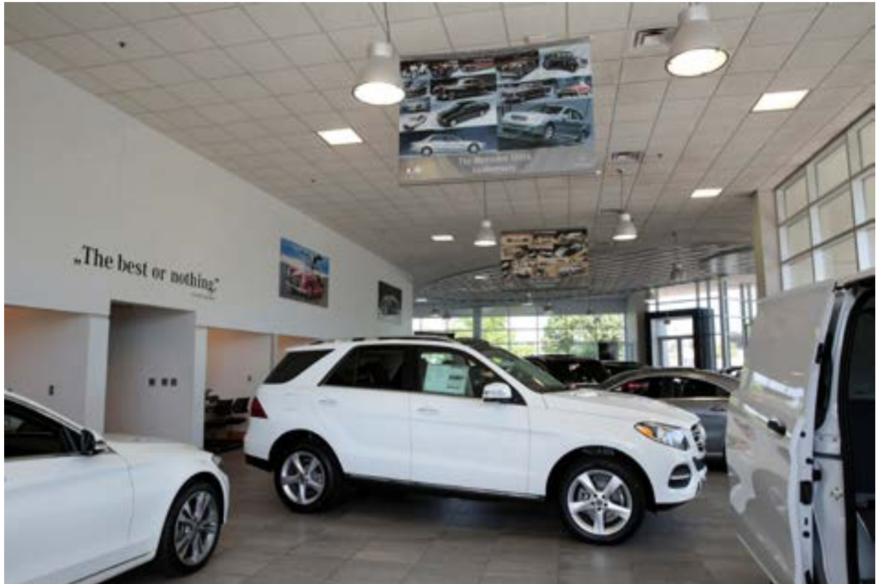
2018 Mercedes-Benz luxury vehicles are seen in the show room of Mercedes-Benz of Novi auto dealership in Novi, Michigan

U.S. Senate Finance Committee Chairman Orrin Hatch said possible auto tariffs are "deeply misguided," and urged the