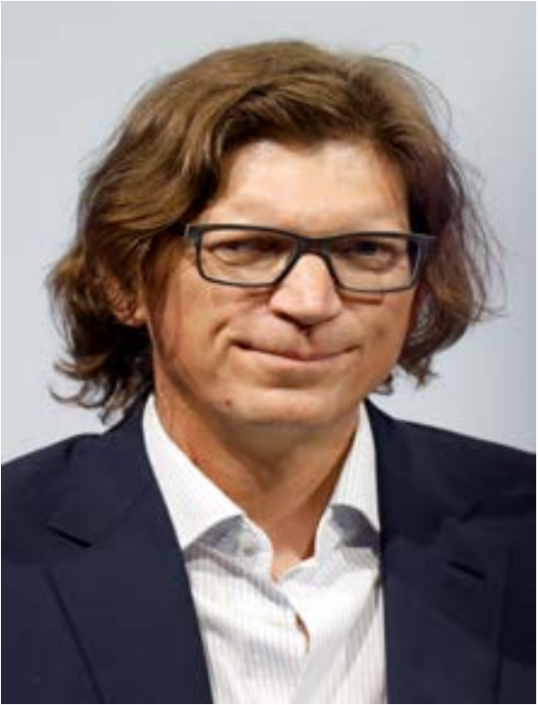
Niklas Zennstrom, founding partner and CEO at Atomic and co-founder and former CEO at Skype attends the Viva Tech start-up and technology summit in Paris