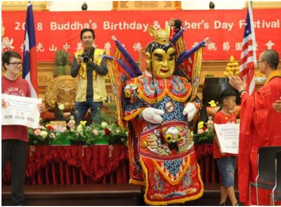
迎三太子 行三好慶佛誕 與 母親節