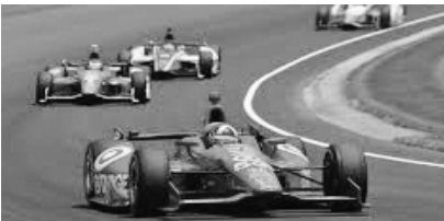
Indianapolis 500 Is A Memorial Day Tradition

The practice of decorating soldiers' graves with flowers is an ancient custom. Soldiers' graves were decorated in the U.S. before and during the American Civil War. A claim was made in 1906 that the first Civil War soldier's grave ever decorated was in Warrenton, Virginia on June 3, 1861, implying the first Memorial Day occurred there. There is authentic documentation that women in Savannah,