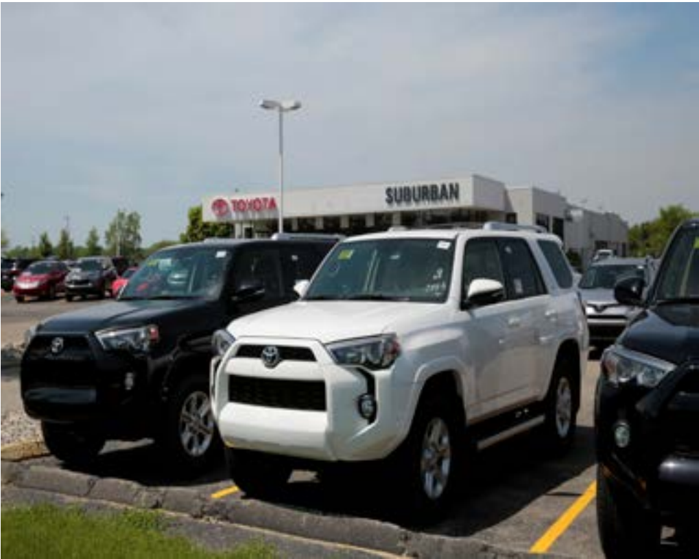
A 2018 Toyota 4Runner vehicle is seen for sale at the Toyota Suburban auto dealership in Farmington Hills, Michigan