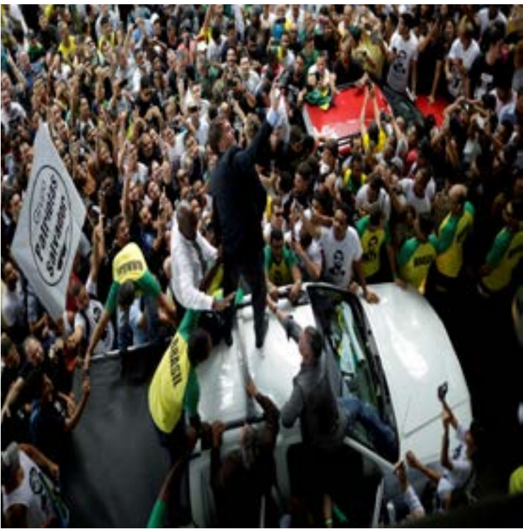
Federal deputy Jair Bolsonaro, a pre-candidate for Brazil's presidential election, is greeted by supporters as he arrives at Luis Eduardo Magalhaes International Airport in Salvador