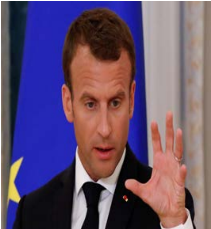
FILE PHOTO: French President Macron speaks during a news conference after the talks with his Russian counterpart Putin in St. Petersburg