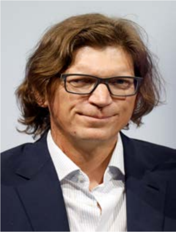
Niklas Zennstrom, founding partner and CEO at Atomic and co-founder and former CEO at Skype attends the Viva Tech start-up and technology summit in Paris