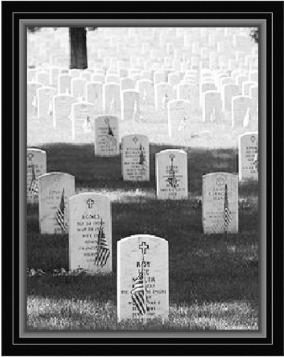
Arlington National Cemetery, Washington, D.C.

Memorial Day is a federal holiday in the U.S. that honors soldiers and is observed on the last Monday of May. Formerly known as Decoration Day, this day annually commemorates U.S. soldiers who died while in the military service. The day was first enacted to honor Union and Confederate soldiers following the American Civil War, then it was extended after World War I to honor Americans who have died in all wars. Memorial Day often marks the start of the summer vacation season, and Labor Day its end. Begun as a ritual of remembrance and reconciliation after the civil war, by the early 20th century, Memorial Day was an occasion for more general expressions of memory, as ordinary people visited the graves of their deceased relatives, whether they had served in the military or not. It also became a long weekend increasingly devoted to shopping, family gatherings, fireworks, trips to the beach, and national media events such as the Indianapolis 500 and the Coca-Cola 600 auto races. One of the longest-standing traditions, the Indianapolis 500, has been held in conjunction with Memorial Day since 1911. It runs on the Sunday preceding the Memorial Day holiday. The Coca-Cola 600 stock car race has been held later the same day since 1961. The Memorial Tournament golf event has been held on or close to the Memorial Day weekend since 1976.