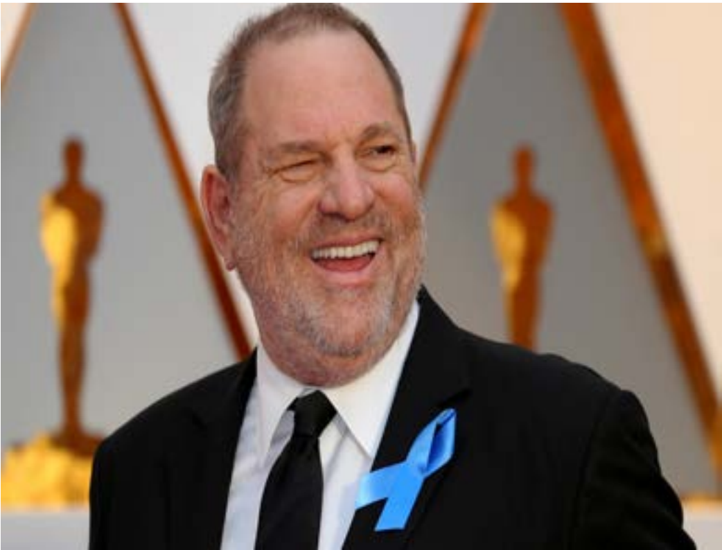
FILE PHOTO: Harvey Weinstein arrives at the 89th Academy Awards in Hollywood