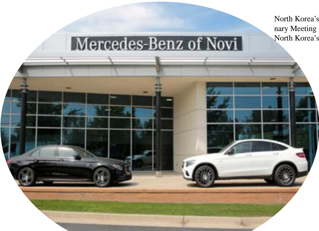
2018 Mercedes-Benz luxury vehicles are seen at the Mercedes-Benz of Novi auto dealership in Novi, Michigan