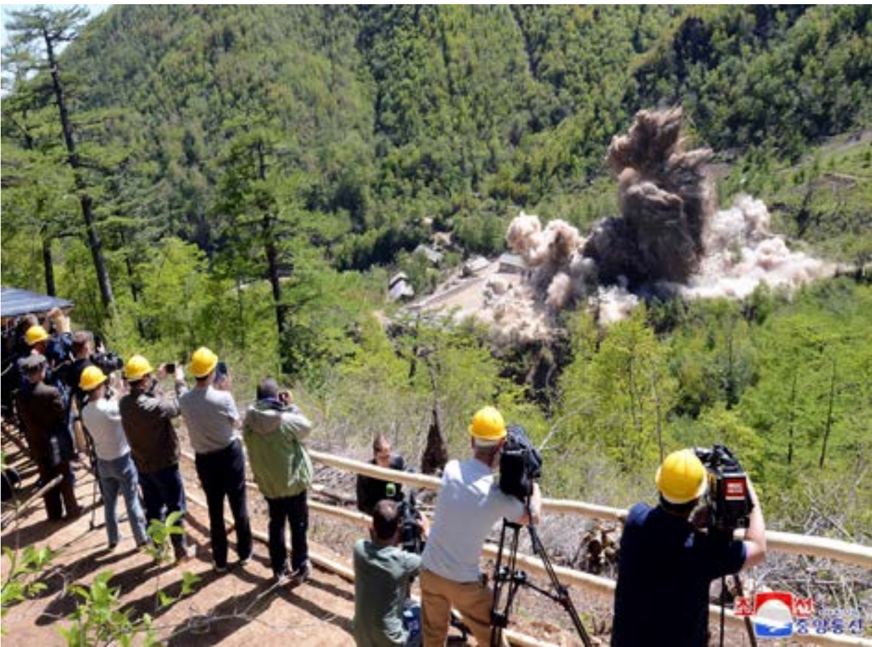
North Korea's nuclear test center was completely dismantled in accordance with the decision of the 3rd Plenary Meeting of the 7th General Conference of the Workers' Party of Korea in this undated photo released by North Korea's Korean Central News Agency