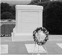
The Tomb of the Unknowns Located In Arlington National Cemetery.

Georgia decorated soldiers' graves in 1862. In 1863, the cemetery dedication at Gettysburg, Pennsylvania was a ceremony of commemoration at the graves of dead soldiers. Local historians in Boalsburg, PA, claim that ladies there decorated soldiers' graves on July 4, 1864. As a result, Boalsburg promotes itself as the birthplace of Memorial Day.