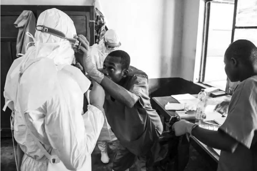
Health workers preparing to diagnose and treat suspected Ebola patients in the Democratic Republic of the Congo. EPA Officials to consider danger of Ebola spreading to other countries after disease reached Mbandaka, home to a million people.