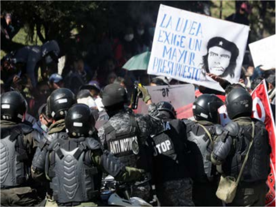
Riot policemen face students from the UPEA (Public University of El Alto) during a protest to demand an increase in their budget in El Alto,