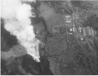
Lava from the Kilauea volcano approaches the Puna Geothermal Venture plant on Hawaii's Big Island on Monday.

In the weeks since the Kilauea volcano began belching lava into Hawaii's residential areas, the fiery flow has destroyed dozens of structures and covered scores of acres on the Big Island. But authorities fear its destructive reach could ravage at least two more cornerstones of the state: its power supply and, a little less tangibly, its all-important tourism industry.