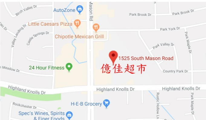
亞洲新天地位於 S. Mason Road 與 Highland Knolls Dr. 交叉口，周邊環繞發展成熟的住宅區與商圈，位居 Katy 的心臟地帶