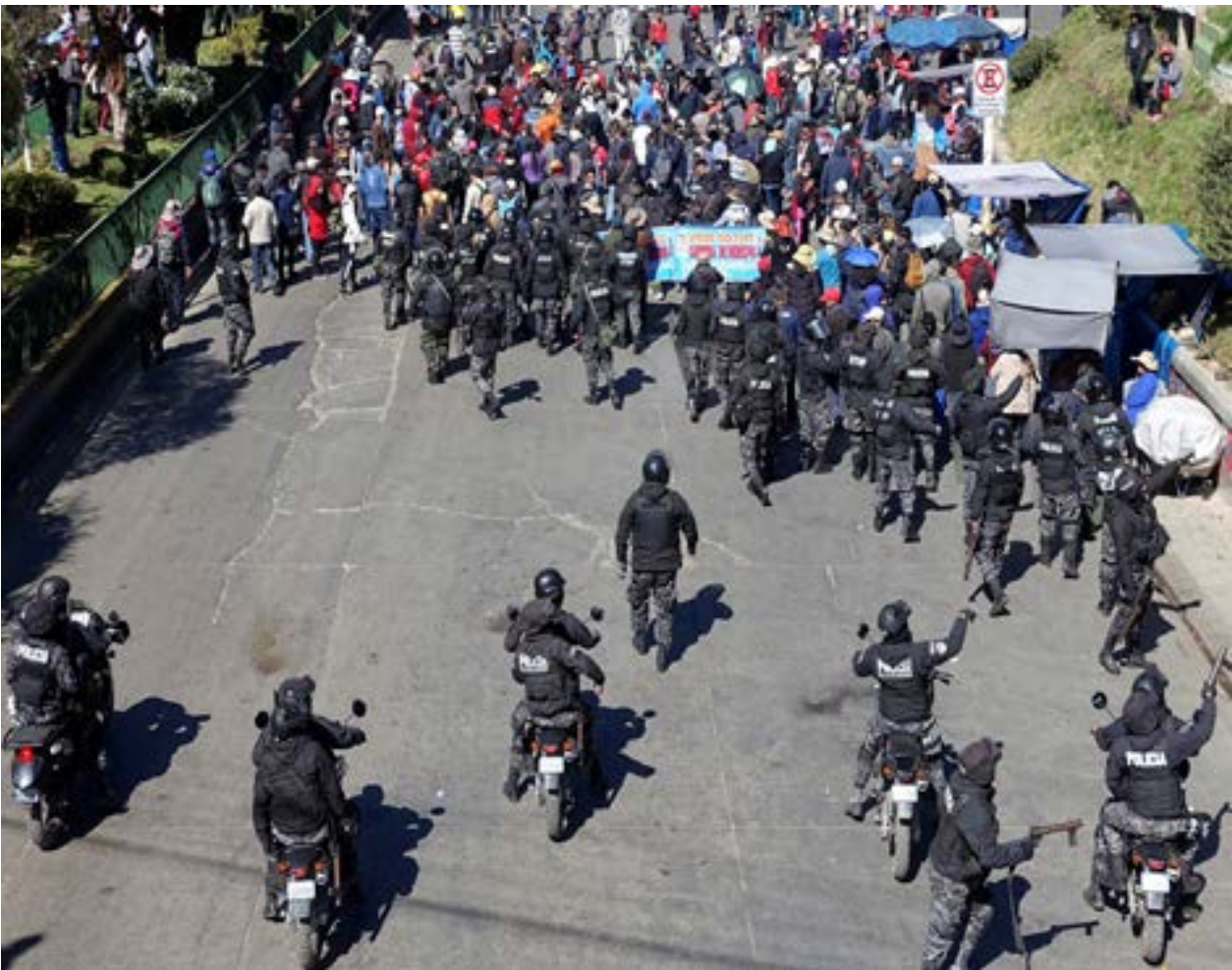
Riot policemen try to control a march of students from the UPEA (Public University of El Alto) during a protest to demand an increase in their budget in El Alto