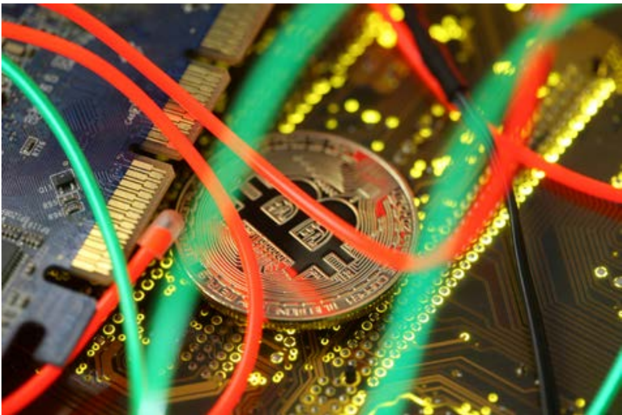
FILE PHOTO: Representation of the Bitcoin virtual currency standing on the PC motherboard is seen in this illustration picture

"So what we're going to see is that not only the European market goes dark for all of us; so all the bad guys will flow to Europe because you can actually access the world from Europe and there's no way you can get the data anymore," Jevans said.