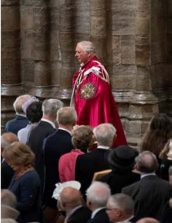
The Prince of Wales, Great Master of the Honourable Order of the Bath, attends the Service of Installation of Knights Grand Cross of the Order at Westminster Abbey in central