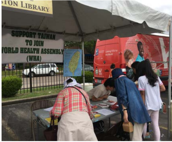
另為增進主流社區支持臺灣加入第71屆世界衛生大會(WHA)議題，現場並擺設致函美國衛福部長 Alex Azar 連署攤位，吸引許多僑胞以及主流人士響應。