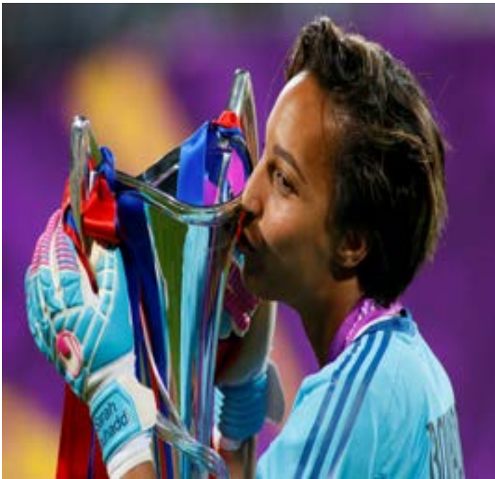
Women's Champions League Final - Olympique Lyonnais vs VfL Wolfsburg