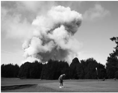
A golfer makes the best of the situation as a huge ash plume rises from Kilauea's summit nearby on Monday.

Meanwhile, elsewhere on the island, the longer the lava keeps flowing, the longer one of the state's premier tourist attractions remains closed to ensure visitors' safety. About two-thirds of Hawaii's Volcanoes National Park closed May 11, right around the start of the summer tourist season — and it remains closed, likely deterring a substantial chunk of the park's more than 2 million annual visitors.