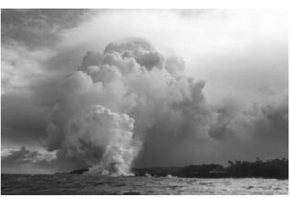
A plume of steam rises as lava enters the ocean near Pahoa, Hawaii, Sunday, May 20, 2018.

Warnings from the USGS and the Philippine Institute of Volcanology helped save over 5,000 lives ahead of Mount Pinatubo's eruption.