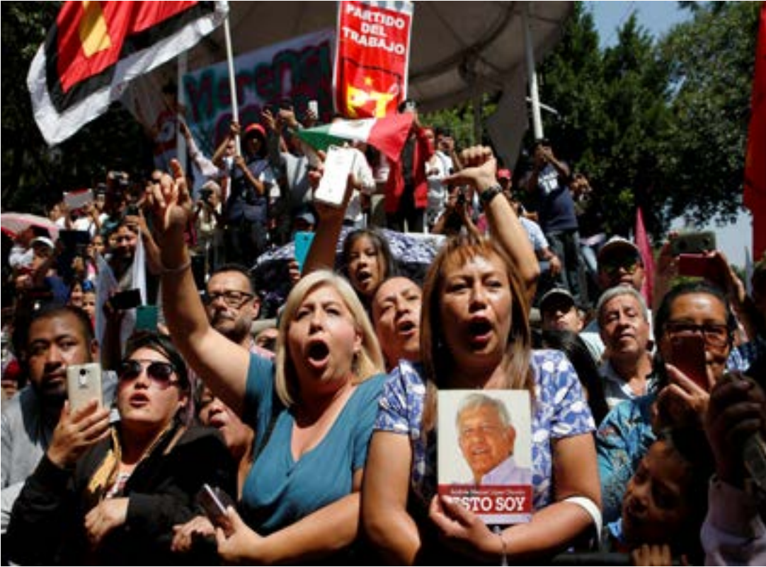
Supporters of leftist front-runner Andres Manuel Lopez Obrador of MORENA shout slogans during a campaign rally in Mexico City