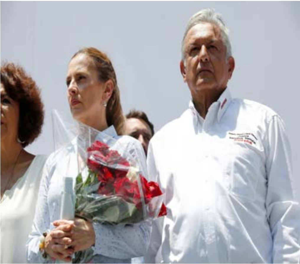
Leftist front-runner Andres Manuel Lopez Obrador of MORENA and his wife Beatriz Gutierrez Muller attend a campaign rally in Mexico City