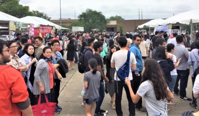
「Taiwan Yes Taiwan Song 台灣夜市台灣頌」小吃美食園遊會熱鬧情景