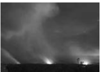
Lava shoots into the night sky from active fissures on the lower east rift of the Kilauea volcano, Tuesday, May 15, 2018 near Pahoa, Hawaii.