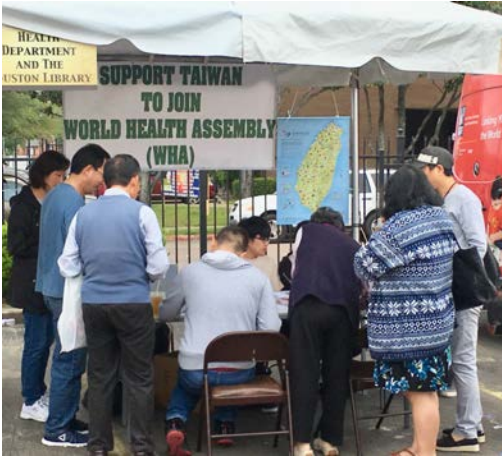
另為增進主流社區支持臺灣加入第71屆世界衛生大會(WHA)議題，現場並擺設致函美國衛福部長 Alex Azar 連署攤位，吸引許多僑胞以及主流人士響應。