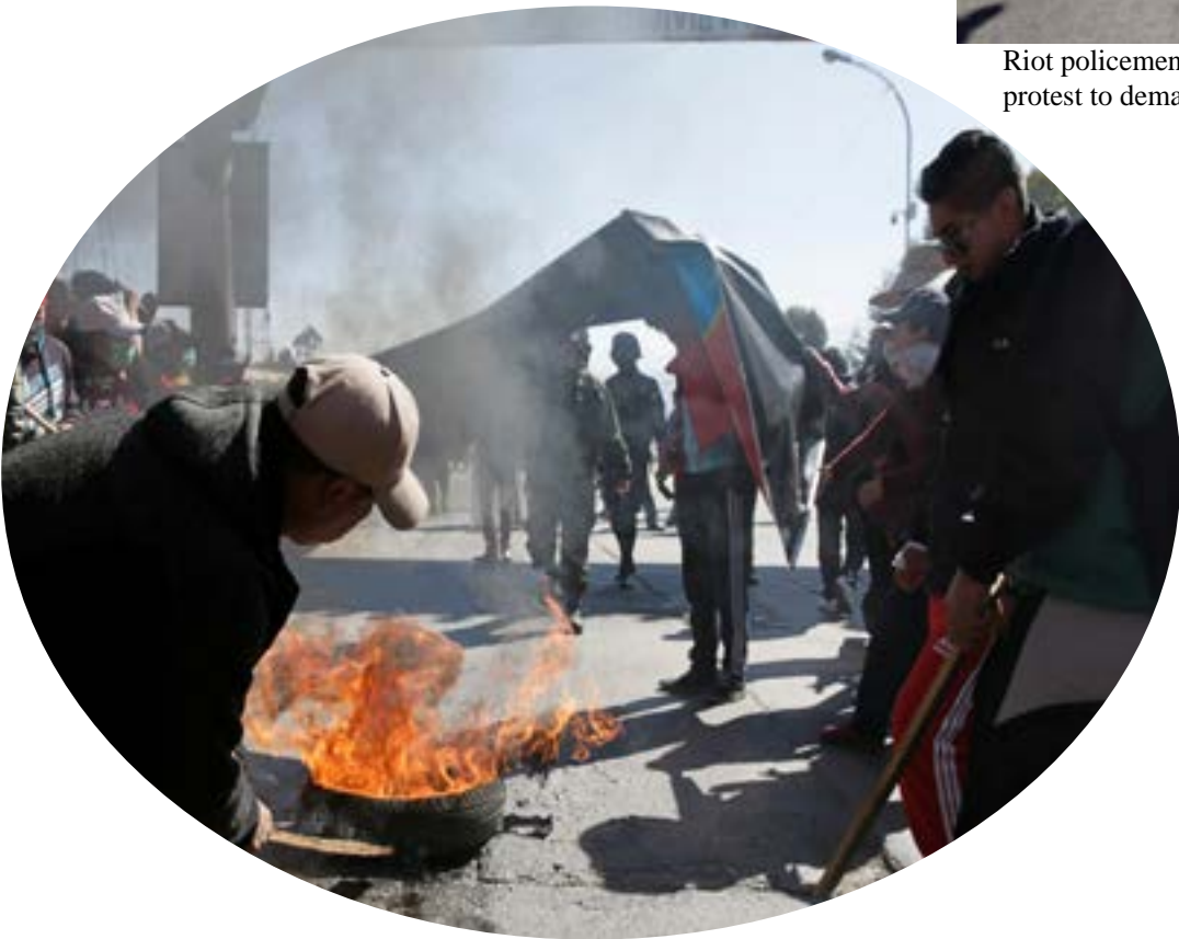
Students from the UPEA (Public University of El Alto) burn a tire during a protest to demand an increase in their budget in El Alto outskirts in La Paz