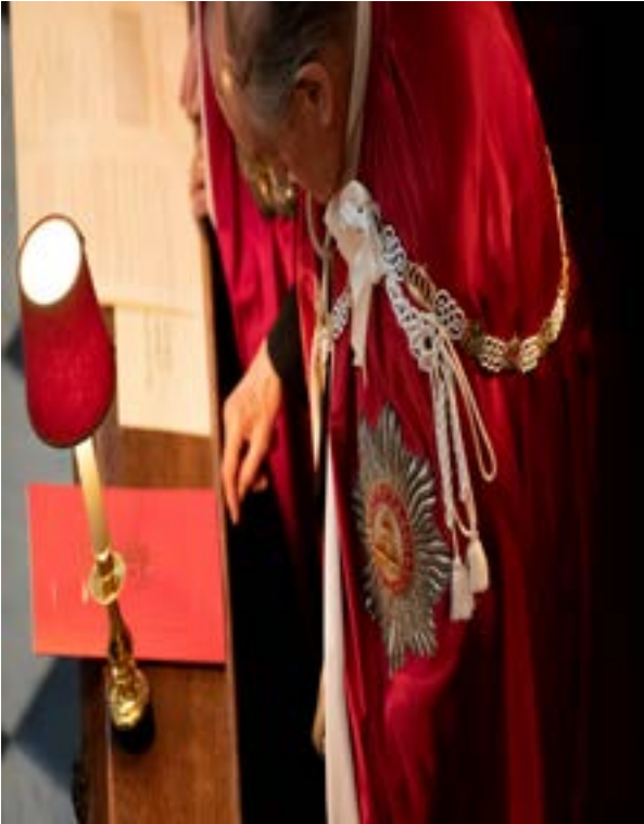
A member of the Order of the Bath as the Prince of Wales, Great Master of the Honourable Order of the Bath, attends the Service of Installation of Knights Grand Cross of the Order at Westminster Abbey in central London