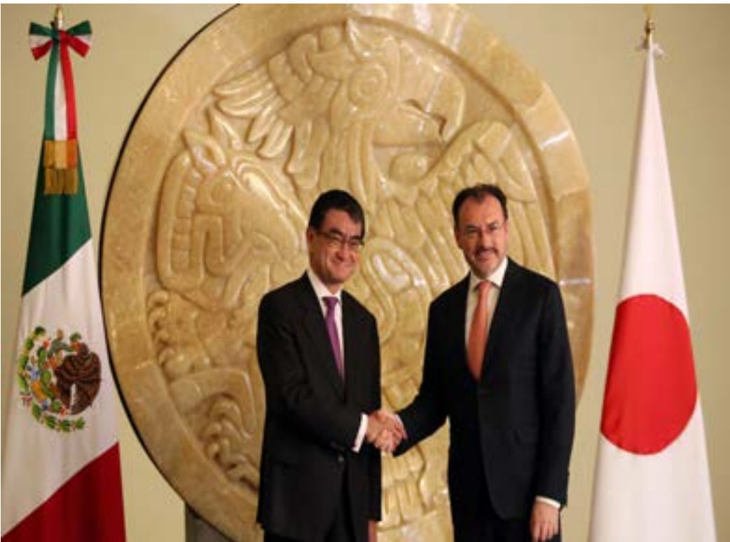
Mexico's Foreign Minister Luis Videgaray shakes hands with his Japanese counterpart Taro Kono during a welcoming ceremony in Mexico City