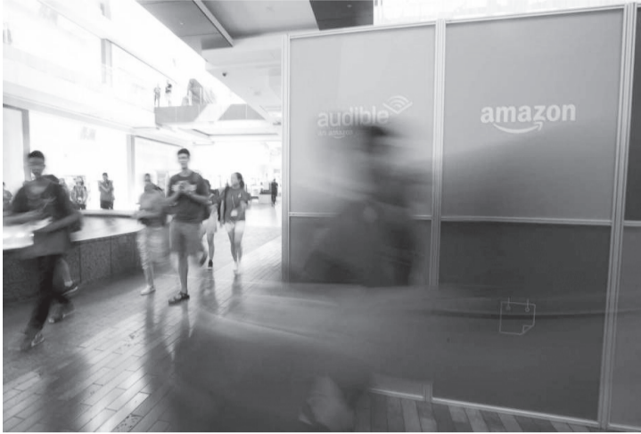
Temporary walls surround the site of a new Amazon kiosk at the Galleria on Friday, July 27, 2018 in Houston. Shopping centers like the Galleria have seen more e-commerce companies opening physical brick-and-mortar locations.