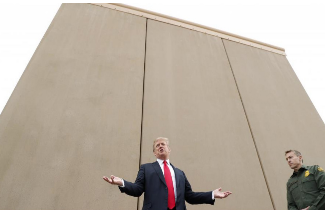
GOP Plan to Avoid Another Shutdown: Delay the Fight over Trump's Wall.

Standoffs over spending levels and immigration led to a three-day government shutdown, mostly over a weekend, in January and an