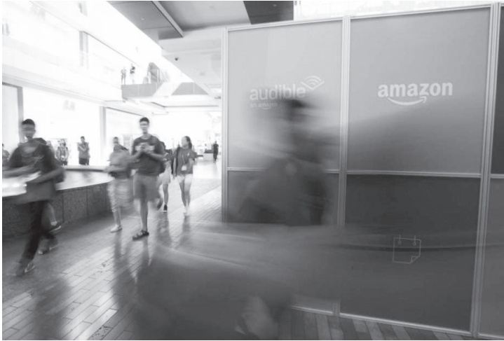
Temporary walls surround the site of a new Amazon kiosk at the Galleria on Friday, July 27, 2018 in Houston. Shopping centers like the Galleria have seen more e-commerce companies opening physical brick-and-mortar locations.