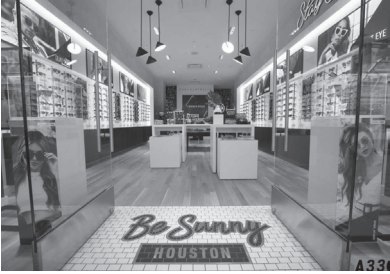
A peek inside the new Quay sunglasses boutique at the Galleria on Friday, July 27, 2018 in Houston. Shopping centers like the Galleria have seen more e-commerce companies opening physical brick-and-mortar locations.