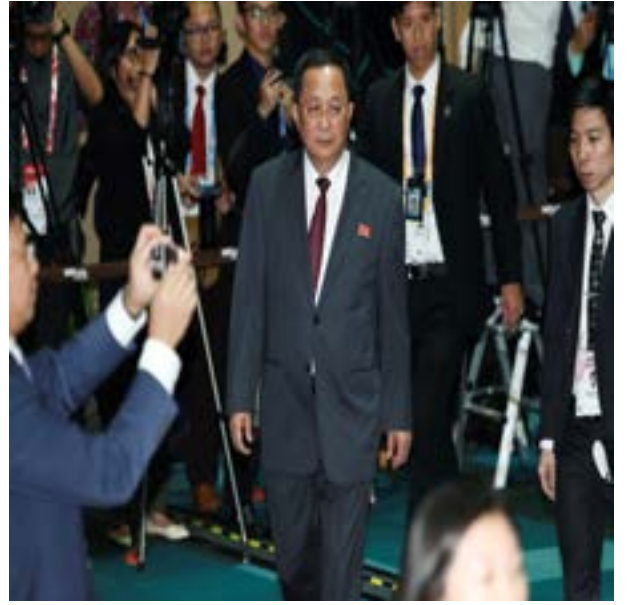
North Korea's Foreign Minister Ri Yong Ho arrives for the Asean Regional Forum Retreat Session in Singapore

intention," he said. Ri made the statement after U.S. Secretary of State Mike Pompeo had left the Singapore conference center for Indonesia having pressed Southeast Asian nations to maintain sanctions on North Korea until it gives up a nuclear weapons program that now threatens the United States. At the June 12 summit, Kim, who is seeking relief from tough sanctions, committed to work towards denuclearisation, but North Korea has offered no details on how it might go about this. Pompeo suggested on Friday that continued work on weapons programs by North Korea was inconsistent with Kim's commitment to denuclearize. On Saturday, he nevertheless said he was optimistic a North Korean denuclearisation could be achieved although it "would take some time." Ri said North Korea had made goodwill gestures, including a moratorium on nuclear tests and rocket launches and the dismantling of a nuclear test ground. "However, the United States, instead of responding to these measures, is raising its voice louder for maintaining the sanctions against the DPRK and showing the attitude to retreat even from declaring the end of the war, a very basic and primary step for providing peace