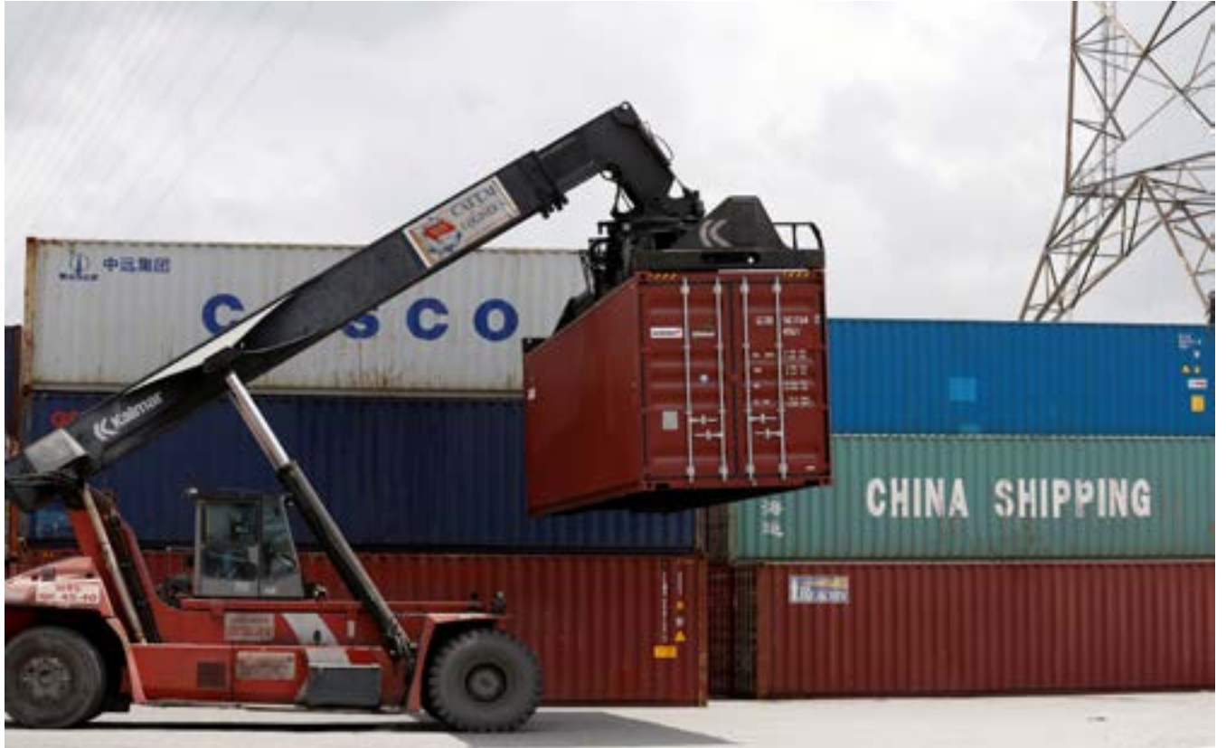
Containers of China Shipping and Cosco are loaded at a port in Ho Chi Minh City

the sidelines of a regional forum in Singapore. Pompeo added that he had discussed trade issues with Chinese State Councillor Wang Yi on Friday. Malaysian Foreign Minister Saifuddin Abdullah said he met Pompeo in Singapore and that his message was clear. "My objective was quite straightforward: I think I need to inform him that we are very concerned," said Saifuddin. Countries like Malaysia form an integral part of Chi-