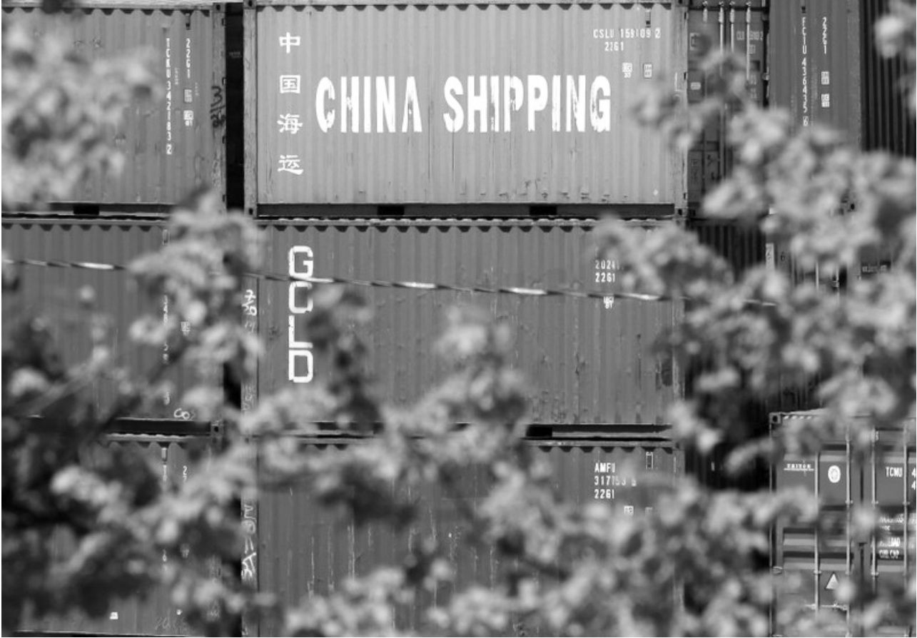
Shipping containers, including one labelled “China Shipping,” are stacked at the Paul W. Conley Container Terminal in Boston, Massachusetts, U.S., May 9, 2018.