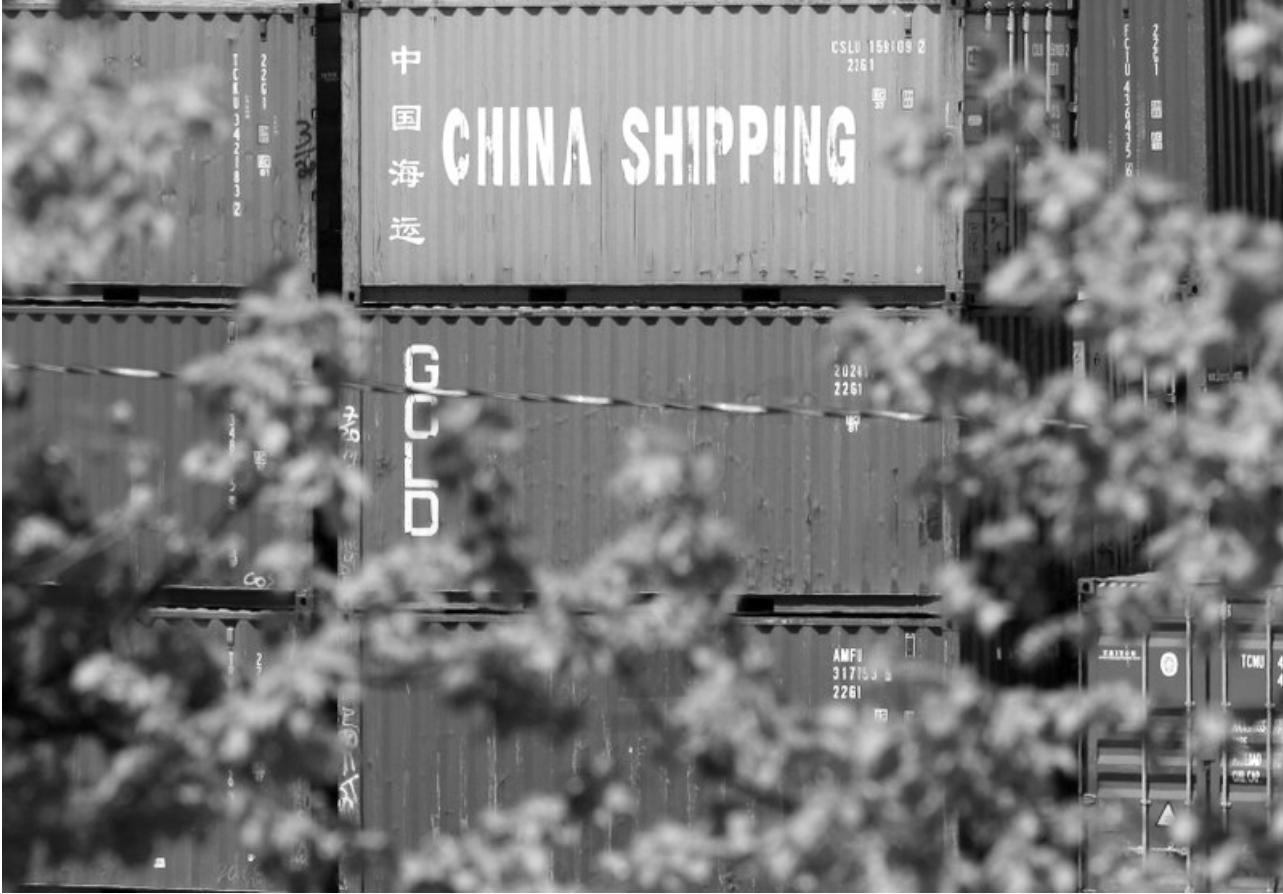
Shipping containers, including one labelled "China Shipping," are stacked at the Paul W. Conley Container Terminal in Boston, Massachusetts, U.S., May 9, 2018.