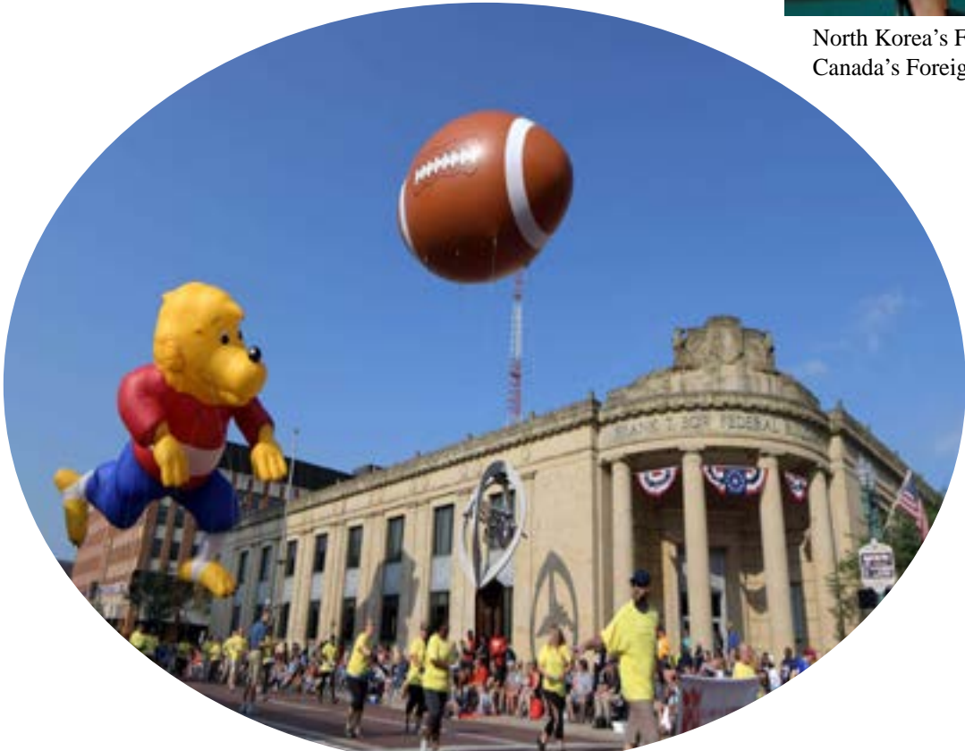
Aug 4, 2018; Canton, OH, USA; The Berenstain Brother Bear balloon passes by the Frank T. Bow Federal Building and United States Courthouse during the Pro Football Hall of Fame Grand Parade on Cleveland Avenue.