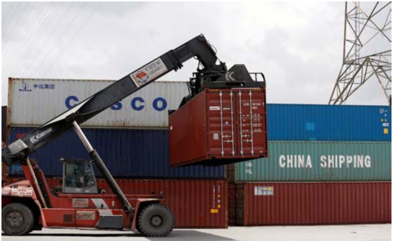
Containers of China Shipping and Cosco are loaded at a port in Ho Chi Minh City

the sidelines of a regional forum in Singapore. Pompeo added that he had discussed trade issues with Chinese State Councillor Wang Yi on Friday. Malaysian Foreign Minister Saifuddin Abdullah said he met Pompeo in Singapore and that his message was clear. "My objective was quite straightforward: I think I need to inform him that we are very concerned," said Saifuddin. Countries like Malaysia form an integral part of Chi-