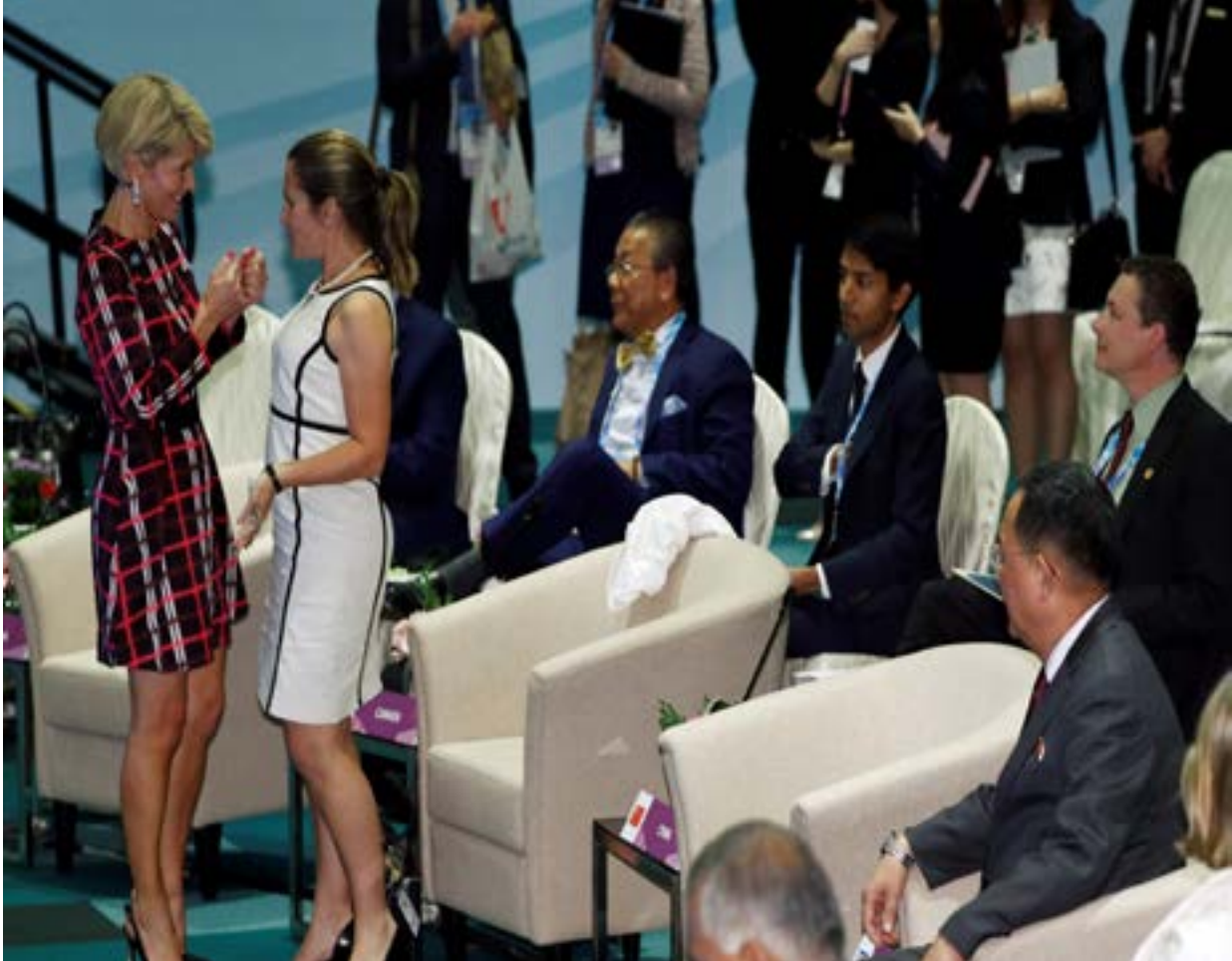
North Korea's Foreign Minister Ri Yong Ho looks on as Australia's Foreign Minister Julie Bishop greets Canada's Foreign Minister Chrystia Freeland at the Asean Regional Forum Retreat Session in Singapore