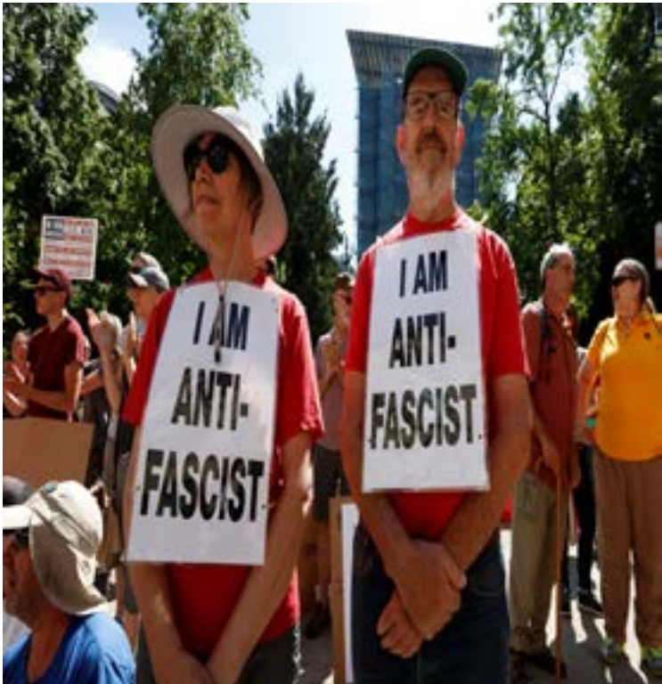
Members of the right-wing Patriot Prayer group gather before a rally in Portland