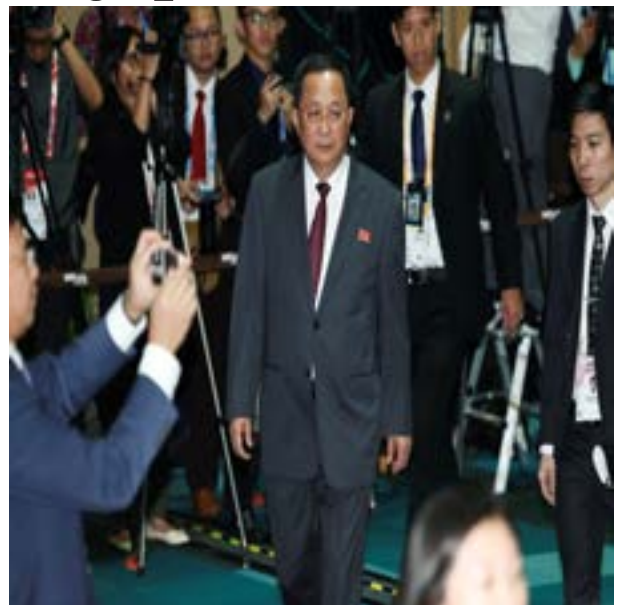
North Korea's Foreign Minister Ri Yong Ho arrives for the Asean Regional Forum Retreat Session in Singapore

intention," he said. Ri made the statement after U.S. Secretary of State Mike Pompeo had left the Singapore conference center for Indonesia having pressed Southeast Asian nations to maintain sanctions on North Korea until it gives up a nuclear weapons program that now threatens the United States. At the June 12 summit, Kim, who is seeking relief from tough sanctions, committed to work towards denuclearisation, but North Korea has offered no details on how it might go about this. Pompeo suggested on Friday that continued work on weapons programs by North Korea was inconsistent with Kim's commitment to denuclearize. On Saturday, he nevertheless said he was optimistic a North Korean denuclearisation could be achieved although it "would take some time." Ri said North Korea had made goodwill gestures, including a moratorium on nuclear tests and rocket launches and the dismantling of a nuclear test ground. "However, the United States, instead of responding to these measures, is raising its voice louder for maintaining the sanctions against the DPRK and showing the attitude to retreat even from declaring the end of the war, a very basic and primary step for providing peace