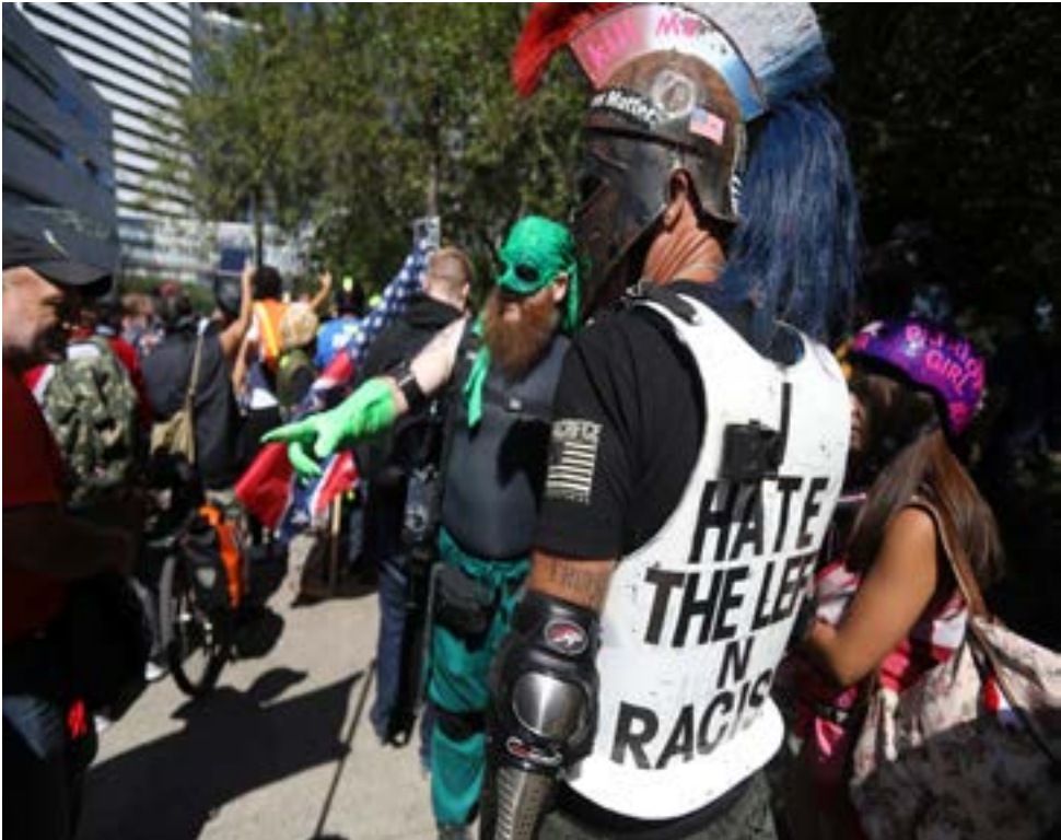
Members of the right-wing Patriot Prayer group gather before a rally in Portland