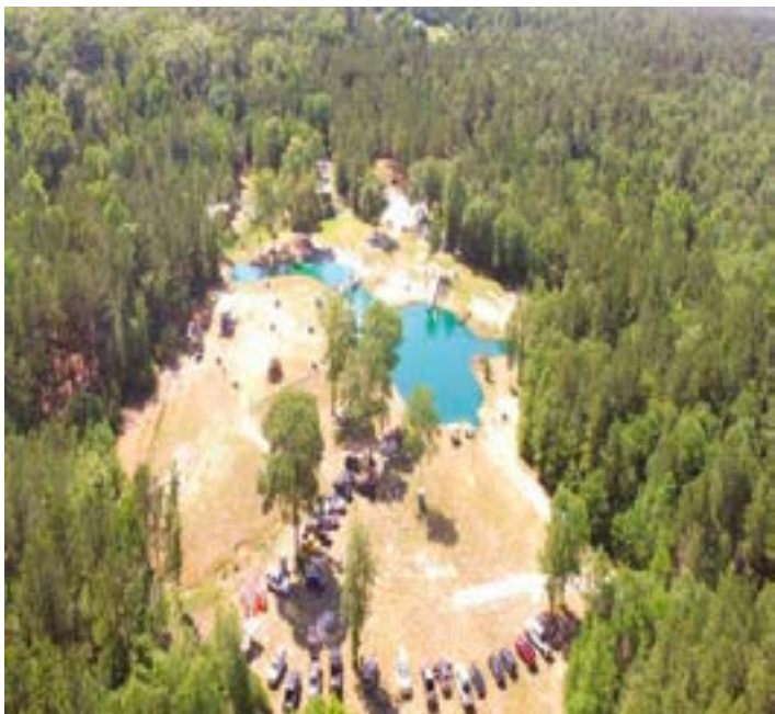
Scenes from Chadillac's Backyard Waterpark, 16038 Crowley Road in Conroe.

Chadillac's Backyard Waterpark in Conroe is up for sale, about a year after the popular, laid-back hangout spot first opened. This swimming hole in the woods, owned by Chad Mehr, has attracted visitors from across the Houston area who want fun in the sun without the typical waterpark crowds and massive expanses of concrete. The 21-acre property was listed Thursday for $2.8 million. The sale will include all of the waterpark amenities, including diving platforms, a 40-foot slide, rope swing, concert stage and sand volleyball court. A couple of guys in Conroe have turned an empty piece of land into an amped-up Texas swimming hole, and in just a few weeks it's quickly becoming a wildly popular hangout spot. Chadillac's Backyard Waterpark, owned by Chad Mehr, started out as a hole in the ground, but its expanding list of fun amenities are attracting growing weekend crowds. Listing agent Crystal Wells said Mehr has enjoyed running the waterpark since the spring of 2017, but he's ready to move on. "He's just ready for a new adventure," Wells said. Chadillac's will continue operating until its summer season closes at the end of September. The property is located at 16038 Crowley Road, west of Conroe and south of Texas 105.