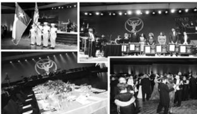
Houston's Consular Ball 2016

Congress mandated the creation of the Office of Foreign Missions (OFM) to serve the interests of the American public, American diplomats serving abroad, and the foreign diplomats residing in the U.S. This office is charged with ensuring that diplomatic benefits and privileges are properly exercised in accordance with U.S. law and international agreements.