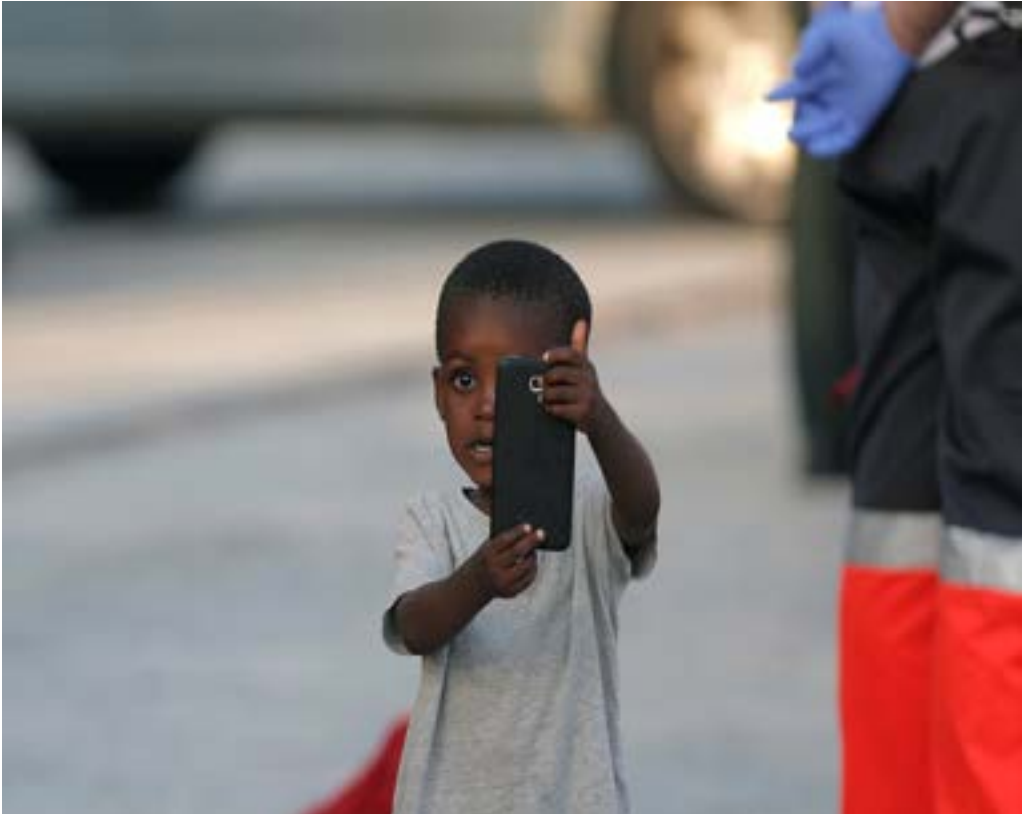
A migrant child, intercepted aboard a dinghy off the coast in the Mediterranean Sea, plays to takes pictures of the media with a mobile phone, after arriving on a rescue boat at the port of Malaga