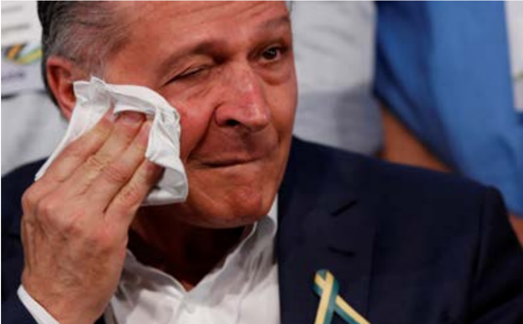
Alckmin, a candidate for the presidency of the Republic of Brazil, reacts during the National Convention of the PSDB in Brasilia