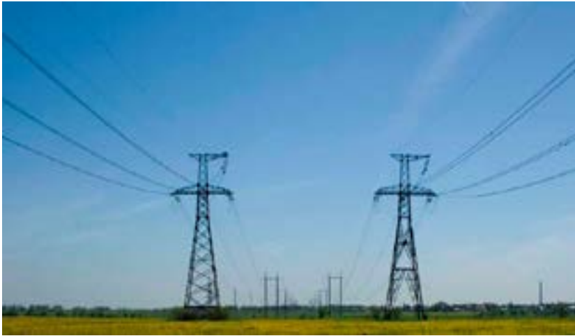
Customers in deregulated Texas power markets pay more than those in regulated markets, according to a new study.

The highest gas consumption ever recorded on the power grid was 37.2 Bcf per day in August 2016.