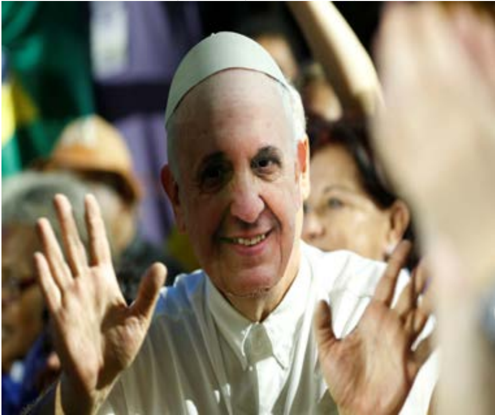
A supporter of Geraldo Alckmin, a candidate for the presidency of the Republic of Brazil, wears a mask of Pope Francis, a candidate for the presidency of the Republic of Brazil, during the National Convention of the PSDB in Brasilia