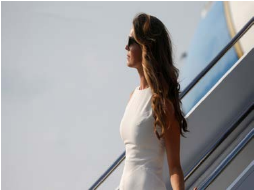
Former White House Communications Director Hope Hicks exits Air Force One behind U.S. President Donald Trump after they arrived at the John Glenn Columbus International Airport in Columbus