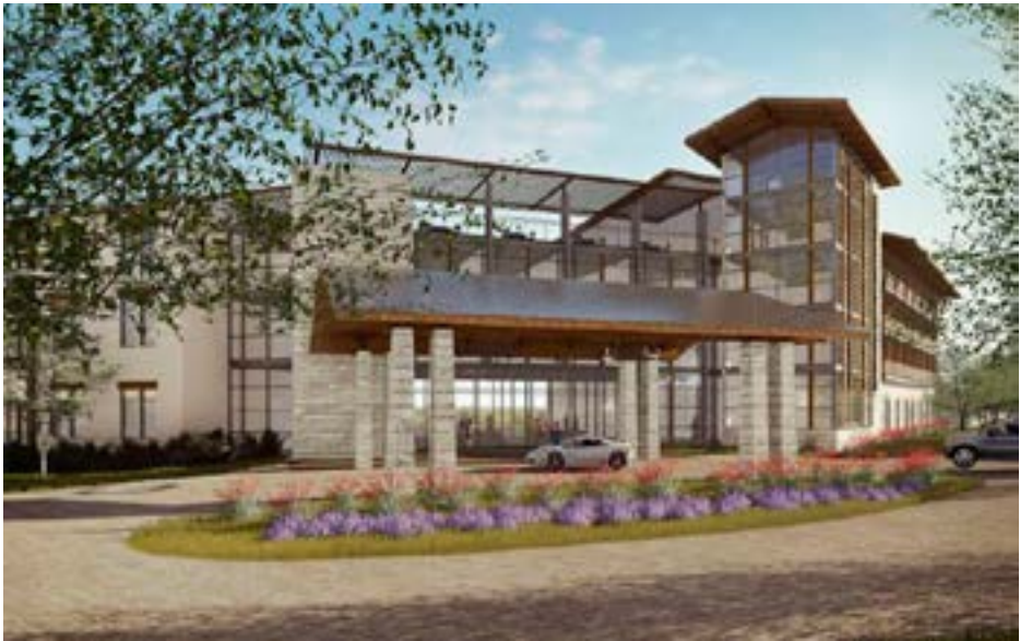
Fredericksburg in Central Texas is expected to have the massive 22 acre Seven Hills Resort and Conference Center begin construction this fall. The project will cost $78 million.

The resort will include a rooftop bar, 35,000-square-foot conference center, 40,000-square-feet of shopping and food, and an outdoor amphitheater. Benchmark Global Hospitality, which is based in the Woodlands, will manage the hotel and conference center, Davies added.