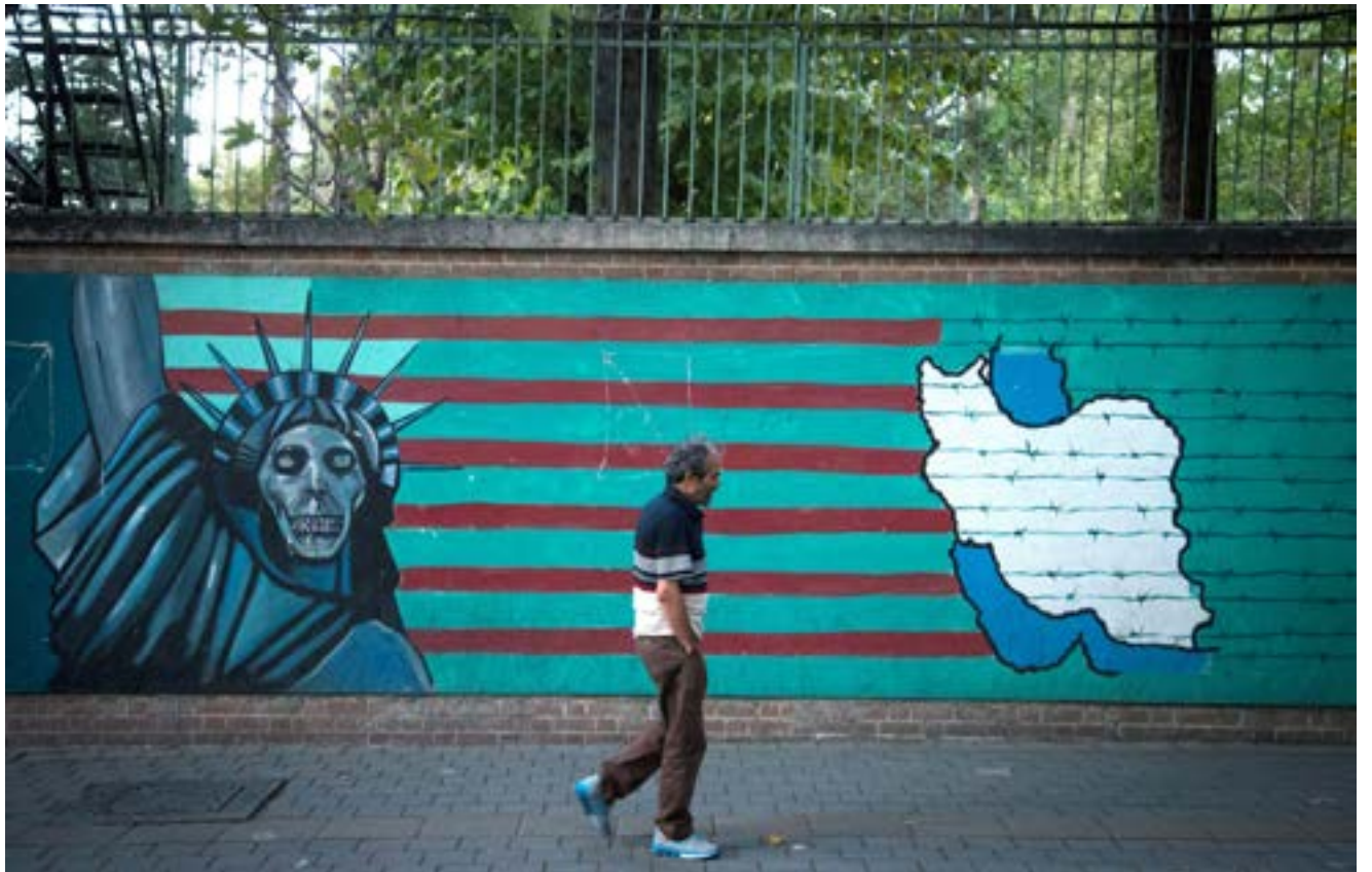
FILE PHOTO: FILE PHOTO-A man walks past an anti-U.S. mural in Tehran, Iran October 13, 2017.

Trump announced in May this year he would withdraw