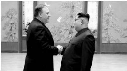
A photo released by the White House shows Mike Pompeo, then C.I.A. director, meeting with North Korea's leader, Kim Jong-un, in Pyongyang during Easter weekend.

North Korean state media KCNA reported Wednesday that Trump had discussed lifting sanctions against Pyongyang during his talks with Kim in Singapore.