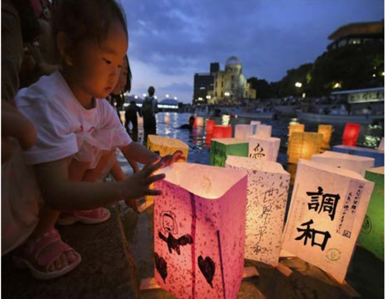
A girl releases paper lanterns on the Motoyasu river facing the gutted Atomic Bomb Dome in remembrance of atomic bomb victims on the 73rd anniversary of the bombing of Hiroshima