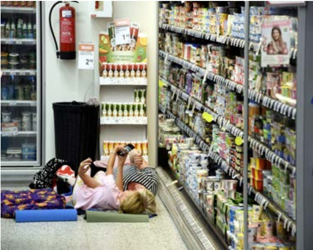
A local grocery store invited customers for a sleepover to cool off as the heatwave continues in Helsinki, Finland August 4, 2018. Picture taken August 4, 2018.