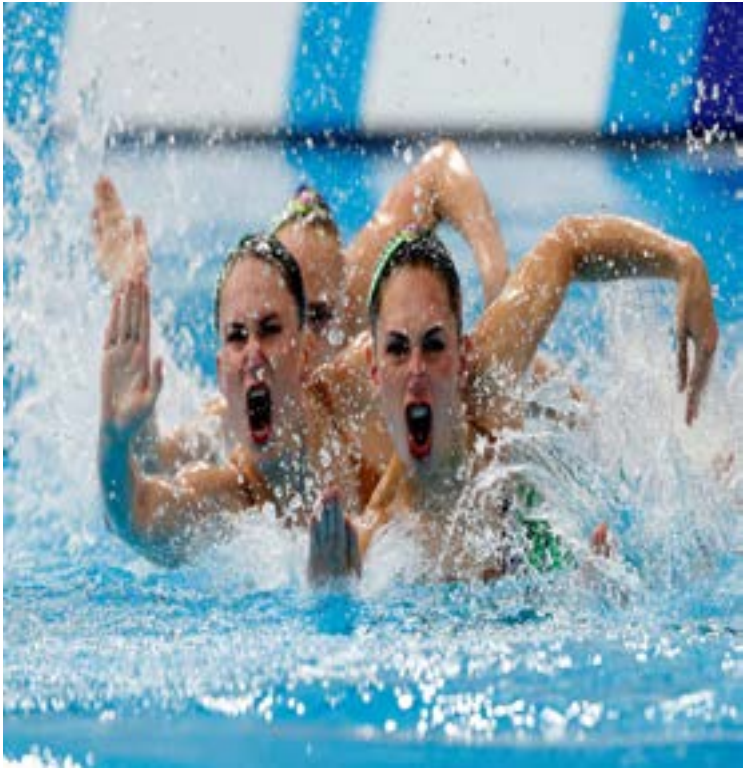
2018 European Championships - Synchronised Swimming Team Technical Routine Final - Scotstoun Sports Campus, Glasgow, Britain - August 6, 2018 - Team Belarus compete.