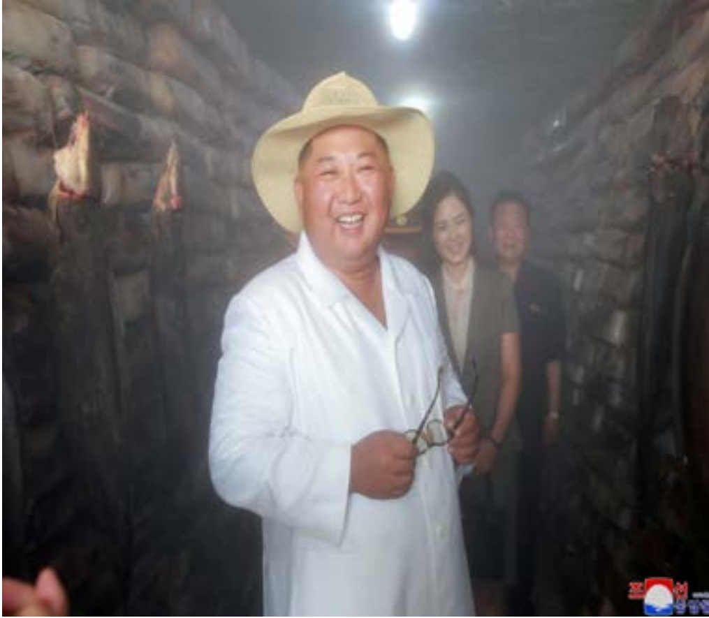
North Korean leader Kim Jong Un provides field guidance at a catfish plant