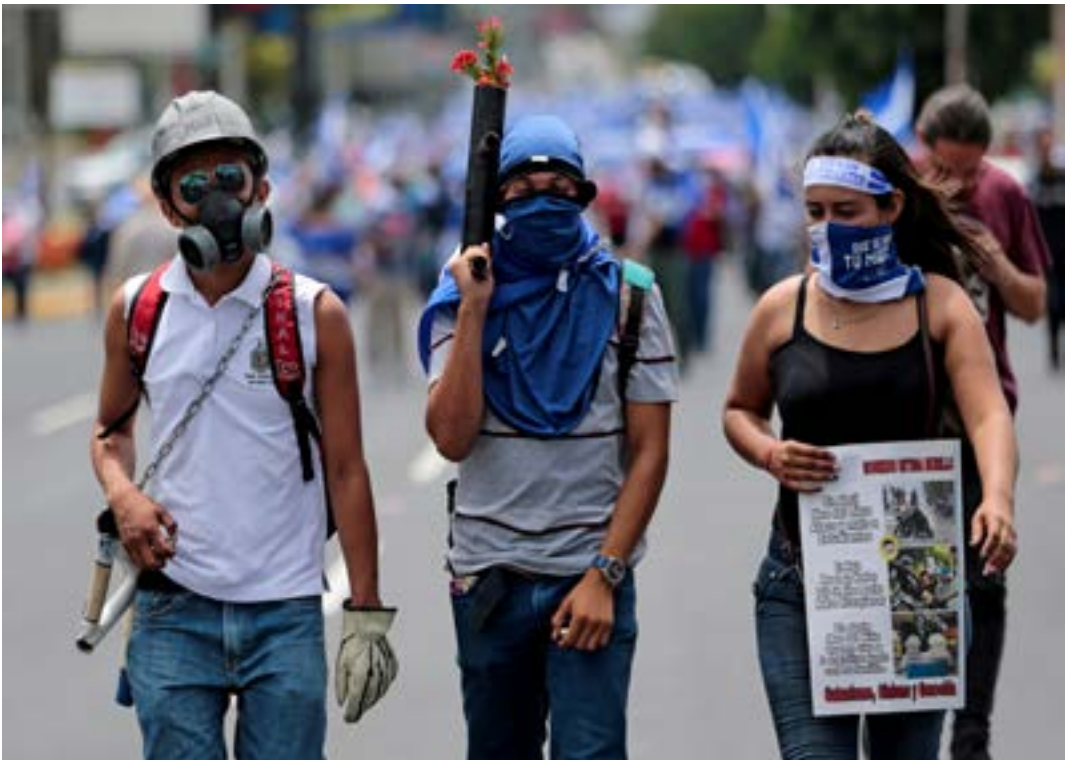
Demonstrators take part in a protest against Nicaraguan President Daniel Ortega's government in Managua