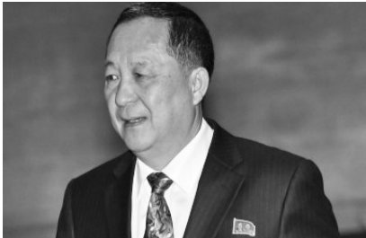
North Korean Foreign Minister Ri Yong Ho

"There are many productive conversations to be had," Ri replied when the top U.S. diplomat suggested the two should meet, per the Washington Post. Another U.S. diplomat then "approached Ri and handed him a white envelope bearing a letter" for Kim from President Trump. In his ensuing speech, though, Ri implied that Pompeo is out of step with Trump's pledges at the June 12 summit with Kim. "What is alarming however is the insistent moves manifested within the U.S. to go back to the old, far from its leader's intention," he said.