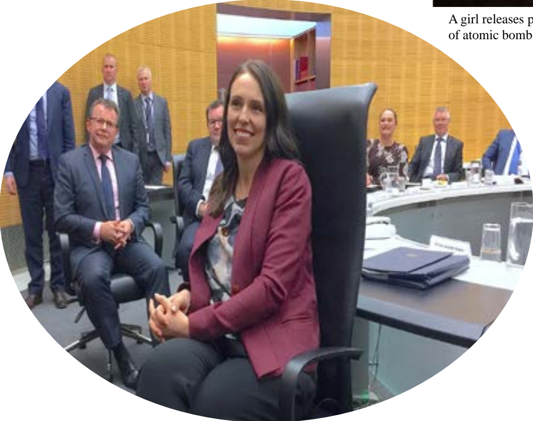
New Zealand Prime Minister Jacinda Ardern sits in a chair as she attends her first cabinet meeting since returning from maternity leave in Wellington