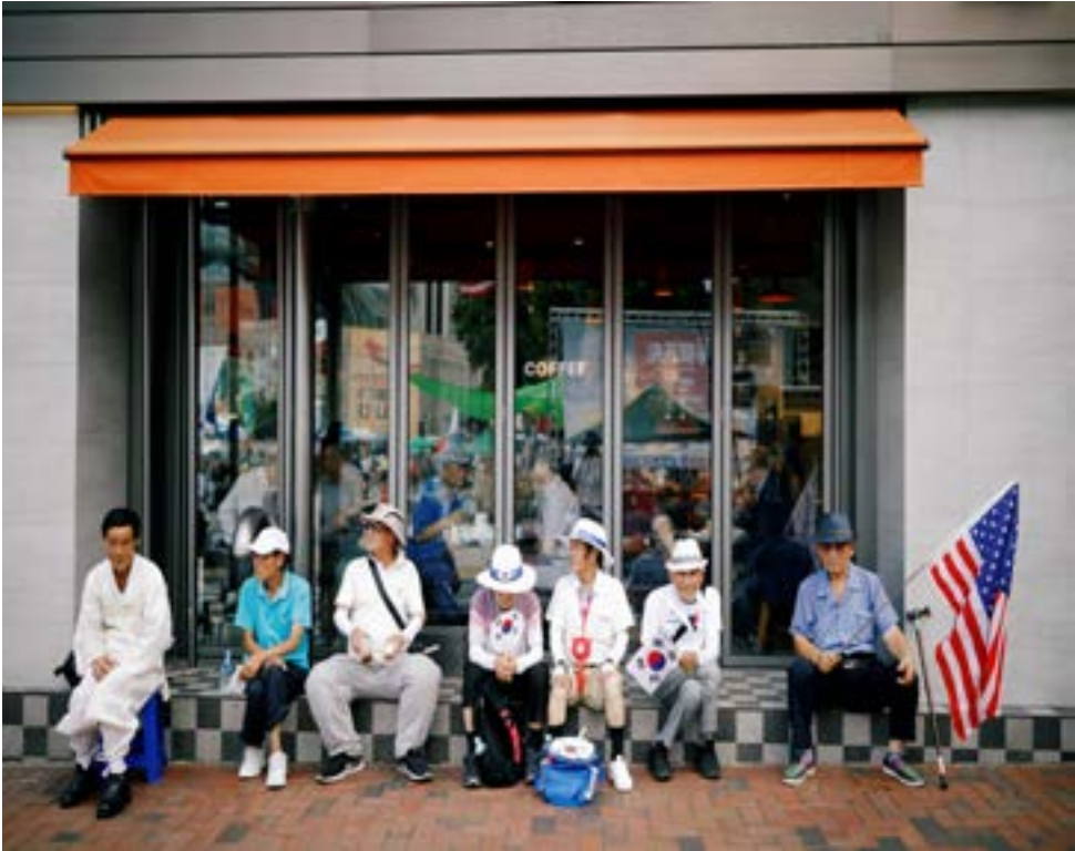
Members of a conservative right-wing civic group attend an anti-North Korea and pro-U.S. protest in Seoul