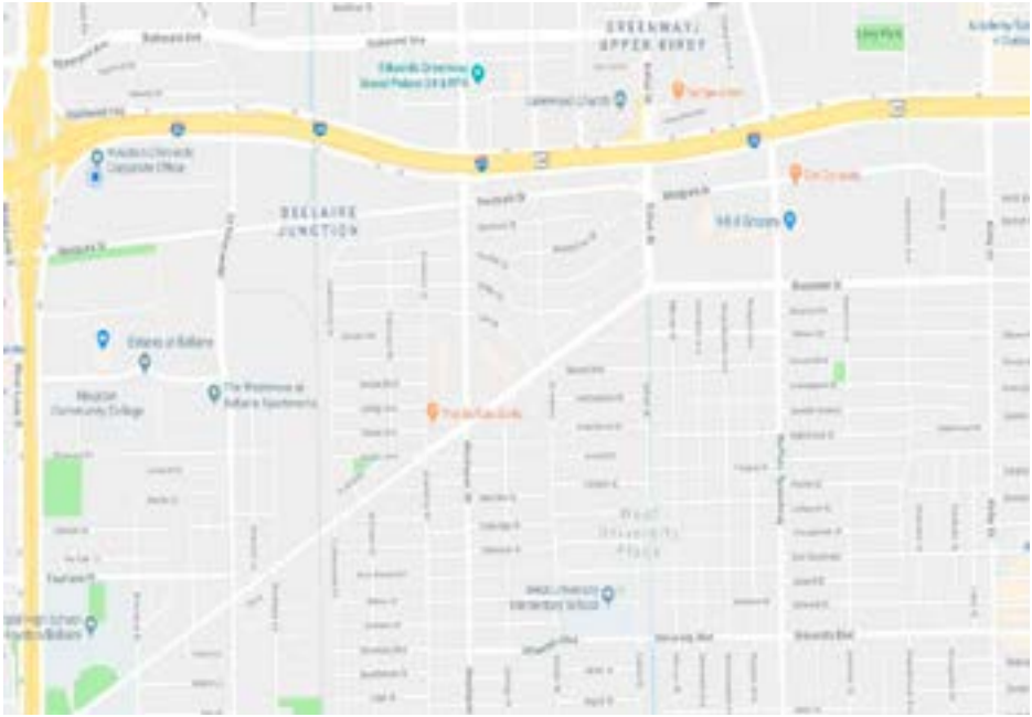
U.S. Highway 59 EMS wait-time rank: 17 out of 50 Median wait time: 15 minutes

Crash victims may have to wait slightly longer than expected for an ambulance to arrive on four Houston-area highways, according to data released last month by personal finance site ValuePenguin. The website used data from the National Highway Traffic Safety Administration's Fatality Analysis Reporting System to rank the top 50 most dangerous highways in the United States. Researchers also ranked those 50 highways using the median EMS wait time following a fatal accident. The longest wait time among the 50 most dangerous highways was on State Road 105, which runs from Brenham through Conroe to the outskirts of Beaumont. The median wait time there was 30 minutes, compared to a national median of 10.8 minutes, according to the data. The next longest EMS wait time in Houston was the Texas portion of Interstate 10, where it took ambulances around 18 minutes to get to the scene of a fatal crash, the data shows. Facebook user Jesus Tejeda captured this footage of a bus crash off Interstate 10 in Alabama the morning of March 13, 2018. High school band students from Channelview ISD were on board the bus. U.S. Highway 59 logged the third-longest delay among Houston highways at 15 minutes, while U.S. Highway 290 recorded a 13-minute median delay.