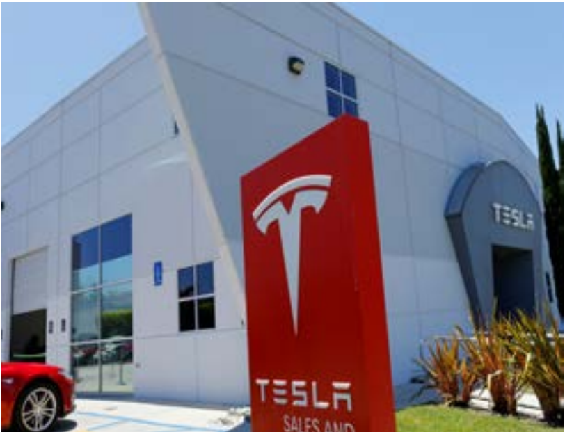
A Tesla sales and service center in Costa Mesa California

Sunday. Tesla last month signed agreements with Shanghai authorities to build its first factory outside the United States, which would double the size of the EV maker’s global manufacturing. Chief Executive Elon Musk on an earnings call this month said the factory would cost around $2 billion and that the EV maker planned to fund the project with local debt. Tesla has said it wants to produce the first cars at the plant about two years after construction begins, reaching as many as 500,000 vehicles a year about two to three years later.