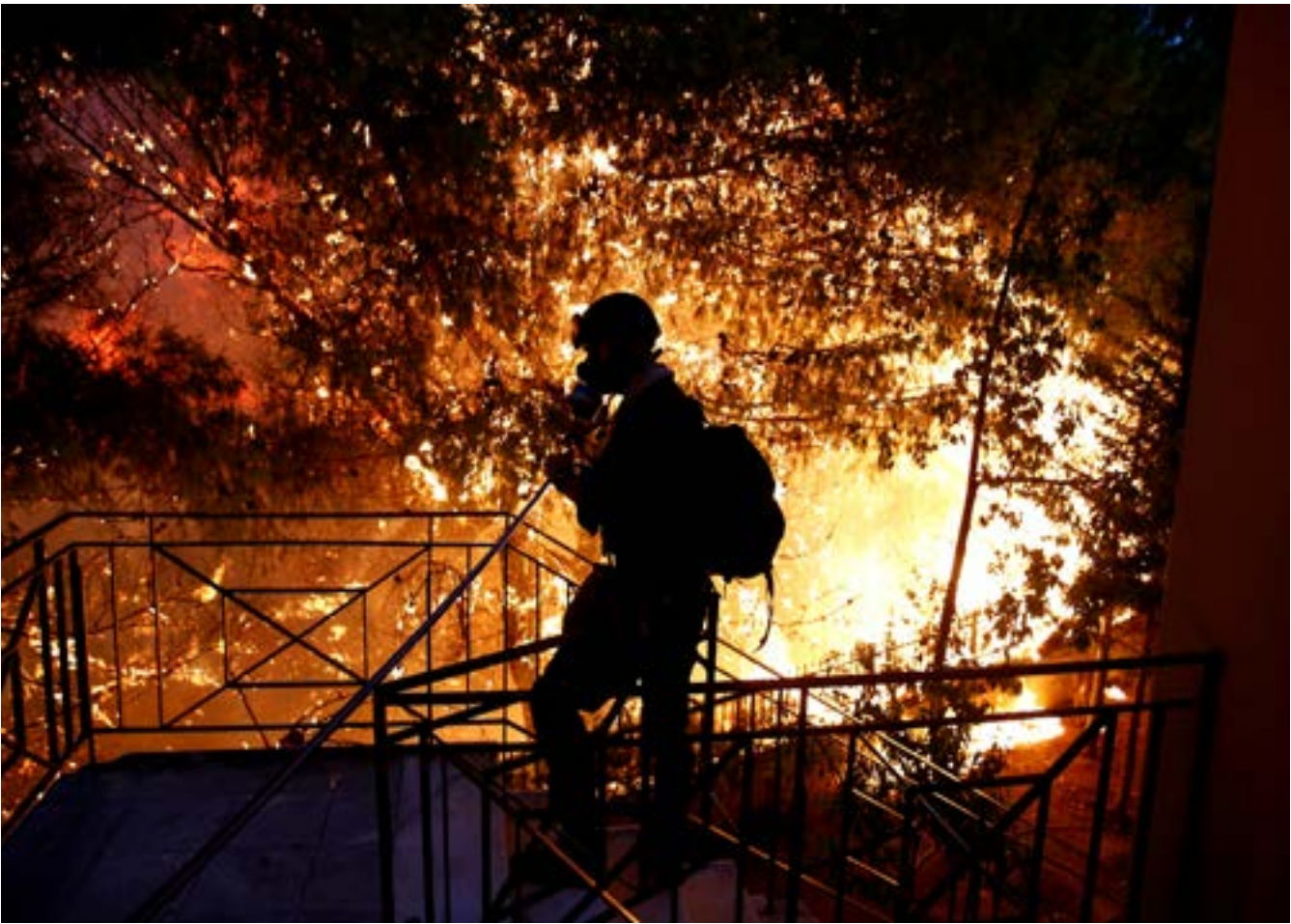
FILE PHOTO: A volunteer sprays water as a wildfire burns in the town of Rafina, near Athens, Greece, July 23, 2018. REUTERS/Costas Baltas/File Photo

utilized,” Trump wrote on Twitter. A California Department of Forestry and Fire Protection spokesman declined to comment on Trump’s tweet but said crews did not lack water to fight the flames.