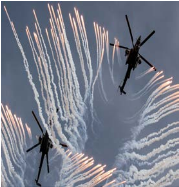
Mil Mi-28 N military helicopters of the Berkuty aerobatic team perform during the Aviadarts competition, as part of the International Army Games 2018, outside Ryazan