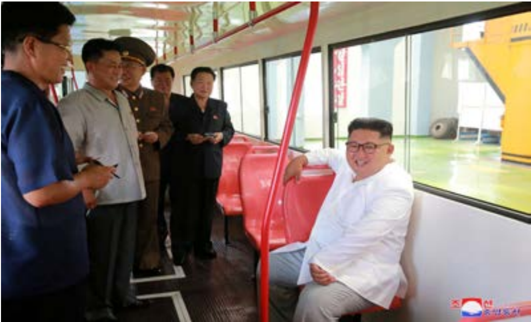
North Korean leader Kim Jong Un visits the Pyongyang Trolley Bus Factory and the Bus Repair Factory in Pyongyang