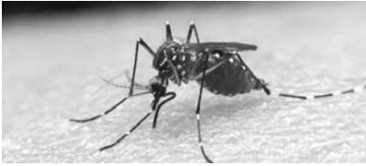
Dengue fever has been wiped out of Townsville, Australia, after anti-virus mosquitoes were released in 2014. No cases of the infection have been recorded since.

Despite their concerns, the scientists add results appear positive so far, the New Scientist reported. Dengue fever may be spread via sex This comes after research released last May suggested dengue fever may be passed on through sex.