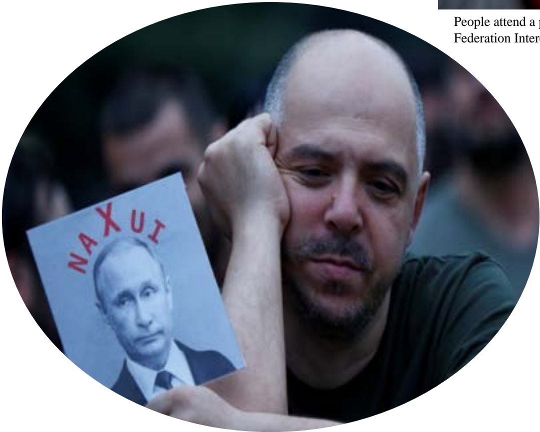
A man attends a protest on the 10th anniversary of Georgian Russian war in front of the building of Russian Federation Interests Section of the Embassy of Switzerland in Tbilisi