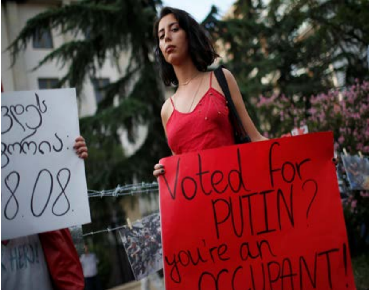
People attend a protest on the 10th anniversary of Georgian Russian war in front of the building of Russian Federation Interests Section of the Embassy of Switzerland in Tbilisi