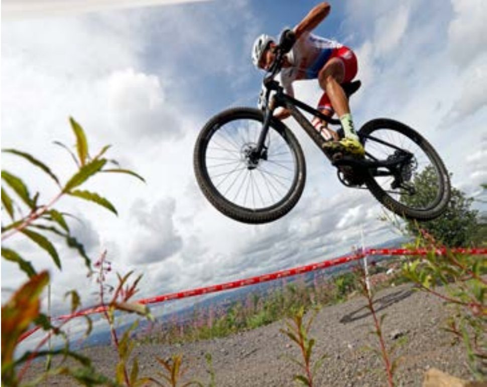
2018 European Championships - Mountain Bike, Men's Cross-Country - Cathkin Braes Mountain Bike Trails, Glasgow, Britain - August 7, 2018 - Anton Sintsov of Russia in action.