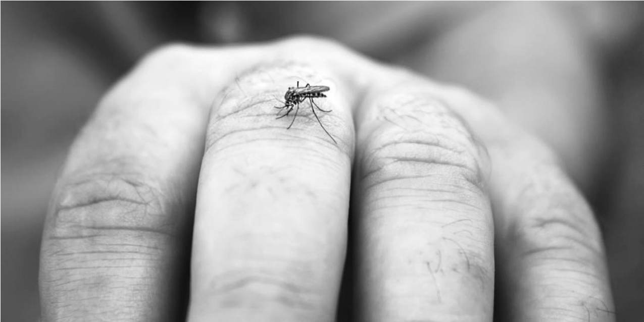
Anti-dengue mosquitoes were released in Townsville, Australia in 2014 No cases have been recorded in the Queensland city since the pests' release This is compared to 54 dengue cases between 2010 and 2014 Four million mosquitoes were infected with Wolbachia bacteria over two years Wolbachia bacteria prevents the insects from spreading the dengue virus

Compiled And Edited By John T. Robbins, Southern Daily Editor