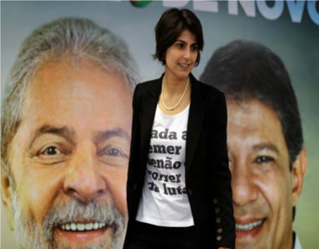
Fernando Haddad, former Sao Paulo mayor and member of Workers' Party (PT), and Manuela D'Ávila of the Communist Party of Brazil (PCdoB) pose before a media conference in Sao Paulo