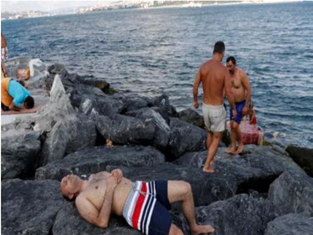
Men relax in the hot weather by the Marmara Sea in Istanbul