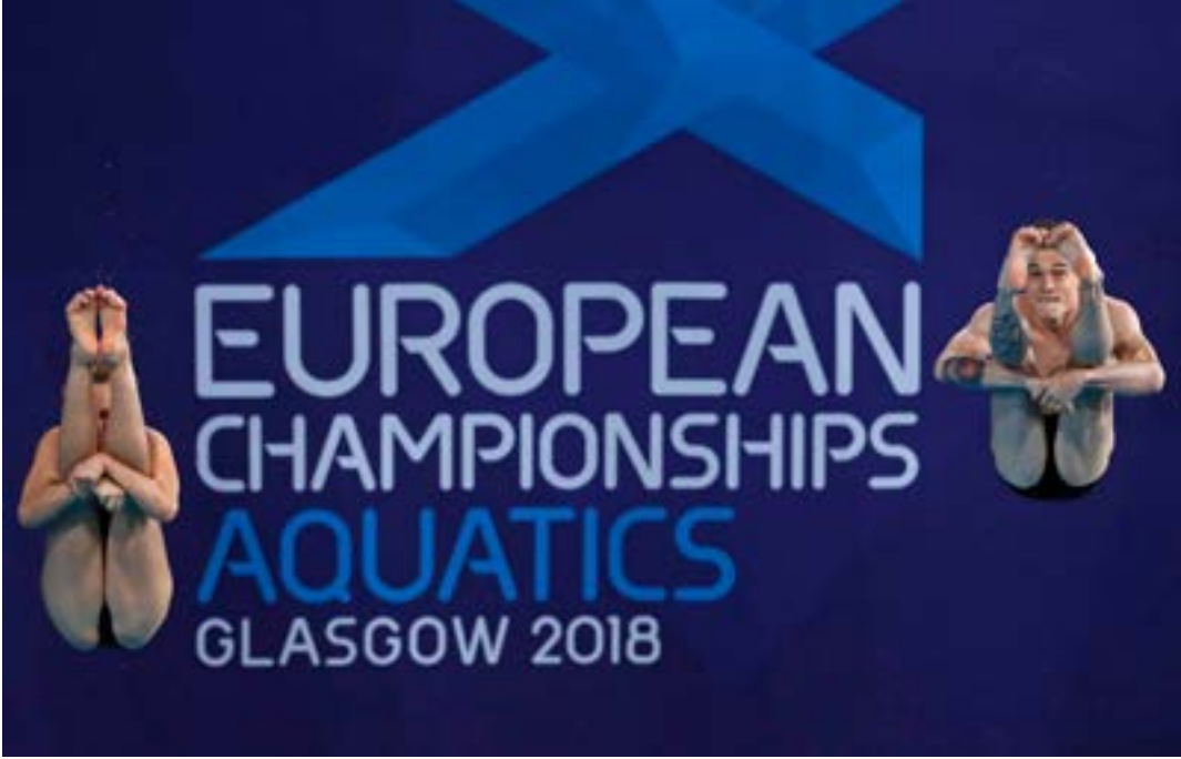
2018 European Championships - Diving, Mixed Synchronised 3m Springboard, Final - Royal Commonwealth Pool, Edinburgh, Britain - August 8, 2018 - Nadezhda Bazhina and Nikita Shleikher of Russia in action.