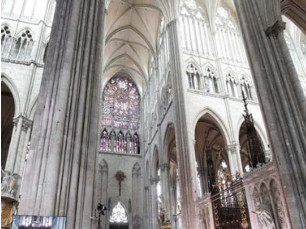
Britain’s Prince William, the Duke of Cambridge, delivers a speech at a religious ceremony to mark the 100th anniversary of the World War I (WW1) Battle of Amiens, at the Cathedral in Amiens