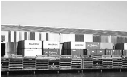
International trade buoyed Houston economy during energy slump

Reporting on business results, the executive director stated that April was “another strong month:” steel imports increased by 17 percent and container activity grew by 3 percent over 2017. Guenther added that container import growth continues to be driven by business from the east Asia trade lanes, and a year-to-date total of 13 million tons of cargo has passed through Port Houston terminals, reflecting a 2 percent annual growth.