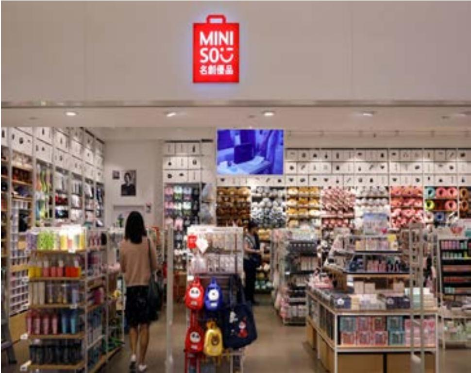
A chain store of Chinese low-cost lifestyle and consumer product retailer “Miniso” is pictured in Singapore