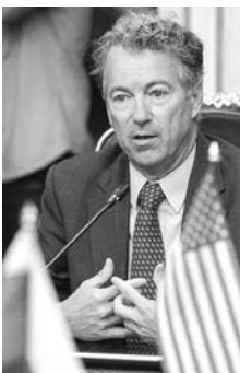
Sen. Rand Paul speaks during his meeting with Russian lawmakers in Moscow, Aug. 6, 2018.

Sen. Rand Paul Meets Russian Senators In Moscow, Invites Them To The U.S.