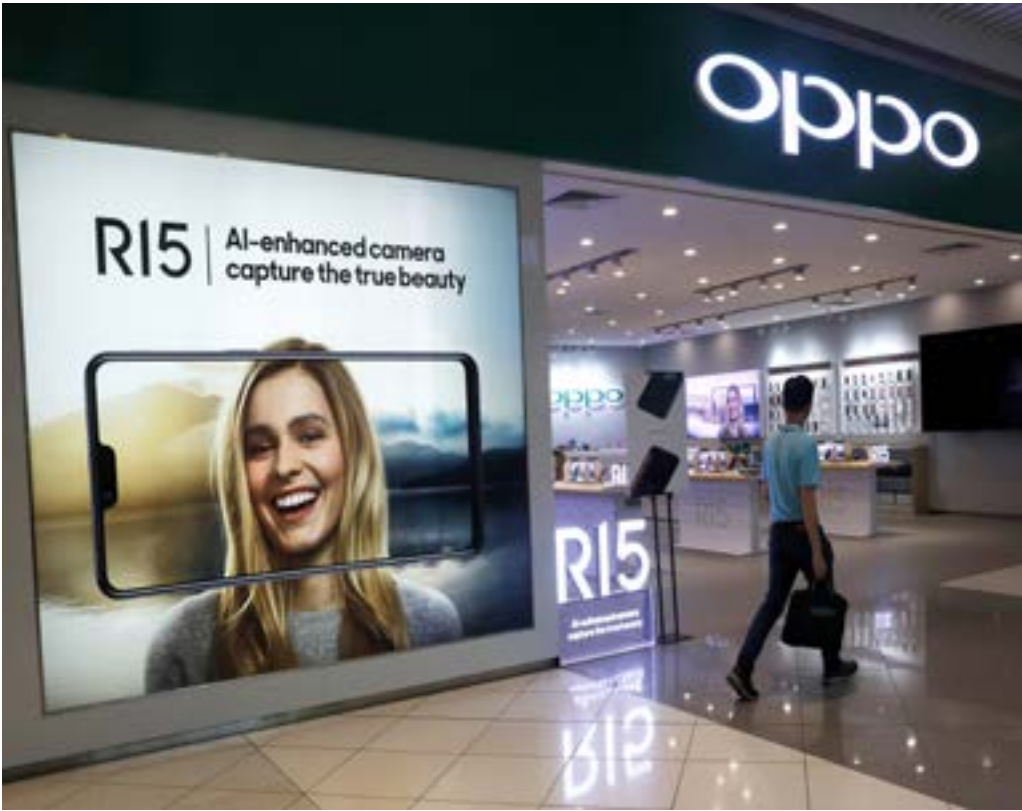
A man passes by an Oppo shop in Singapore August 8, 2018.