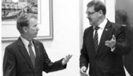
Sen. Rand Paul, left, speaks with Chairman of the Russian Federation Council Committee on International Affairs Konstantin Kosachev during their meeting in Moscow, Russia, Monday, Aug. 6, 2018. Paul said he invited Russian lawmakers to visit the United States to help foster inter-parliamentary contacts.

In Moscow, he made a similar case for engagement.