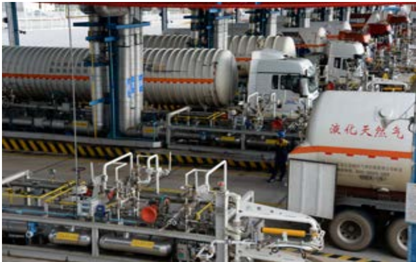
LNG trucks are seen at Sinopec's Beihai LNG terminal in Guangxi

The U.S. action that prompted the Chinese retaliation was the latest by President Donald Trump to put pressure on China to negotiate trade concessions, after Washington imposed tariffs on $34 billion in goods last month. China has vowed to retaliate with equivalent tariffs against any U.S. action. "This is a very unreasonable practice," the Chinese commerce ministry said of the U.S. action on Wednesday as it rolled out China's counter-tariffs. Representatives for the White House, the U.S. Trade Representative and the U.S. Department of Commerce did not immediately reply to requests for comment.