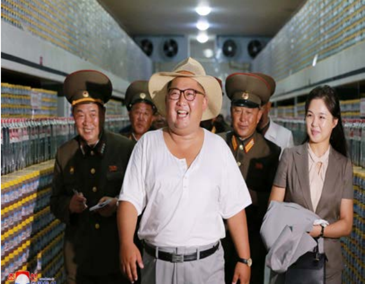
North Korean leader Kim Jong Un visits a factory in this undated photo released by North Korea’s Korean Central News Agency