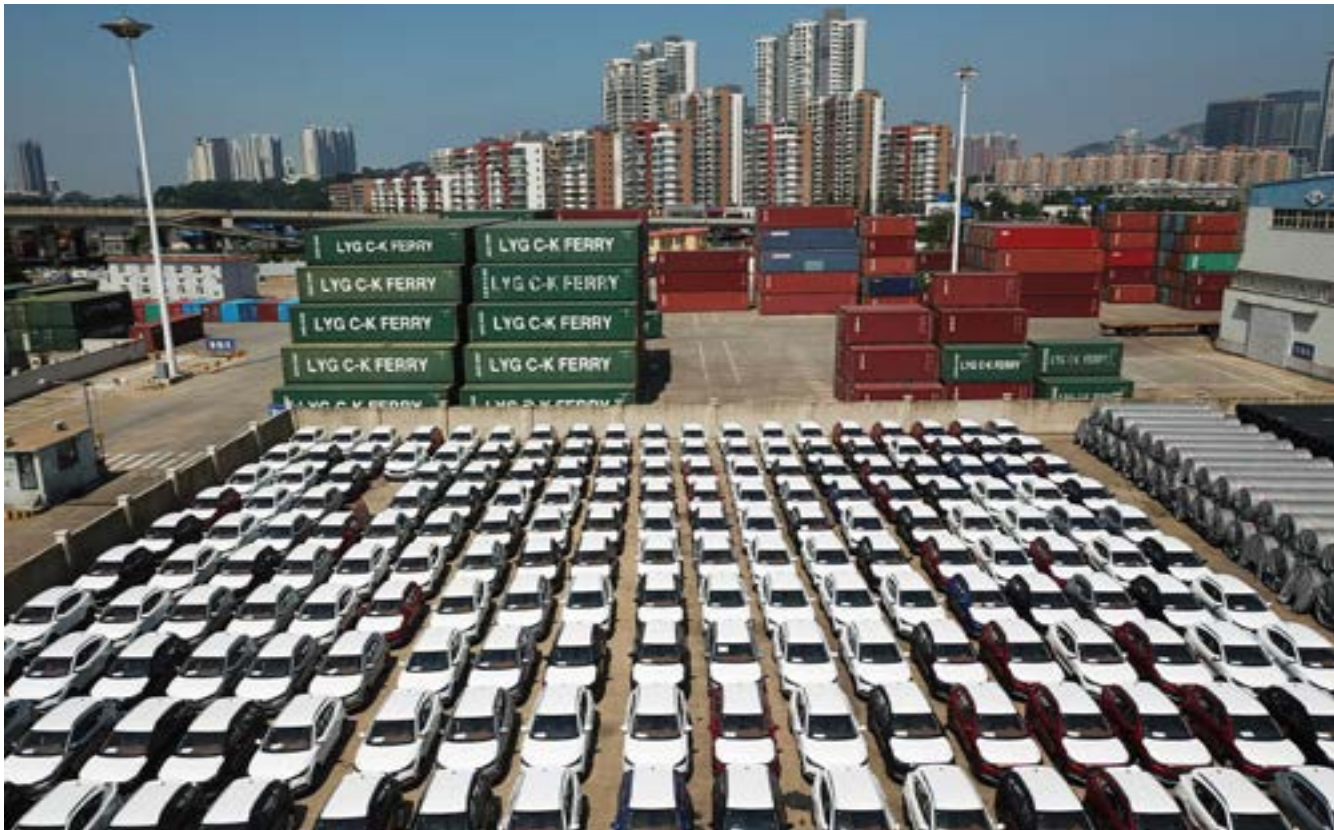
Cars to be exported sit at a port in Lianyungang, Jiangsu province, China August 8, 2018.

some extent, has been largely market-driven in our view and is not a preferred policy tool by Chinese policy makers as part of the retaliation measures," Wang said. China's trade with the U.S. also continued to rise in July despite the tariffs, with exports up 11.2 percent year-on-year, and imports increasing 11.1 percent.