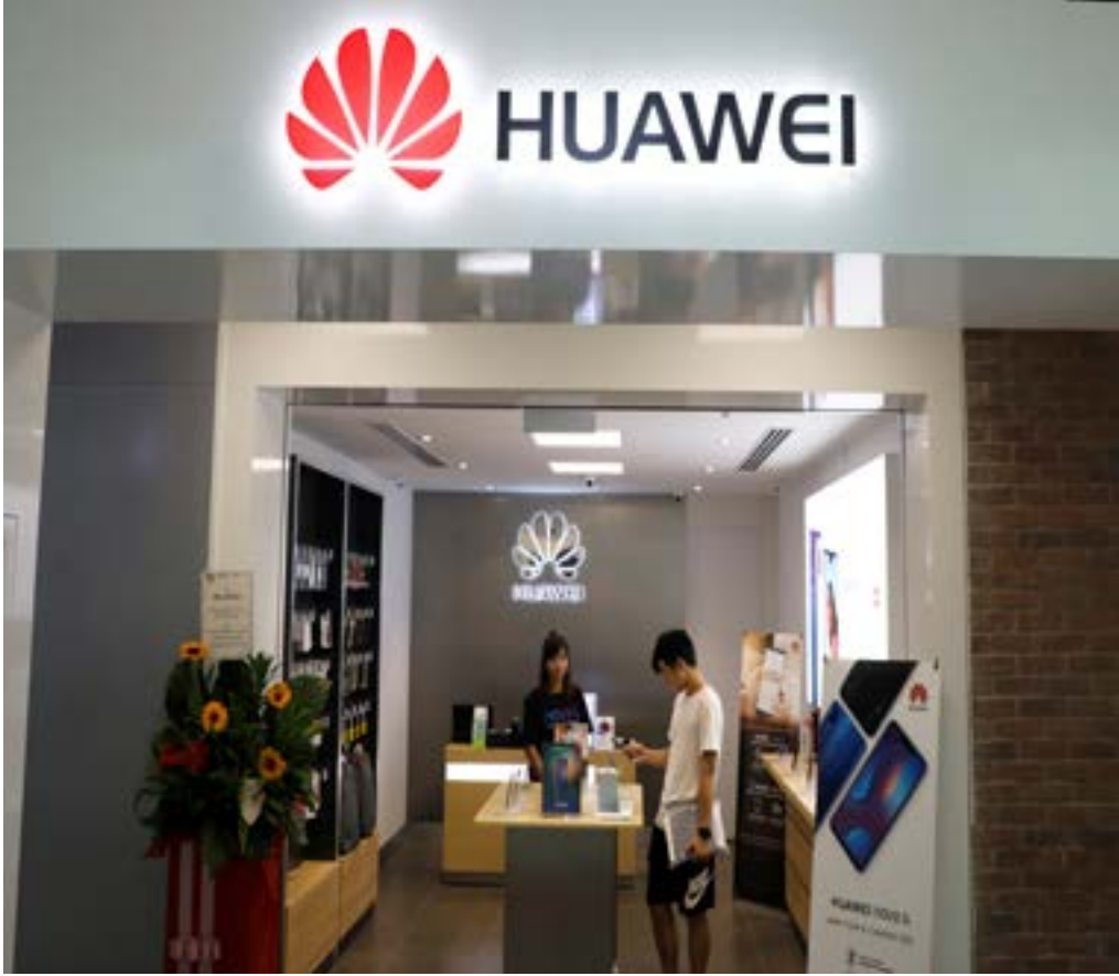
A Huawei shop is pictured in Singapore