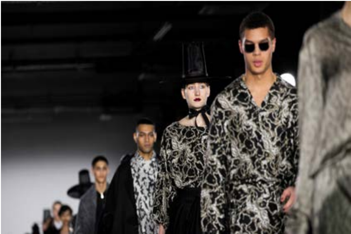
Models display creations during the Edward Crutchley catwalk show at London Fashion Week Men's