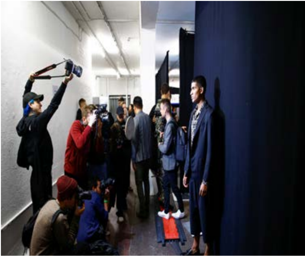
Backstage at Edward Crutchley catwalk show at London Fashion Week Men's