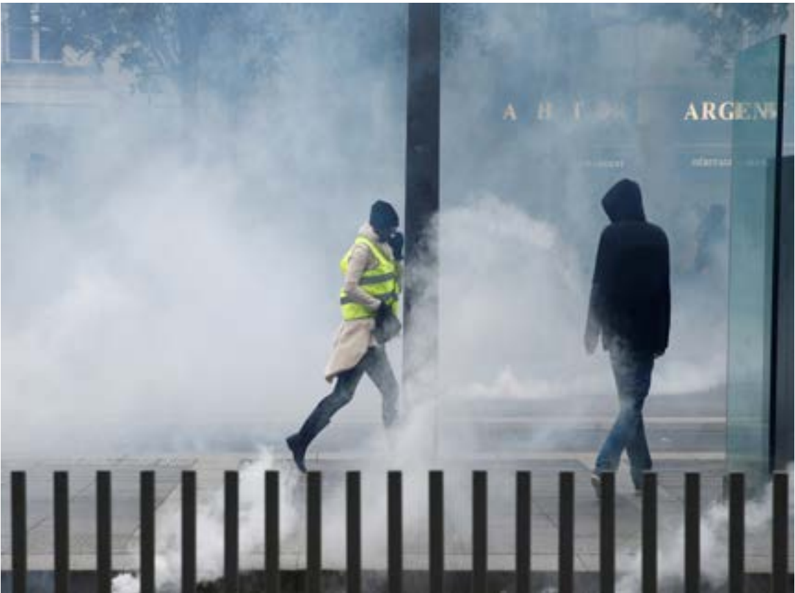
REFILE - CORRECTING GRAMMAR Protesters walk through tear gas during a demonstration of the “yellow vests” movement in Nantes, France, January 5, 2019.