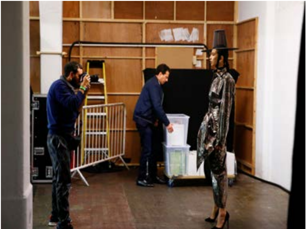
Backstage at Edward Crutchley catwalk show at London Fashion Week Men's