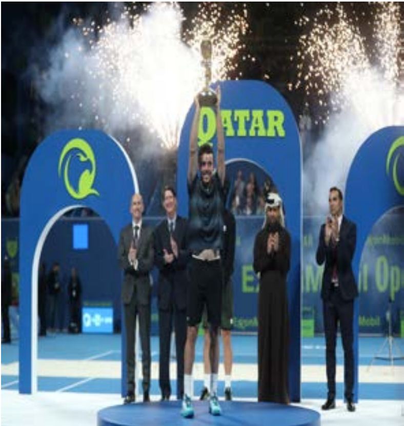
Tennis - ATP - Qatar Open - Khalifa International Tennis and Squash Complex, Doha, Qatar - January 5, 2019 Spain's Roberto Bautista Agut celebrates with the trophy after winning the final against Czech Republic's Tomas Berdych