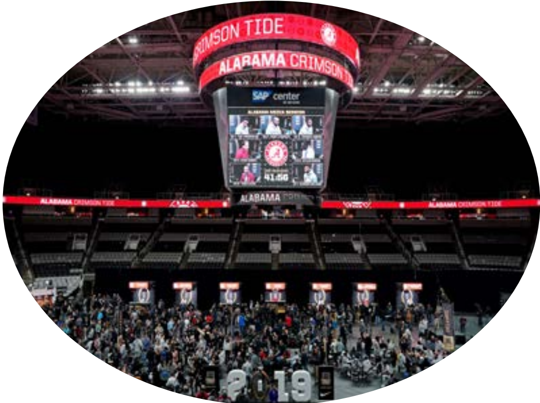
Jan 5, 2019; San Jose, CA, USA; An overall view of the arena during the College Football Playoff Championship Media Day at SAP Center.