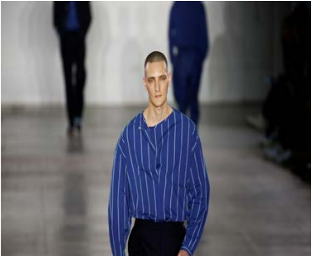
A model presents a creation during the E.Tautz catwalk show at London Fashion Week Men's in London, Britain January 5, 2019.