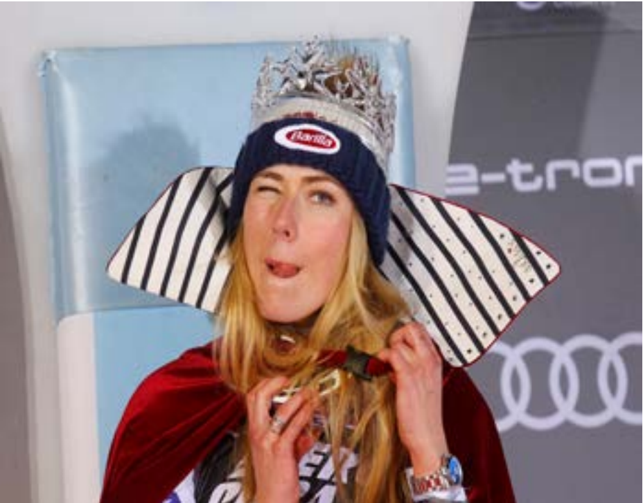
Alpine Skiing - Alpine Skiing World Cup - Women's Slalom - Crveni Spust, Zagreb, Croatia - January 5, 2019 Mikaela Shiffrin of the U.S. celebrates with a crown after winning the Women's Slalom