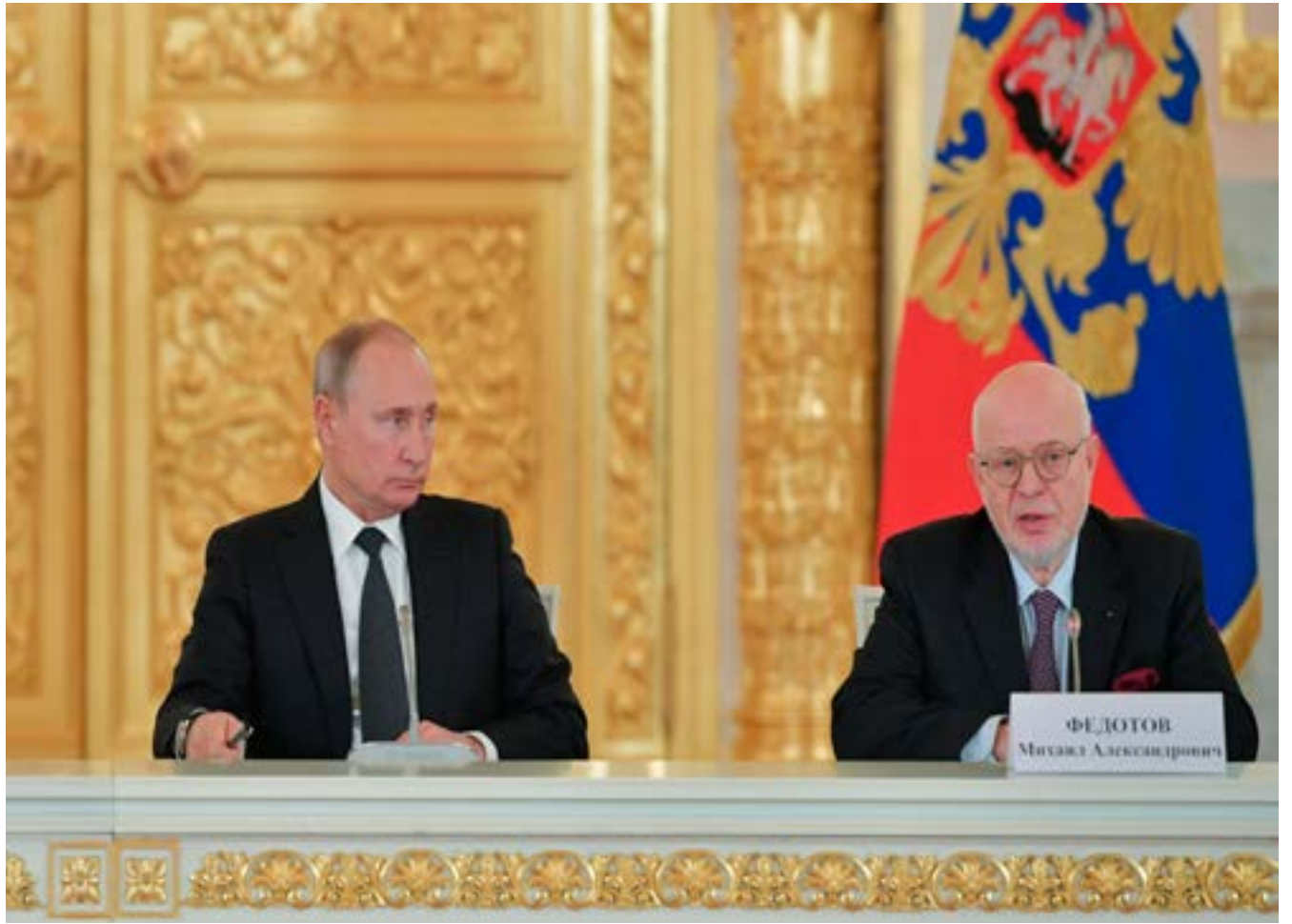
Russian President Vladimir Putin and head of the Russian Human Rights Council Mikhail Fedotov attend a meeting of the Presidential Council for Civil Society and Human Rights at the Kremlin in Moscow, Russia December 11, 2018. ATTENTION EDITORS - THIS IMAGE