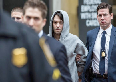
Martin Shkreli resigned as the CEO of Turing Pharmaceuticals, one day after being arrested for securities fraud in New York City.