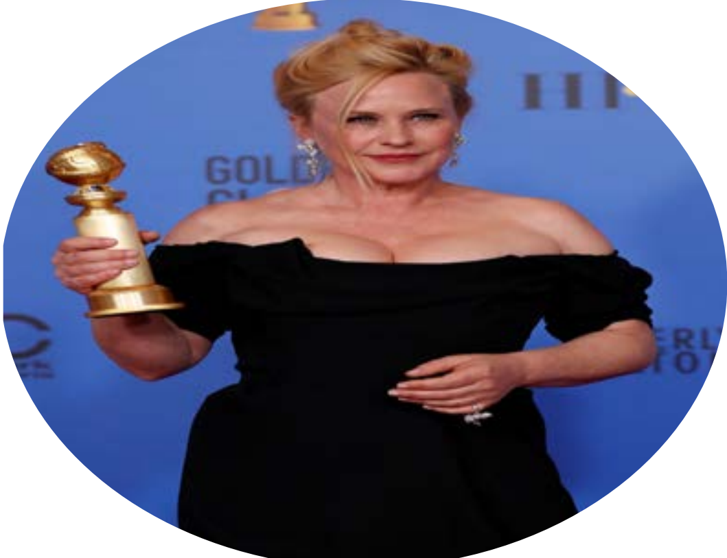
76th Golden Globe Awards - Photo Room - Beverly Hills, California, U.S., January 6, 2019 Patricia Arquette poses backstage with her trophy for Best Performance by an Actress in a Limited Series or Motion Picture Made for Television for “Escape at Dannemora”.