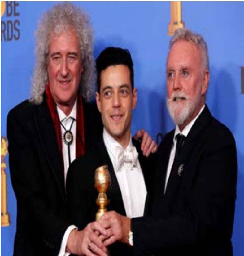
FILE PHOTO: 76th Golden Globe Awards - Photo Room - Beverly Hills, California, U.S., January 6, 2019 - Rami Malek (C) poses backstage with his award for Best Performance by an Actor in a Motion Picture Drama for “Bohemian Rhapsody” along with Queen’s Brian May (L) and Roger Taylor.