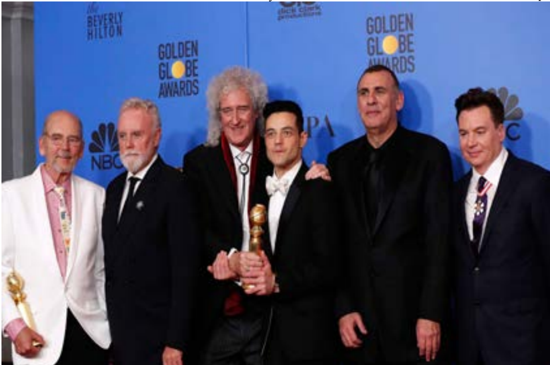
76th Golden Globe Awards - Photo Room - Beverly Hills, California, U.S., January 6, 2019 (L-R) Jim Beach, Roger Taylor, Brian May, Rami Malek with his Best Performance by an Actor in a Motion Picture - Drama, Graham King and Mike Meyers pose backstage with their Best Motion Picture - Drama for “Bohemian Rhapsody”