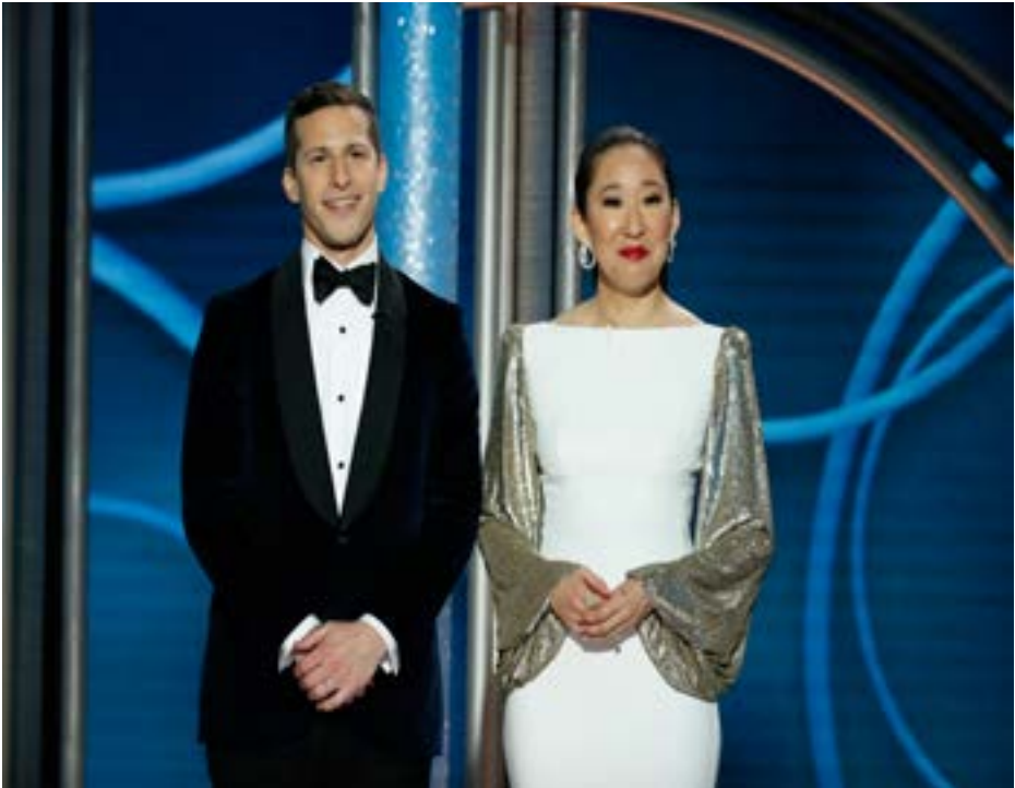
76th Golden Globe Awards – Show – Beverly Hills, California, U.S., January 6, 2019 - Sandra Oh and Andy Samberg host. For editorial use only. Additional clearance required for commercial or promotional use, contact your local office for assistance.