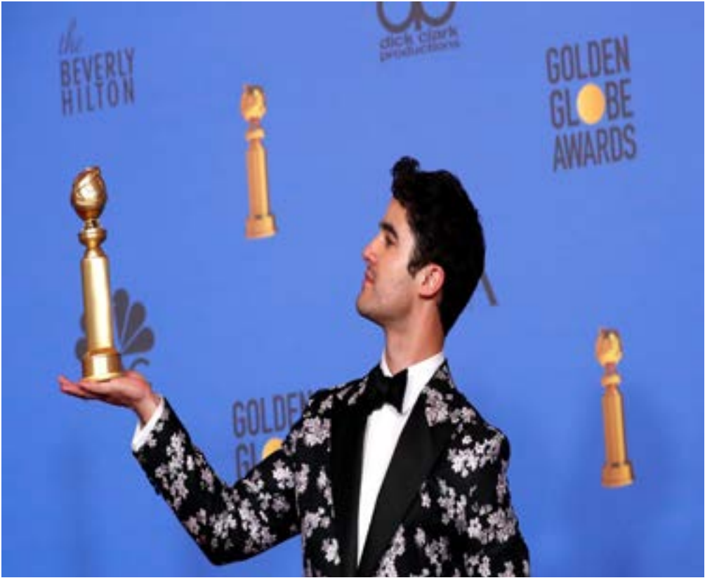
76th Golden Globe Awards - Photo Room - Beverly Hills, California, U.S., January 6, 2019 - Darren Criss poses backstage with his award for Best Performance by an Actor in a Limited Series or a Motion Picture Made for Television for “The Assassination of Gianni Versace: American Crime Story.”