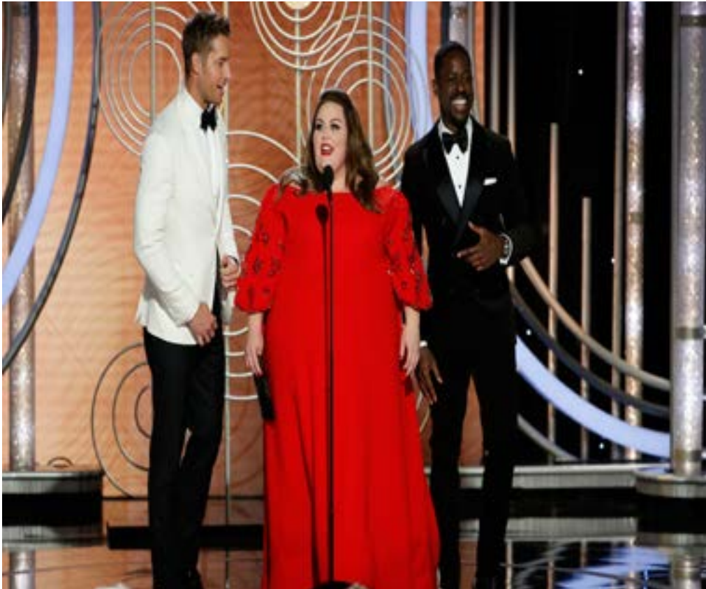
76th Golden Globe Awards - Show - Beverly Hills, California, U.S., January 6, 2019 - Presenters Justin Hartley, Chrissy Metz and Sterling K. Brown. For editorial use only.