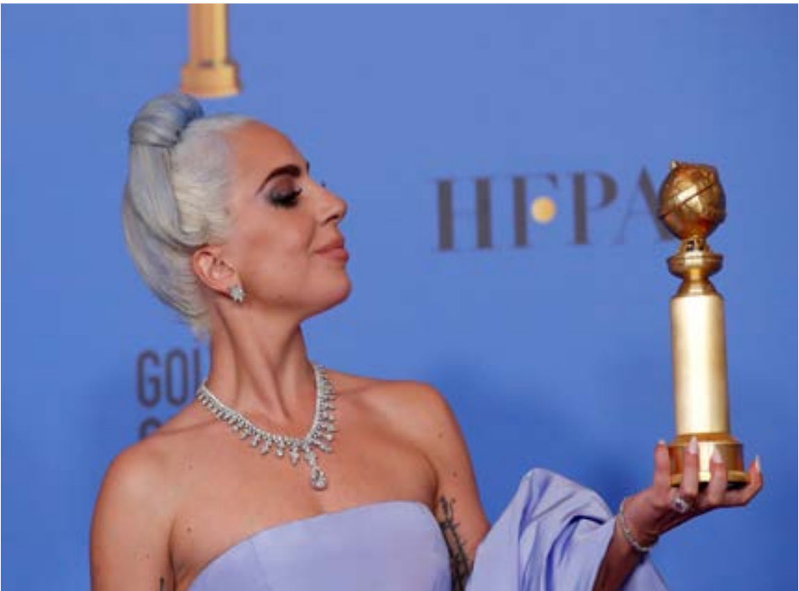
FILE PHOTO: 76th Golden Globe Awards - Photo Room - Beverly Hills, California, U.S., January 6, 2019 Lady Gaga poses backstage with her Best Original Song - Motion Picture award for “Shallow” from “A Star is Born”