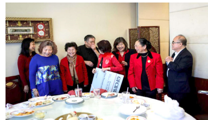
Businessmen and women who live and work in the Chinatown area arrange for a photo with a large check, for $3000, which they gave to a police-related organization Tuesday, Dec. 4, 2018.