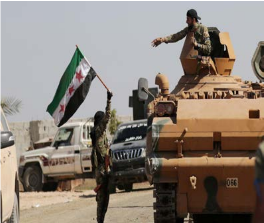
A Turkey-backed Syrian rebel fighter holds the Syrian opposition flag near the border town of Tel Abyad