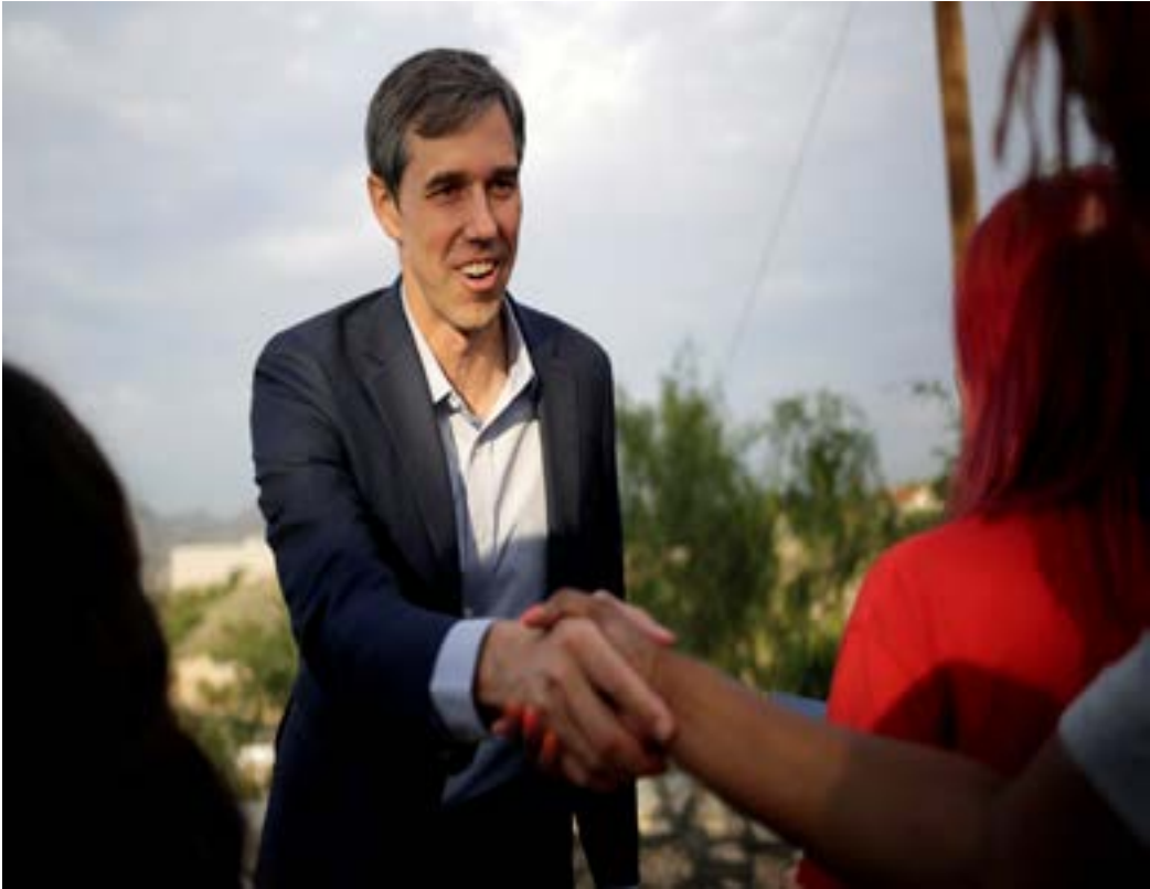
Democratic 2020 U.S. presidential candidate Beto O’Rourke greets a person while arriving to address the nation in El Paso