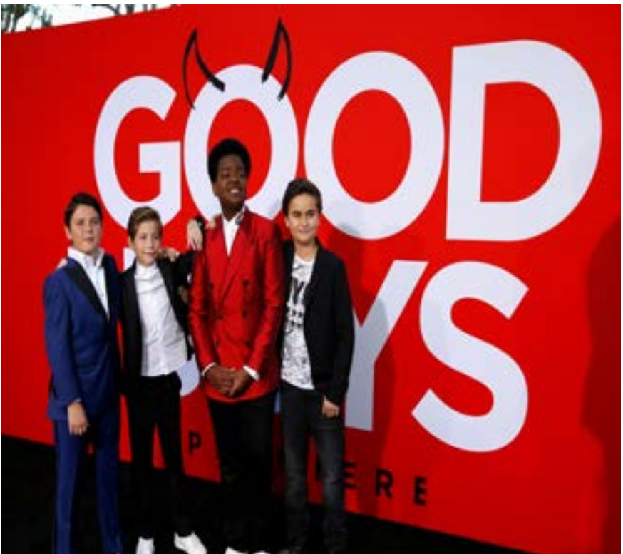
Premiere for the film “Good Boys” in Los Angeles, California