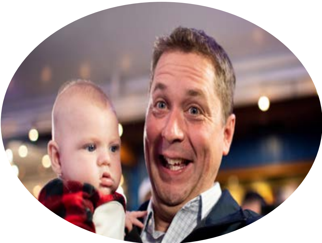
Leader of Canada’s Conservatives Andrew Scheer campaigns for the upcoming election in Langley, British Columbia, Canada October 11, 2019. TPX IMAGES OF THE DAY