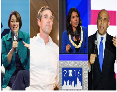
Sen. Amy Klobuchar, Beto O'Rourke, Rep. Tulsi Gabbard and Sen. Cory Booker.

A clear divide exists among 2020 Democrats who are rolling out plans to tackle the student debt crisis, whether tuition-free or debt-free policies are the way to win voter support.