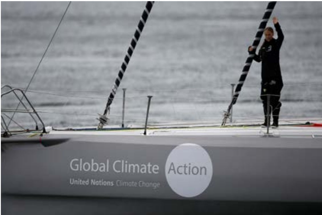
Swedish teenage climate activist Greta Thunberg waves from a yacht as she starts her trans-Atlantic boat trip to New York, in Plymouth