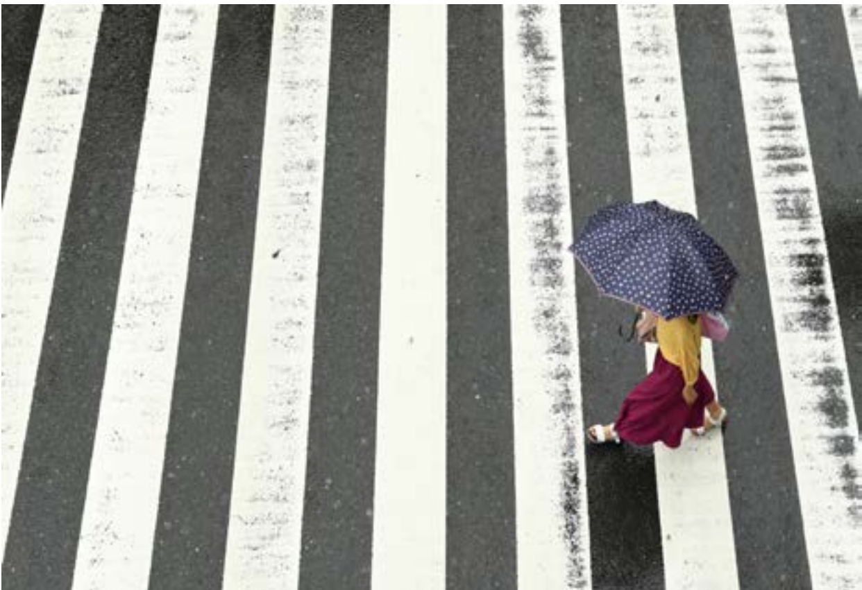
A woman walks in the rain at a pedestrian crossing near Osaka Station as Typhoon Hagibis approaches Osaka