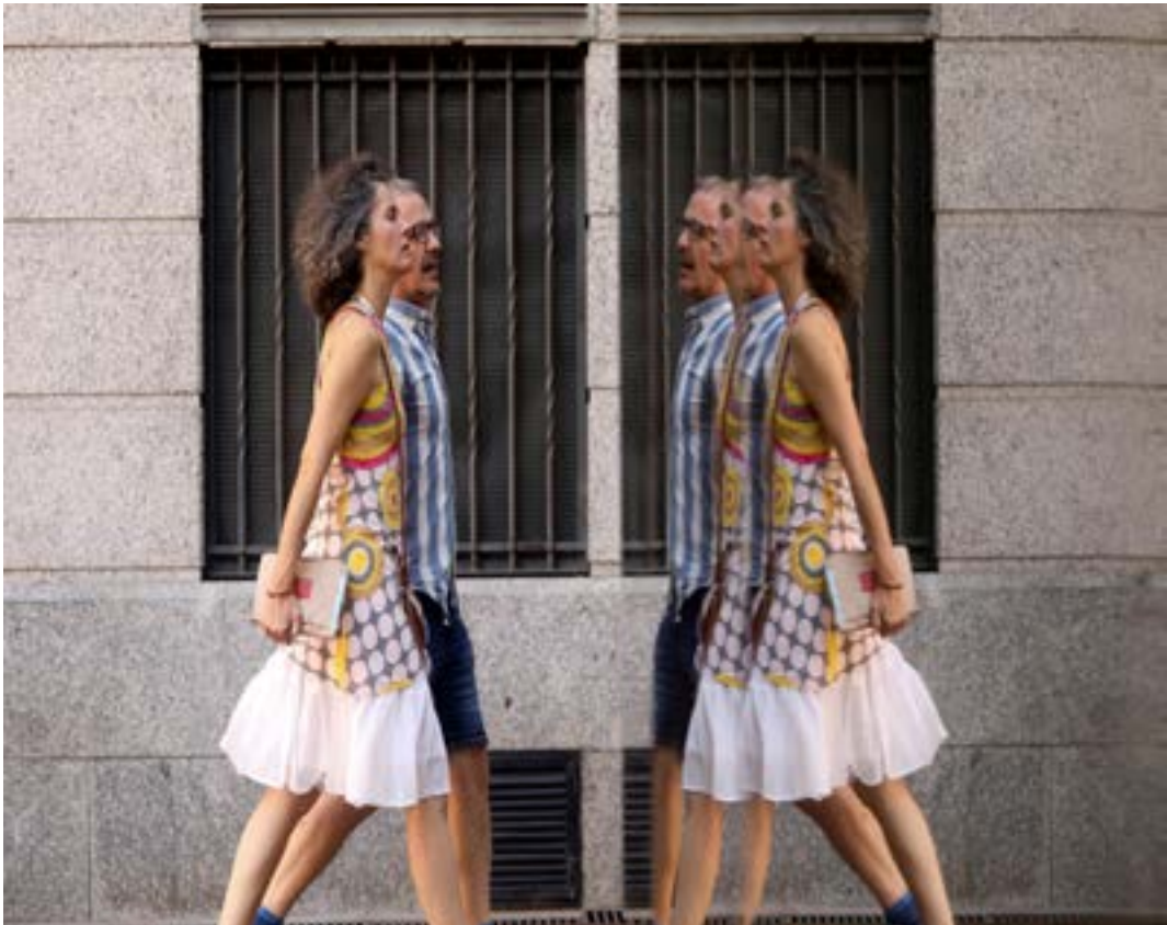
A couple are reflected in a glass wall as they walk beside CaixaForum cultural centre in Madrid