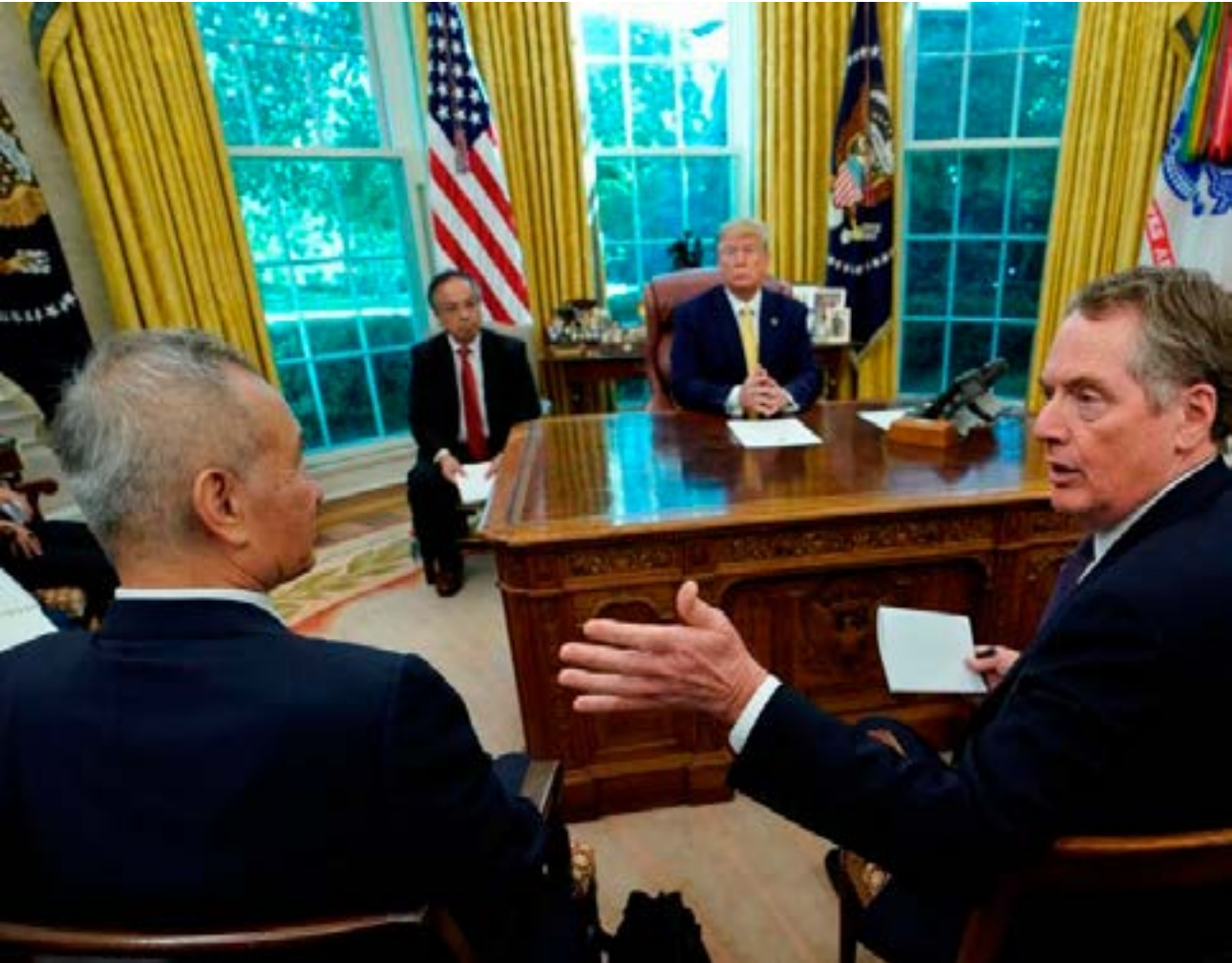
U.S. Trade Representative Robert Lighthizer talks to China’s Vice Premier Liu He during a meeting with U.S. President Donald Trump in the Oval Office at the White House after two days of trade negotiations in Washington, U.S., October 11, 2019.

His announcement, while seen as progress, drew some scepticism. U.S. Trade Representative Robert Lighthizer talks to China’s Vice Premier Liu He during a meeting with U.S. President Donald Trump in the Oval Office at the White House after two days of trade negotiations in Washington, U.S., October 11, 2019. REUTERS/Yuri Gripas “I’m unsure that calling what was announced by President Trump an