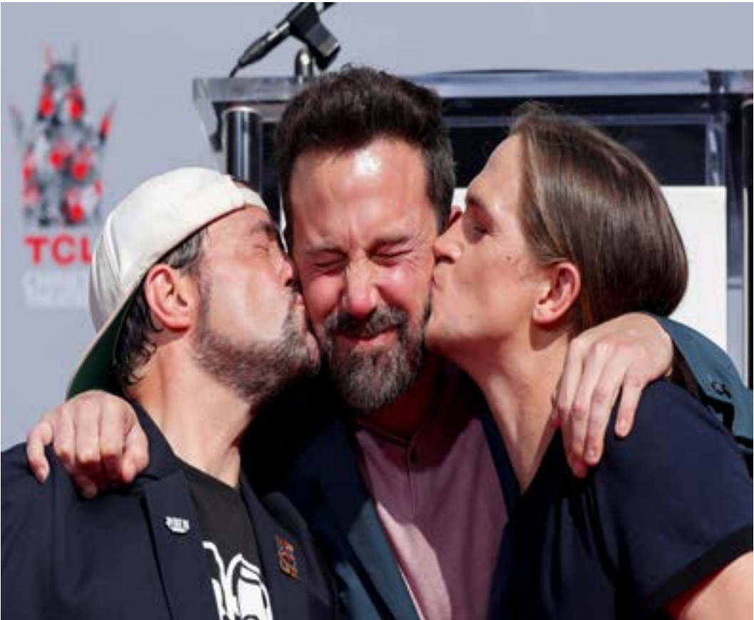
Kevin Smith and Jason Mewes place their handprints and footprints in cement in Los Angeles