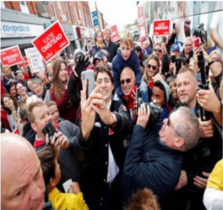
Liberal leader and Canadian Prime Minister Justin Trudeau visits a local restaurant during an election campaign visit to Tilbury