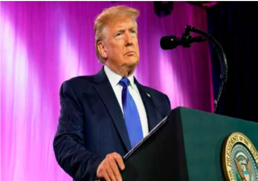
U.S. President Donald Trump pauses as he addresses conservative activists at the Family Research Council's annual gala in Washington, U.S., October 12, 2019.

U.S. President Donald Trump pauses as he addresses conservative activists at the Family Research Council's annual gala in Washington, U.S., October 12, 2019. Lawmakers this week are returning from a two