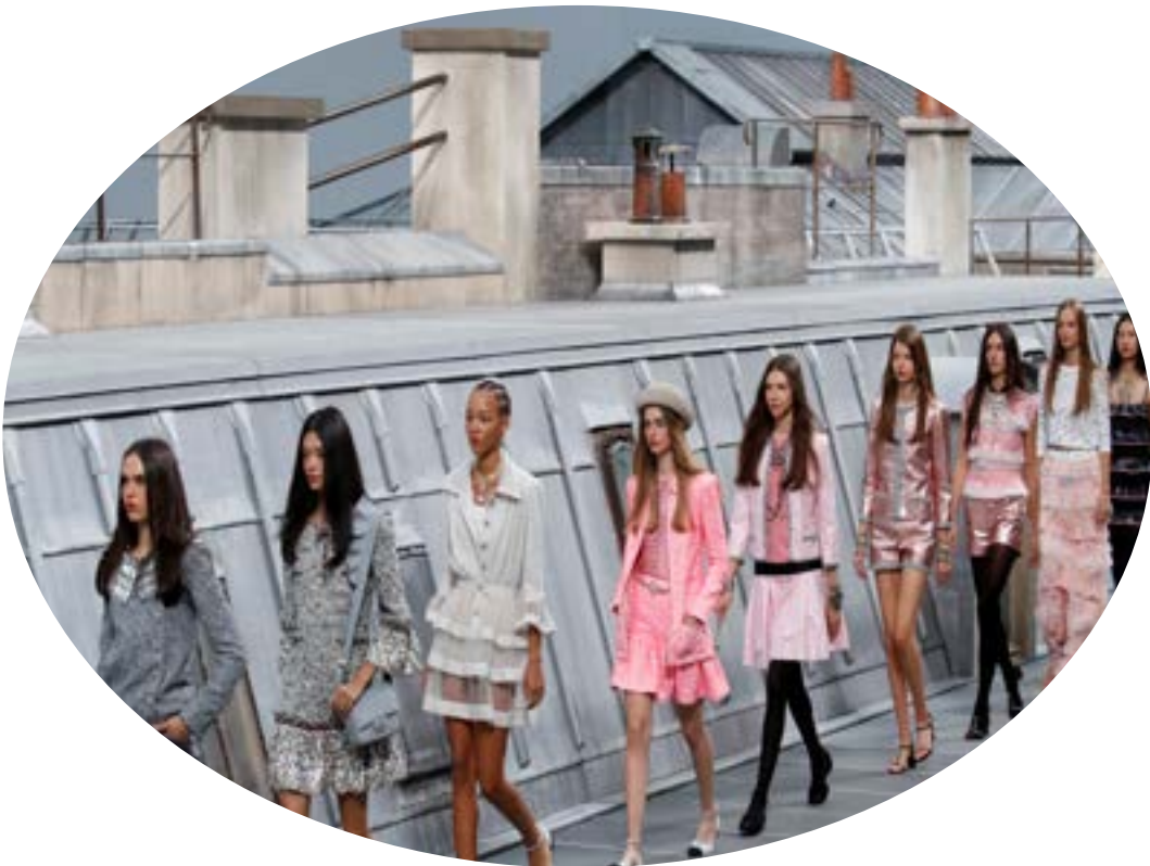
Chanel Spring/Summer 2020 women's ready-to-wear collection show during Paris Fashion Week