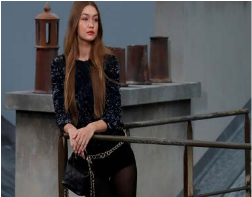
Chanel Spring/Summer 2020 women's ready-to-wear collection show during Paris Fashion Week