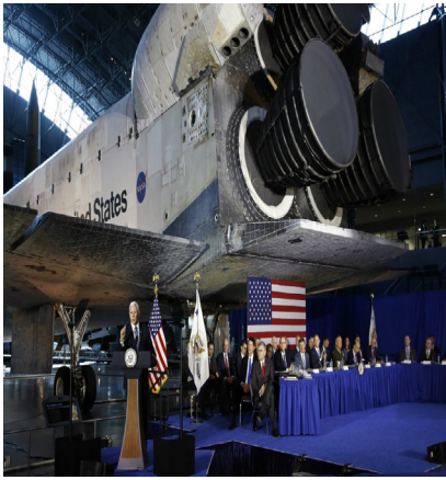
Vice President Mike Pence speaks at the sixth meeting of the National Space Council at the National Air and Space Museum in Chantilly, Virginia, August 20, 2019. The announcement was anticipated in the space community, since Vice President Mike Pence told the National Space

Council on Aug. 20 that U.S. Space Command would be ready by the end of the month. This is the Defense Department’s 11th unified combatant command; each command serves specific geographic regions or functions. Trump’s idea for a “Space Force” is something he has been talking about for more than a year. In February, he signed Space Policy Directive-4, directing the Pentagon to create a Space Force. The other military branches Space Force would join are the Army, Navy, Air Force, Marines and Coast Guard. VP Pence Rallies Support For U.S. Space Force Vice President Mike Pence is rallying support for the Trump administration’s push to develop a the Space Force. While speaking at the Pentagon Thursday, Pence argued it is the next and natural evolution of American military