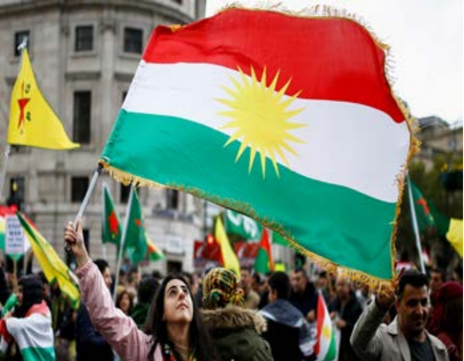
A woman flashes a V-sign as she waves a Kurdish flag during a pro-Kurdish rally against Turkey's military action in northeastern Syria, in London, Britain, October 13, 2019.