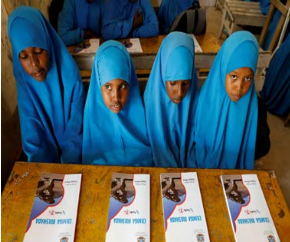
Primary school students use new textbooks during class at school that uses a new unified Somali curriculum, at Banadir zone school in Mogadishu, Somalia September 22, 2019. Picture taken September 22, 2019.