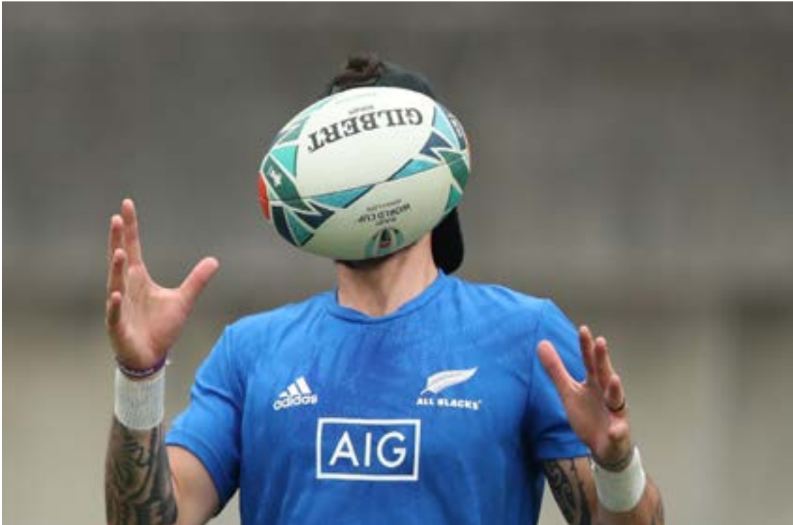
Rugby Union - Rugby World Cup - New Zealand Captain's Run - Beppu Jissoji Multipurpose Ground, Beppu, Japan, October 1, 2019 - New Zealand's TJ Perenara during training. REUTERS/Peter Cziborra TPX IMAGES OF THE DAY