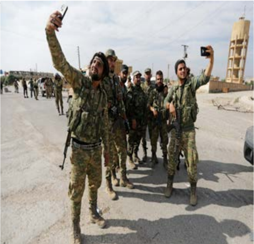
Turkey-backed Syrian rebel fighters take pictures with mobile phones at the border town of Tel Abyad