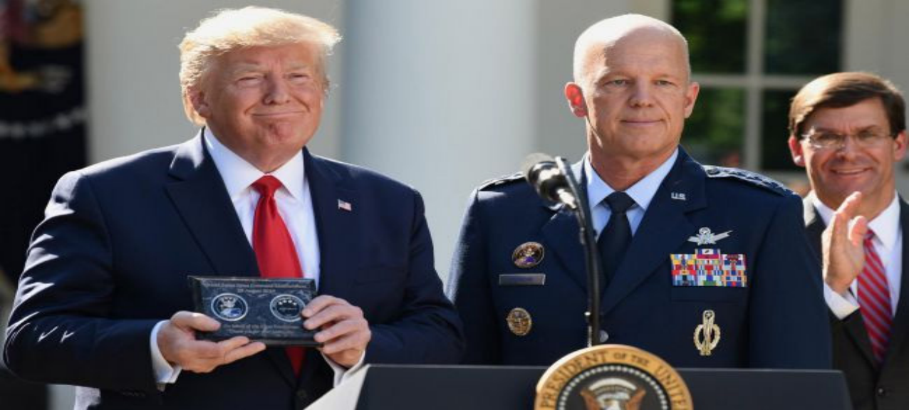
President Donald Trump and U.S. General John W. Raymond mark the formal establishment of the U.S. Space Command on Aug. 29, 2019.